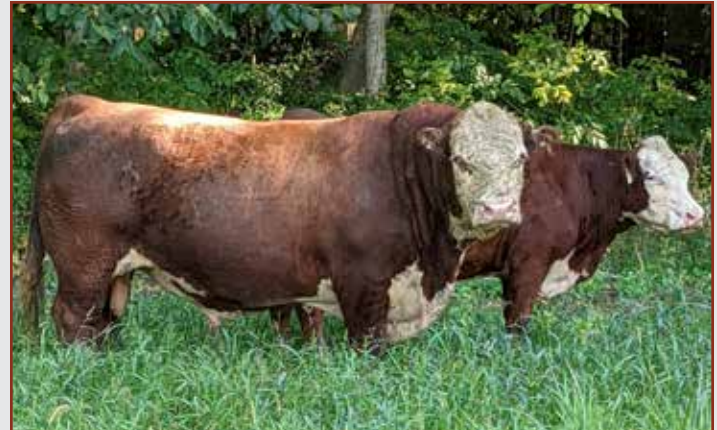
LBK Z426 FLEXX 3F ET — Sire of Lot 10 & 11

Really nice summer heifer that would be a great foundation heifer for a young showman. Genotypically her GE-EPDs rank near the top of the breed for CE, BW, SCF, M, MG and CHBS. Phenotypically she will please you as well with plenty of performance, patch eyes and a good disposition. OCV. Sells open.