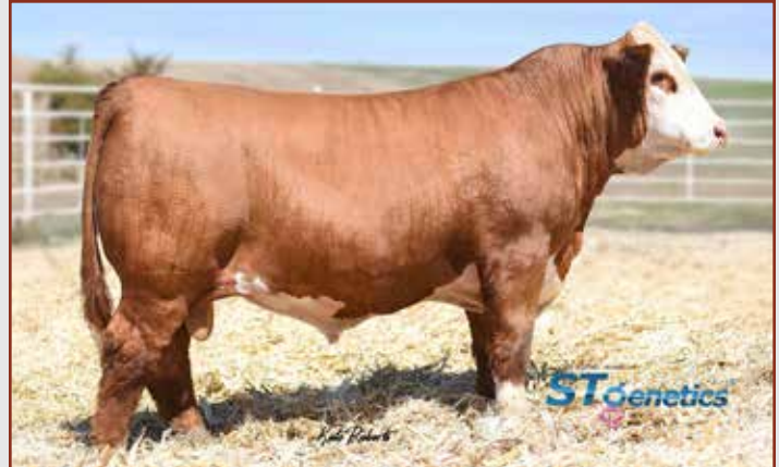
BG LCC 11B Perfecto 84F — Sire of Lot 3