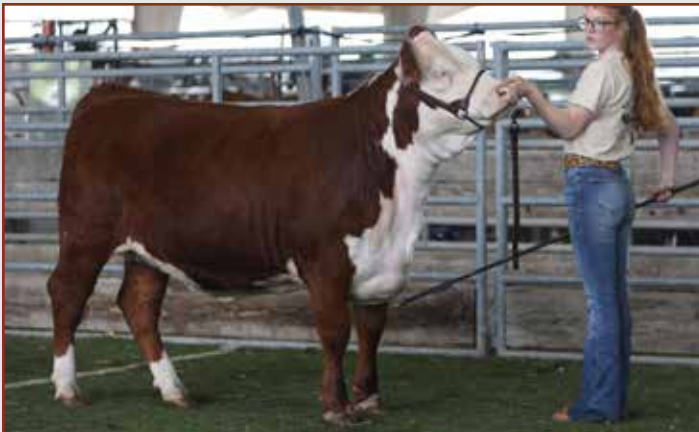
Lot 24 — RS F246 Victoria 313