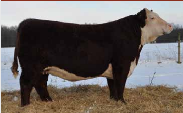
Lot 30 — CLS 51D Miss Delilah 215L