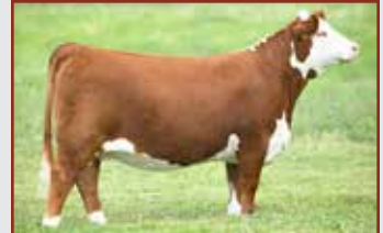
Lot 9B — HH J Lo 276A ET

First embryos available from our newest donor cow, J Lo. She goes back to many champion and division champions at JNHE. Her dam, HH Pearl 942, was nicknamed "J Lo" and so it is only fitting she carries on that successful name. Pearl 942 was a 2-time Ohio State Fair Champion Hereford heifer, and her progeny have not disappointed. You will see J Lo's first calf by Makers Mark in our show string this year.