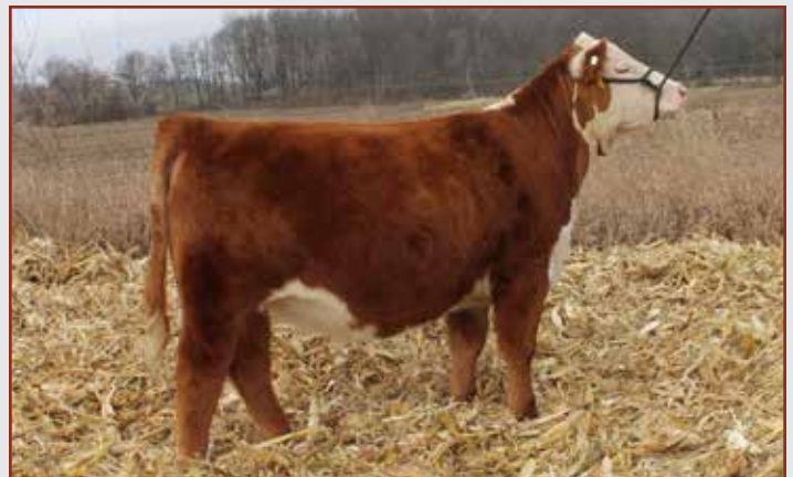
Lot 28 — SRF Miss Rita