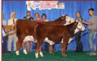
Lot 9A — HH Pearls Uno 576A

Look at this opportunity to purchase embryos from the 2017 Champion Cow-Calf at Junior National Hereford Expo! The dam goes back to ever popular and successful Pearl family. Montgomery prodigy speaks for themselves including sire of last year's JNHE Polled Heifer Champion. We have some of this mating ourselves coming and excited about the future for this mating.