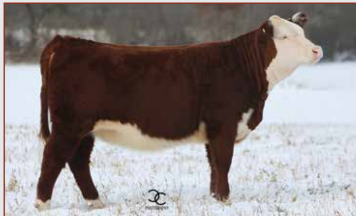
Lot 16 — Shaver J6 Melanie SF31