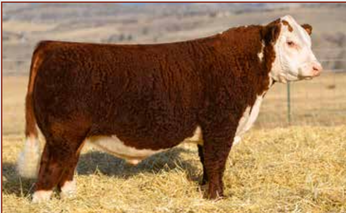
Churchill Red Thunder 133J — Sire of Lot 1A