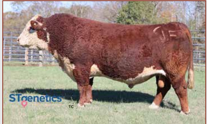
NJW 202C 173D Steadfast 156J ET — Sire of Lot 3A