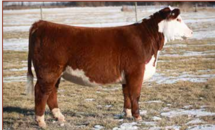
Lot 15 — SCC TRG 515 Dominette L60 ET