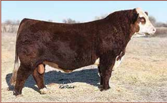
Churchill Red Baron 8300F ET — Sire of Lot 18