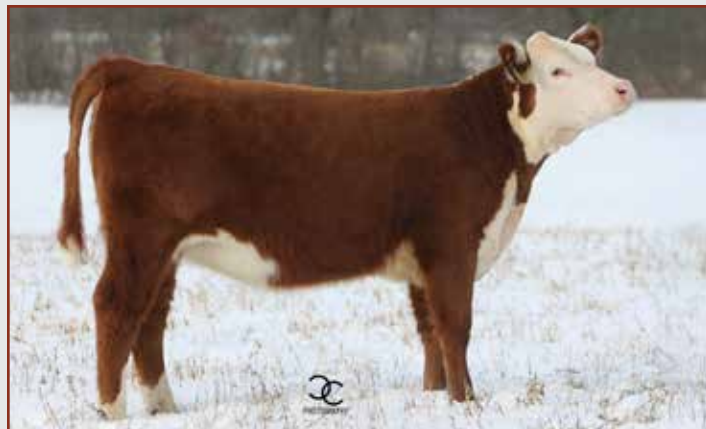
Lot 17 — Shaver F30 Margaret SF33