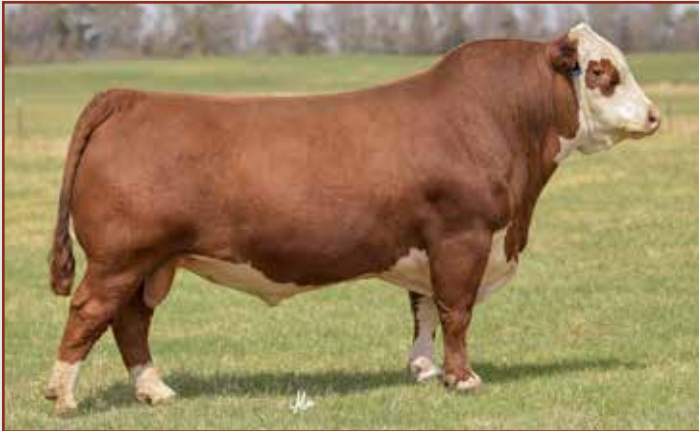
SR Expedition 619G ET — Sire of Lot 19