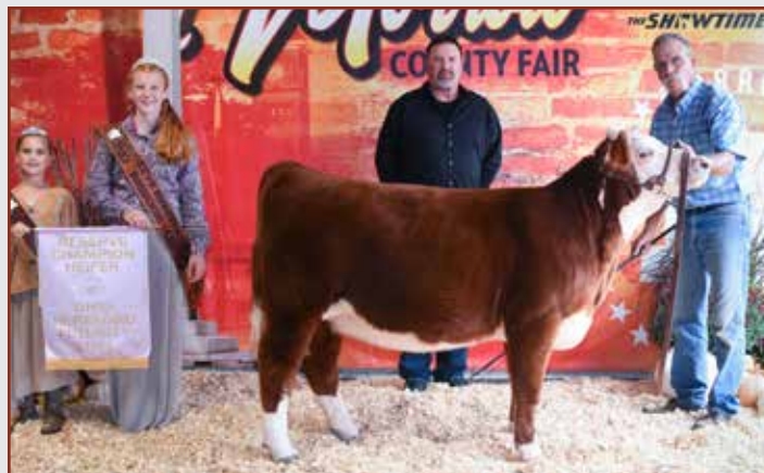
KT Olivia 206J — Dam of Lot 33

A very attractive bull with a big future, backed by many champions in his pedigree dont miss this one!