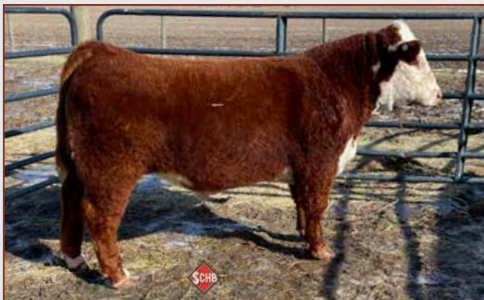
Lot 32 — KT Victor 75M

32 KT VICTOR 75M {MDP,DBP} P44612255 BULL || Calved: 2/2/24 || Tattoo: LE KT75M || POLLED