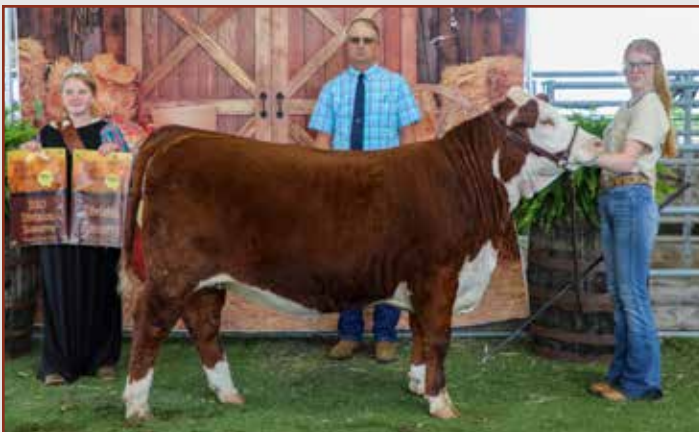
Lot 25 — EML Sweet Vegas L13