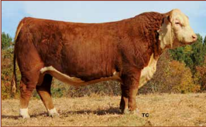
Innisfail WHR X651/723 4013 ET — Sire of Lot 1 and Lot 4