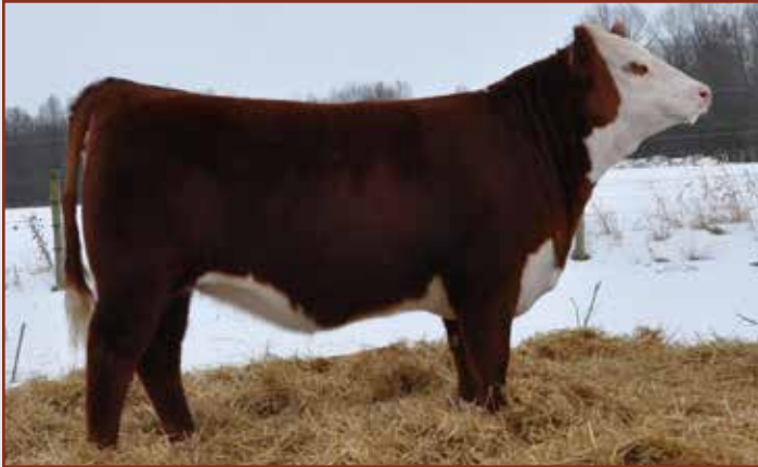
Lot 29 — CLS 325D Miss Patsy 224N