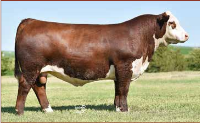
NJW 79Z Z311 Endure 173D ET — Sire of Lot 5