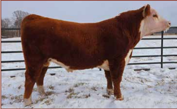
Lot 12 — Creek 9024 004 Studly 324L