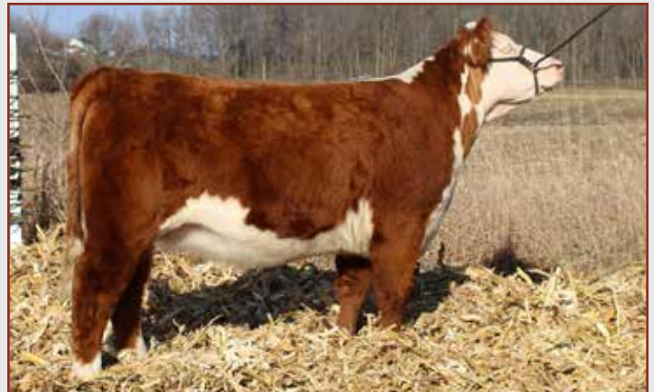
Lot 27 — SRF Miss Emily