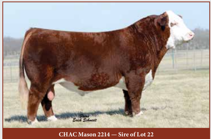
CHAC Mason 2214 — Sire of Lot 22