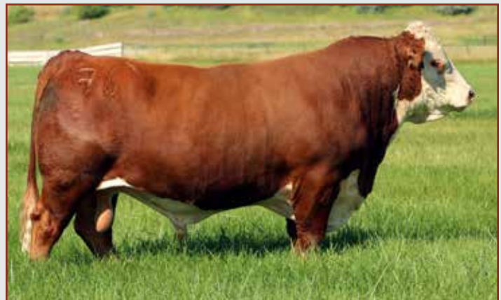
NJW 160B 028X Historic 81E ET — Maternal Grand sire of Lot 4, Sire of Lot 5A & 35C