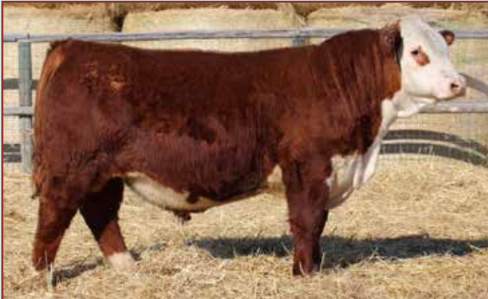
NJW 79Z 6589 Revolve 165G ET — Sire of Lots 6, 7 and 8