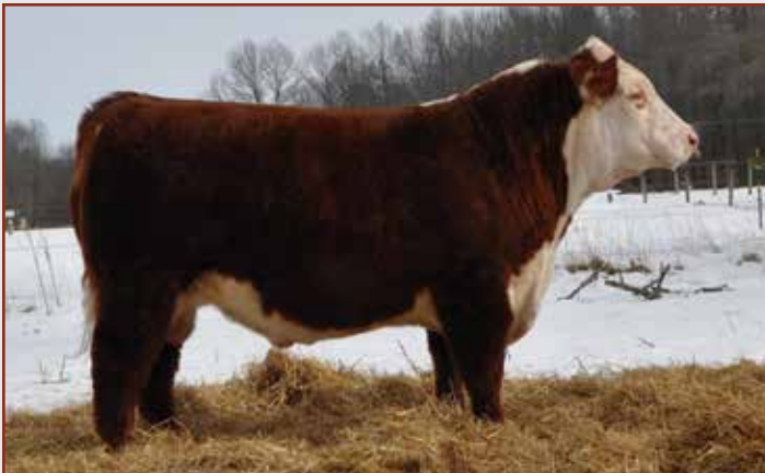
Lot 31 — CLS 327E Ricky Bobby 10M