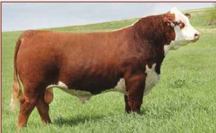
UPS Harvester 9985 — Sire of Lot 2