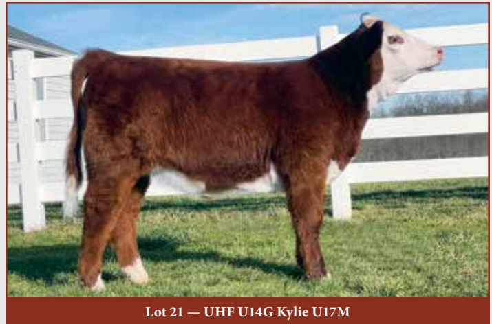
Lot 21 — UHF U14G Kylie U17M