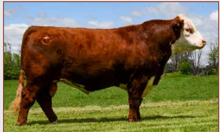
SHF Haviland F158 H028 — Service sire to Lot 11

A good, solid, bred heifer with extra fertility and longevity built in. Her dam is 12 and still in production, her grandam and great grandam both were very sound and produced into their teens. She is moderate framed, freckle faced and super sweet. Mated to SHF Haviland who is the #1 CHB bull in the breed and has top of the breed for all the CE, maternal and carcass traits. Safe AI bred on 12/19/24 to SHF Haviland F158 H028.