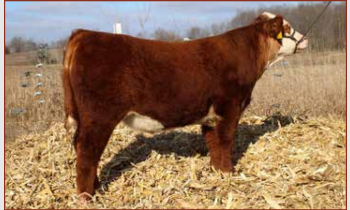
Lot 26 — SRF Jelly Roll