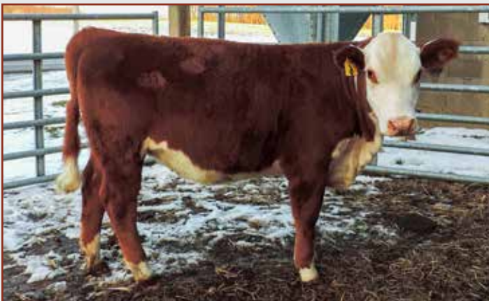
Lot 14 — A&J Princess M30