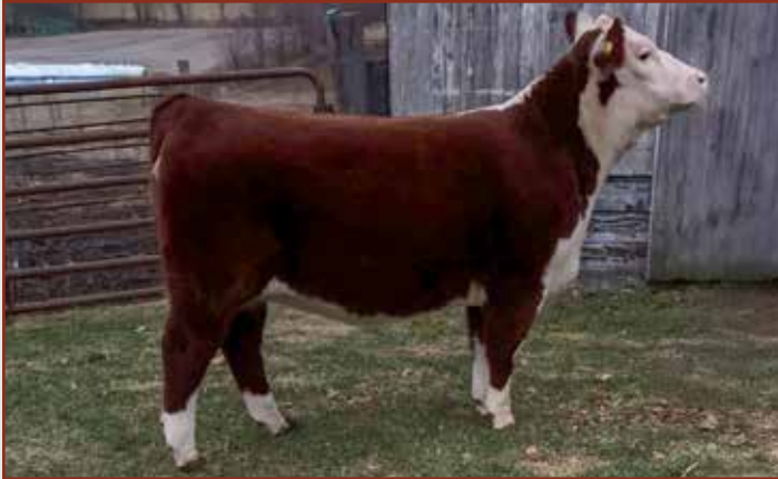
Lot 23 — MCC JM Ferrari 05M