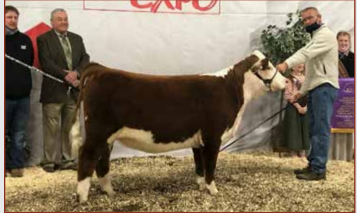
UHF 6602 Addie U09H — Dam of Lot 20