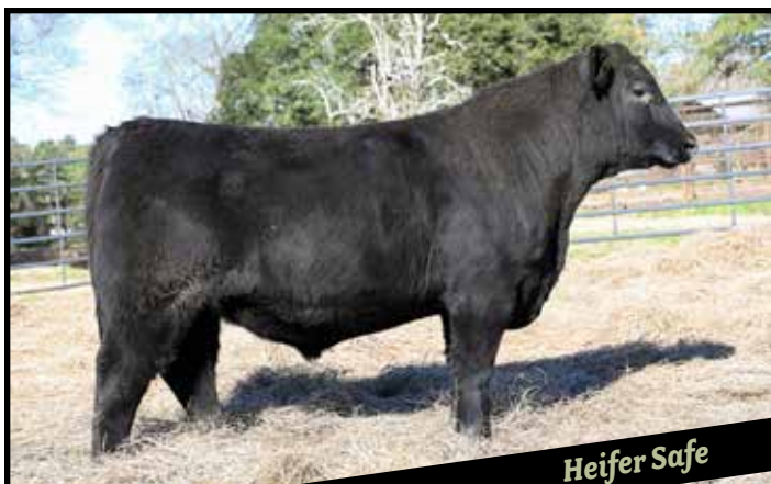
RM MR NET STYLE 427

All of these Angus bulls are sired by 1014, a Net Worth son. We used 1014 heavily throughout the years and have many daughters in production. These bulls are stout and rugged made, having longevity in their pedigree. Use these half brothers to make your calf crop more consistent.