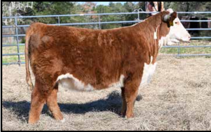
4M MS RED HARLEY 4030 489

100 4M MS RED HARLEY 4030 489 (IEP,DBP) COW P44562119 || CALVED: 1/10/24 || TATTOO: LE 489 POLLED