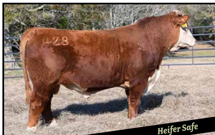
4M MR COWBOY DOMINO 2079 428