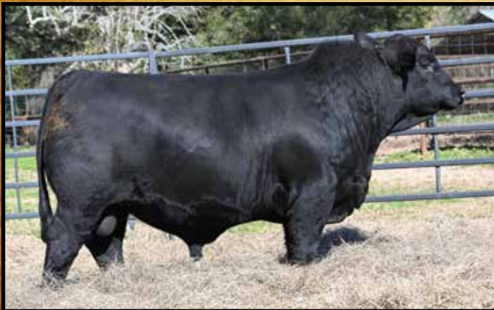
4M MR ABSOLUTE BLASTER 002M