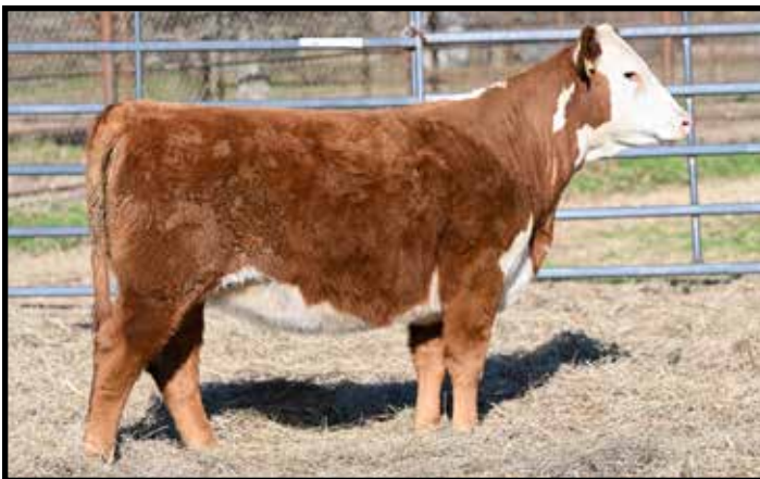
4M MS RED CO CO 4102

101 4M MS RED CO CO 4102 COW 44562170 || CALVED: 1/16/24 || TATTOO: LE 4102 HORNED