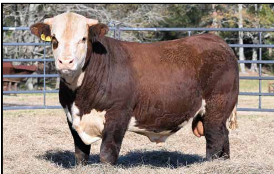
4M MR TRUST HARLAND 192 439