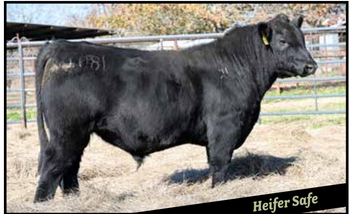
4M MR NET BULLSEYE 4081