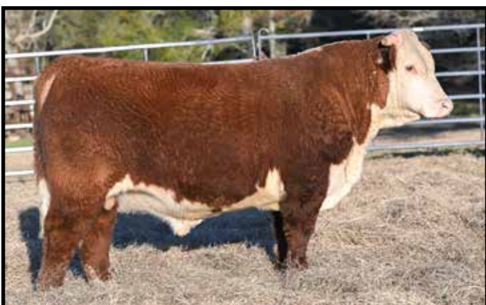
4M MR SENTRY 332A 401 ET