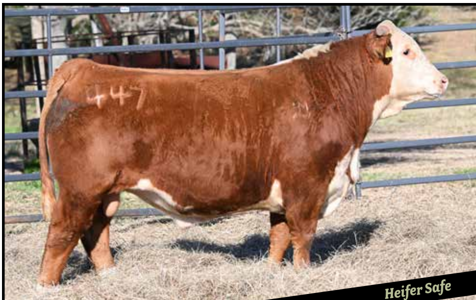
4M MR DOMINO 2079 447

447 4M MR DOMINO 2079 447 {DLF,HYF,IEF,MSUDF} BULL 44538739 || CALVED: 11/5/23 || TATTOO: LE 447 HORNED