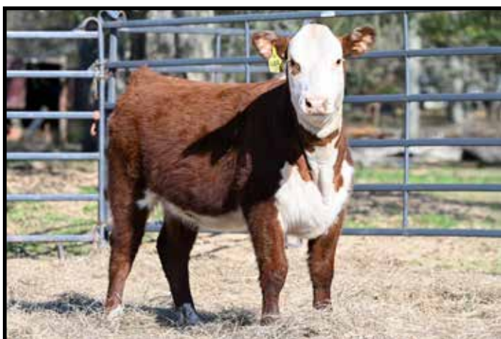
4M MS BEEFY LADY 2079 448