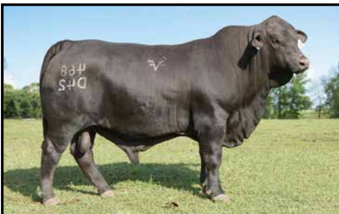
ABSOLUTE OF SALACOA 468D42 – Sire of Ultra Black Bulls