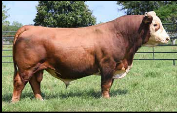
4M 66589 DOMINO 2079 ET 14 progeny sell