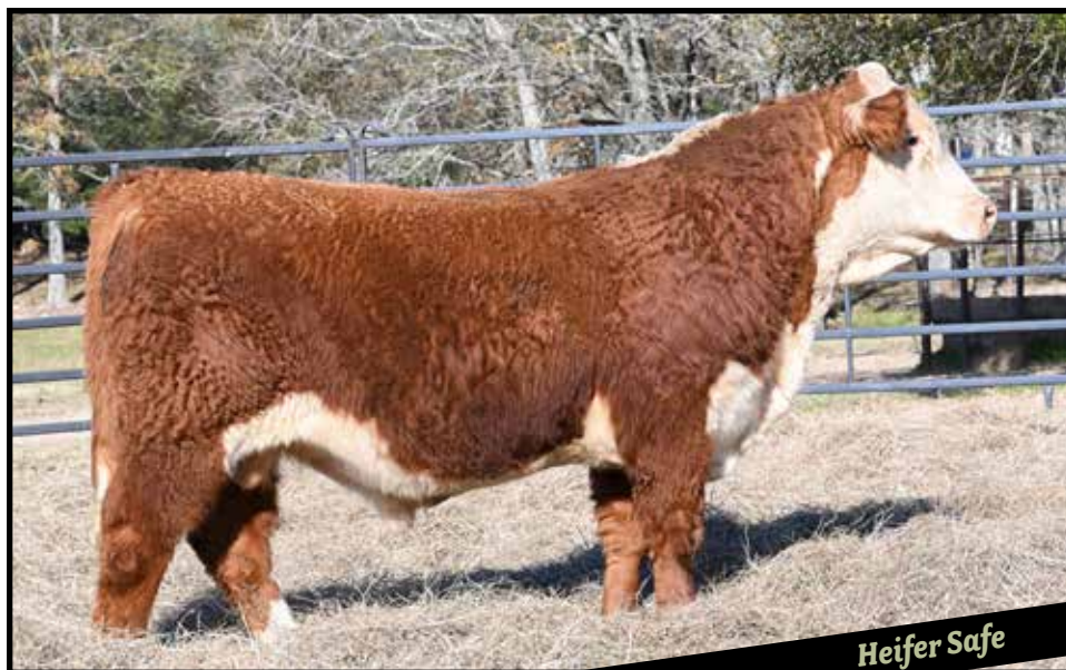
4M MR REGAL DOMINO 409