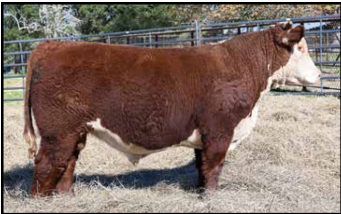
4M MR MOHICAN MAN 192 460