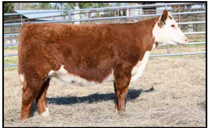
4M H12 022 MELINDA 409M