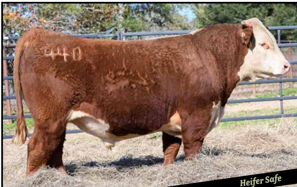
4M MR HARLAND DOMINO 2079 440

440 4M MR HARLAND DOMINO 2079 440 {DLF,HYF,IEF,MSUDF} BULL 44538717 || CALVED: 10/31/23 || TATTOO: LE 440 HORNED