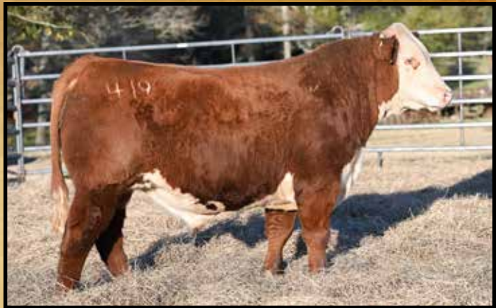
4M MR ADVANCE 192 419