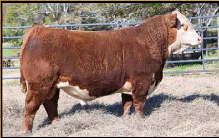
4M MR HOMETOWN DOMINO 2079 454