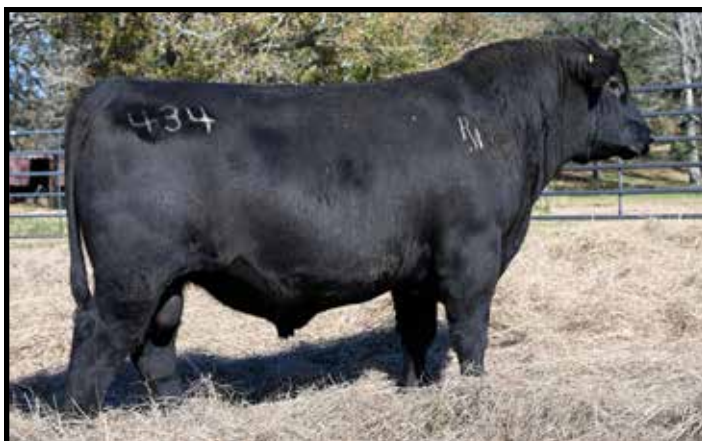
RM MR NET BLACK GRANITE 434