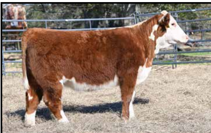
4M MS GWENS RED GIRL 478

102 4M MS GWENS RED GIRL 478 (DLF,HYF,IEF,MSUDF) COW P44538581 || CALVED: 1/2/24 || TATTOO: LE 478 POLLED