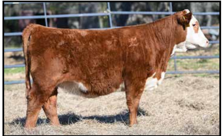
4M MS 2079 LEADER 4133