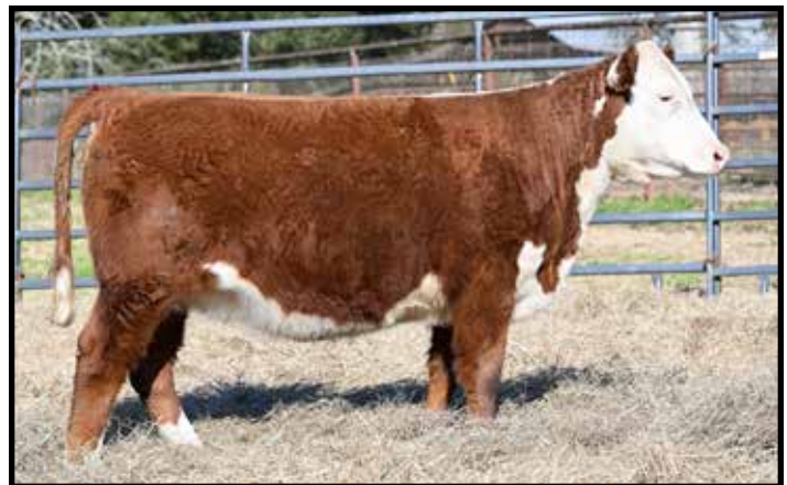
4M MS 2079 LADY 4114