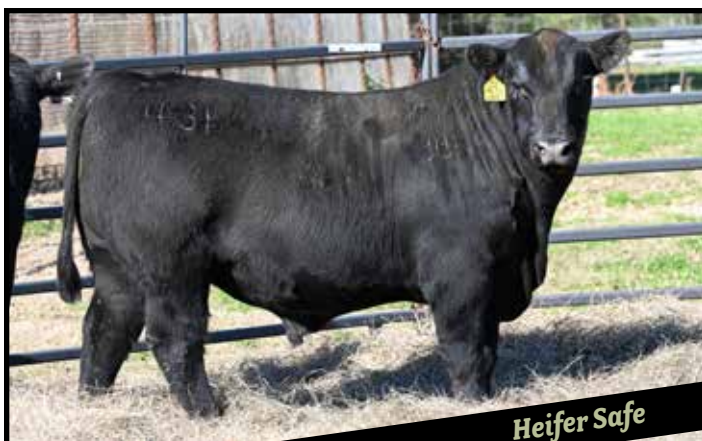
4M MR NET WORTH PRODUCT 431