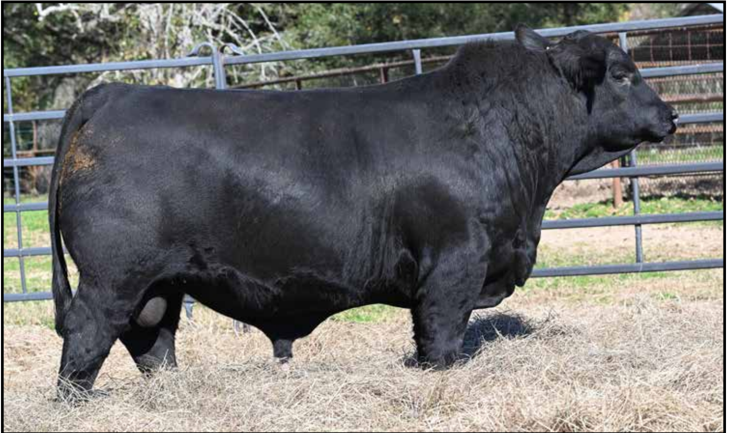
4M MR ABSOLUTE BLASTER 002M

We started something new to help reach a wider customer base and target more breeders in the deep South. We purchased 468D42 from T3 Brangus, who originated from Salaco Valley Farms to start our Ultra Black program. We are offering his first registered bull crop, and they are nothing short of impressive. Study all 5 of these half-brothers to find consistency, growth and power. They will add that hybrid vigor to your operation, adding dollars to your bottom line.