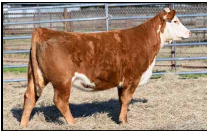
4M MS LADY CHURCHILL 2079 450