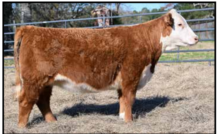
4M MS 2079 CHERRY PIE 4107