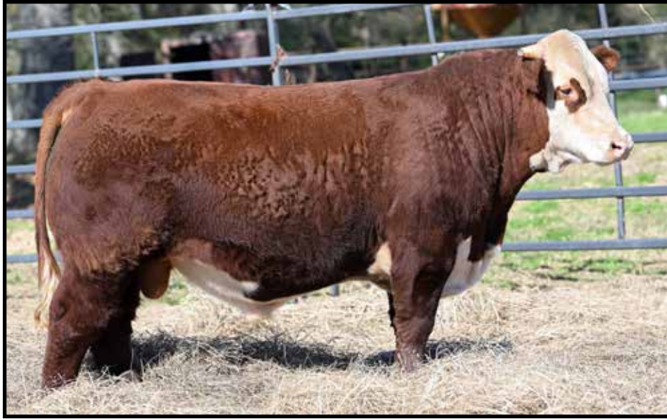
4M MR REVOLUTION MAN 192 430

430 4M MR REVOLUTION MAN 192 430 {DLF,HYF,IEF,MSUDF,DBP} BULL 44538698 || CALVED: 10/27/23 || TATTOO: LE 430 HORNED