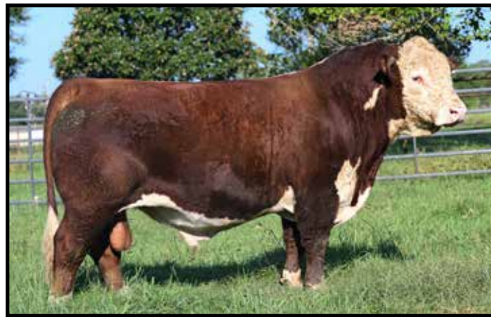
4M LF RED BOY 4030 Z44 221 ET 3 daughters sell