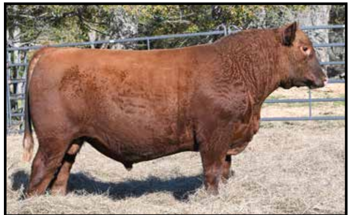
4M MR RED RAZOR 42E