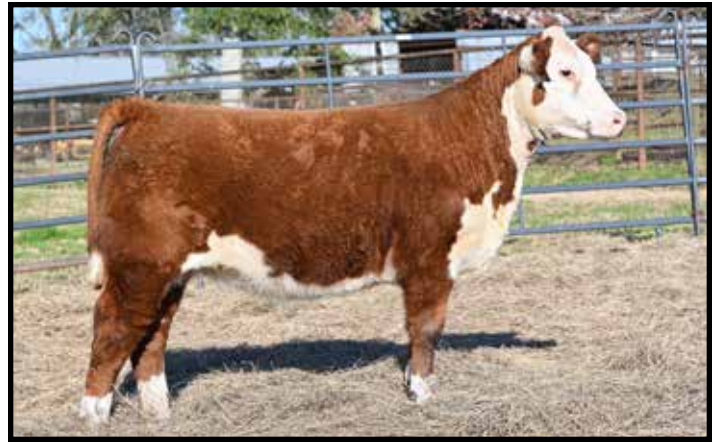
4M H08 022 MANDY 418M