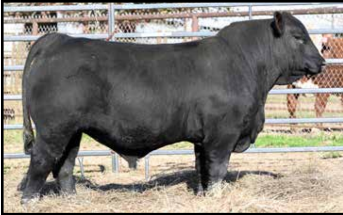
4M MR ABSOLUTELY WORTHY 924M