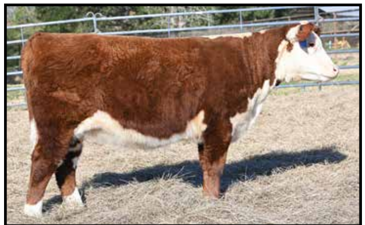
4M 9J 13J MOLLY 424M