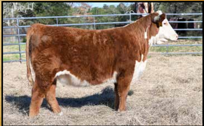
4M MS RED HARLEY 4030 489