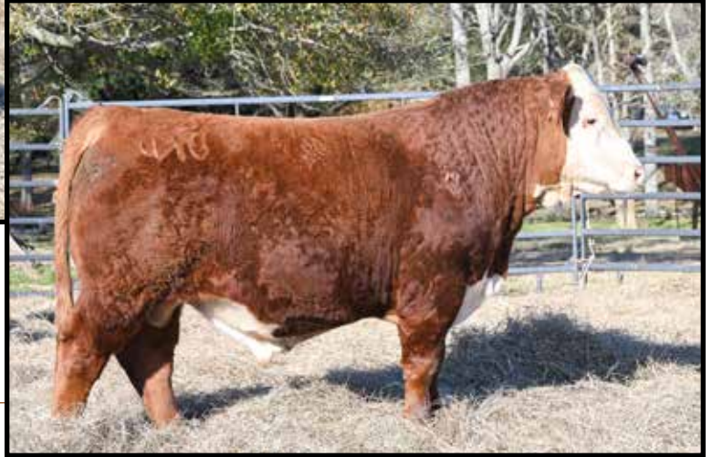
4M MR FORWARD VICTOR 410 ET