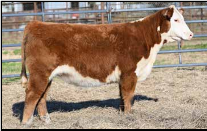
4M MS SUPER DOMINETTE 192 456

112 4M MS SUPER DOMINETTE 192 456 (DLF,HYF,IEF,MSUDF) COW 44538758 || CALVED: 11/20/23 || TATTOO: LE 456 HORNED