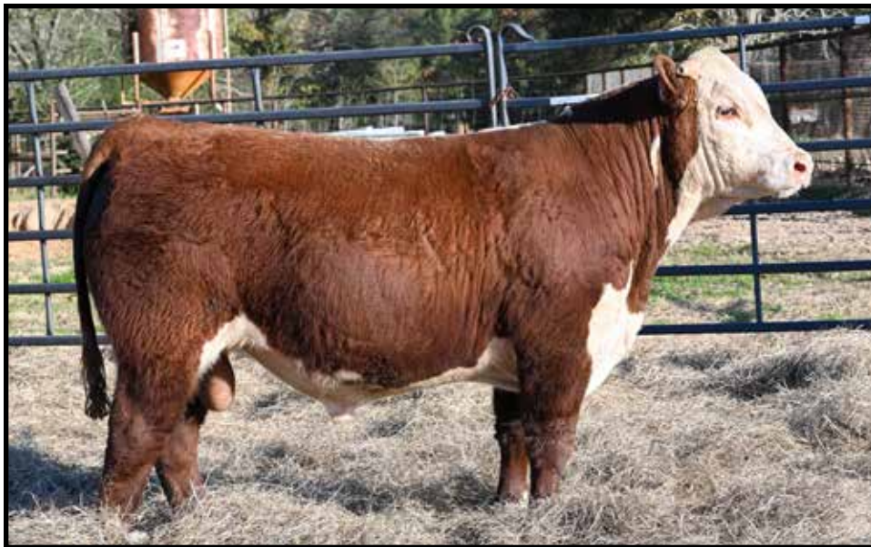
4M MR TRUSTY MAN 192 432