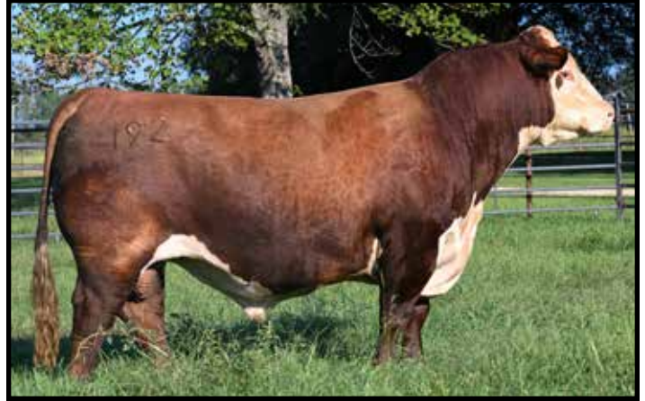
4M MR TRUSTY MAN 719T 192 7 progeny sell