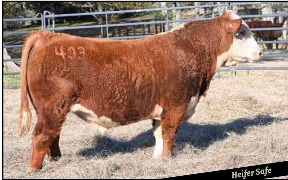
4M MR REGAL HARLAND 403

403 4M MR REGAL HARLAND 403 {DLF,HYF,IEF,MSUDF,MDP,DBP} BULL P44579820 || CALVED: 9/27/23 || TATTOO: LE 403 SCURRED