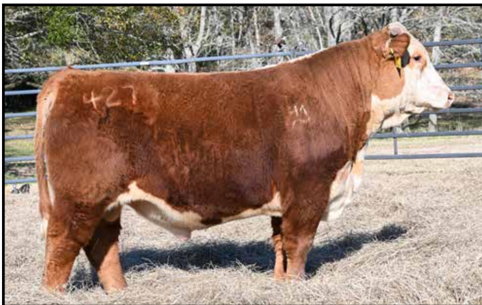
4M MR DOUBLE DOMINO 2079 427