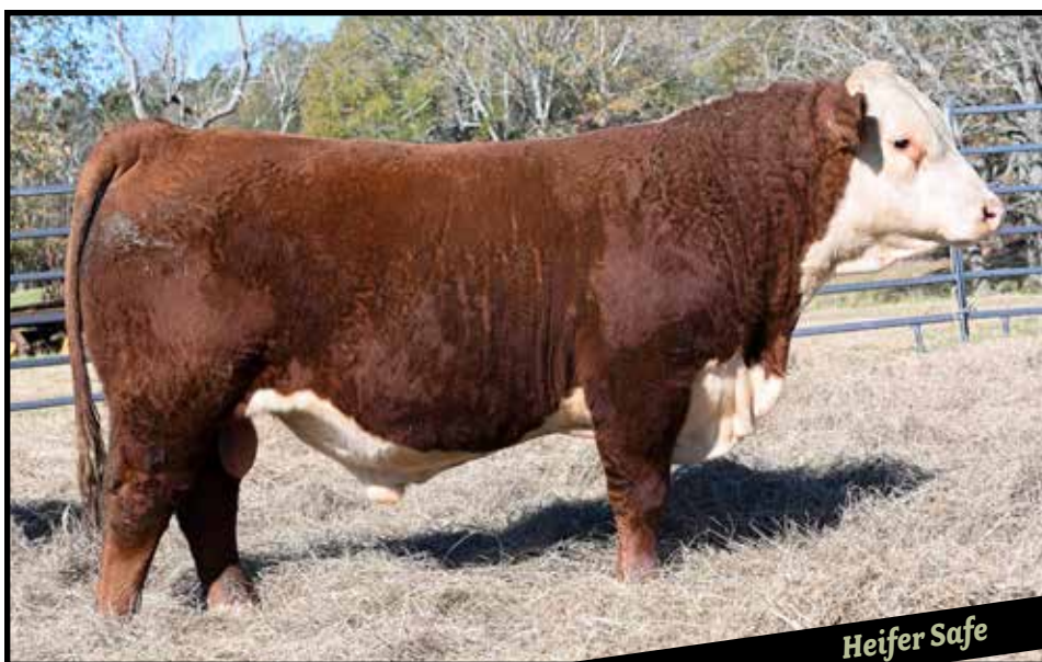
4M MR TIMES A DOMINO 2079 436