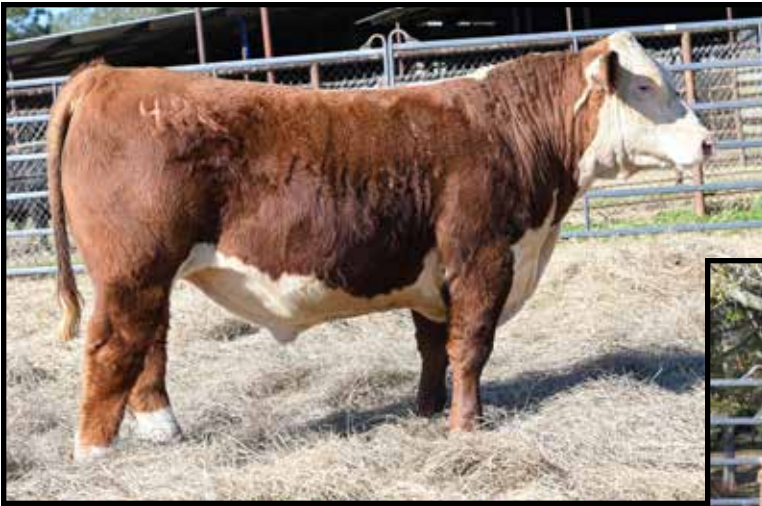
4M MR GOLDEN OAK GUY 424 ET