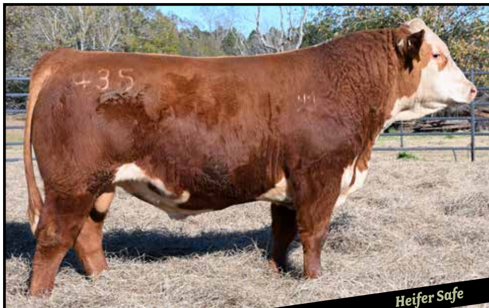
4M MR PERFECT 2079 435

435 4M MR PERFECT 2079 435 {DLF,HYF,IEF,MSUDF} BULL P44538712 || CALVED: 10/28/23 || TATTOO: LE 435 POLLED