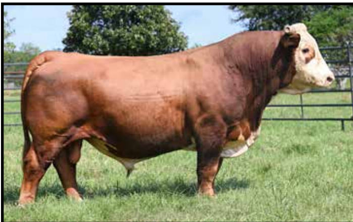
4M 66589 DOMINO 2079 ET 14 progeny sell

454 4M MR HOMETOWN DOMINO 2079 454 (DLF,HYF,IEF,MSUDF,MDP) BULL P44538756 || CALVED: 11/20/23 || TATTOO: LE 454 SCURRED