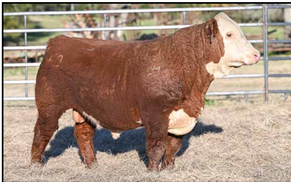
4M MR 7143E ADVANCE DEAL 420