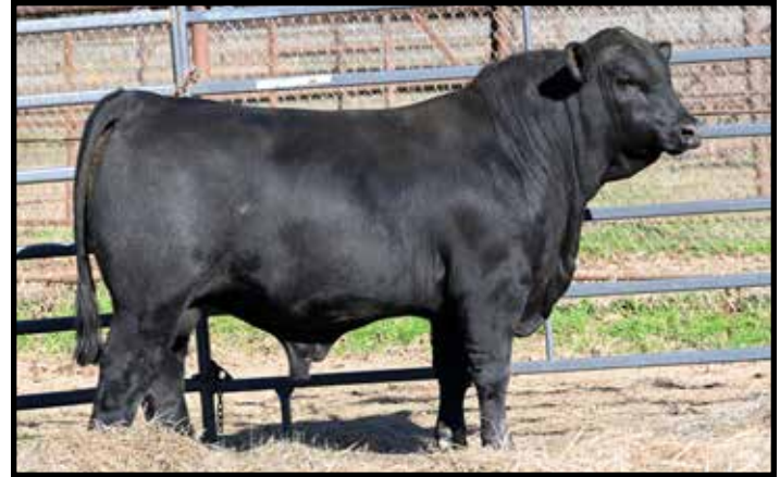
4M MR NET ABSOLUTE OSOM