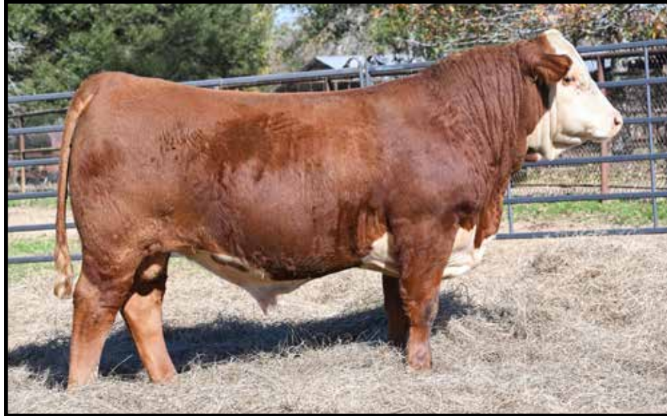
4M MR 7143 LARAMIE 414

414 4M MR 7143 LARAMIE 414 {DLF,HYF,IEF,MSUDF} BULL P44579814 || CALVED: 10/9/23 || TATTOO: LE 414 POLLED