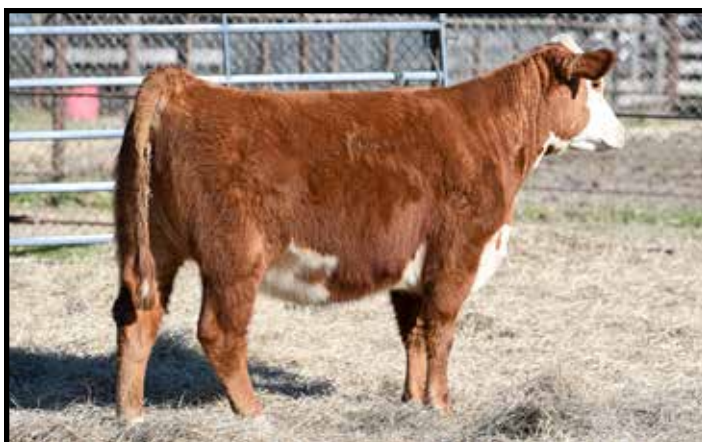
4M MS WONDER WOMAN 2079 445