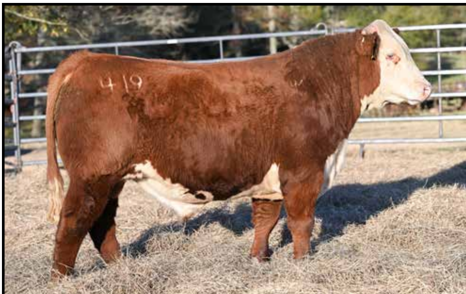
4M MR ADVANCE 192 419

419 4M MR ADVANCE 192 419 {DLF,HYF,IEF,MSUDF} BULL 44538677 || CALVED: 10/16/23 || TATTOO: LE 419 HORNED