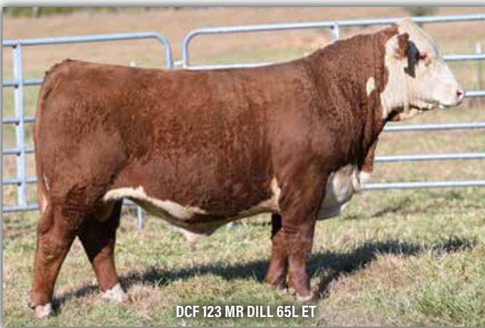
DCF 123 MR DILL 65L ET