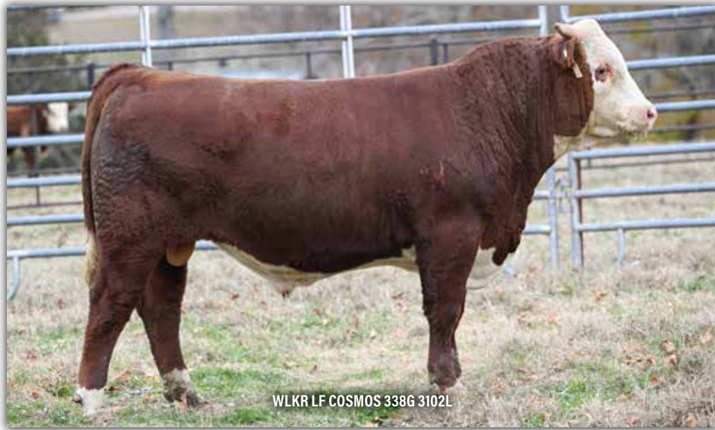
WLKR LF COSMOS 338G 3102L