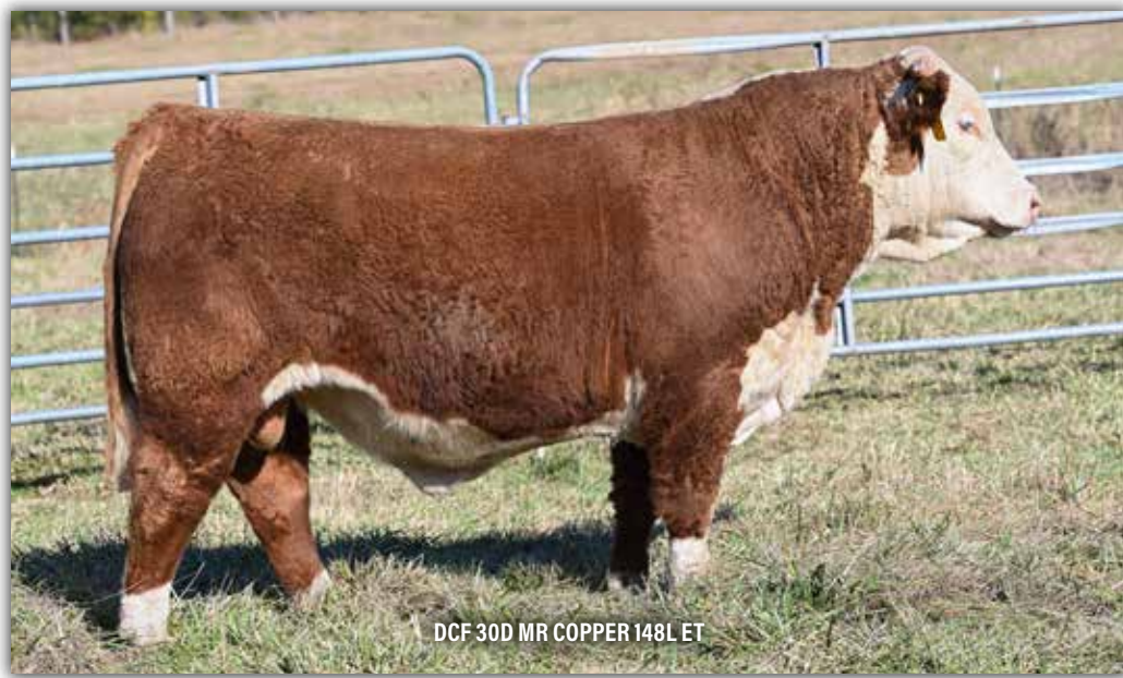
DCF 30D MR COPPER 148L ET