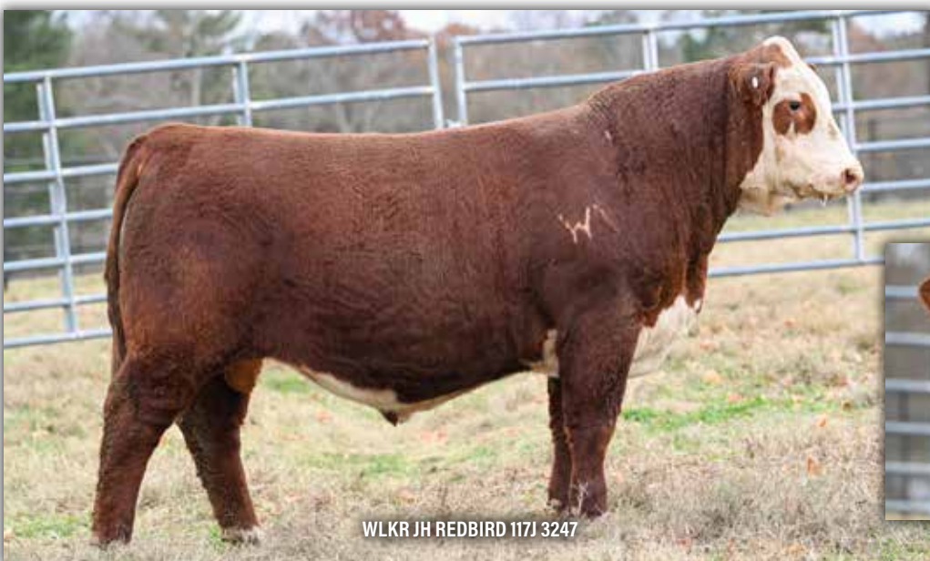
WLKR JH REDBIRD 117J 3247