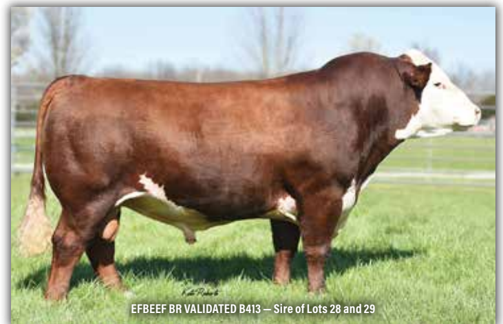
EFBEFF BR VALIDATED B413 — Sire of Lots 28 and 29

• High quality son of Validated ready for heavy use. You want to raise a set of calves with added carcass merit that will pay dividends at the rail? Don't miss this opportunity.