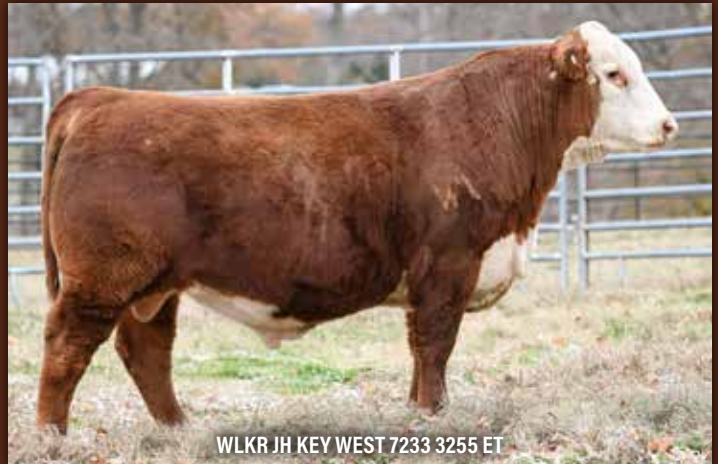
WLKR JH KEY WEST 7233 3255 ET