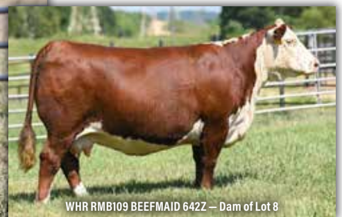
WHR RMB109 BEEFMAID 642Z - Dam of Lot 8