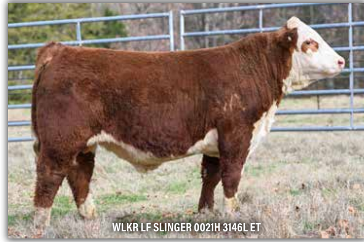
WLKR LF SLINGER 0021H 3146L ET