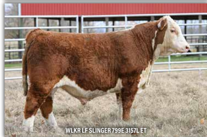
WLKR LF SLINGER 799E 3157L ET