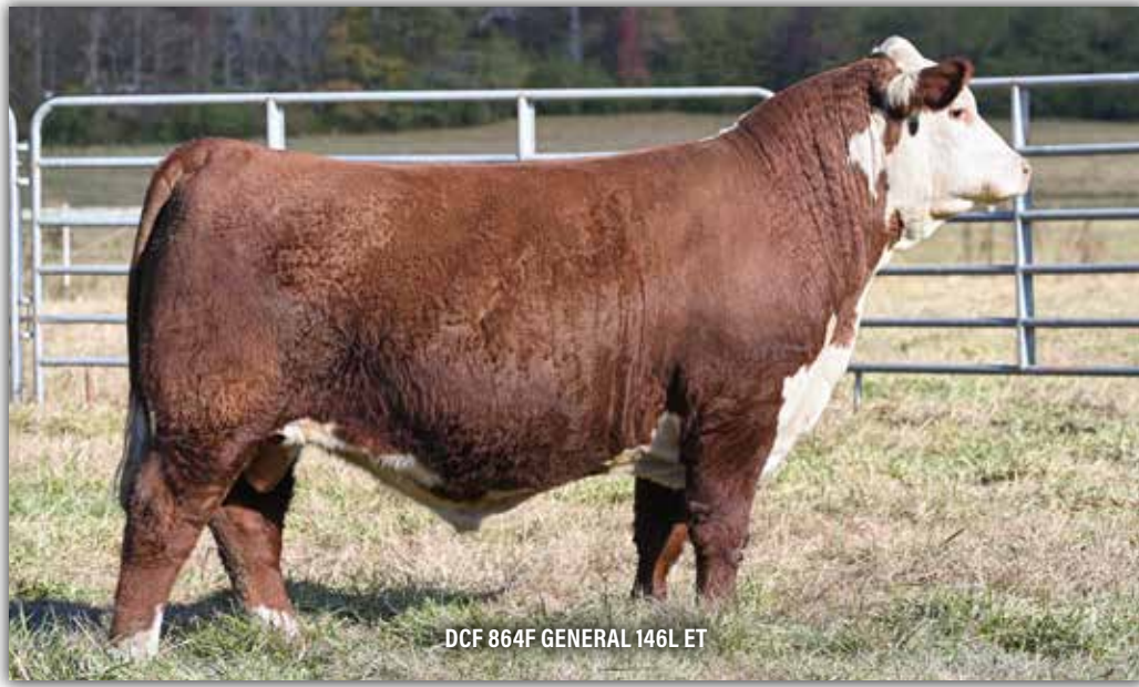
DCF 864F GENERAL 146L ET