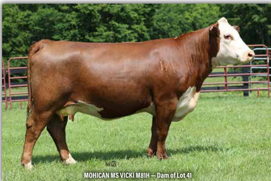
MOHICAN MS VICKI M81H — Dam of Lot 41