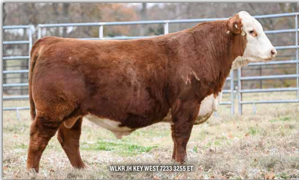
WLKR JH KEY WEST 7233 3255 ET