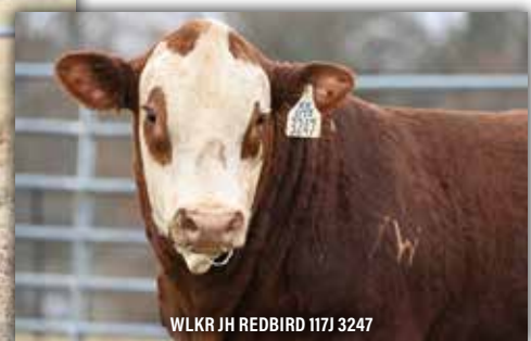
WLKR JH REDBIRD 117J 3247