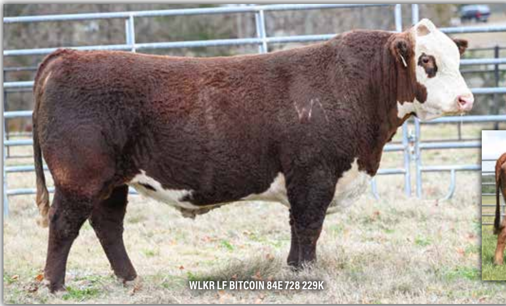
WLKR LF BITCOIN 84E 728 229K