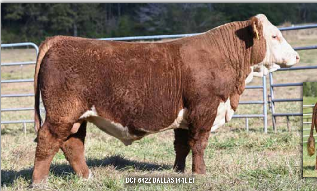
DCF 642Z DALLAS 144L ET