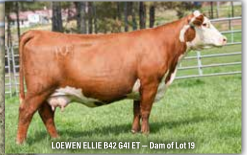
LOEWEN ELLIE B42 G41 ET — Dam of Lot 19