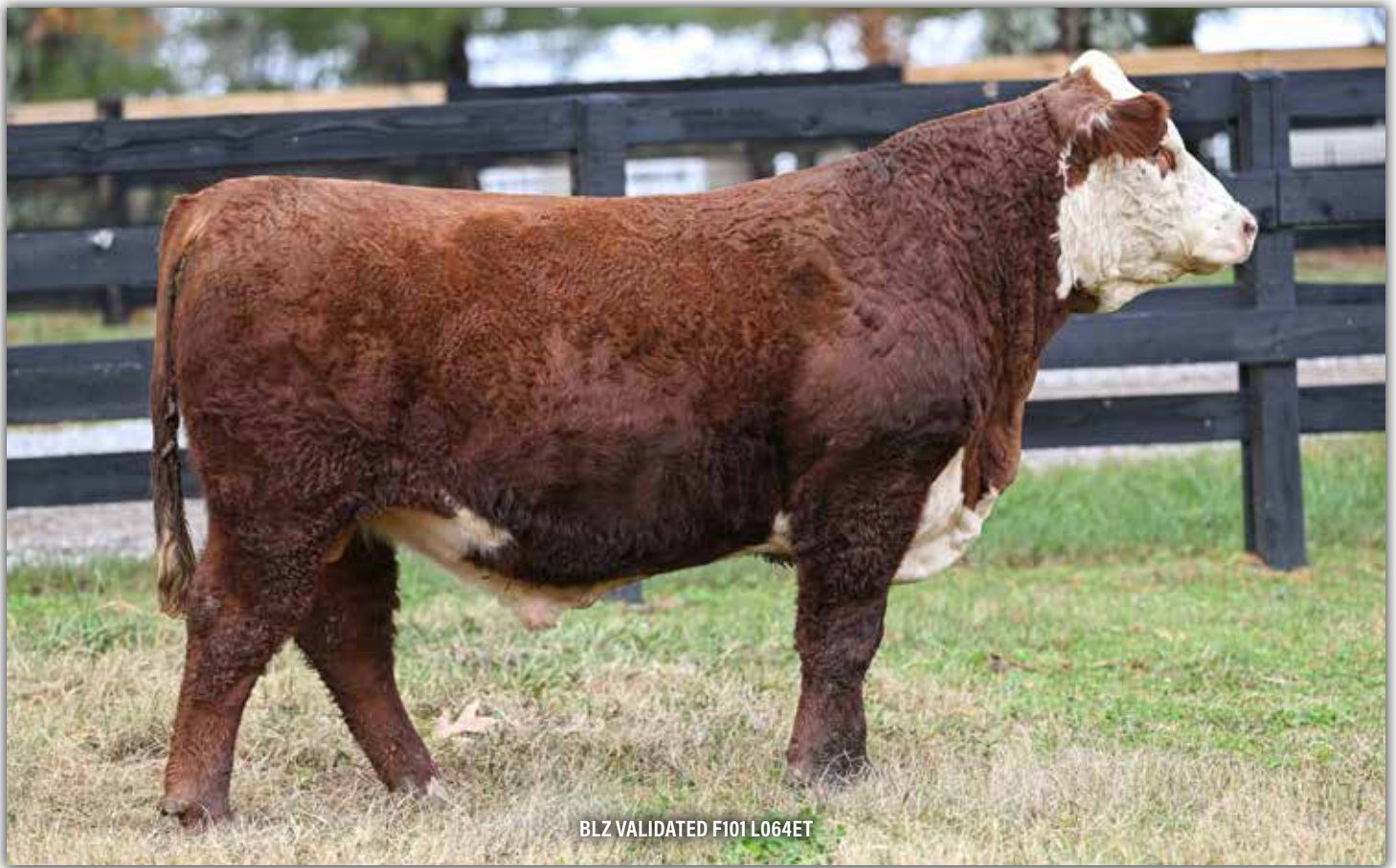
BLZ VALIDATED F101 L064ET