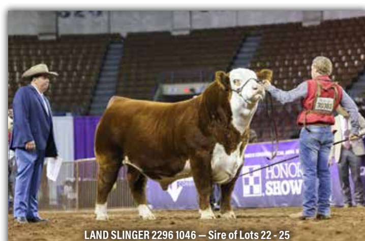
LAND SLINGER 2296 1046 – Sire of Lots 22 - 25