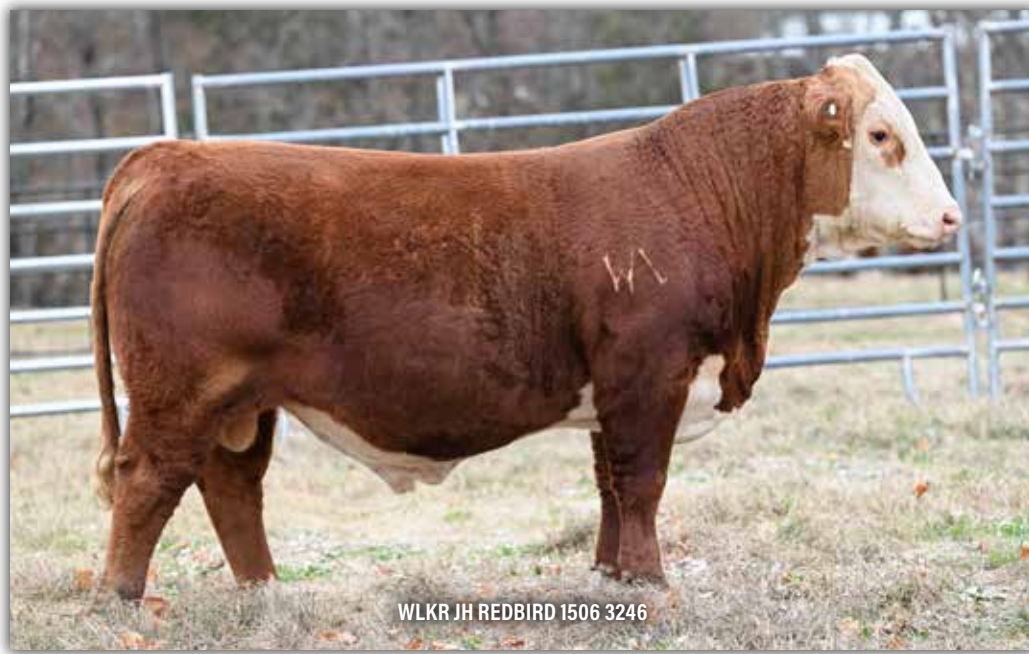
WLKR JH REDBIRD 1506 3246