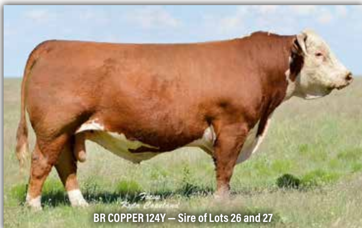
BR COPPER 124Y — Sire of Lots 26 and 27