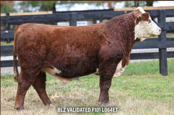
BLZ VALIDATED F101 L064ET

Walker Herefords Sale Facility • Morrison, Tennessee