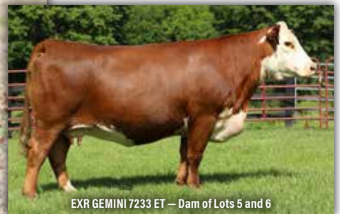
EXR GEMINI 7233 ET — Dam of Lots 5 and 6