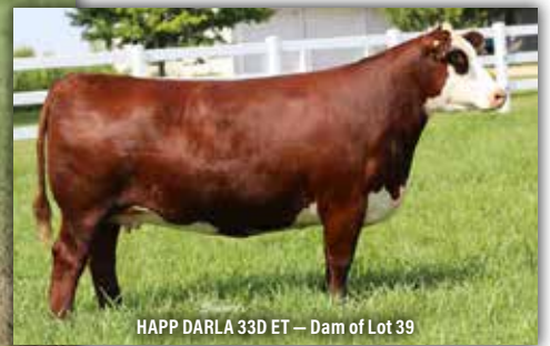
HAPP DARLA 33D ET — Dam of Lot 39