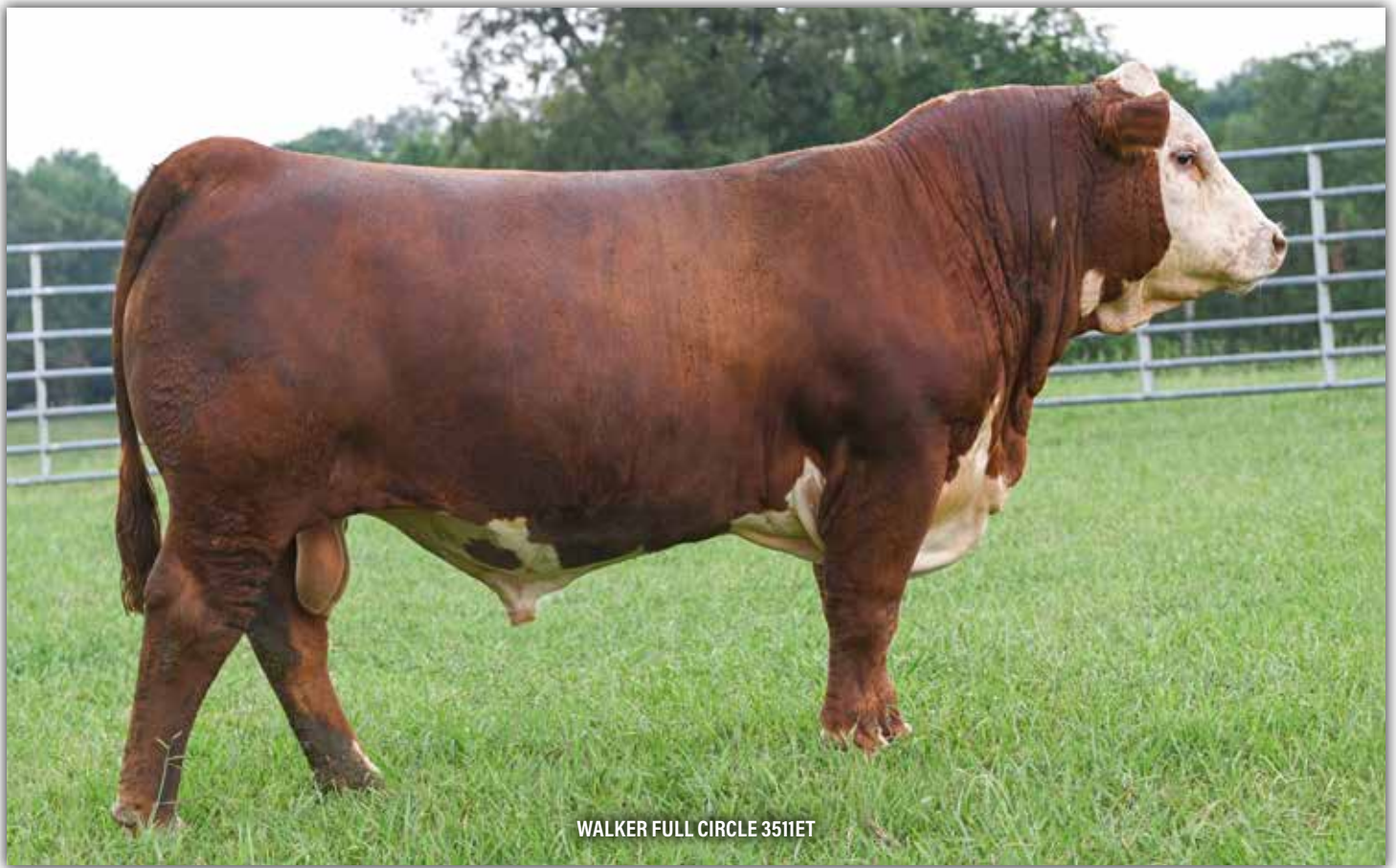
WALKER FULL CIRCLE 3511ET