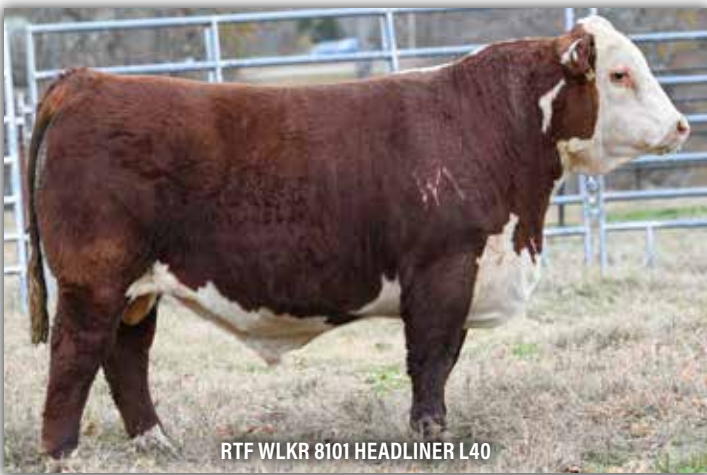
RTF WLKR 8101 HEADLINER L40