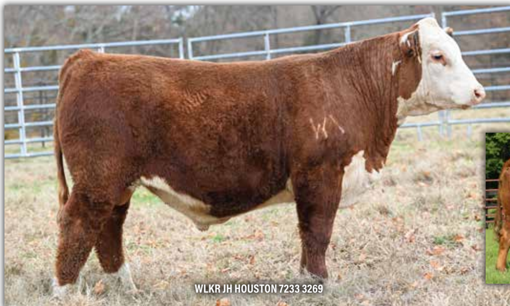
WLKR JH HOUSTON 7233 3269