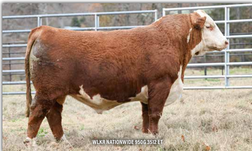
WLKR NATIONWIDE 950G 3512 ET