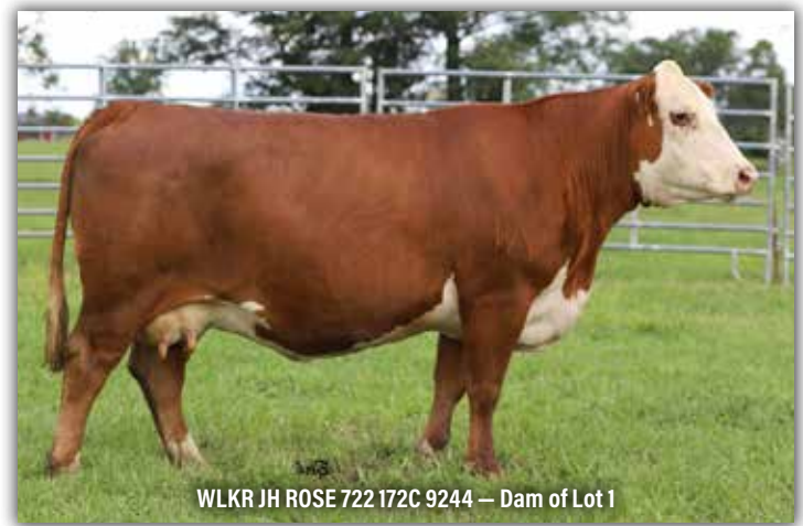
WLKR JH ROSE 722 172C 9244 – Dam of Lot 1