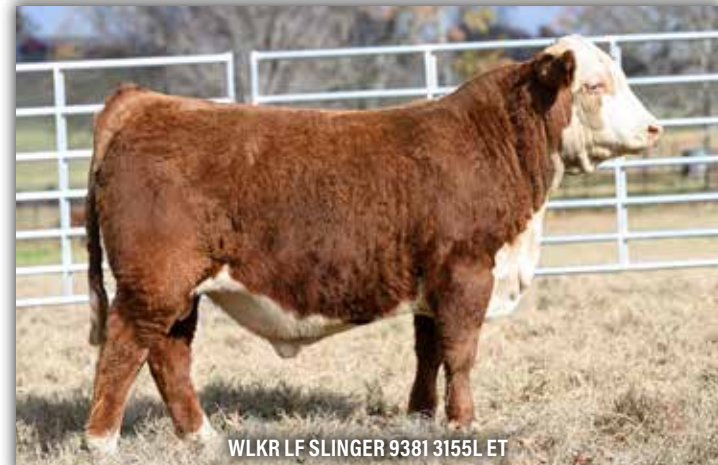
WLKR LF SLINGER 9381 3155L ET