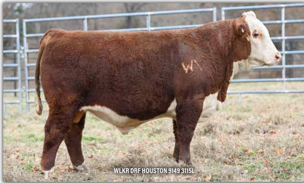
WLKR DRF HOUSTON 9149 3115L