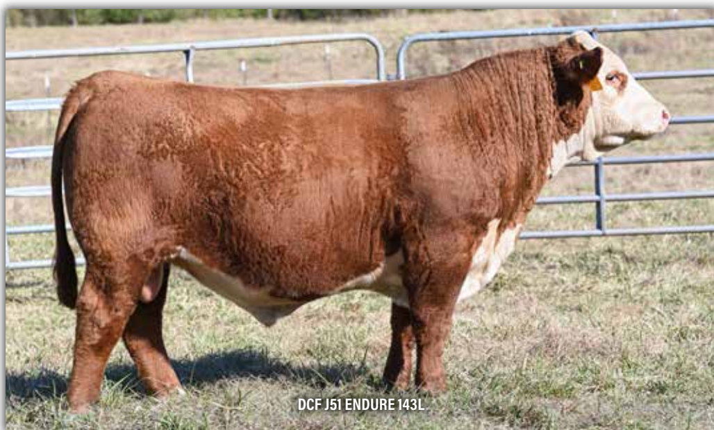
DCF J51 ENDURE 143L