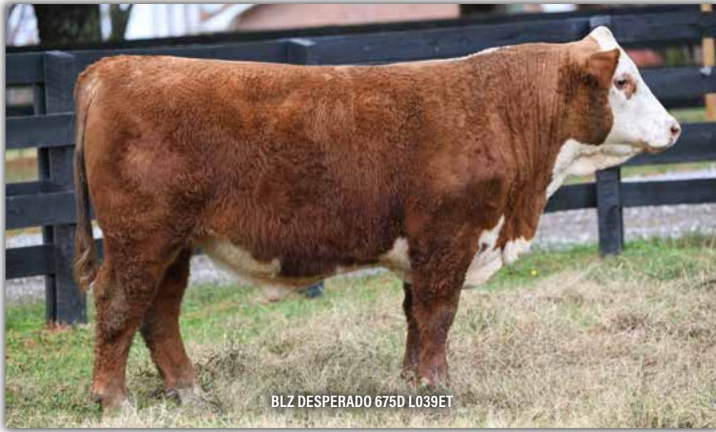
BLZ DESPERADO 675D L039ET