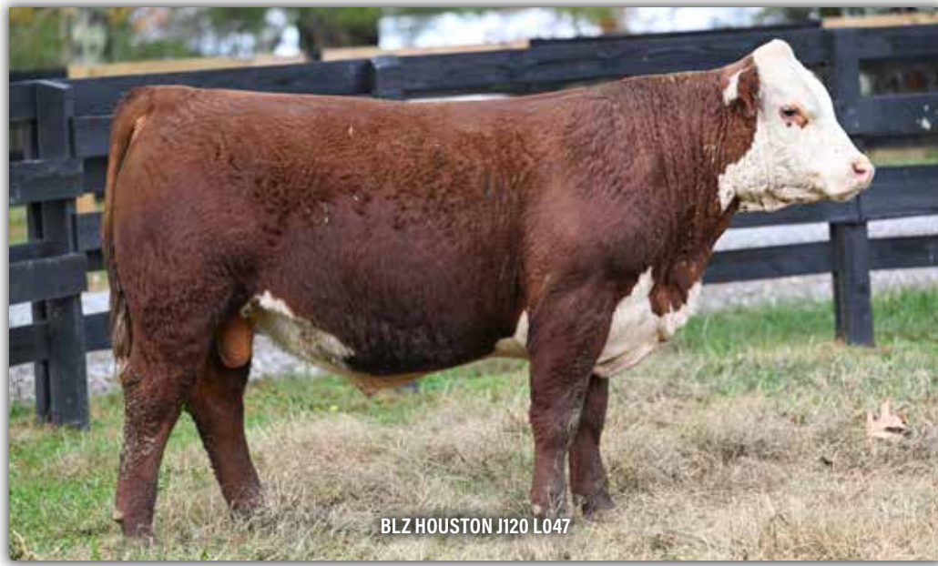
BLZ HOUSTON J120 L047