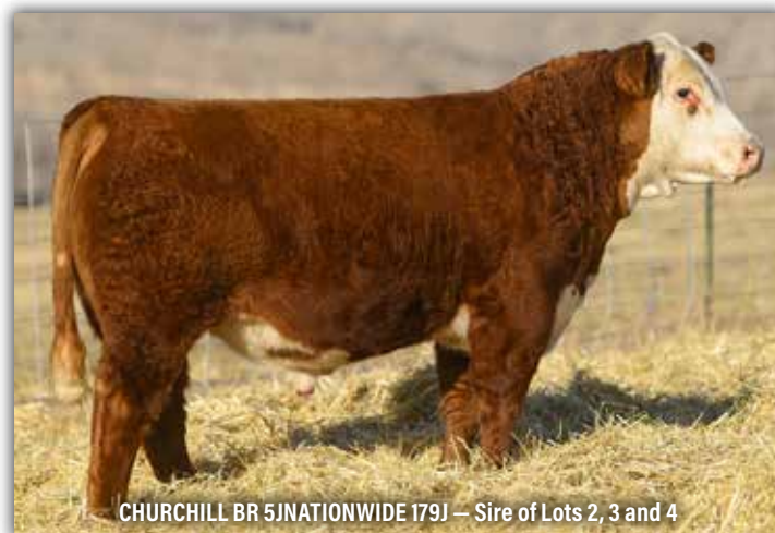
CHURCHILL BR 5JNATIONWIDE 179J – Sire of Lots 2, 3 and 4