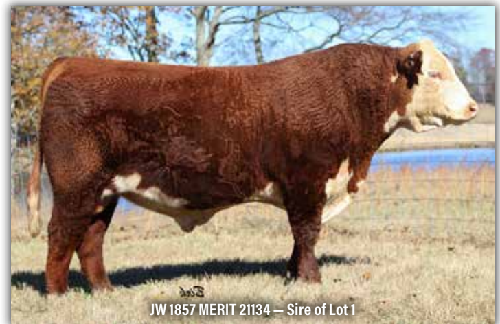
JW 1857 MERIT 21134 – Sire of Lot 1

Scrotal Circumference Measurements will be included on the Sale Supplement sheet.