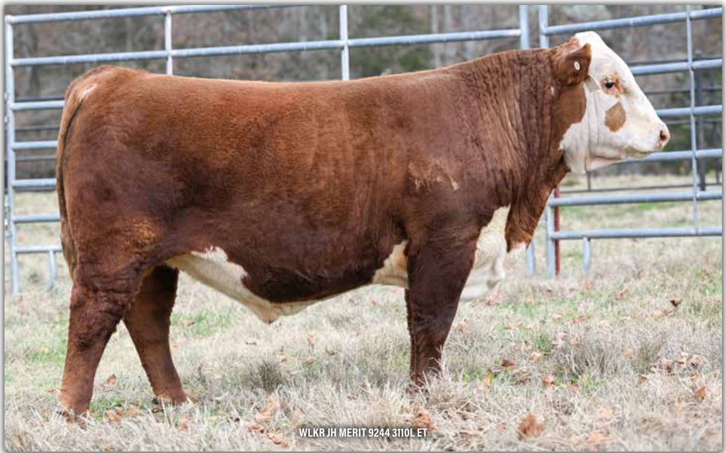
WLKR JH MERIT 9244 3110L ET