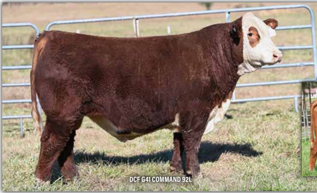
DCF G41 COMMAND 92L