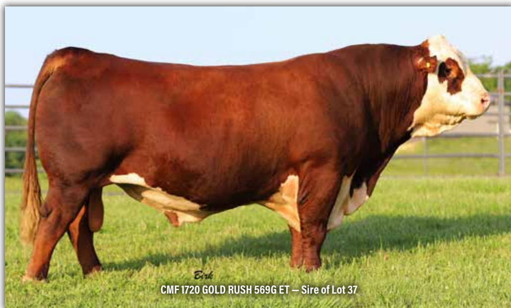
CMF 1720 GOLD RUSH 569G ET - Sire of Lot 37