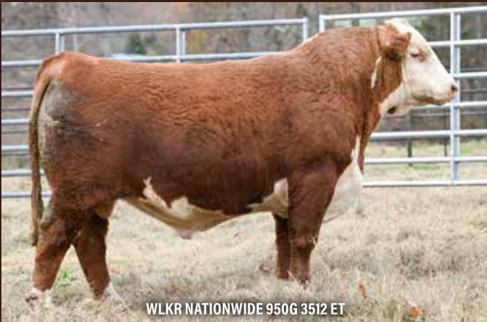
WLKR NATIONWIDE 950G 3512 ET