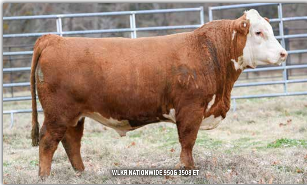
WLKR NATIONWIDE 950G 3508 ET