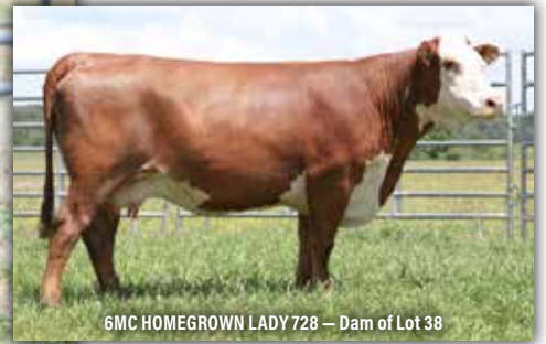
6MC HOMEGROWN LADY 728 — Dam of Lot 38