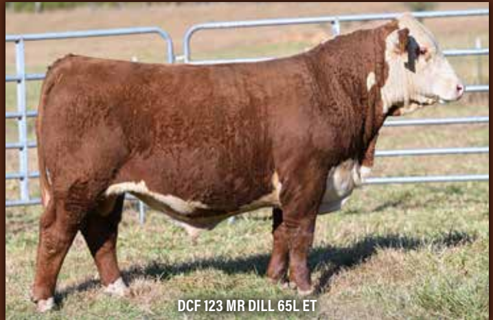
DCF 123 MR DILL 65L ET