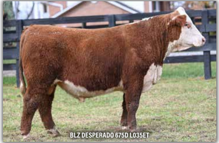
BLZ DESPERADO 675D L035ET