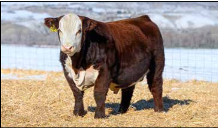
CHURCHILL W4 SHERMAN 2157K ET

Quite an opportunity to select right off the top of the Topp Herefords Program. Successful bidder will have approximately 325 January-May 2024 born heifers to pick from. Over 20% of the pick will be ET heifers from some of the breed's leading donor matrons. Sires of the heifers include: TH Innovation 105H (P44138715), Churchill W4 Sherman 2157K ET (P44378036), Harvie Smoke Stack ET 195B (P43711169), as well as the exciting new Australian bull The Ranch Remington R028 (P44418045). An abundance of other front-end sire progeny also will be included in this choice lot. Selection to be made by April 30, 2025.