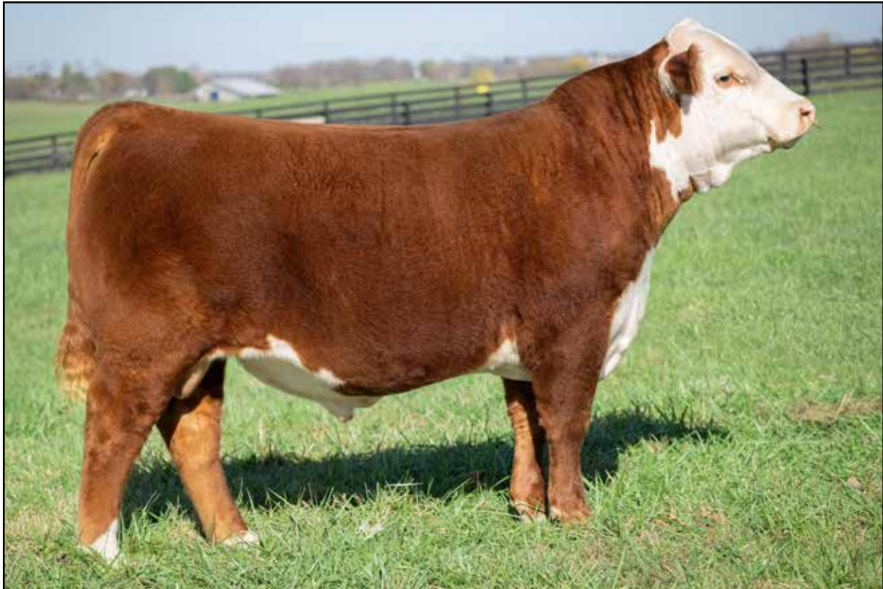
Lot 2 – BOYD PURSUIT 4032