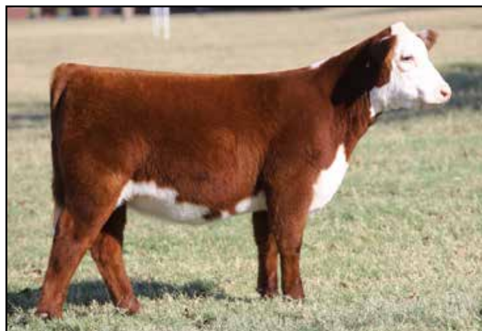
Lot 19 – BK MY SWEETHEART 4159M ET