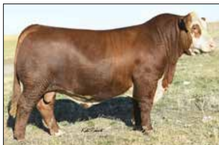
EXR GENERATOR 0333 ET