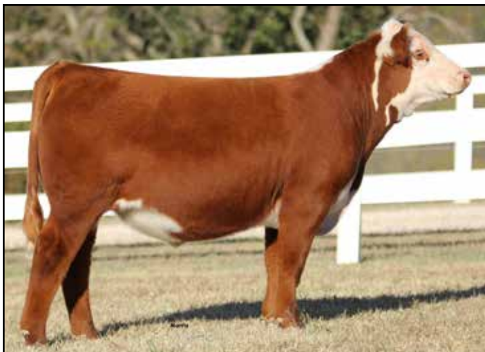
Lot 16 – BB 9444 DAUNTLESS 109M