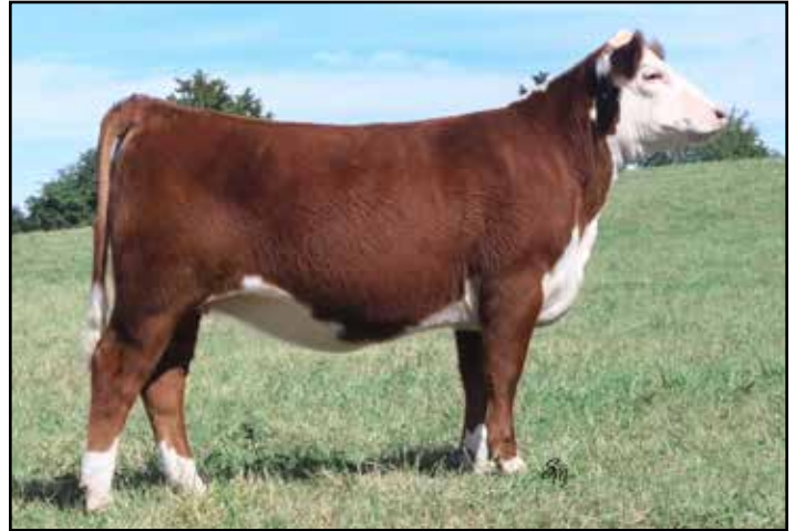
Lot 25 – RMB H086 SOUTHERN BELL 387L ET

P43887938 STAR TAKIN ON DA DREAM 300Y ET (DLF,HYF,IEF,MSUDF,DBP)