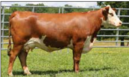
WLKR JH WASHITA 4030 0227 ET