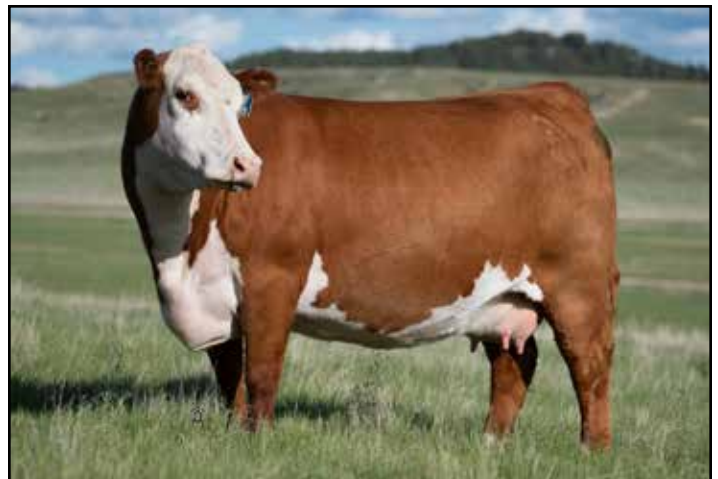
CSC 707 MISS WY0 008 • P44169275