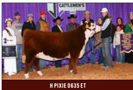
H PIXIE 0635 ET

2022 Cattlemen's Congress Champion Horned Female