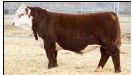
CHURCHILL EQUITY 3316L ET