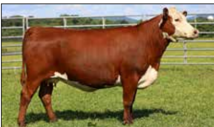
WLKR JM BETH B413 333 G92 ET