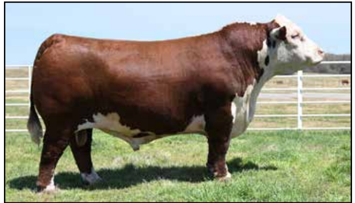
TH INNOVATION 105H