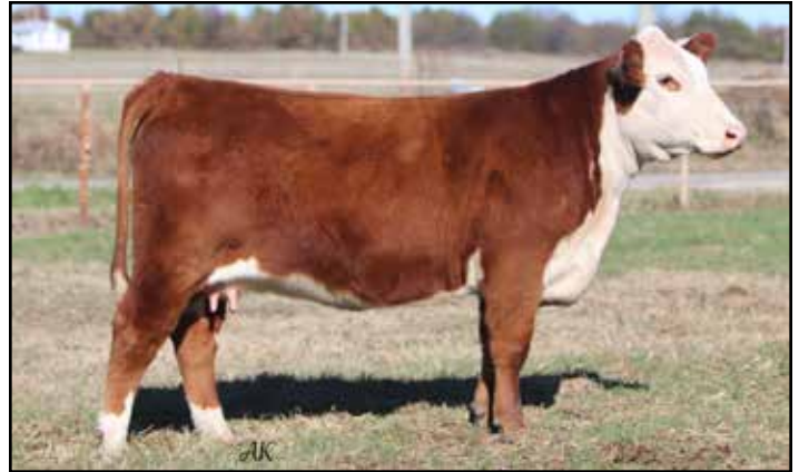
Lot 26 – WW 4035 Z06 KATHI 204K ET

P43315215 TCC MS DIANA 01 (DLF,HYF,IEF,DBP)