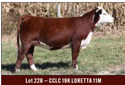
Lot 22B – CCLC 19K LORETTA 11M