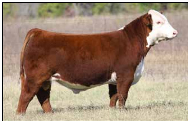
Lot 18B – BK MONEY TRAIN M53 ET