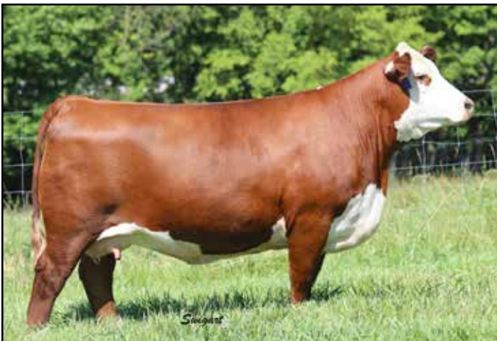
TH 329 358C LANA 76E • P44266220