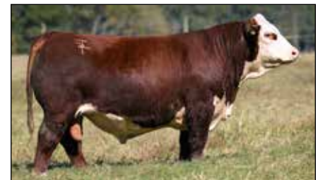
Lot 15B – INNISFAIL MAKE WAY 2324 ET