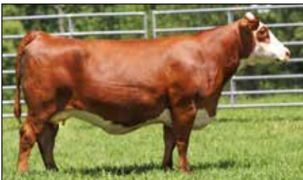
/S LADY MANDATE 91956 ET