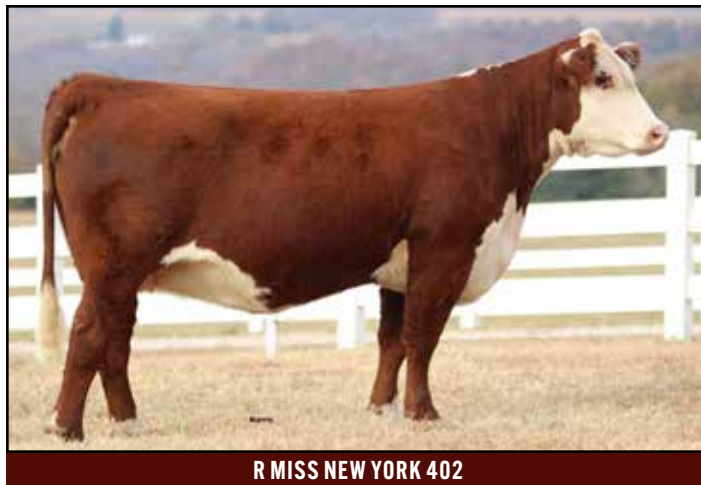
R MISS NEW YORK 402

TERMS: Lot 1A will offer the 2, 3 and 4-year-old cows. Lot 1B will offer the cows ages 5 and up. Winning bidder will have the option to pick Lot 1A, 1B, or both for twice the money. Approximately 850 spring calving cows to be evaluated. Calving window is primarily late February through April. Selection to be made before June 1, 2025. We retain the right to one flush for females and 1/3 interest on all bull calves selected with their dam.