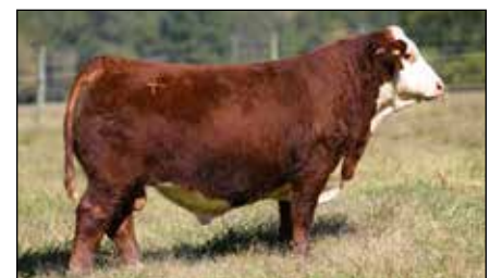
Lot 15D – INNISFAIL TRAILWAY 2359 ET