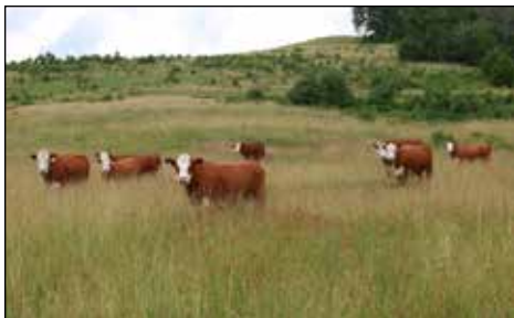
Featuring the AI service of our new HOMOZYGOUS POLLED herd sire, pictured at right.

Selling full interest with retaining the right to two (2) flushes at seller's expense and buyer's convenience resulting in a minimum of 10 transferrable embryos.