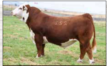
STELLPFLUG GUNSMOKE 222 ET