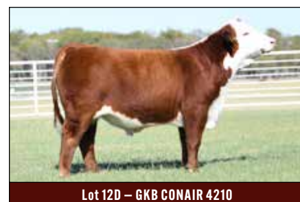
Lot 12D – GKB CONAIR 4210