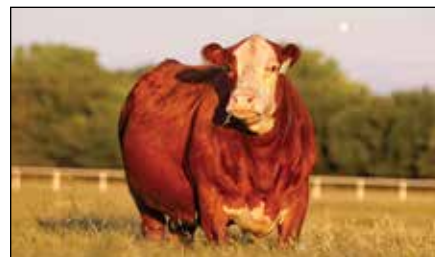
R MISS ADDITION 2569