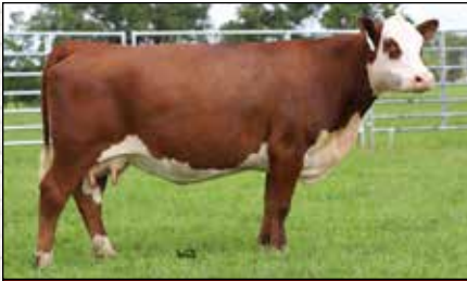
WLKR AXA DB MISS 173D W19 043H