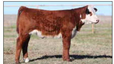
WW THA 249J 204K TRU GRIT 221M

P44597191 – Bull – Calved: 8/28/24 – Tattoo: BE 221M