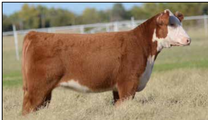
Lot 7 - EXR BAILEES MCKEE 4224 ET