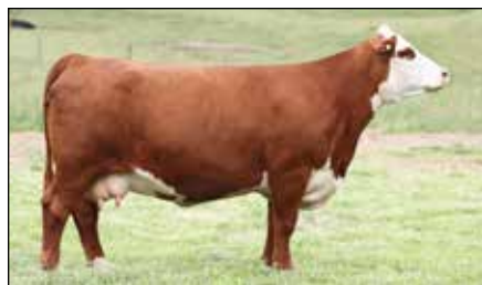
GREEN 11E MERCEDES 228G ET