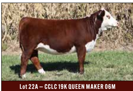
Lot 22A – CCLC 19K QUEEN MAKER 06M