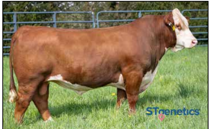
FTF MAGNIFICO 120J

Purchased by Chapman Land & Cattle in the 2023 Hereford Night Sale