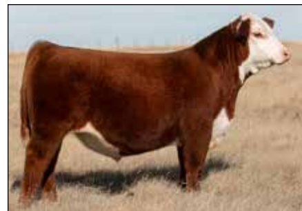
Lot 23A - RPC 143J 210 FIREBALL 410