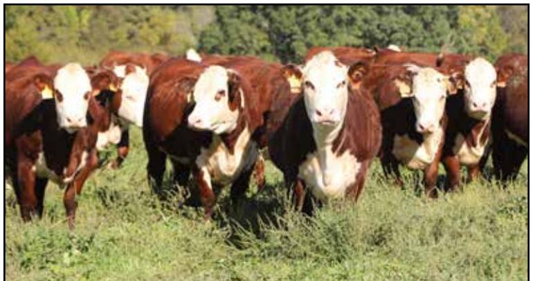
GROUP OF BRED HEIFERS

Purchased by Barnes Herefords in the 2021 Hereford Night Sale