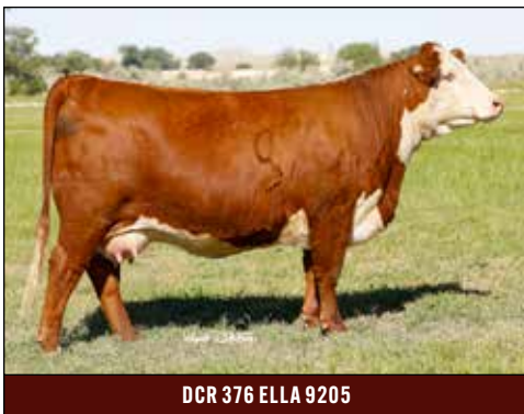
DCR 376 ELLA 9205 sold to Chapman's