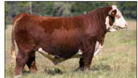
Lot 15A – INNISFAIL RUNWAY 2341 ET