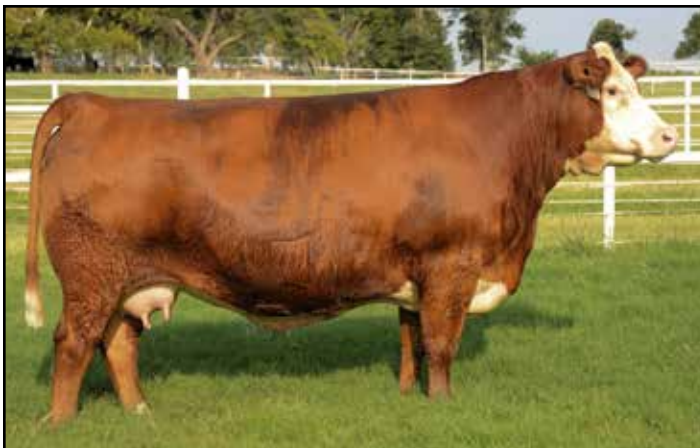
R MISS ADDITION 2569

Purchased by Bonebrake Herefords 2023 National Hereford Sale and dam of Lot 16