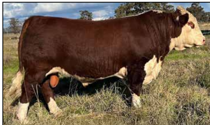
THE RANCH REMINGTON R028