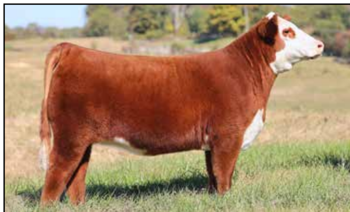
Lot 14 – GREEN 901 MERCEDES 027L ET