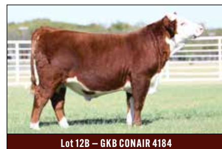
Lot 12B – GKB CONAIR 4184