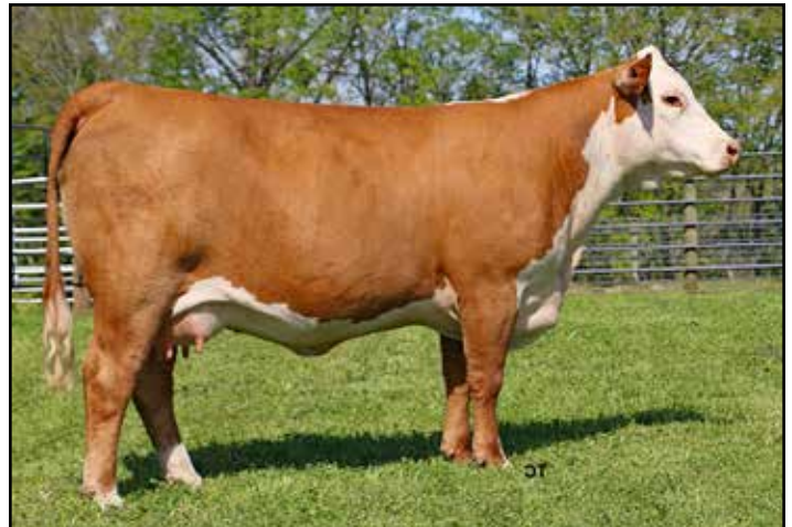
CLC 1857 NEW BEGINNINGS 23J • P43818744