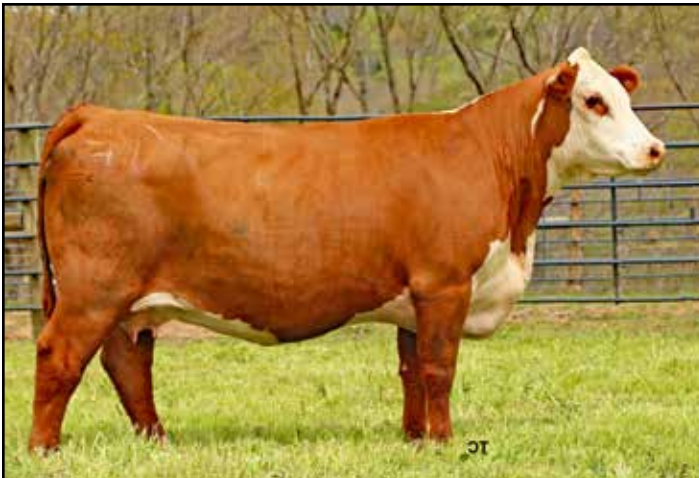
NJW 11B 81E RITA 24H ET • P44150335

1/3 of the proceeds will go to the Hereford Research Foundation.