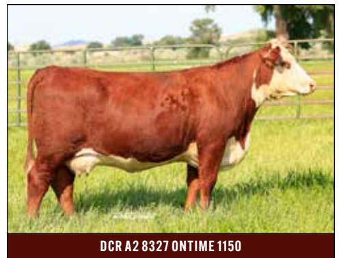
DCR A2 8327 ONTIME 1150 sold to J&L Cattle Services