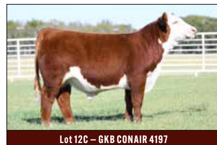
Lot 12C – GKB CONAIR 4197