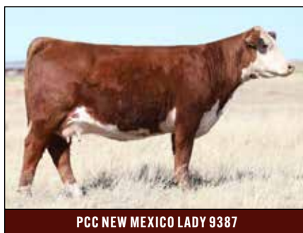
PCC NEW MEXICO LADY 9387