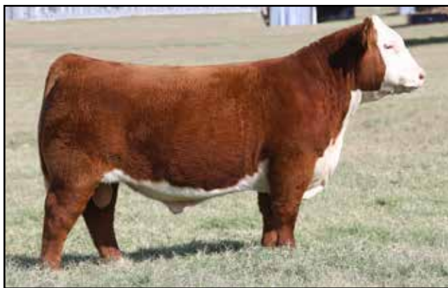
Lot 18A – BK MONEY MAN M52 ET