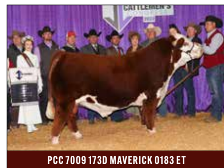
PCC 7009 173D MAVERICK 0183 ET