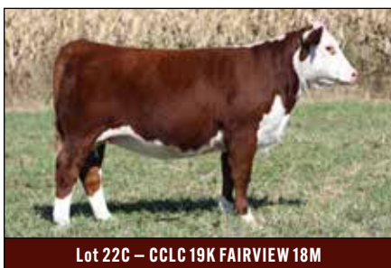
Lot 22C – CCLC 19K FAIRVIEW 18M