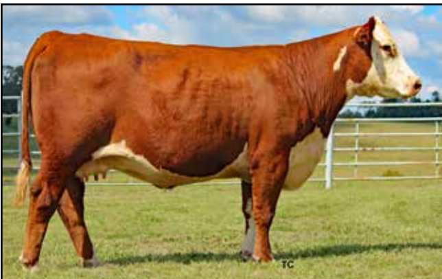
FTF MS FRONTIER 910G

Service sire of many of the females available