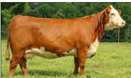
WALKER LASS X51 Y479 333