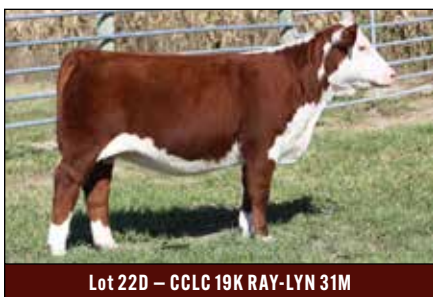
Lot 22D – CCLC 19K RAY-LYN 31M