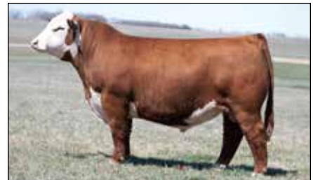
KJ 7603 ELEMENT 019L ET