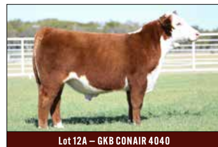
Lot 12A – GKB CONAIR 4040