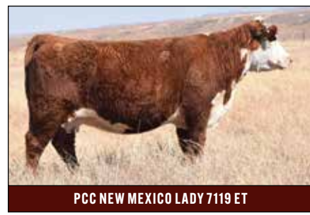
PCC NEW MEXICO LADY 7119 ET

Dam of Lots 23B & 23C, and Grandam of Lots 23A and 23D