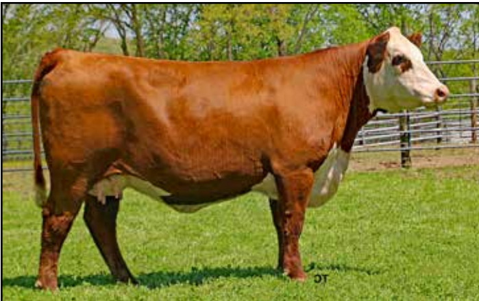
FTF MS MANDATE 136

Selling full interest. Retaining the right to one (1) flush at our expense and new owner's convenience. Winning bidder can double their bid and take both choices.