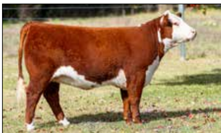
Lot 11 — MJC GFJ LAVISH 26L