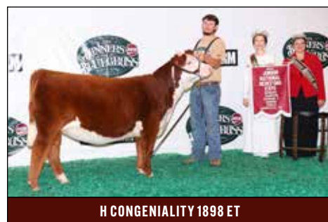
H CONGENIALITY 1898 ET

1/5 HOFFMAN R-A-N-C-H modern, stout, functional