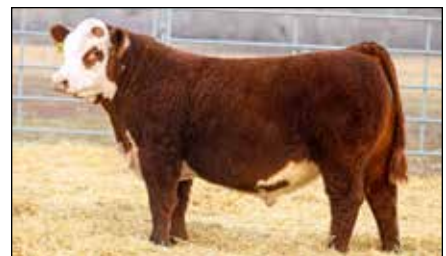
CHURCHILL LAREDO 3146L ET