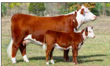
Lot 9A — MCJ GFJ SAVANNAHS KARMA 26K ET and Lot 9B — MJC GFJ MILLIE 21M

One for everyone in this offering! The choice of the GKB PSC KGB Outlier 2-year-old cow, her Green JCS Makers Mark heifer calf, a spring bred heifer sired by Loewen Genesis, and a Churchill Majestic fall bred heifer. Jensen Cattle retains the right to two (2) flushes on any of these females selling.