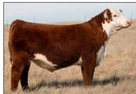
Lot 23B - RPC 7119 THOMAS COUNTY 429 ET