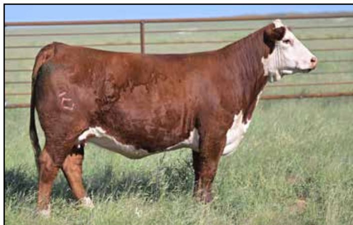
Lot 4 – PCC NEW MEXICO LADY 2380

44093044 PCC NEW MEXICO LADY 5102 (DLF,HYF,IEF)