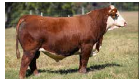
Lot 15C – INNISFAIL FAIRWAY 2335 ET