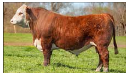
L III EFBEEF TALL GRASS 2017