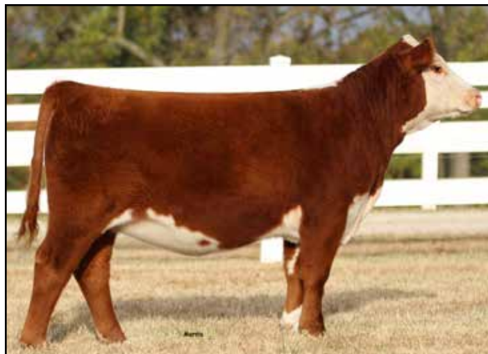
Lot 17 – BB 1015 MACEY 202M ET