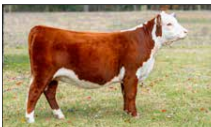
Lot 10 — MJC GFJ SAVANNAHS LATTE 16L ET