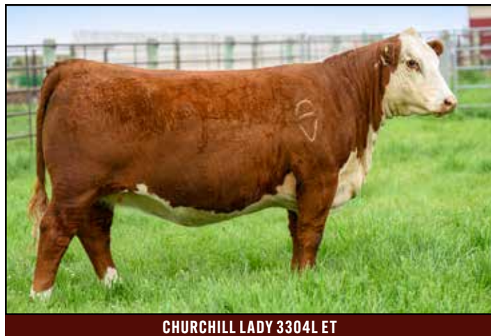
CHURCHILL LADY 3304L ET

P44149828 JDH AH MERCEDES 11E ET (DLF,HYF,IEF,MSUDF,MDF,DBF)