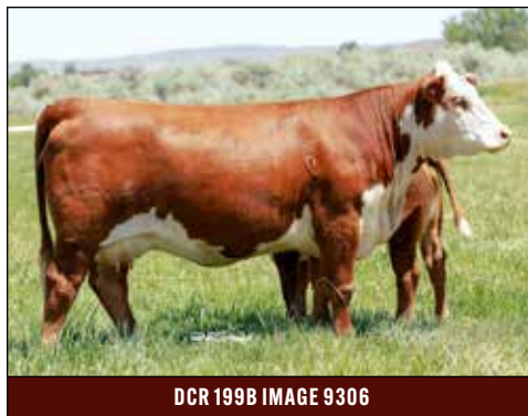
DCR 199B IMAGE 9306 sold to Cottage Hill Farms