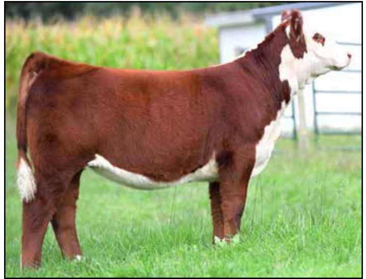
Lot 10 TH MGT Miss Alessia 2410 ET

P43889315 H JT DELHAWK ANNSLEY 2140 ET {DLF,HYF,IEF}