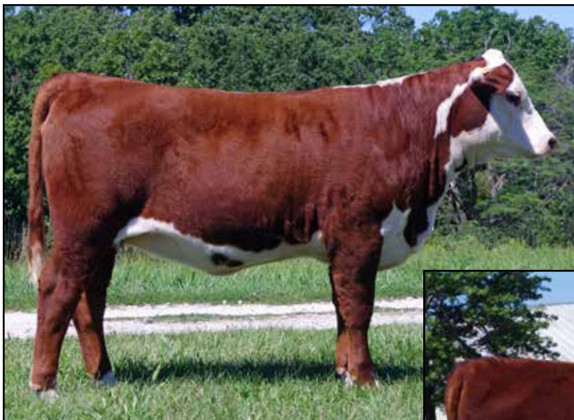
Lot 6 K7 234 Lass 2412