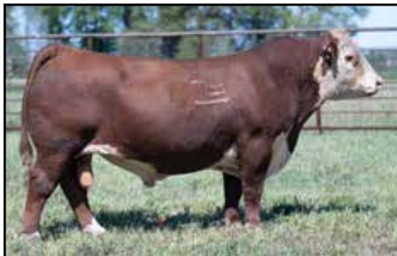
RST Final Print 0016 Service Sire of Lot 23