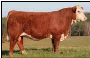
KCF Bennett Dominion K510