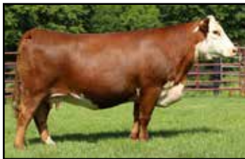
EXR Gemini 7233 ET