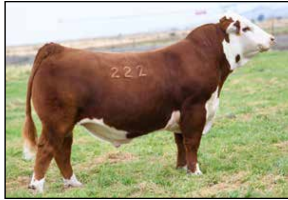
Stellflug Gunsmoke 222 ET Service Sire of Lot 22