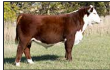
KJ GKB 364C Impact 249J ET