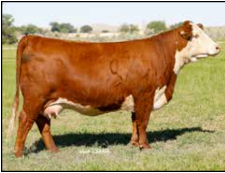
DCR 376 Ella 9205 sold to Chapman's