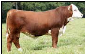
111F Next Level ET

Sired by the new and upcoming Hereford sire from Knoll Crest Farm. The donor "7233" sold in our recent sale to 7 Oaks Plantation, Georgia.