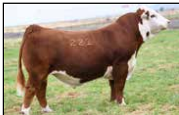
Stellpflug Gunsmoke 222 ET