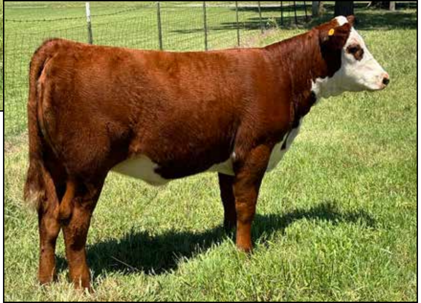
Lot 13 WQF 1654 Melinda 5M