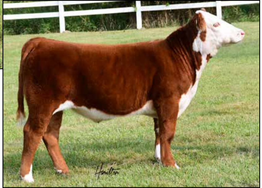
Lot 15 TS Montana 424