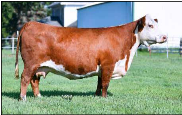
AH 719 Belle 125B Donor Dam of Lot 26A