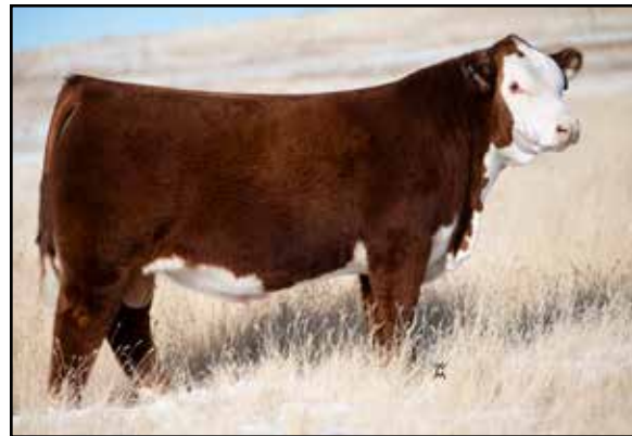
CSC 701 Oshoto 316 Service Sire of Lot 24B