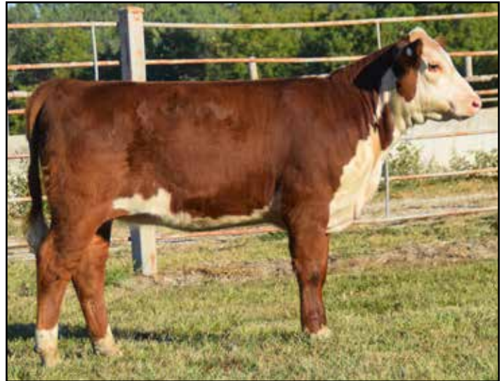
Lot 11 VO Blessed Emerson 4192 ET

P44298993 MAV BLESS YOU 638D ET {DLF,HYF,IEF}