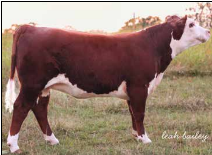
Lot 8 5-D 73G Elli 2401M