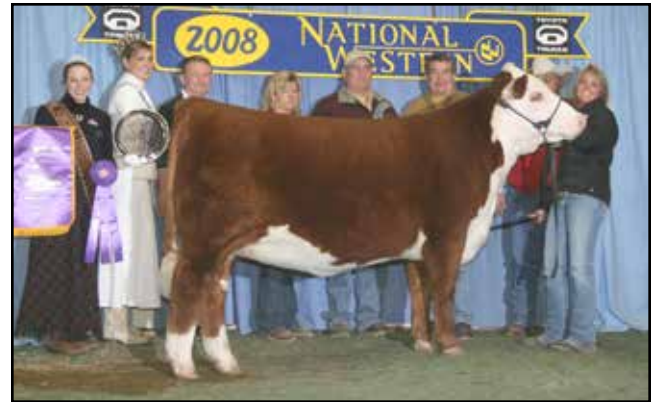
Star KKH SSF Valedictorian ET Donor Dam of Lot 26B