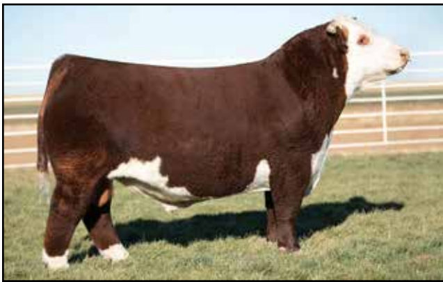
BR GKB Winchester 1314 Service Sire of Lot 26A