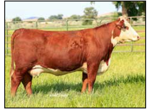
DCR A2 8327 Ontime 1150 sold to J&L Cattle Services

Females of this caliber represents the depth of Lot 16!