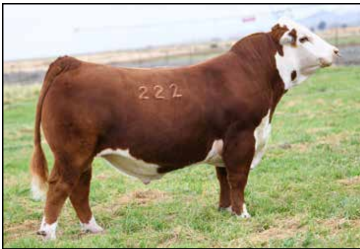
Stellpflug Gunsmoke 222 ET Service Sire of Lot 21A