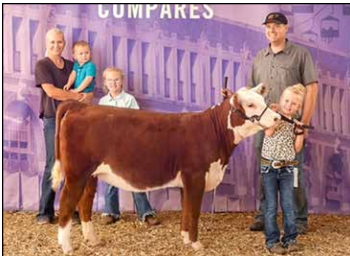
Lot 9 SL Miss Huston 2418