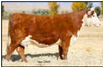
DCR 128D Dominet 9233 ET