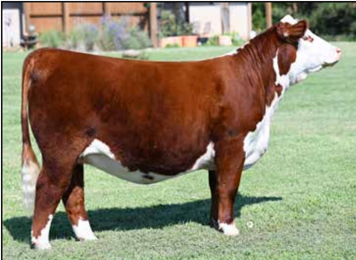
Lot 17 JB Lucy 50L

Video of heifer available on Herefords On Demand (HOD).