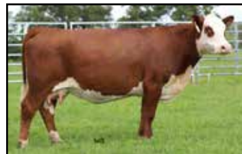
WLKR AXA DB Miss 173D W19 043H