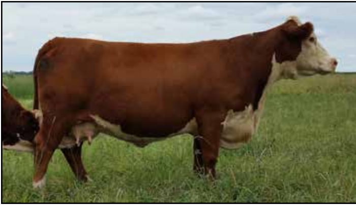
AH MS 25L Rumbler 19Z Donor Dam of Lot 22