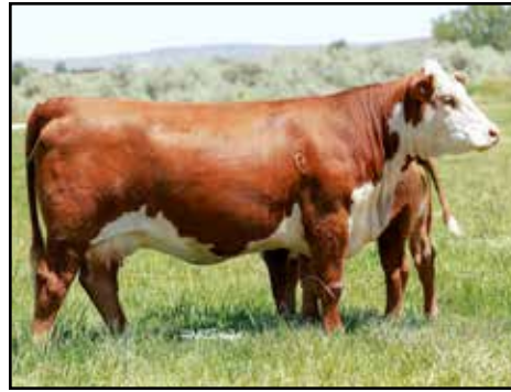
DCR 199B Image 9306 sold to Cottage Hill Farms