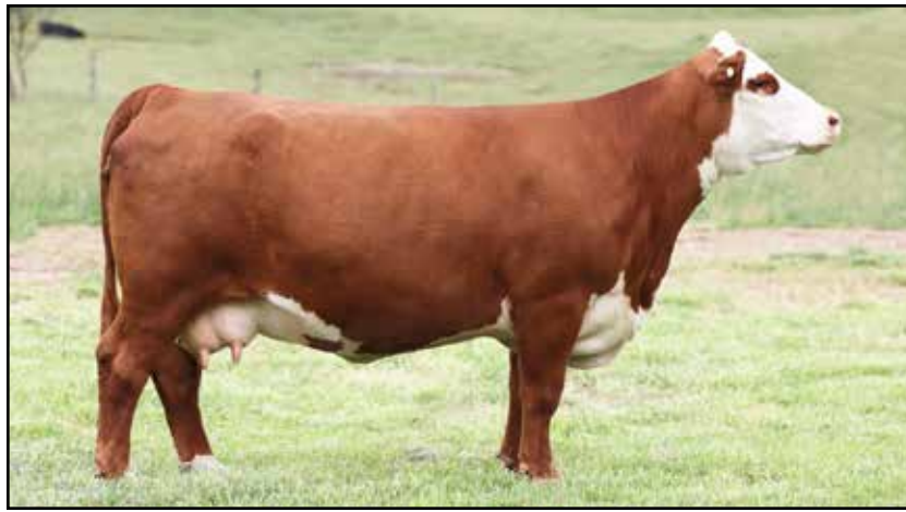
Green 11E Mercedes 228G ET Donor Dam of Lot 24