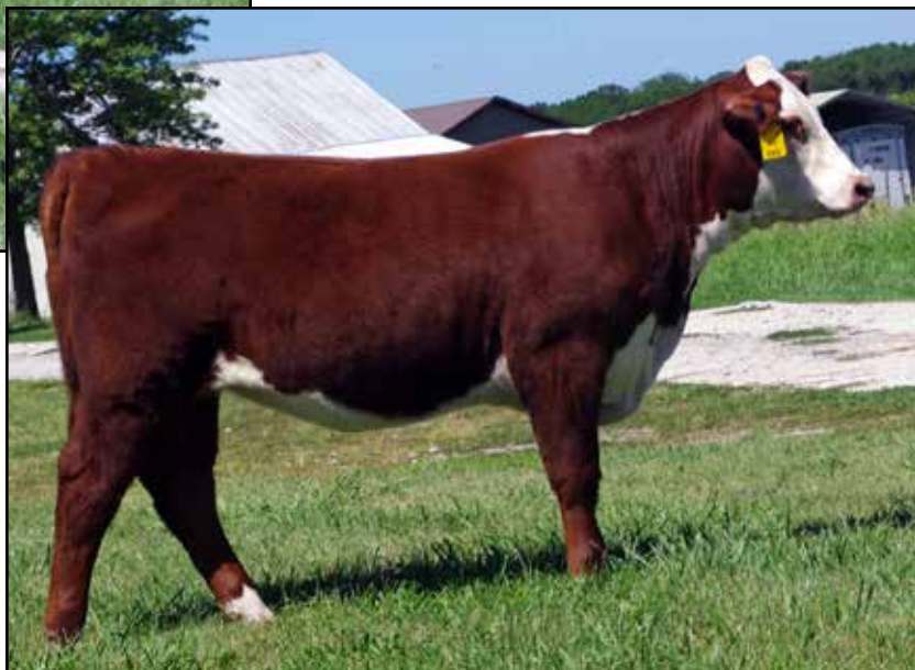
Lot 7 K7 309 Lass 2425