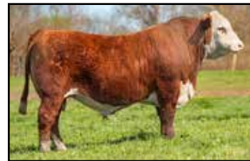
L III EFBeeF Tall Grass 2017