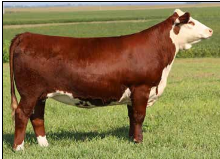
Lot 19 GG MS Redbird 313L

Video of heifer available on Herefords On Demand (HOD).