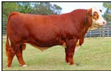
Huth CLC WF Deluxe K016