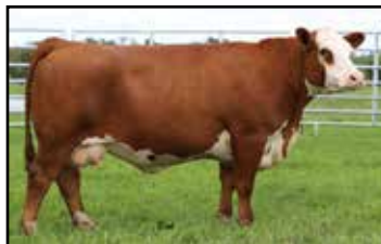
WLKR FAF Lass 332 6D 975G