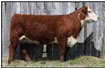
DCR 376 Ella 9257 ET