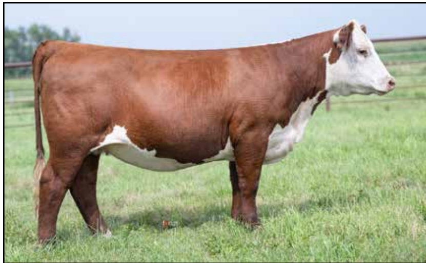
JDH AH 8032 MS Lincoln 125L ET Donor Dam of Lots 21A & 21B