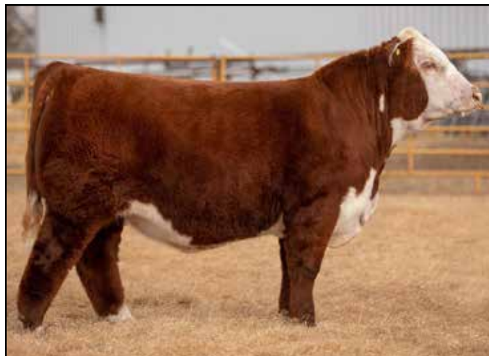
JDH AH Lincoln 106H ET Sire of Lot 18