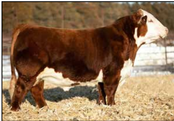
H The Profit 8426 ET Service Sire of Lot 24A