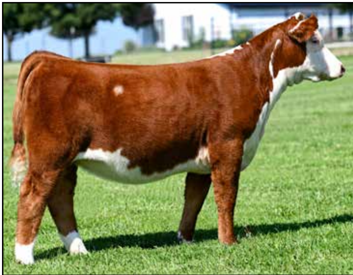
Lot 5 CW Kelly 4010

HEIFER 44585012 | Calved: 3/22/24 | Tattoo: BE 4010