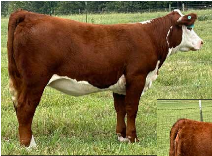
Lot 12 WQF 3J Classic Libby 3M