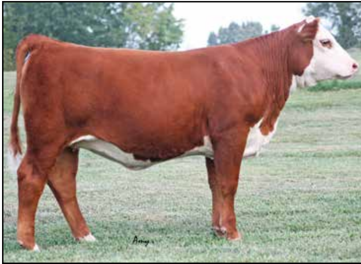
Lot 4 DOSS H086 Tilly DHM15

HEIFER P44538462 | Calved: 1/16/24 | Tattoo: BE DHM15