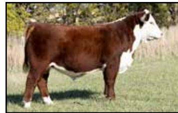
KJ GKB 364C Impact 249J ET