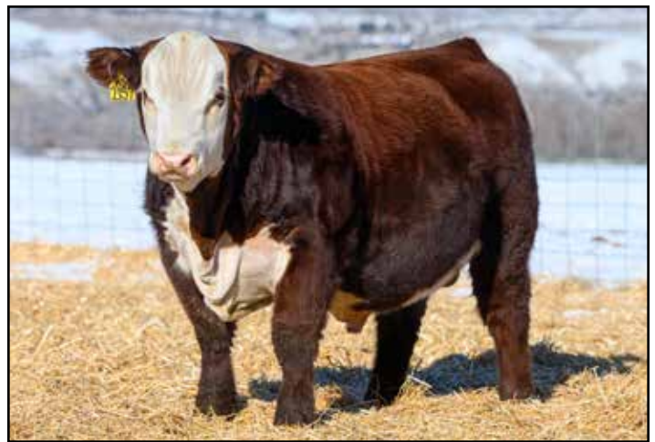
Churchill W4 Sherman 2157K ET Service Sire of Lot 21B