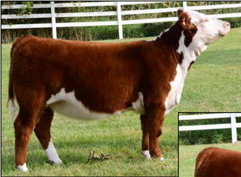
Lot 14 SAS MS Maddie 28M