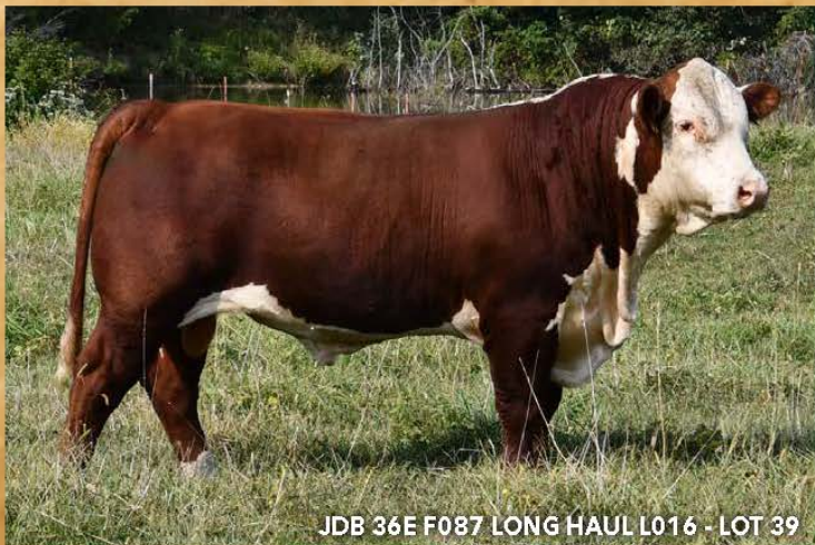
JDB 36E F087 LONG HAUL L016 - LOT 39