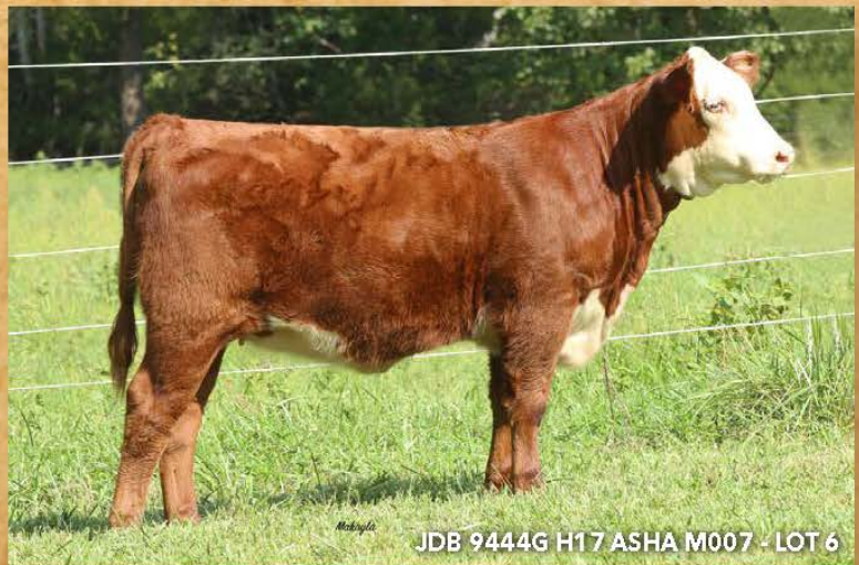
JDB 9444G H17 ASHA M007 - LOT 6