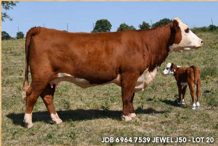
JDB 6964 7539 JEWEL J50 - LOT 20