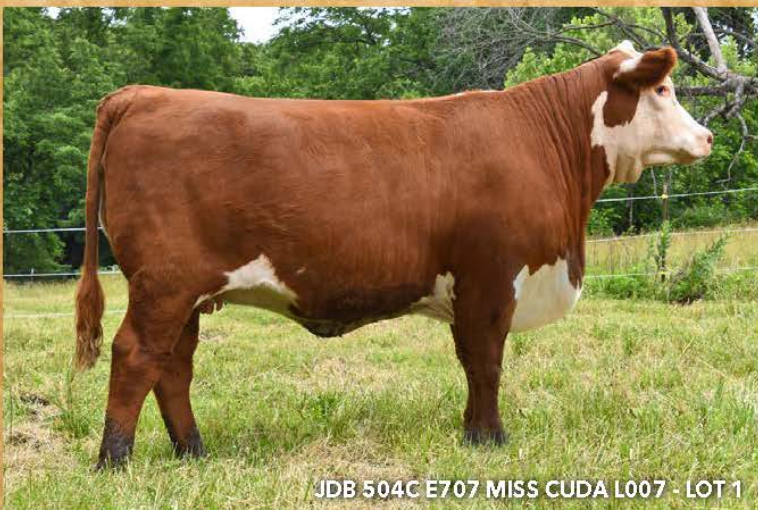
JDB 504C E707 MISS CUDA L007 - LOT 1

SATURDAY, OCTOBER 12 • 1:00 P.M. • AURORA, MO