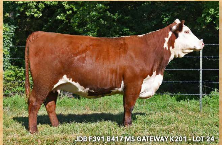
JDB F391 B417 MS GATEWAY K201 - LOT 24