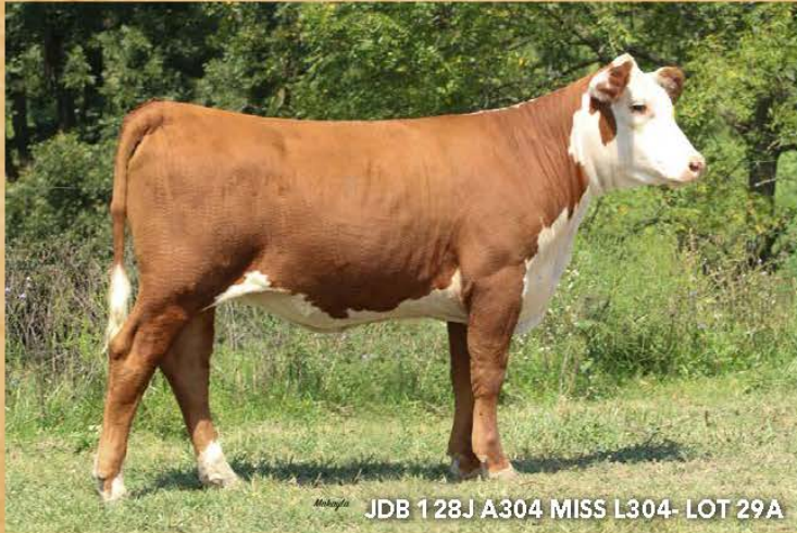
JDB 128J A304 MISS L304- LOT 29A