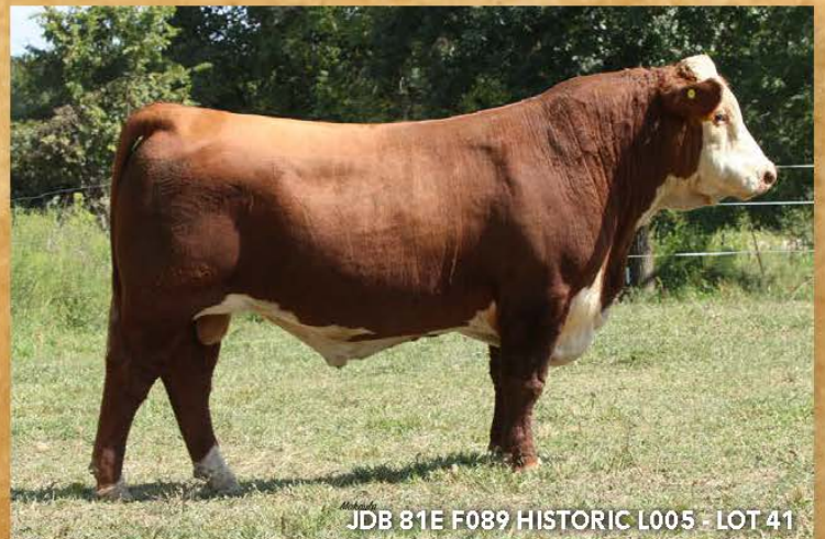
JDB 81E F089 HISTORIC L005 - LOT 41