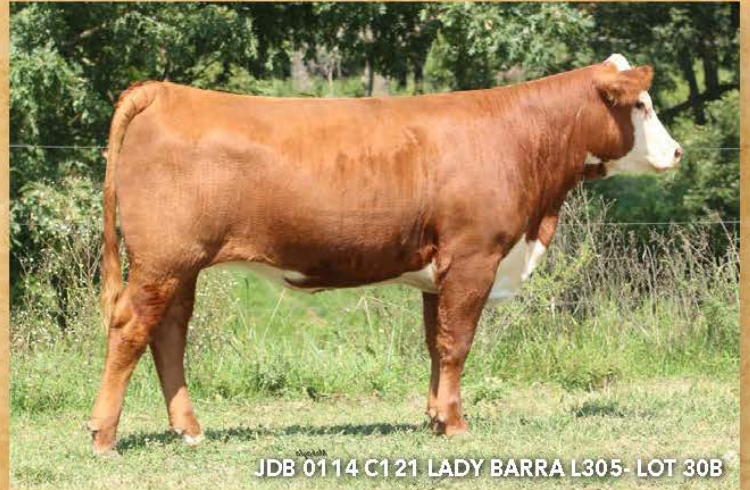
JDB 0114 C1 21 LADY BARRA L305- LOT 30B