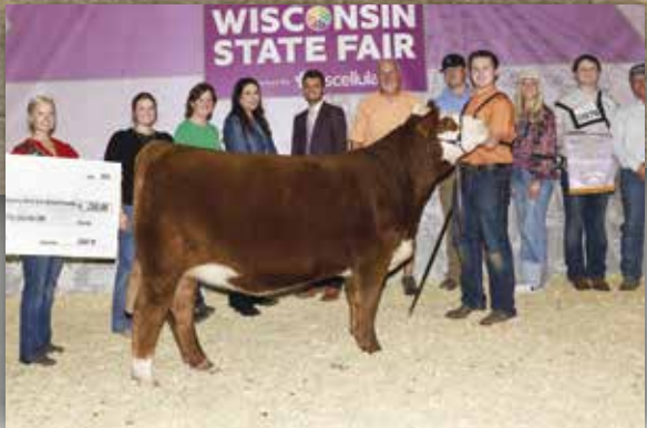
2024 WISCONSIN STATE FAIR - RESERVE SUPREME B&O, THIRD OVERALL OPEN SHOW