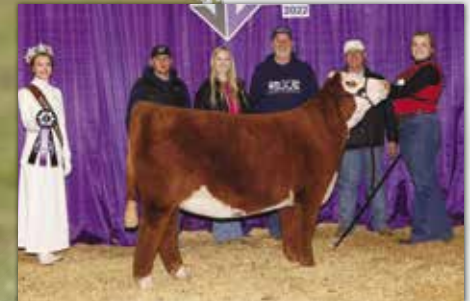
2022 CATTLEMEN'S CONGRESS

Not only does this cow have the big three – Pedigree, Phenotype and Maternal traits – she is proving herself as a dam and transmitting her genetics. Her Red Kingdom bull was a division winner at Junior National and wait until you feast your eyes on her 3 Marksman calves selling as lots 8, 9A, & 9B. They are sale features! We don't sell IVF Aspirations on our donors very often, so take advantage of these cutting-edge genetics. Terms of IVF Aspiration will be available on sale day or upon request.