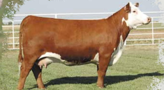
BR BELLE 4082 ET - DAM OF LOT 14