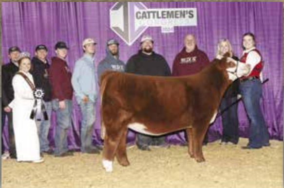
2024 CATTLEMEN'S CONGRESS JR SHOW - JUNIOR CALF CHAMPION