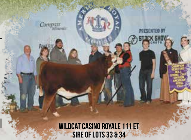
WILDCAT CASINO ROYALE 111 ET SIRE OF LOTS 33 & 34

AI'd to BAR STAR Fresh Prince 018 ET with heifer sexed semen; pregnancy due 3/5/25