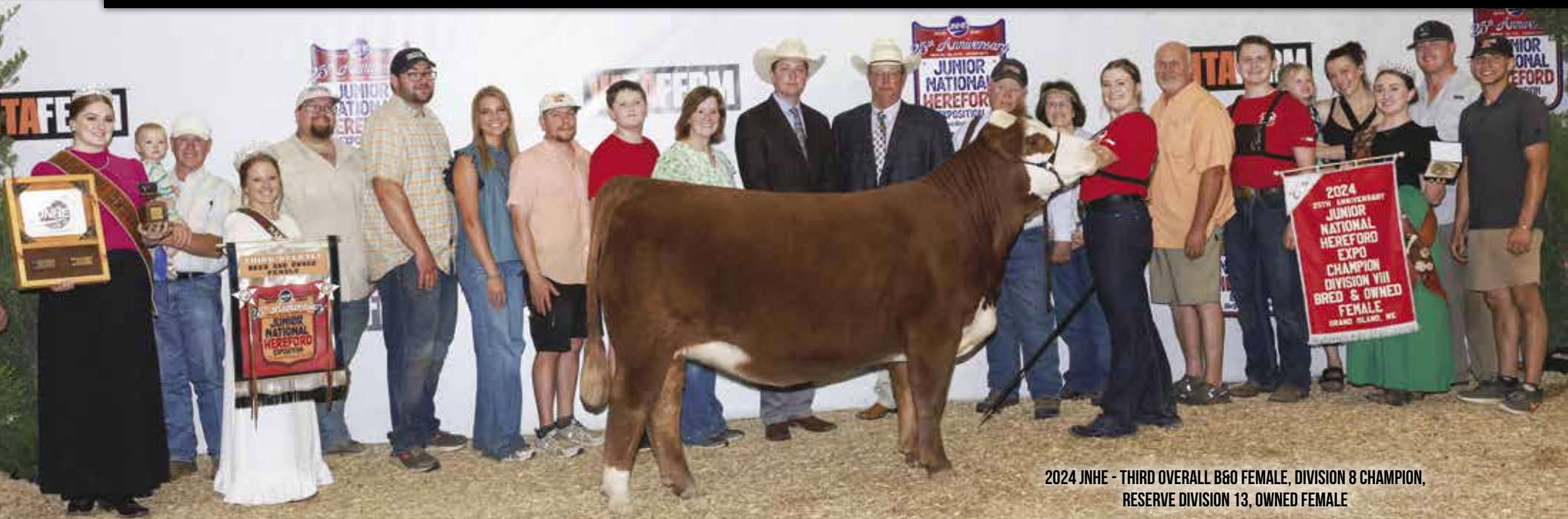
2024 JNHE - THIRD OVERALL B&O FEMALE, DIVISION 8 CHAMPION, RESERVE DIVISION 13, OWNED FEMALE