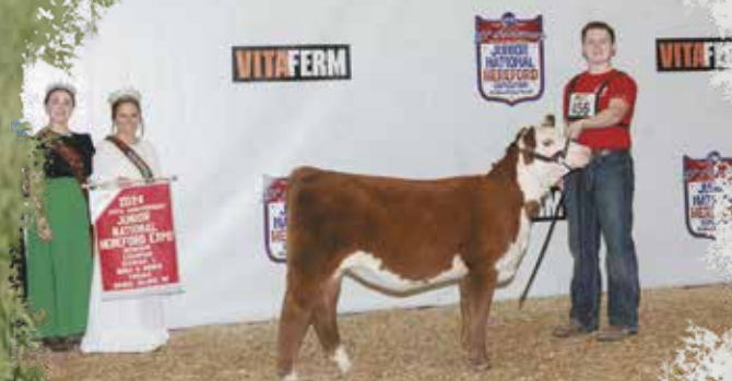
LOT 11 - RESERVE CHAMPION DIVISION 1 JNHE BRED-AND-OWNED FEMALE