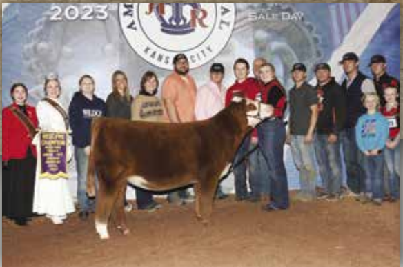
2023 AMERICAN ROYAL - RESERVE JUNIOR CALF CHAMPION