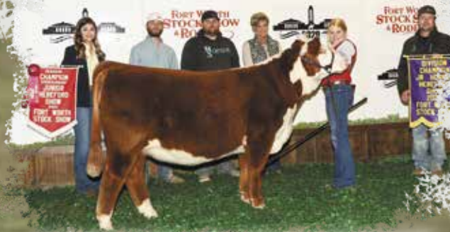
WILDCAT POETRY 950 ET - 2020 JR CALF CHAMPION FORT WORTH DAM OF LOTS 11, 12 & 13