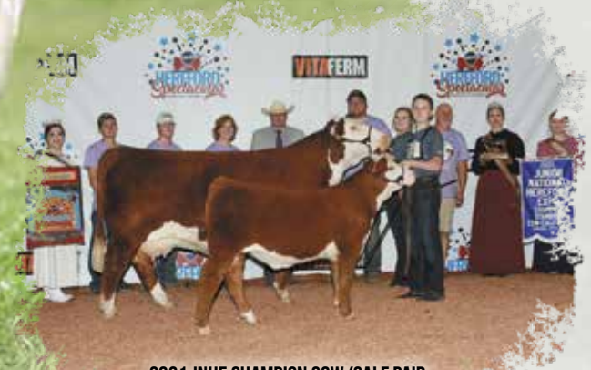
2021 JNHE CHAMPION COW/CALF PAIR