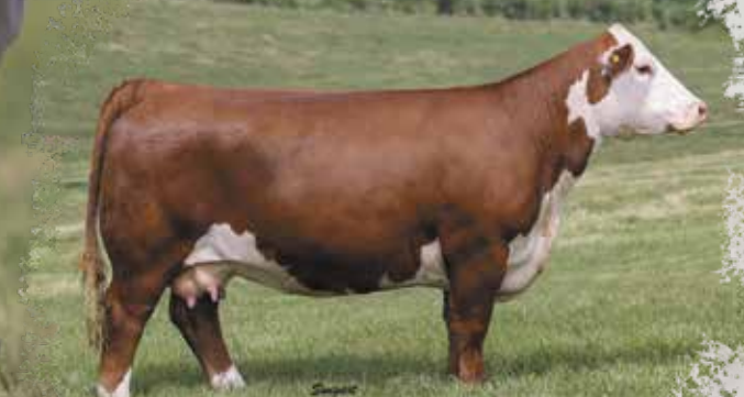
DELHAWK CALLEN 48G ET - DAM OF LOTS 5 & 6