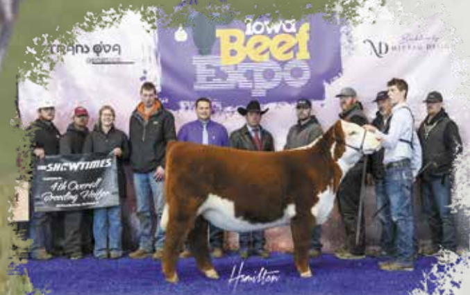
WILDCAT VIVID 2384 ET - 4TH OVERALL IOWA BEEF EXPO - KINNICK PAULSEN FULL SISTER TO LOT 1