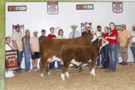
2024 JNHE RESERVE CHAMPION COW-CALF PAIR