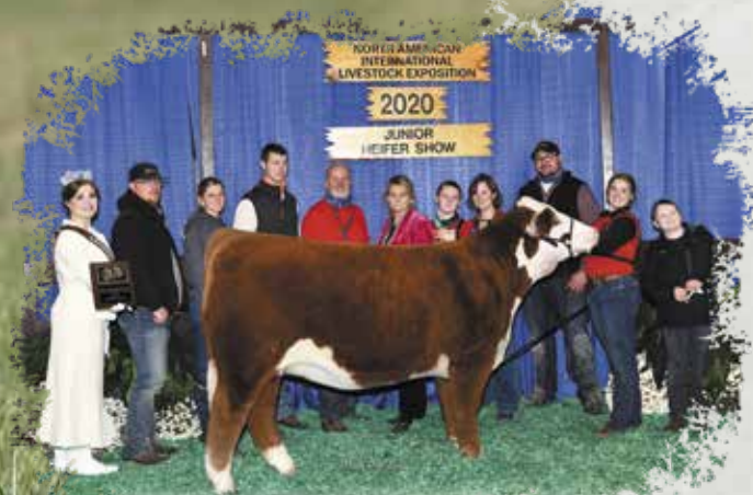
2020 NAILE RESERVE CHAMPION FEMALE, JUNIOR SHOW DAM OF LOTS 5 & 6