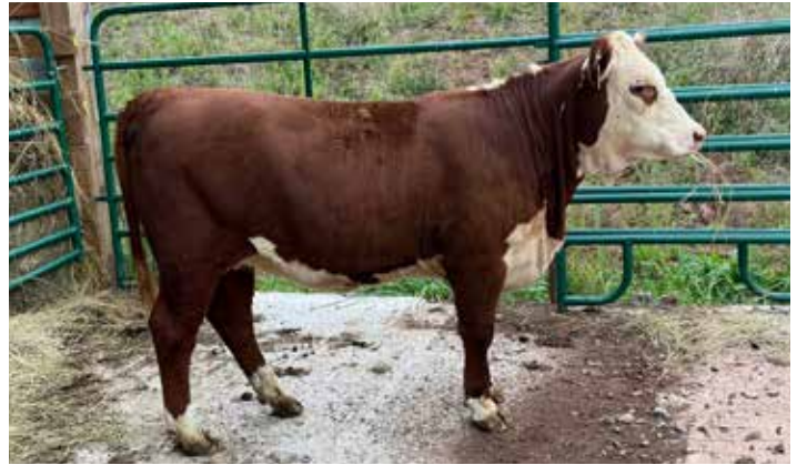
Lot 4 — JW 1939 E32 MS TRADEMARK L20