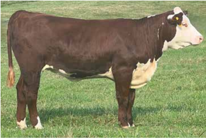
Lot 7 — CB LL MISS LEAH 644