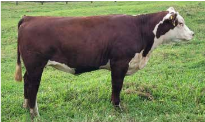
Lot 8 — CB LL MISS LAINEY 645