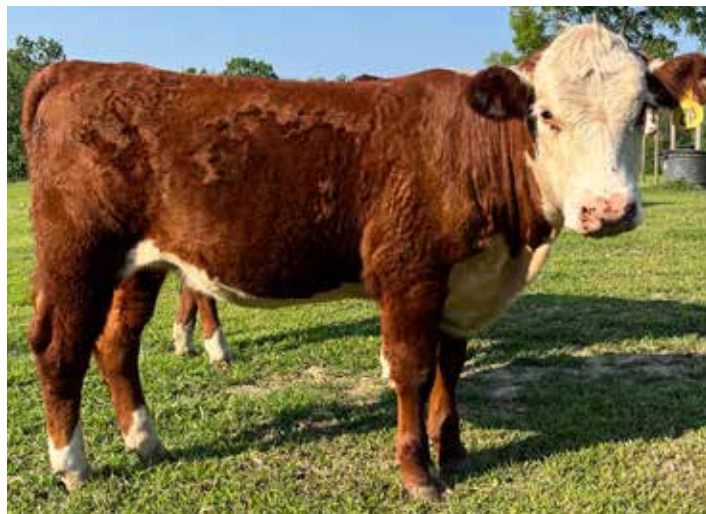
Lot 10 — TRF MISS BELLE 020