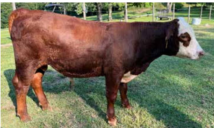
Lot 9 — TRF MR.DUKE 010