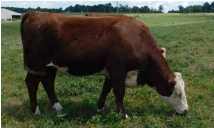
Lot 16 — GHF MS MARSHALL 33Z 997 L321