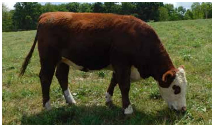
Lot 18 — GHF MS GAMBLER 68E J103 L350