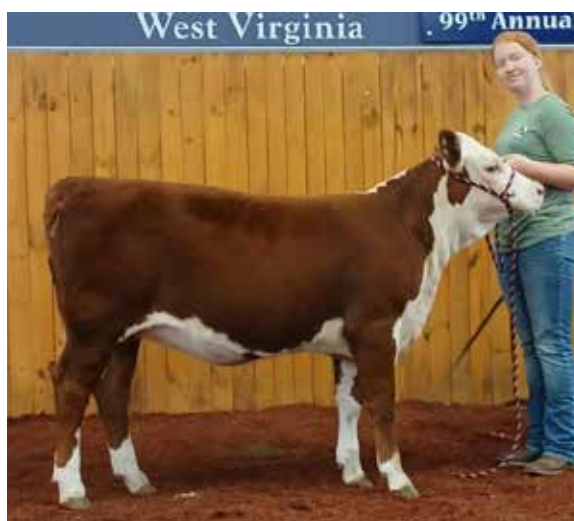
Lot 33 — LPRF 183F 903G BONNIE 404M