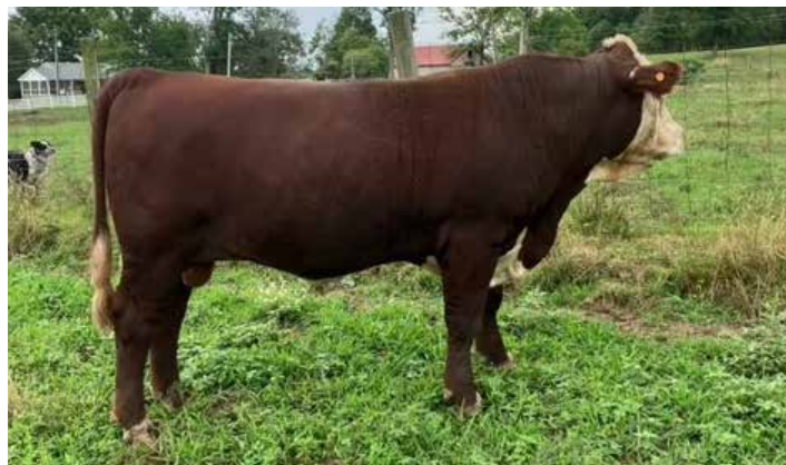
Lot 19 — GHF MR UPTOWN D608 870 L339