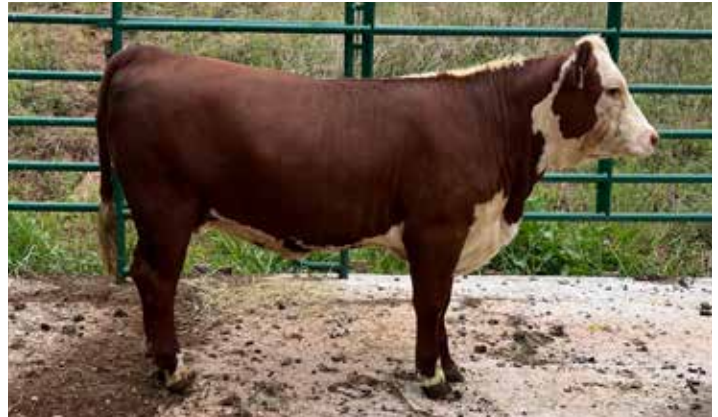
Lot 5 — JW J29 E37 MS MASTERPLAN L23