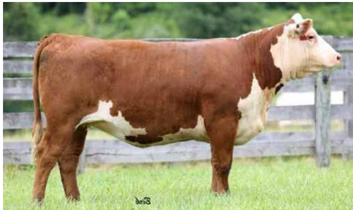
Lot 29 — MJG LEMON DROP 114