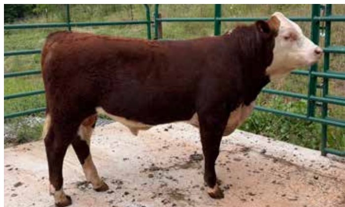
Lot 2 — JW 569G B19 GOLDRUSH L18