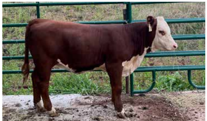
Lot 6 — JW 504C J25 MS CUBA M10