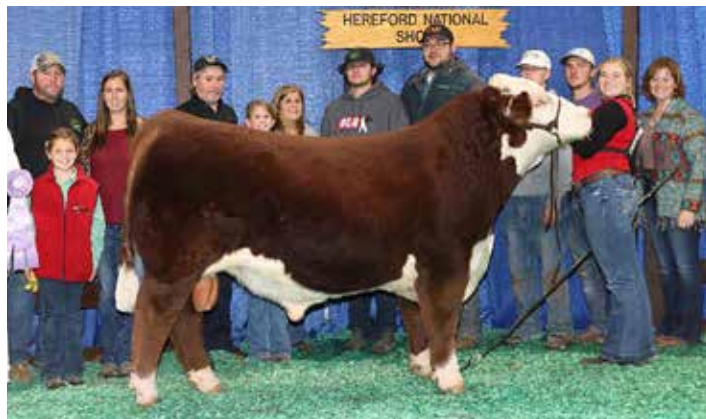
WILDCAT MF EL CHAPO 013 — Sire of Lots 29A, 31 &amp; 32