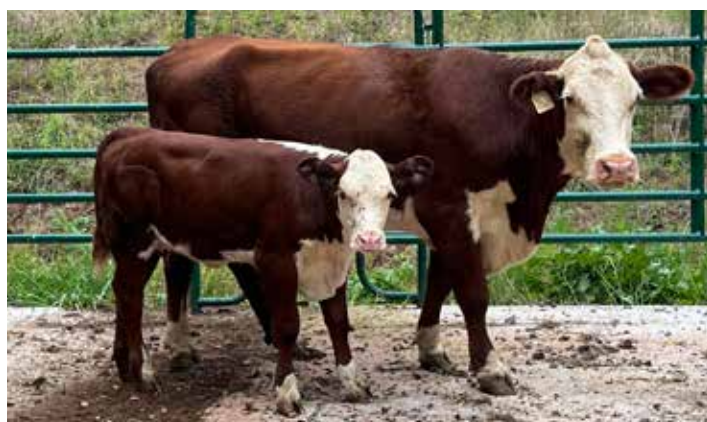
Lot 3 — JW 84F B32 MS PERFECTO J20