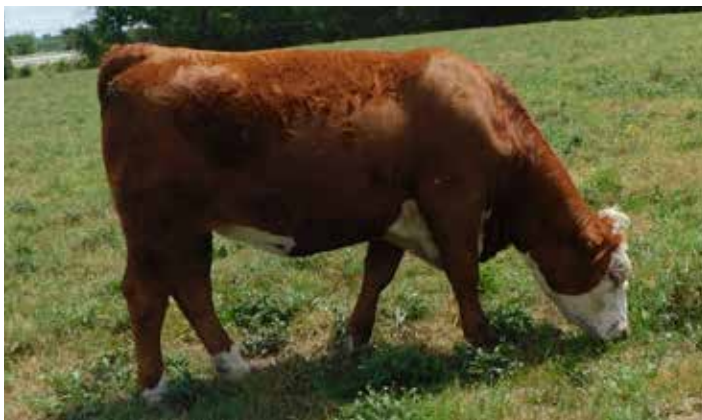
Lot 17 — GHF MS GAMBLER 33Z J151 L346