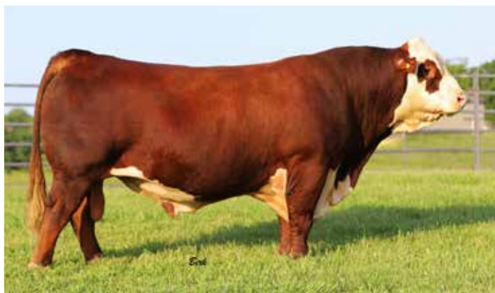
CMF 1720 GOLD RUSH 569G ET — Sire of Lot 2