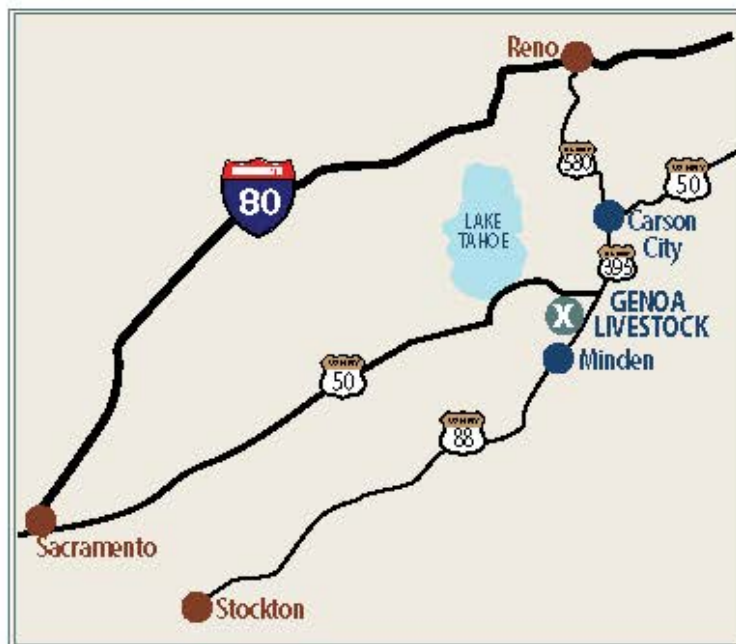
640 Genoa Lane, Minden, NV is located just off Highway 395 which can be reached via 580 South from Reno; Highway 50 or Highway 881 from California