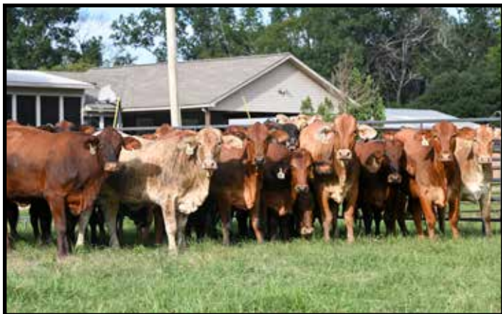
Lot C - 25 Bred F1 Red Heifers