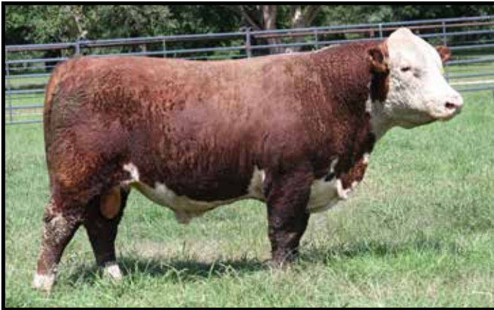
4M MR 88483 MOHICAN 3176