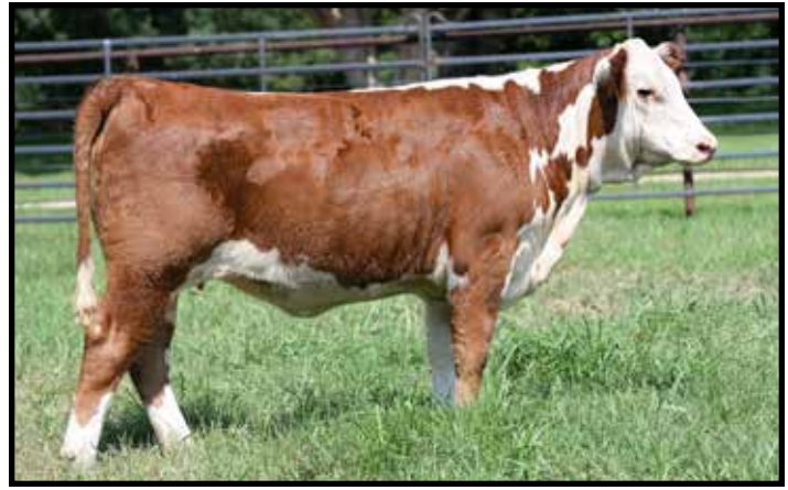
4M MS 221 MONEY 4120