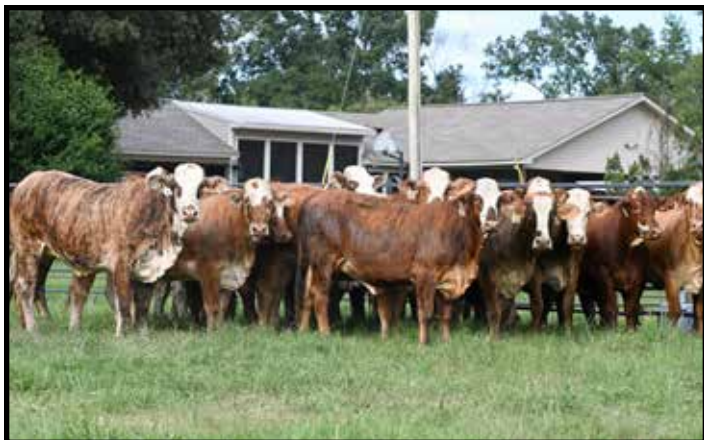
Lot B - 25 Bred F1 Braford Heifers