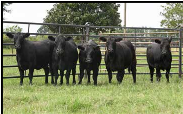
Lot E - 5 Open English Black Heifers