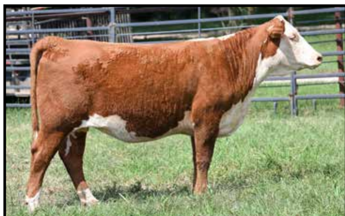
4M MS 88483 ADVANCE 3143