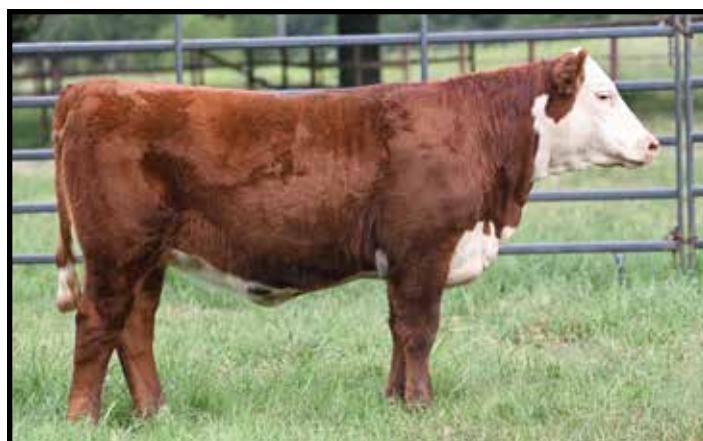
4M MS PEARL DEALER 666 422 ET