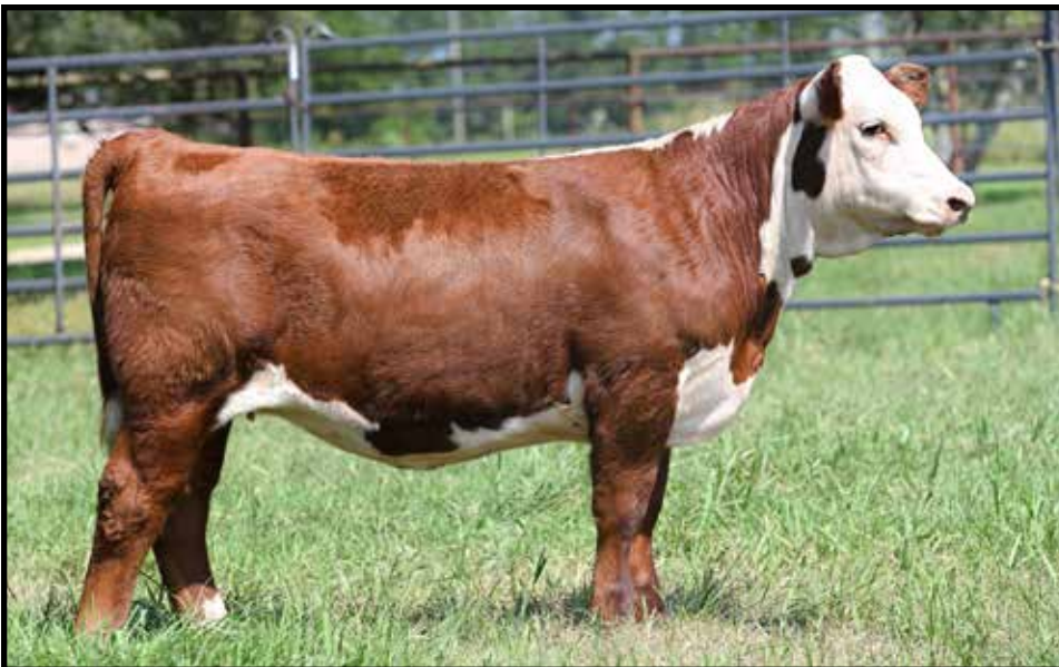
4M MS CATAPULT 235 4134