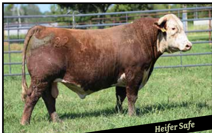
4M MR 9364 HARLEY 3122