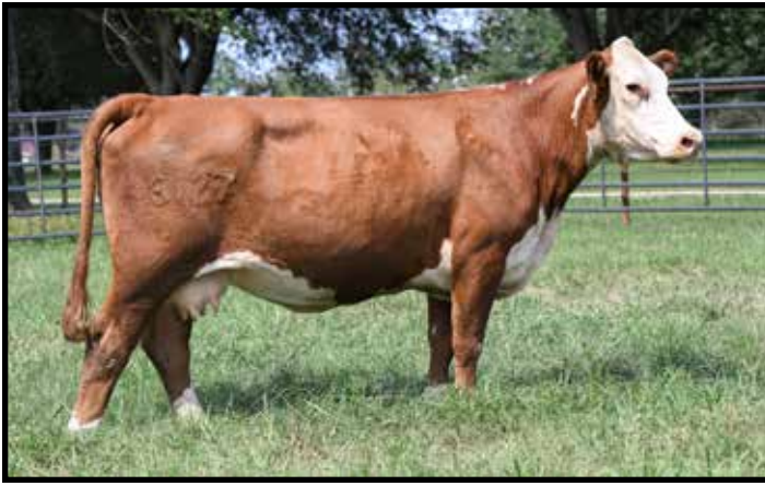
4M MS LEAD YOU TO PURPLE 8127

137 4M MS LEAD YOU TO PURPLE 8127 {DLF,HYF,IEF,MSUDF} COW P43960607 || CALVED: 1/29/18 || TATTOO: LE 8127 POLLED