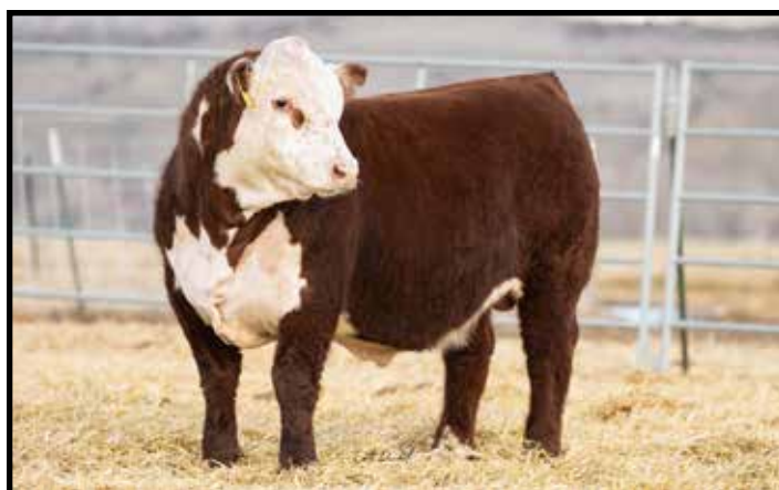
CHURCHILL EQUITY 3316L ET — Sire of Lot 141 Embryos