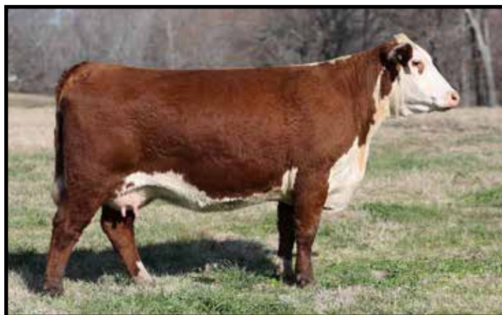
WALKER JH ROSE 215Z 4209 799E — Dam of Lot 141 Embryos