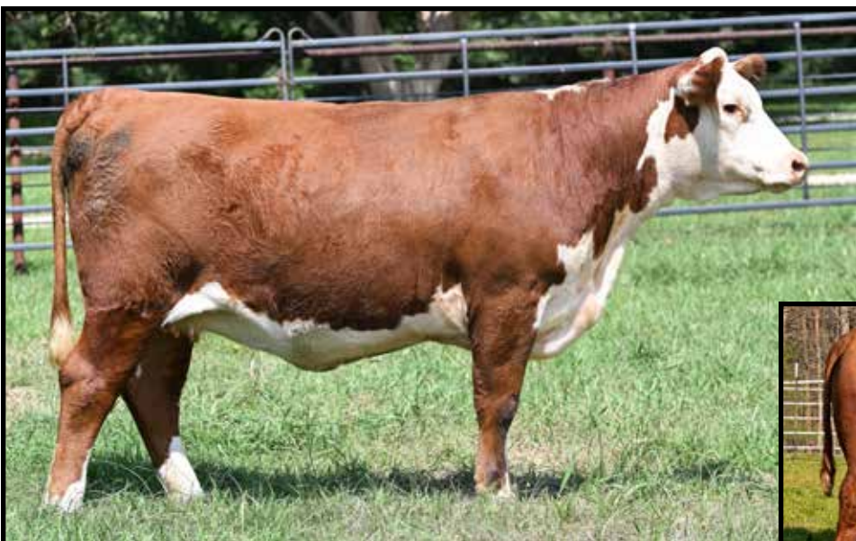
4M MS BEEFY LASS 3151