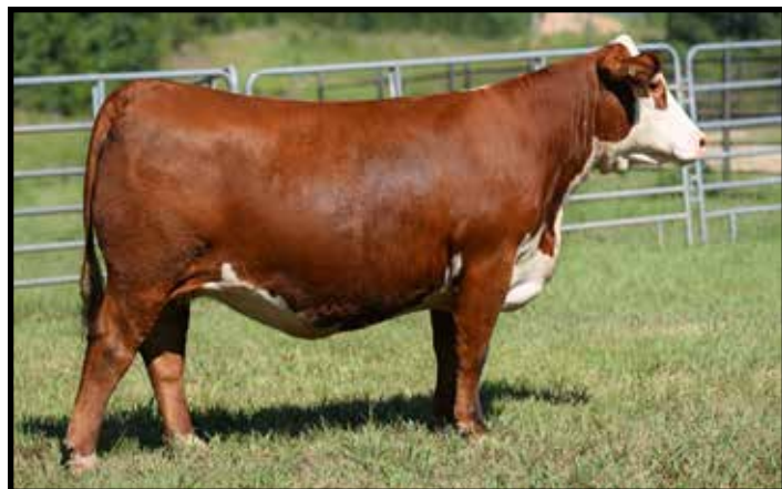
WLKR LF JH ROSE H086 2446 ET — $14,000 daughter of Lot 120