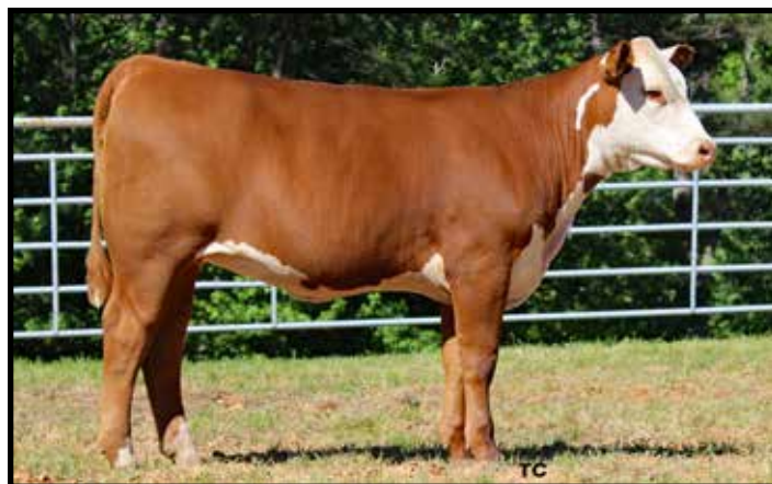
WHR 4013/686 BEEFMAID 235D — Dam of Lot 142 Embryos