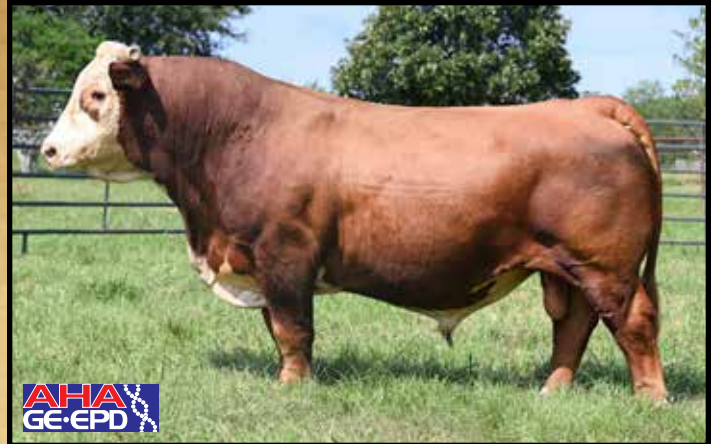
4M 66589 DOMINO 2079ET

Sire of Lots 3111, 3120, 3123, 3128, 3136, 3159, 3168, 3176, 3179, 3180, 3182, 134 & 135