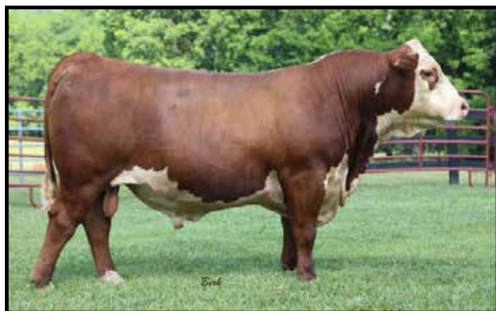
WLKR JH INCENTIVE 799E 0423 — $12,000 son of Lot 120