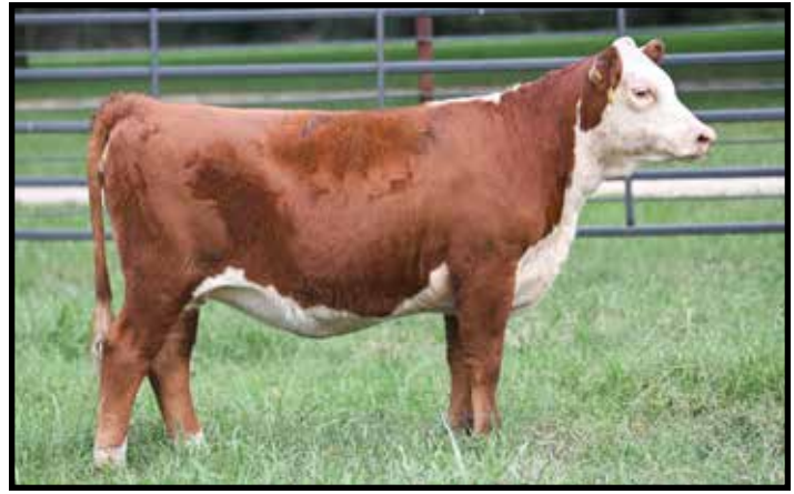
4M MS MAYBELL 2079 434