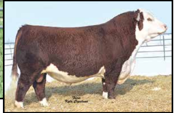
CRR 719 CATAPULT 109 – Sire of Lot 136