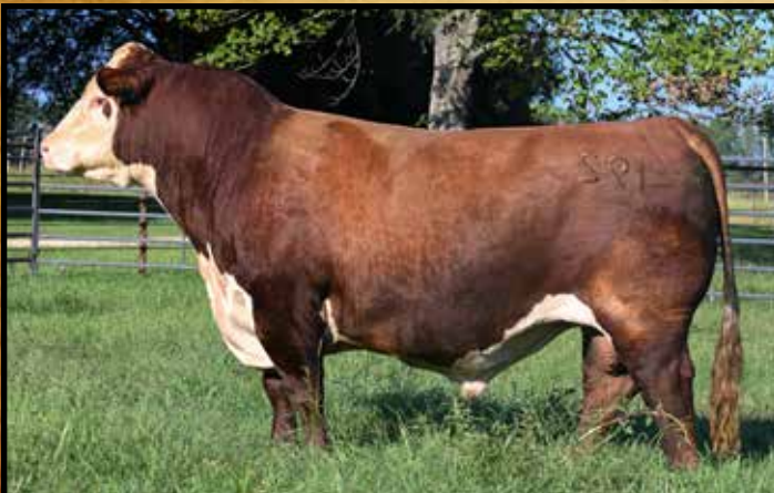
4M MR TRUSTY MAN 719T 192