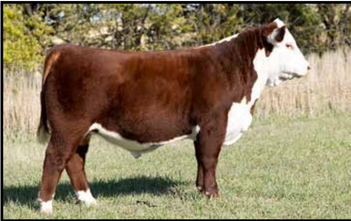
KJ GKB 364C IMPACT 249J ET — Sire of Lot 3117