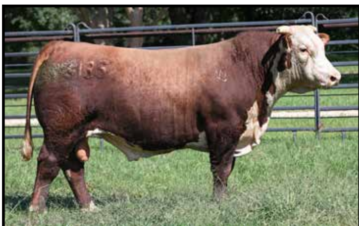
4M MR 9364 DOMINO MONEY 3135