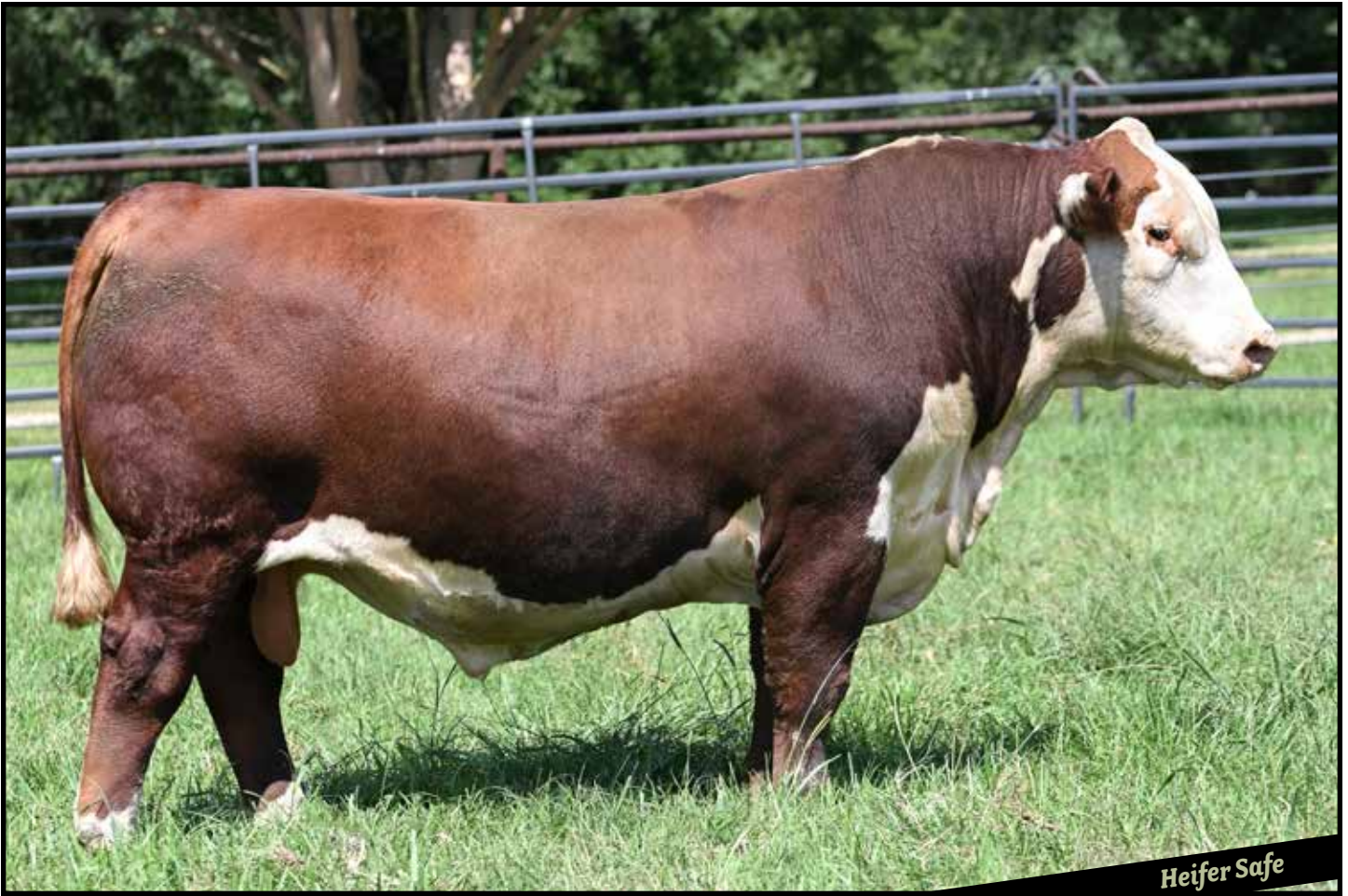
4M MR IMPACT 0208 3117