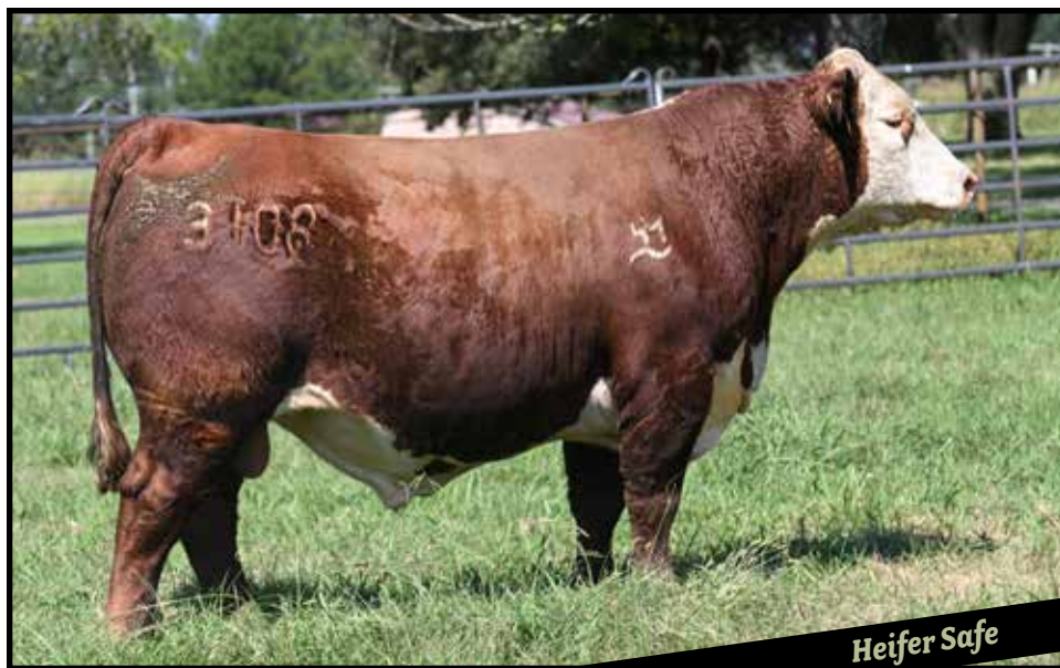
4M MR 2079 DOMINO 007 3108