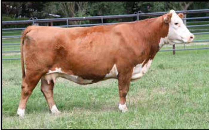
4M MS MONEYD DOMINO 0132

138 4M MS MONEYD DOMINO 0132 {DLF,HYF,IEF,MSUDF} COW 44116368 || CALVED: 1/15/20 || TATTOO: LE 0132 HORNED