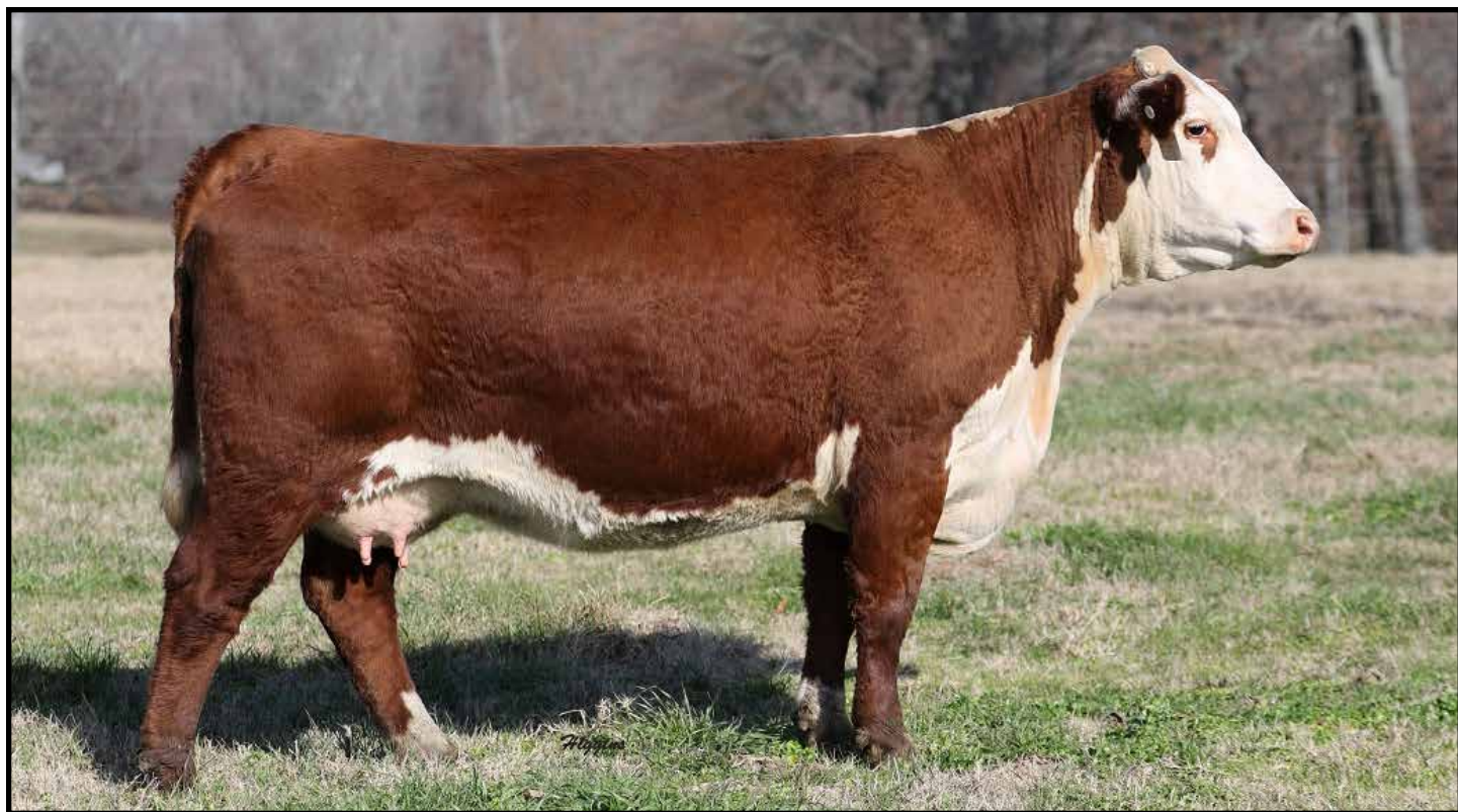
WALKER JH ROSE 215Z 4209 799E