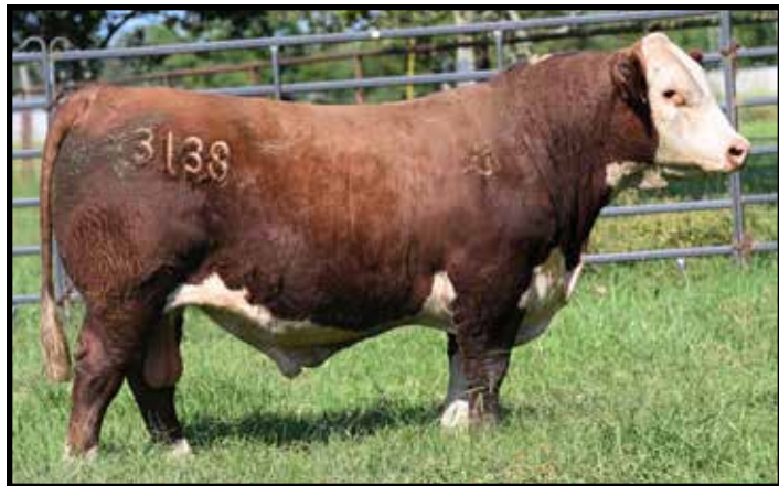
4M MR ENDURE 3138 ET