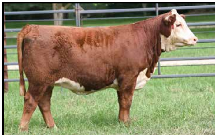
4M MS VICKY 252F 412 ET