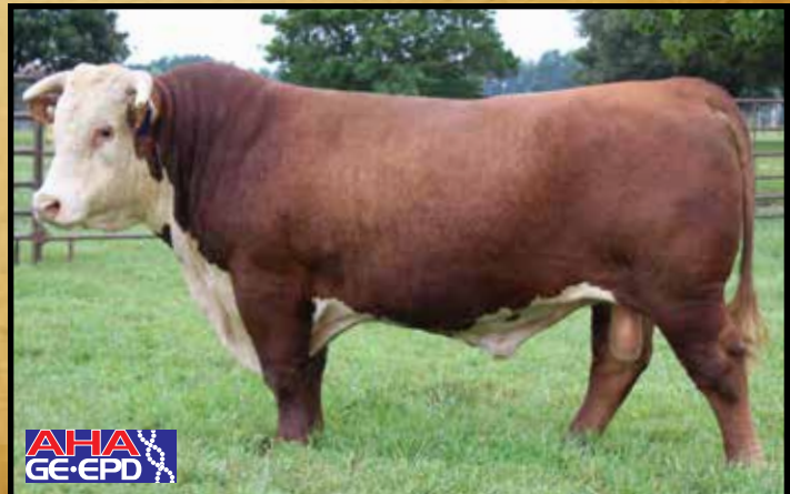
B&D L1 DOMINO 9364 ET

Sire of Lots 398, 3116, 3122, 3135, 3137, 3148, 3161, 3162, 3163 & 3173