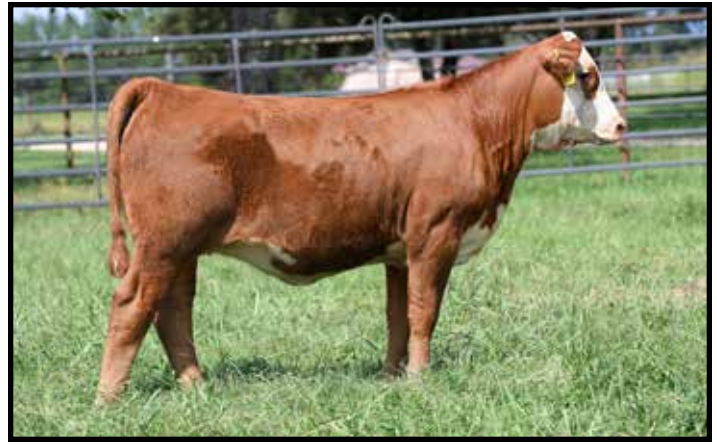
4M MS 2079 LEADER 4133

137A 4M MS 2079 LEADER 4133 {DLF,HYF,IEF,MSUDF} COW 44562209 || CALVED: 2/16/24 || TATTOO: LE 4133 HORNED