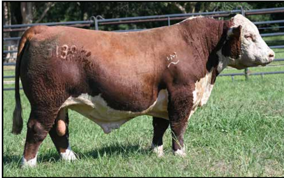
4M MR ENDURE 3139 ET