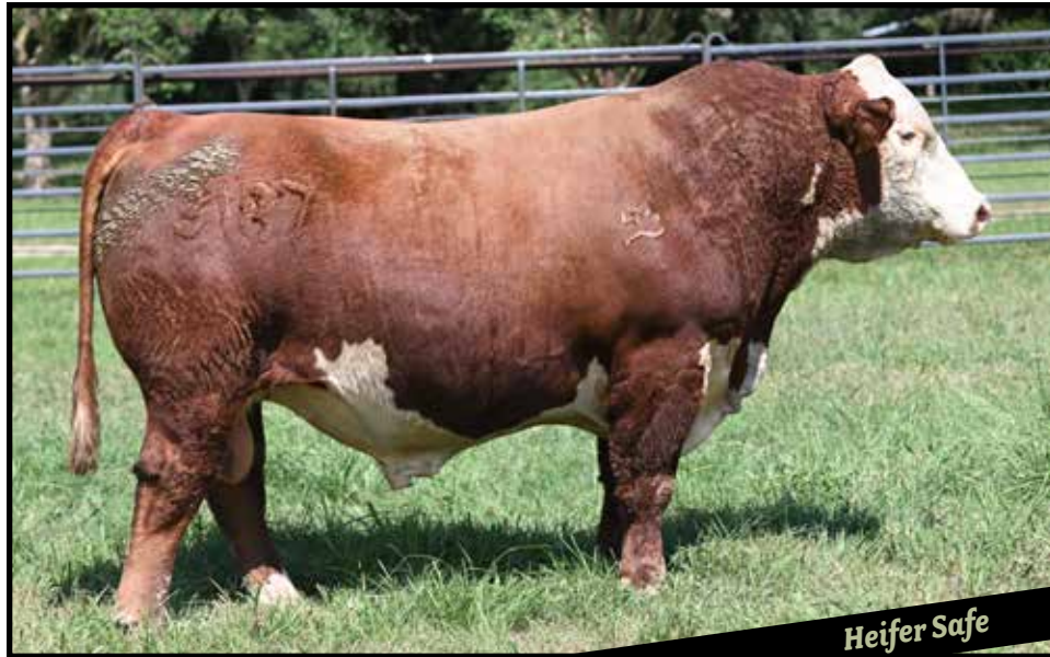
SFCC TRM MERIT 3187

3187 SFCC TRM MERIT 3187 {DLF,HYF,IEF,MSUDF} BULL P44439297 || CALVED: 2/7/23 || TATTOO: BE 3187 POLLED