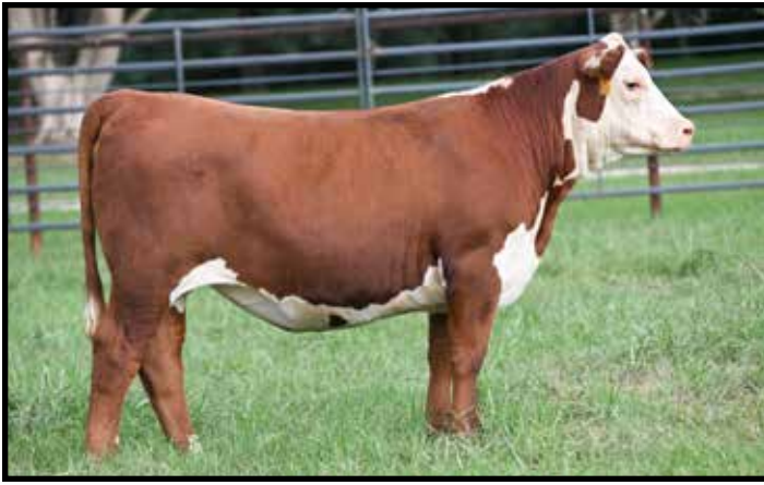
4M MS TRUSTY BEEF LADY 192 415