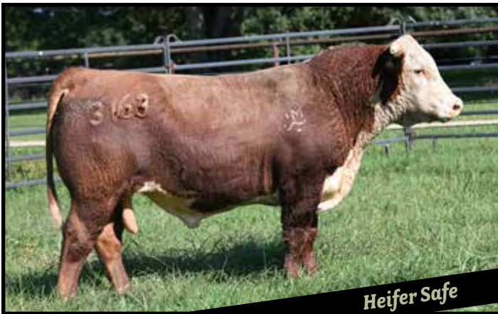
4M MR 9364 DEMO 3163