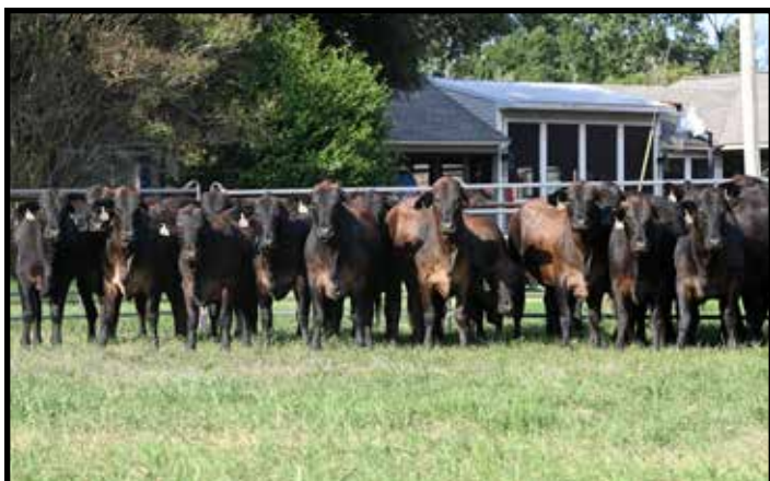
Lot D - 25 Bred F1 Black Heifers