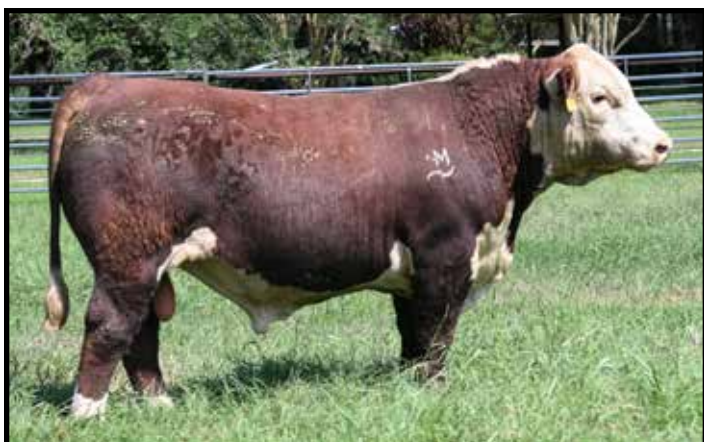
4M MR 18U GOLDEN PEANUT 3131ET