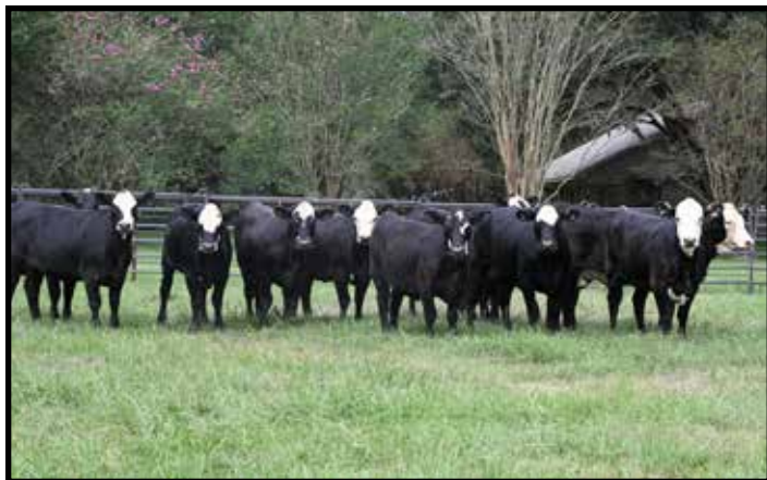
Lot F -12 Open English Black Baldy Heifers