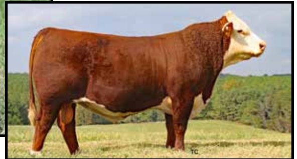
SHF HEADSTRONG D287 H315 ET – Reference Sire