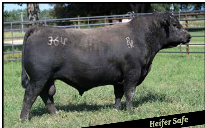
RM MR COMMAND GRANITE 364ET