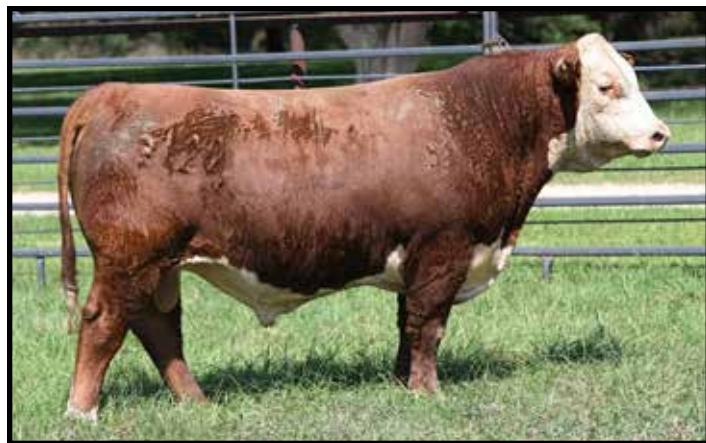
4M MR INTEGRITY PRINCE 3120