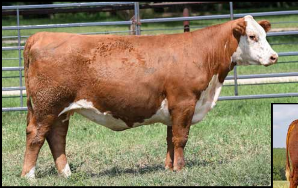
4M MS ENDURE LADY 3146 ET