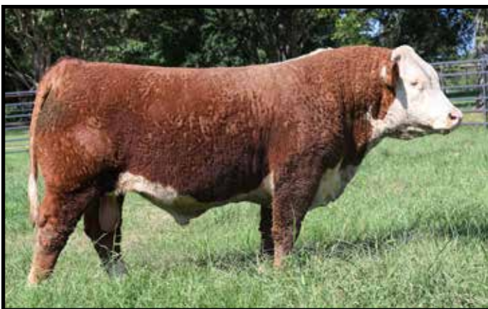
4M MR 88483 DEALER 3168