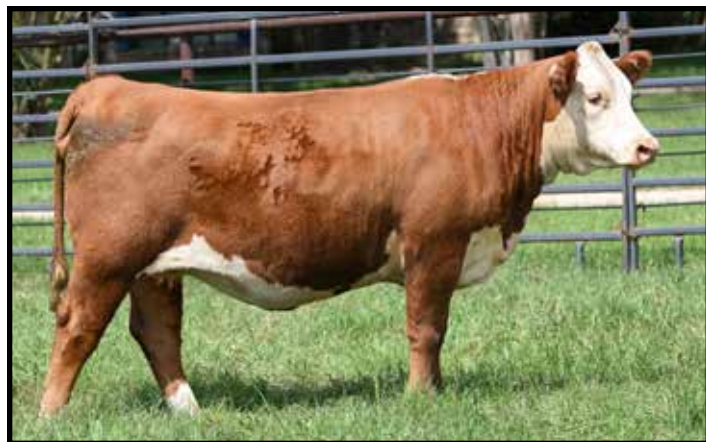
4M MS 88483 LADY WHIT 3129