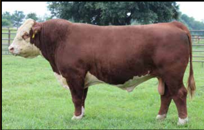
/S INTEGRITY 88483 ET

Sire of Lots 3111, 3120, 3123, 3128, 3136, 3159, 3168, 3176, 3179, 3180, 3182, 134 & 135