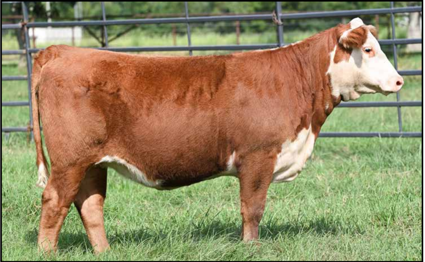
4M MS BELLE H022 402

121 4M MS BELLE H022 402 {DLF,HYE,IEF,MSUDF} COW P44587939 || CALVED: 9/27/23 || TATTOO: LE 402 POLLED