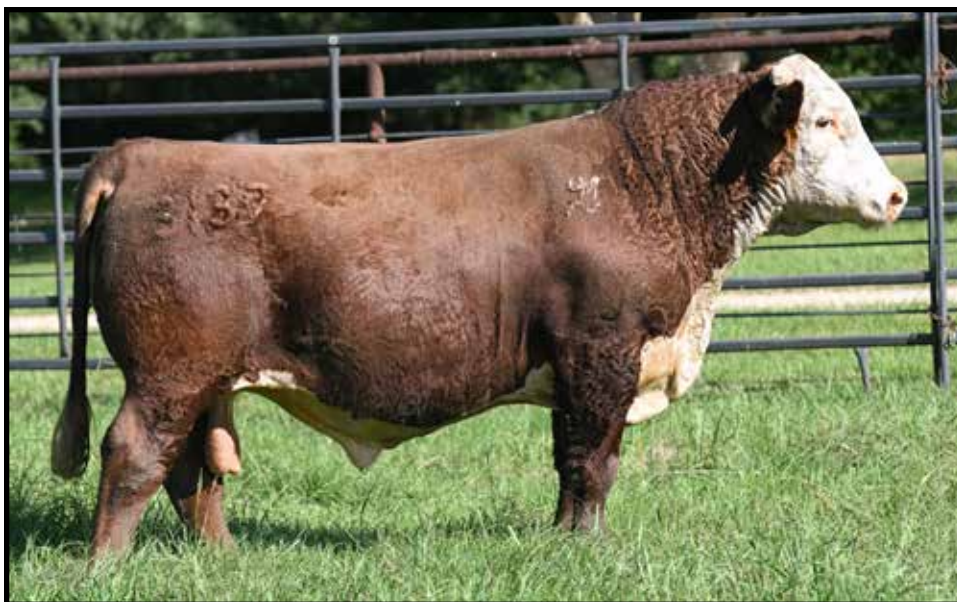
4M MR 9364 DOMINO 3137