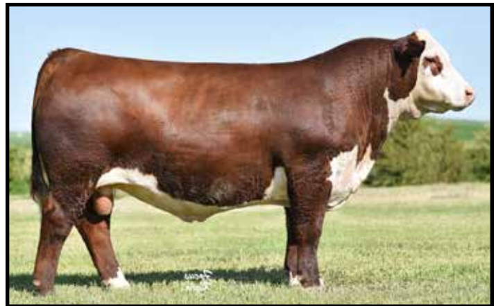
NIW 79Z Z311 ENDURE 173D ET – Sire of Lots 3138 and 3139