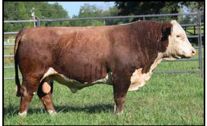
4M MR GLOBAL INTEGRITY 3159