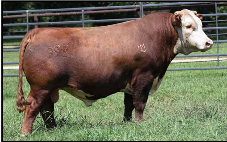
4M MR 9364 REVOLUTION 398

398 4M MR 9364 REVOLUTION 398 {DLF,HYF,IEF,MSUDF,DBP} BULL 44431097 || CALVED: 11/21/22 || TATTOO: LE 398 HORNED