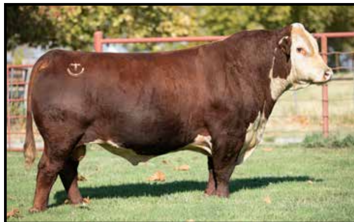
SHF HORIZON D287 H022 ET — Sire of Lot 121