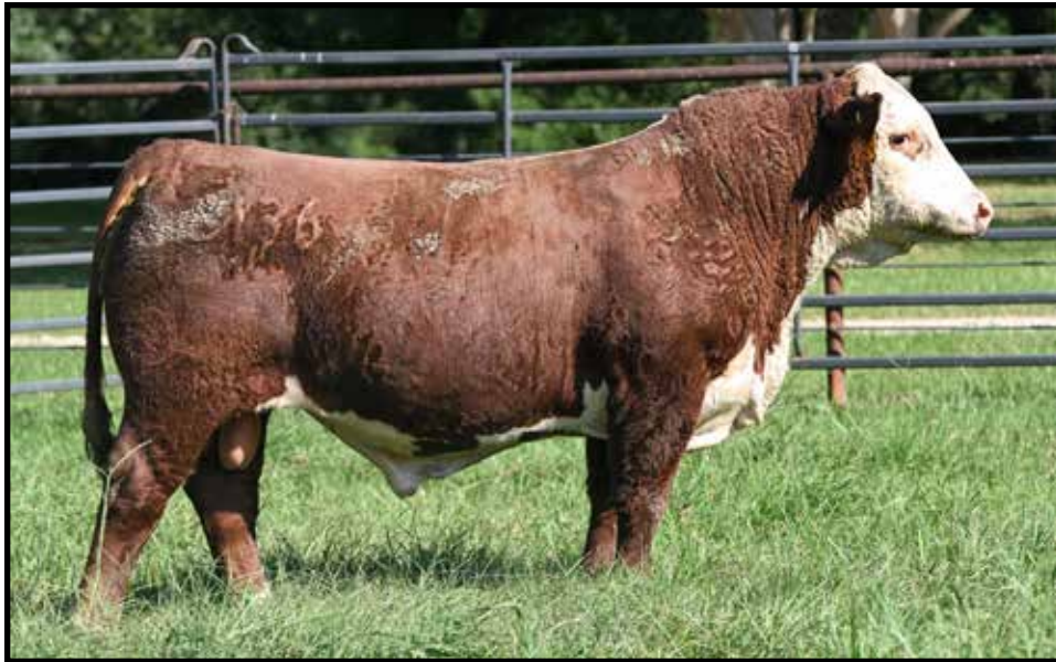
4M MR INTEGRITY CATAPULT 3136

3136 4M MR INTEGRITY CATAPULT 3136 {DLF,HYF,IEF,MSUDF} BULL P44466579 || CALVED: 1/8/23 || TATTOO: LE 3136 SCURRED