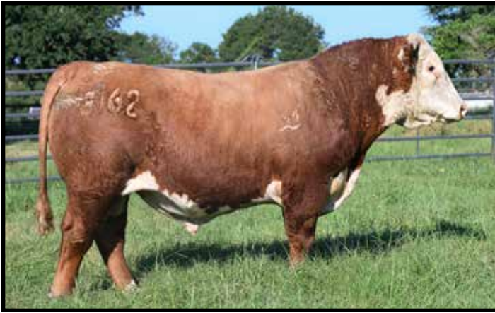
4M MR DOT DOMINO 3162