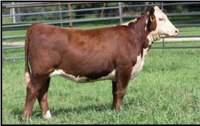
4M MS TRUSTY SENSATION 192 437