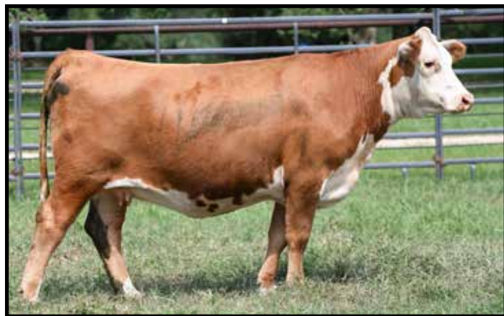
4M MS PEERLESS LADY 3155