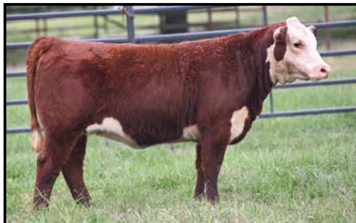
4M MS GOLDIE 252F 421 ET