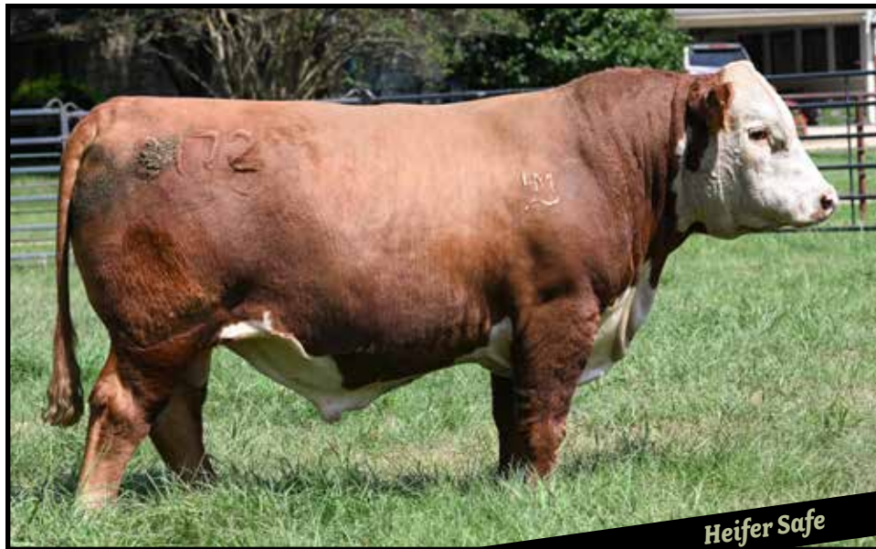
4M MR REGAL BEEF MAN 3172