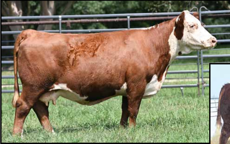
4M MISS CATAPULT TO WIN 997ET