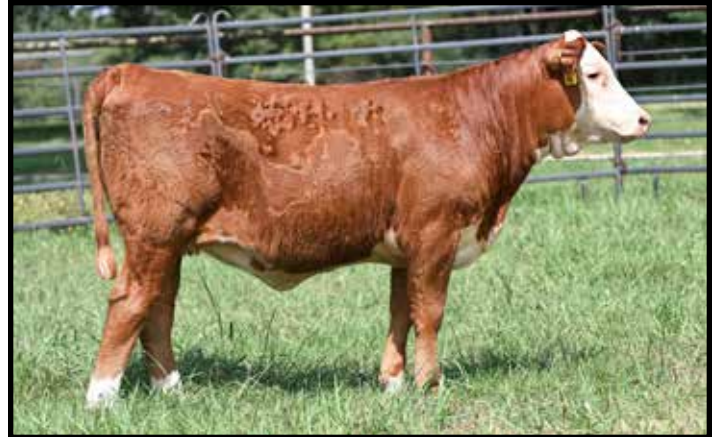
4M MS 2079 DOMINETTE 4122

138A 4M MS 2079 DOMINETTE 4122 {DLF,HYF,IEF,MSUDF} COW 44562198 || CALVED: 1/29/24 || TATTOO: LE 4122 HORNED