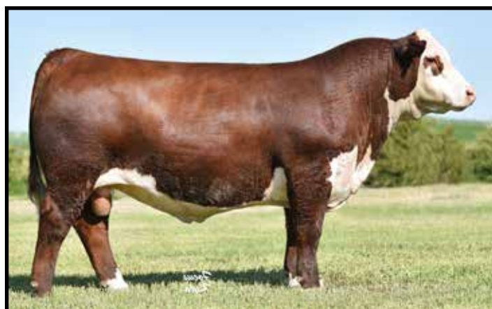
NIW 79Z 2311 ENDURE 173D ET — Sire of Lot 142 Embryos