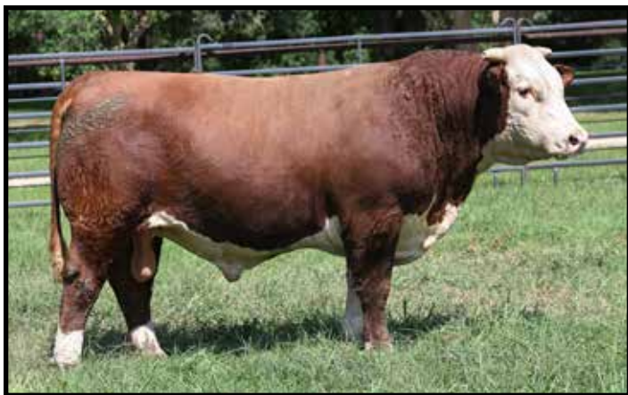
4M MR 88483 BOOMER 3128