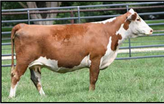
4M MS HARLEYS MONEY 7141 0145