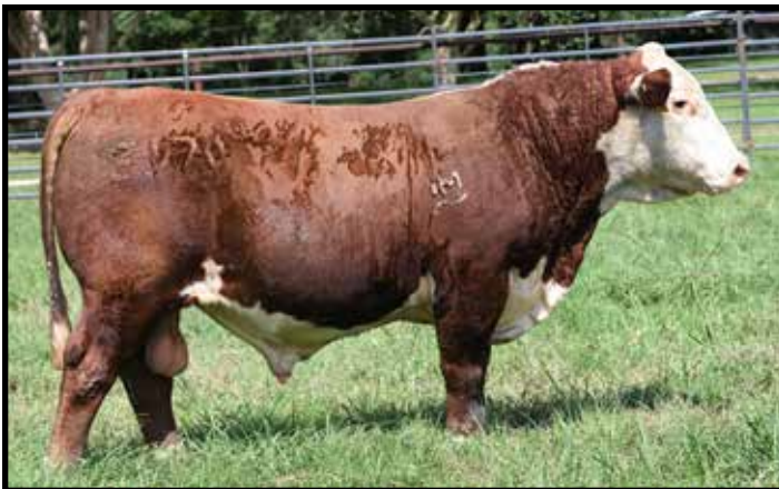
4M MR 88483 GOLD MAN 3179