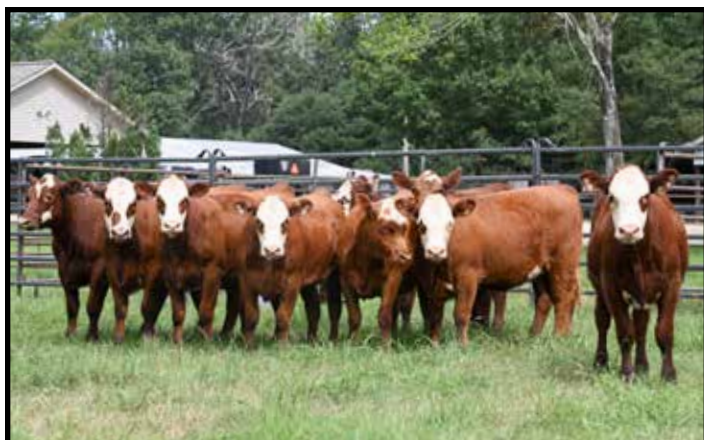
Lot G - 10 Open English Red Baldy Heifers