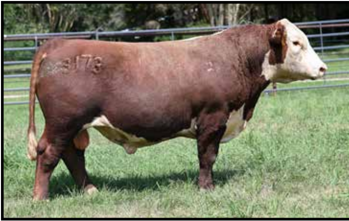
4M MR 9364 COMMITMENT 3173