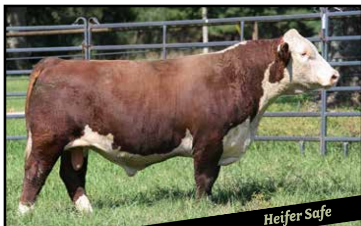
4M MR INTEGRITY OUTCROSS 3123