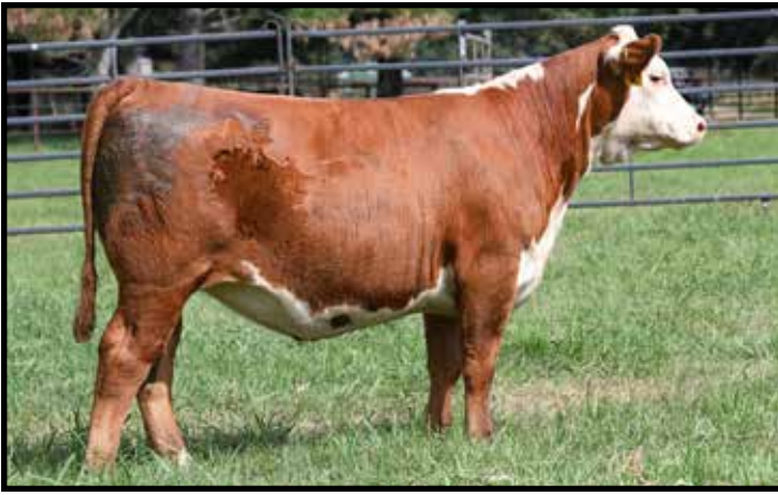
4M MS 2079 BEEF LADY 425