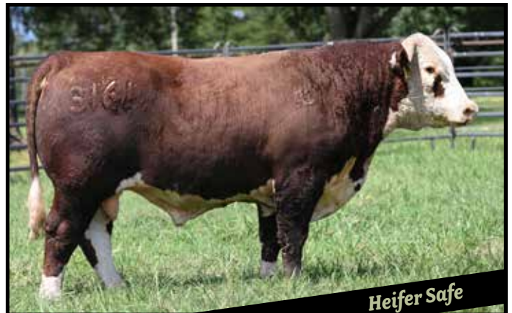
4M MR 9364 LASS 3161