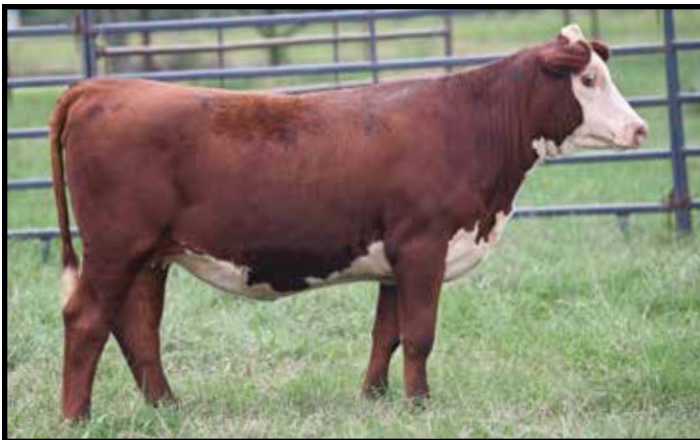
4M MS COLEY LADY 192 452