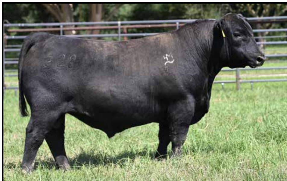
RM MR BRUTUS HI CUT 328