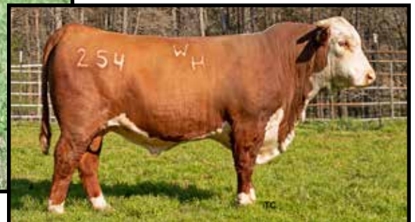
WHR 619G 659 BEEFMAKER 254K ET – Reference Sire