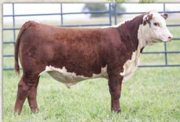
E 1015 SENTINEL 3011 ET Anchor Polled Herefords, Montana