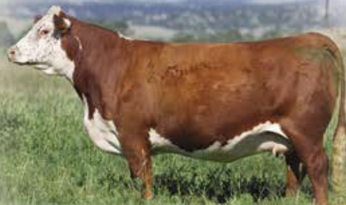
ILR 156T IRON LADY 486B ET Dam of 2018 and 2023

Private Treaty Spring Bull Sale – Buyer's Convenience – Select bulls when it's convenient for you!