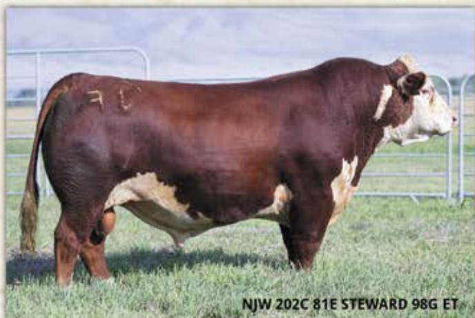
NJW 202C 81E STEWARD 98G ET