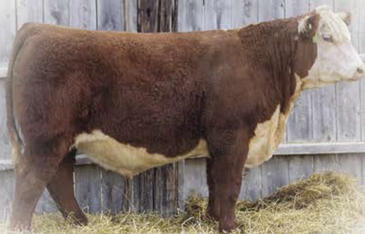
E 174E YELLOWSTONE 0001 ET Sire of K46