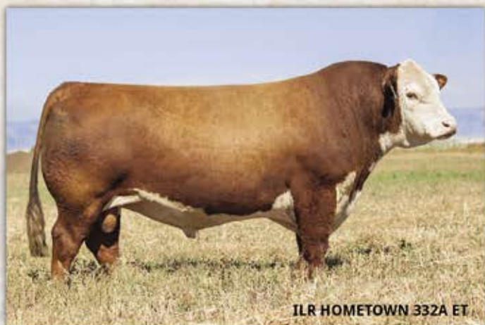
ILR HOMETOWN 332A ET

We are thrilled to have been able to add 98G to our program. This guy brings an incredible maternal background into breeding decisions. 98G adds depth and dimension to his progeny. He is homozygous polled and the number profile backing this guy up is also exceptional. Owned with Tudahl Herefords. A 98G daughter was recently Reserve Grand Champion Polled Hereford Female at Agribition.