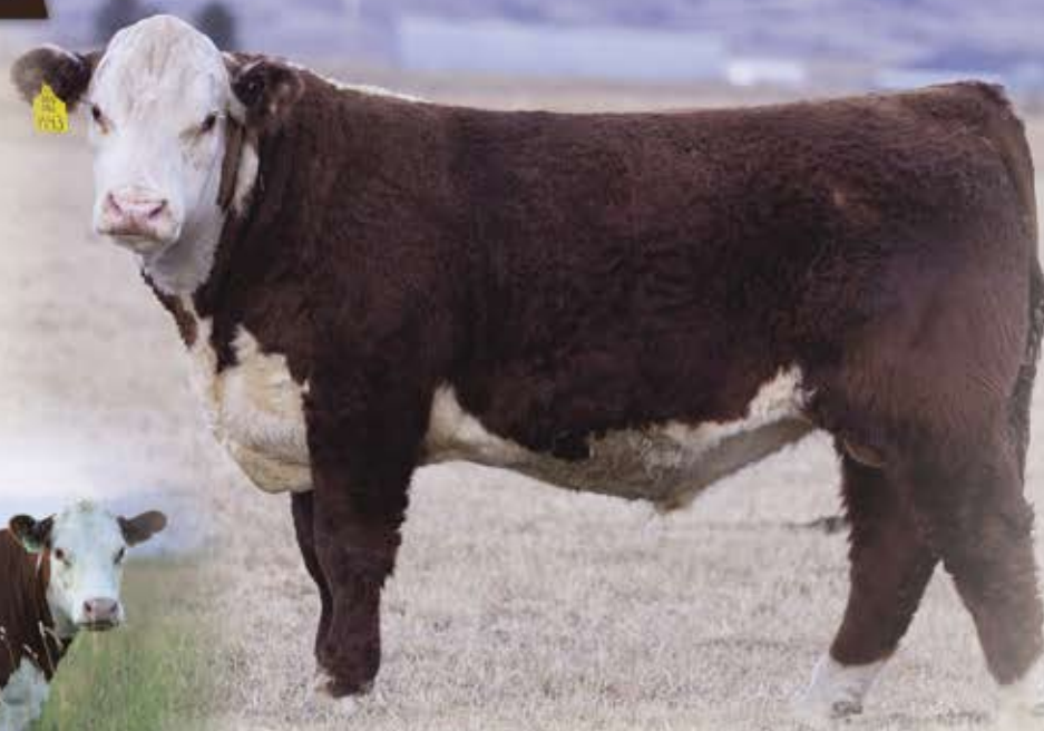
E 1319 DIVA D05 ET Dam of K43

High-performance son of our D83 herd sire and a really uniquely bred dam. K43 topped his contemporary group on all performance aspects; WW, YW, REA, etc. A combination of performance with style and a maternal background as a bonus. A genetic outcross here to most breeders. Retaining 1/4 semen interest.