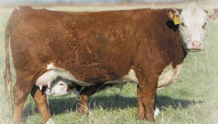
CHURCHILL LADY 5146C Dam of K76