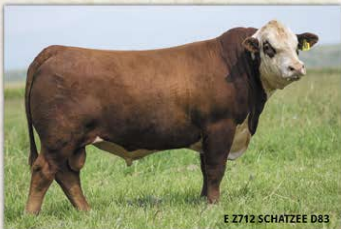
E Z712 SCHATZEE D83