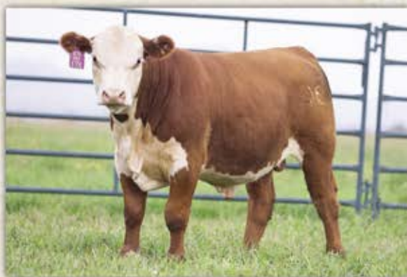
LJE ILR D98 SPECTRE 17K Copeland Herefords, NM