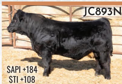
PB SM - LBRS GENESIS G69 SON

MULTI-GENERATIONS GENOMIC TESTING || RIGHTMATE AND RIGHT CHOICE CUSTOMER FEEDER CATTLE MARKETING OPTIONS || DEVELOPED RIGHT SO THEY LAST FOR YOU