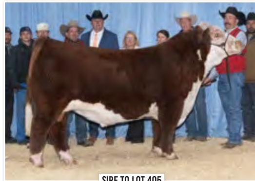
SIRE TO LOT 405