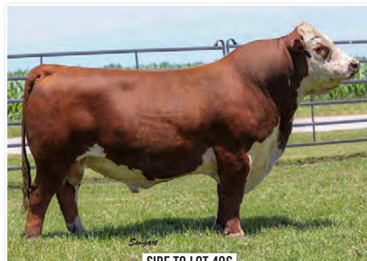
SIRE TO LOT 406