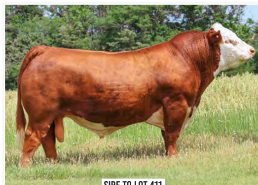
SIRE TO LOT 411

Sire: PURPLE REUBEN JAMES 40A ET KCW COTTON'S YELLOWSTONE 220H KCW COTTON'S JOURNEY 223 ET CCC 0245 CASHIN IN 807 Dam: BRH MS MOLLY CASH 2113 BRH MS SKYY 8001