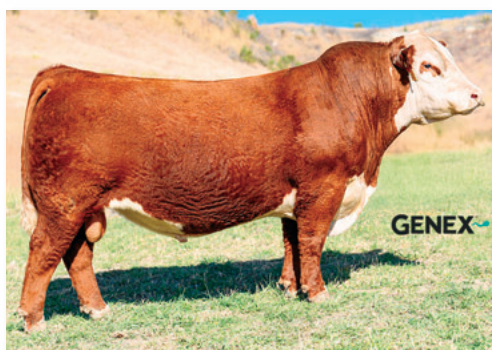
BAR JZ ON DEMAND Sire of Lot 12

Perks Ranch is only a 1.5 hour drive south of Madison.