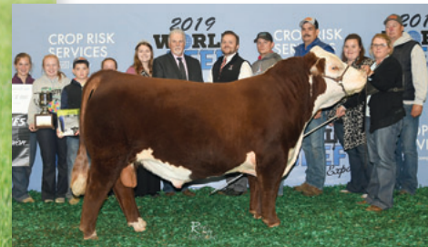
2TK PERKS 5101 CADILLAC 8039ET Sire of Lot 19