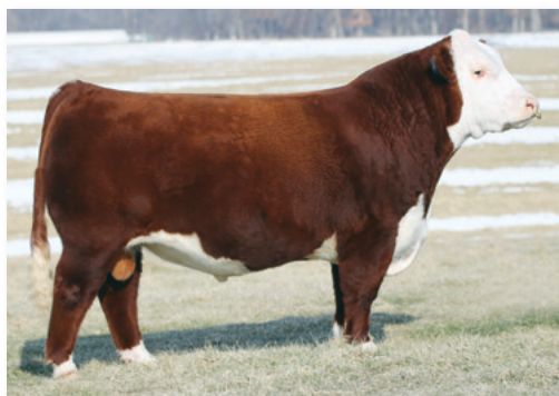
AH JDH MUNSON 15E ET Sire of Lot 22