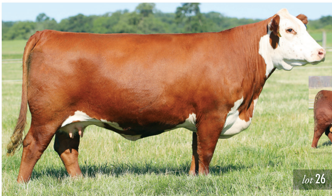
UPS HE DELIVERS 0290 ET Lot 26 service sire and sire of Lot 26A