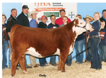
PERKS 1502 MARY SUE 8036 ET Maternal sister to Lots 2, 3 and 4