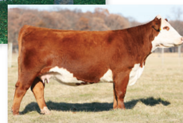
PERKS 2026 LIFESAVER 5017 Maternal granddam of Lot 7

Dam of Lot 7... shown successfully by Noah Benedict