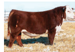
CRR 66589 BALANCE 107