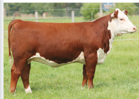
MKS 8G 63H LADY BENTON 6M Maternal sister to Lot 31