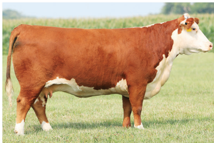
PERKS 5098 COOKIES N CREAM9096