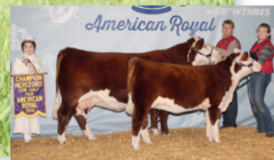
Dam of Lot 29