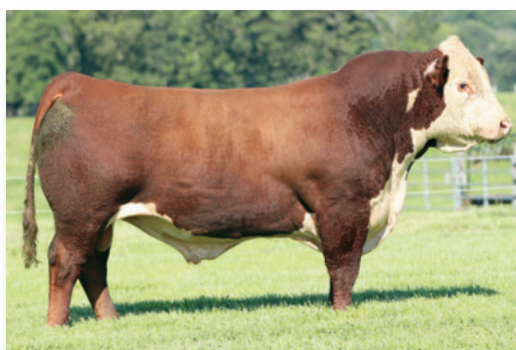
2TK PERKS 5101 HOUIE 012H ET Sire of Lot 30A