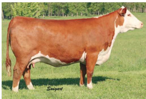
FDM LADY 23S 4Z Dam of Lots 18 and 19