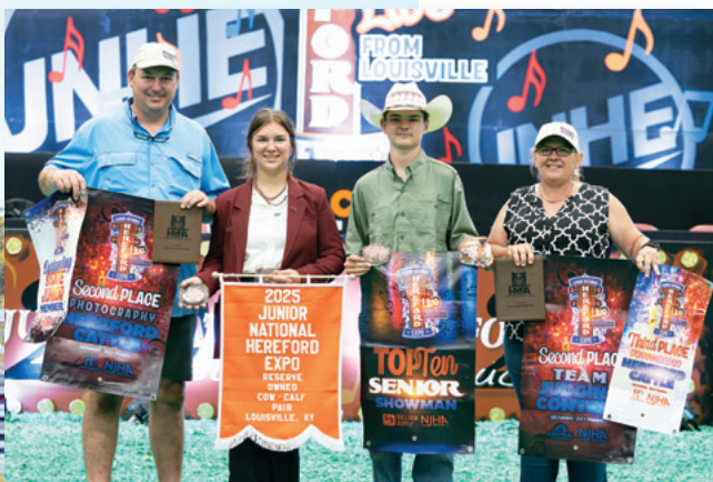
The Boatman Family