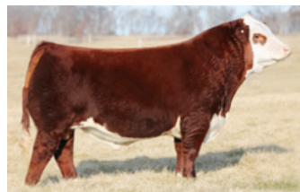
PERKS PRCC 0039 GHOSTWOOD 3016