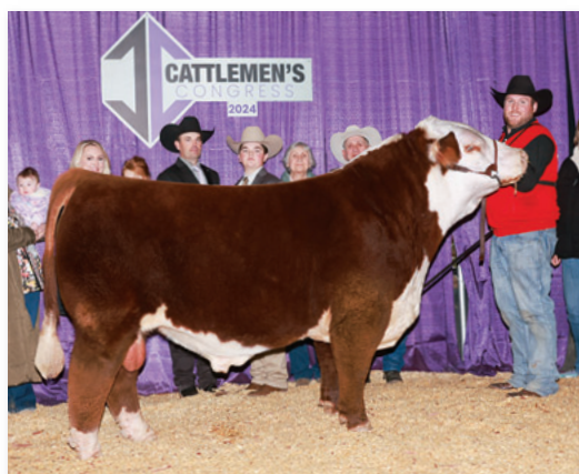
CH PREMIER 233 ET Sire of Lots 36-39

Sale contact: Katie Colyer (208) 599-2962