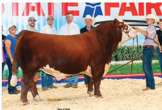
PERKS PRCC 0039 GHOSTWOOD 3016 Sire of Lot 19A and service sire on Lot 19