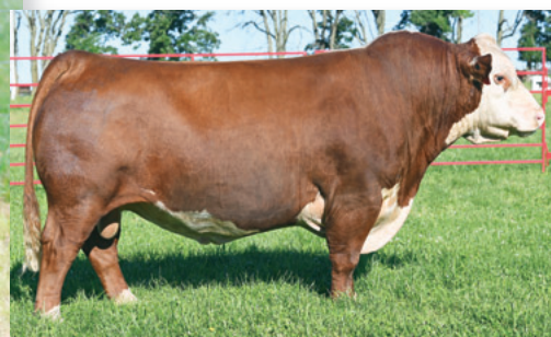
H B DISTINCT Lot 25 AI service sire