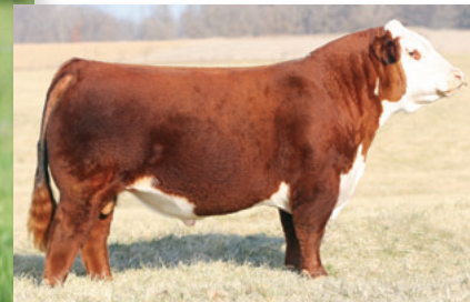
2TK PERKS 5101 CHUMA 8184 ET Sire of Lot 18