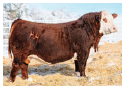
LOEWEN SANDHILL L70 ET