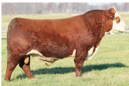
UPS HE DELIVERS 0290 ET Sire of Lot 13