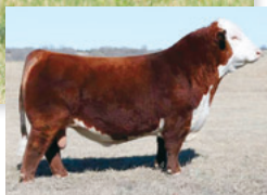
BK RED RIVER H18 ET Sire of Lot 8