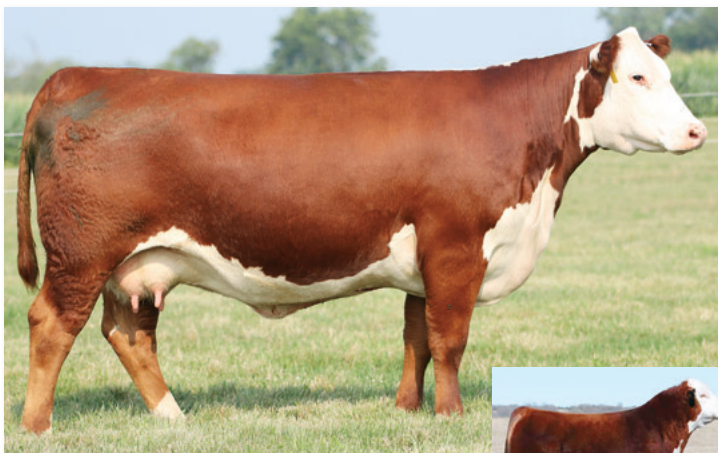
PERKS 58W CANDY LAND 7036ET Dam of Lots 8, 9 and 10