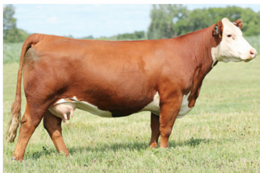
PERKS 625 DIVERSIFIED GAL 8042 $50,000-valued dam of Lots 5 and 6; granddam of Ghostwood and Lot 12