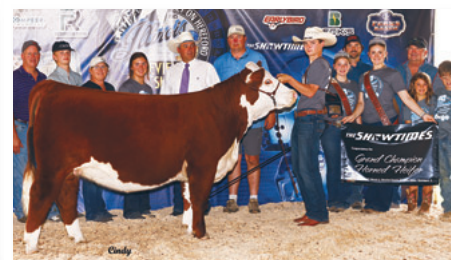
MMK 1502 VALERIE 2404 ET Maternal sister to Lots 2, 3 and 4