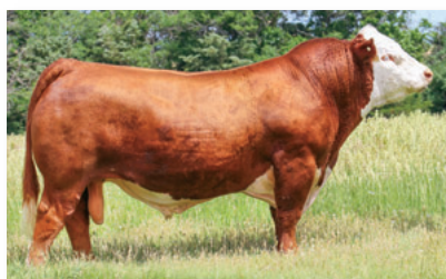
KJ TWJ 907E LIBERTY 159H ET Sire of Lots 5, 6 and 7