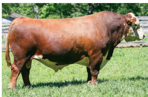
JW 1857 MERIT 21134 Sire of Lot 25A