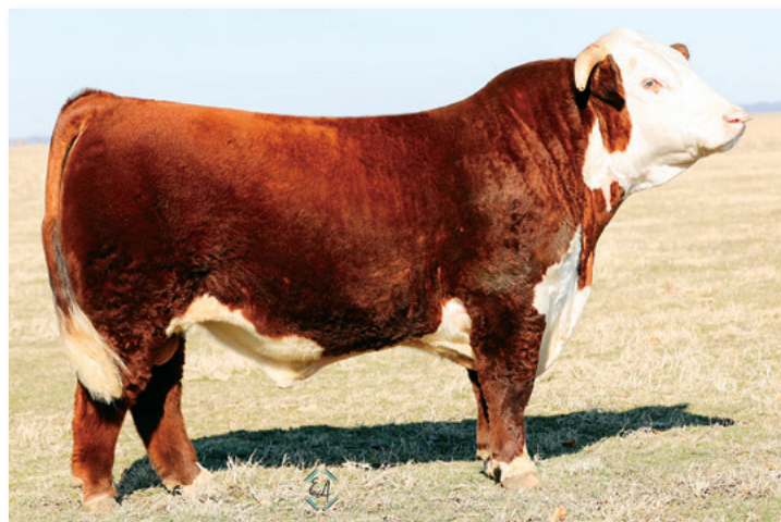
SLC BAR S MR 49C DYNAMIC 113ET

Sire of Lots 32A, 33 and 34; pasture service sire on Lots 32 and 35