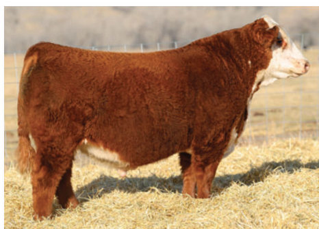
CHURCHILL BIG SHOT 1136J ET Sire of Lot 17A