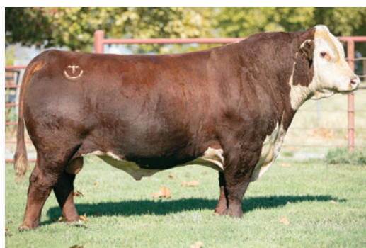
SHF HORIZON D287 H022 ET Sire of Lot 31A