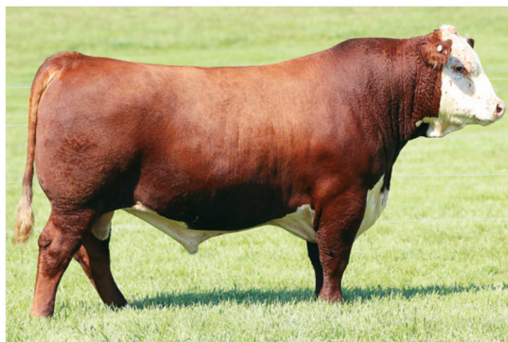
SRR MR H028 HAVILAND 3046