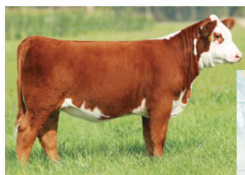
PERKS BH LOLA 4032 ET Maternal sister to Lot 7