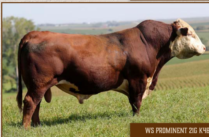
WS PROMINENT 21G K46