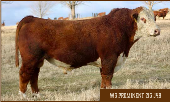
WS PROMINENT 21G J48