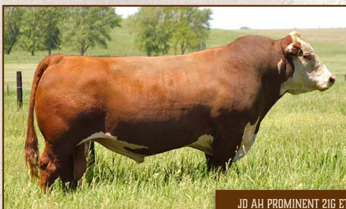
JD AH PROMINENT 21G ET