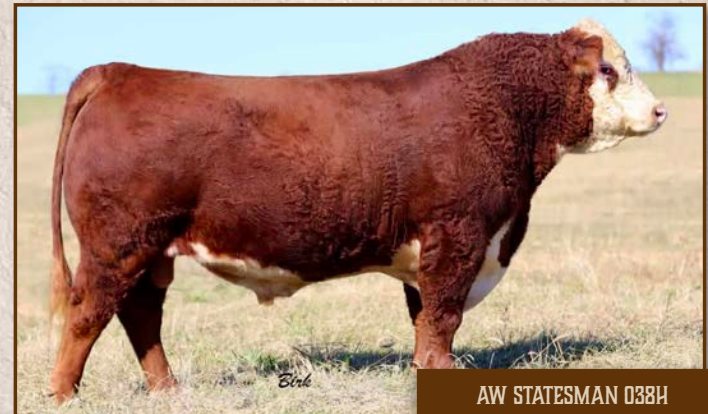
AW STATESMAN 038H