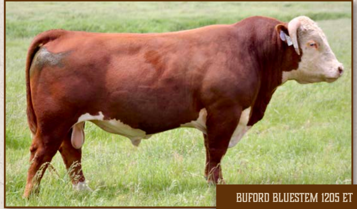
BUFORD BLUESTEM 1205 ET