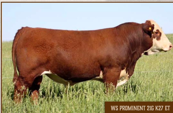
WS PROMINENT 21G K27 ET