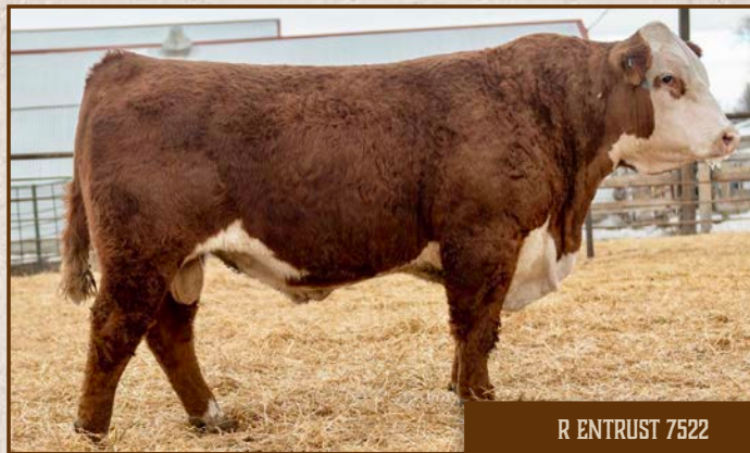
R ENTRUST 7522