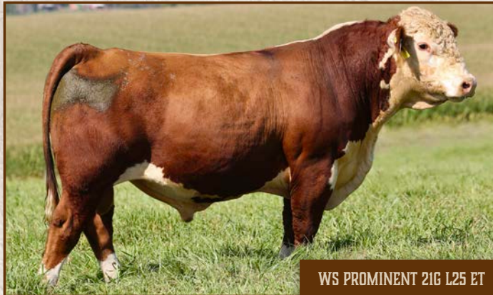
WS PROMINENT 21G L25 ET