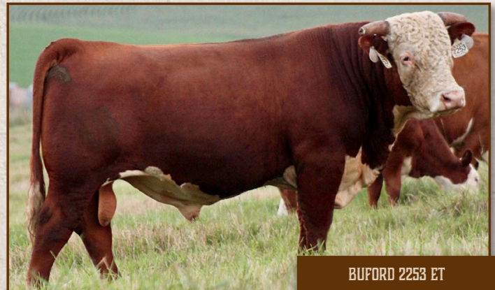
BUFORD 2253 ET