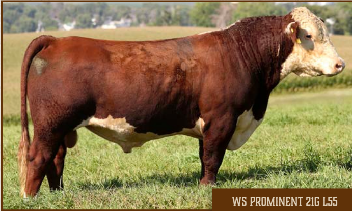
WS PROMINENT 21G L55