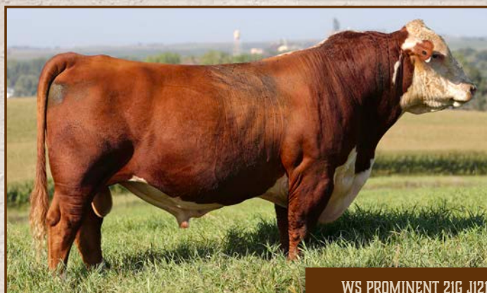
WS PROMINENT 21G J121