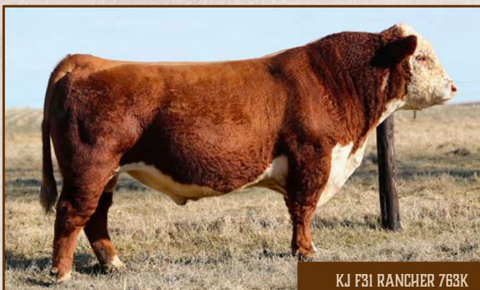
KJ F31 RANCHER 763K