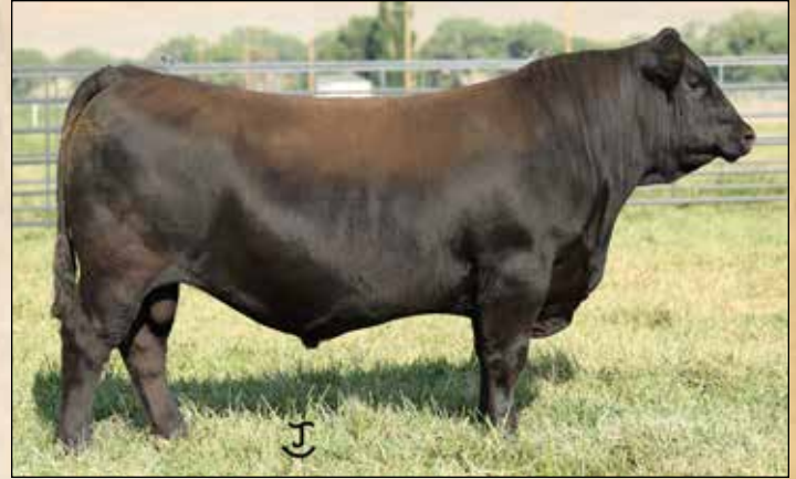
WESTWIND LE BREAKTHROUGH 1425