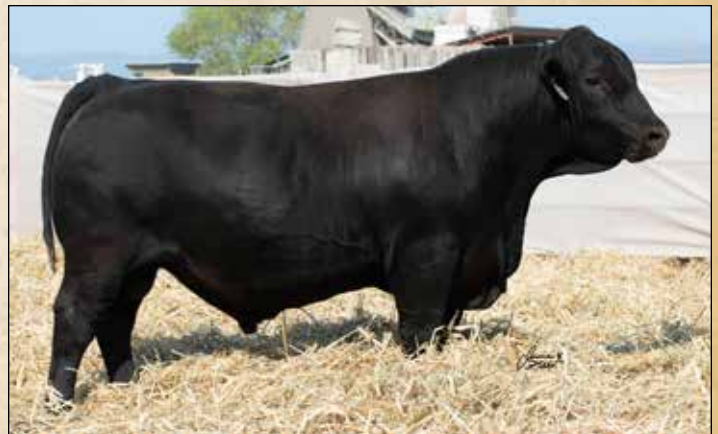
SUNBRIGHT PAYWEIGHT L026