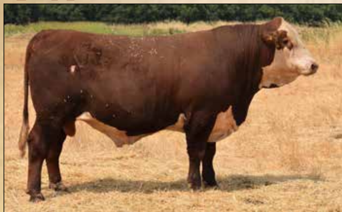
LAMBERT WHIT 53L