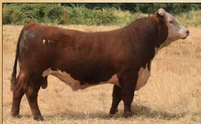
LAMBERT HOSS 13L