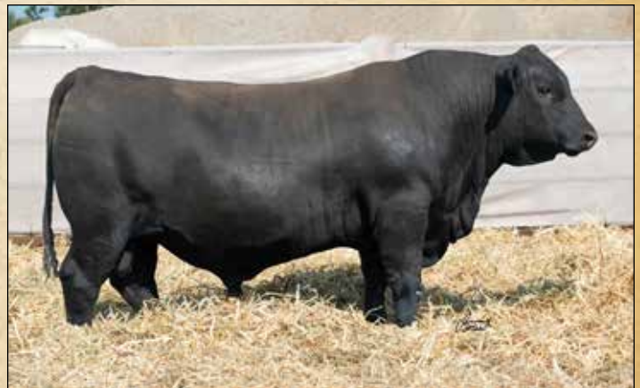
SUNBRIGHT EXPOTENTIAL L1