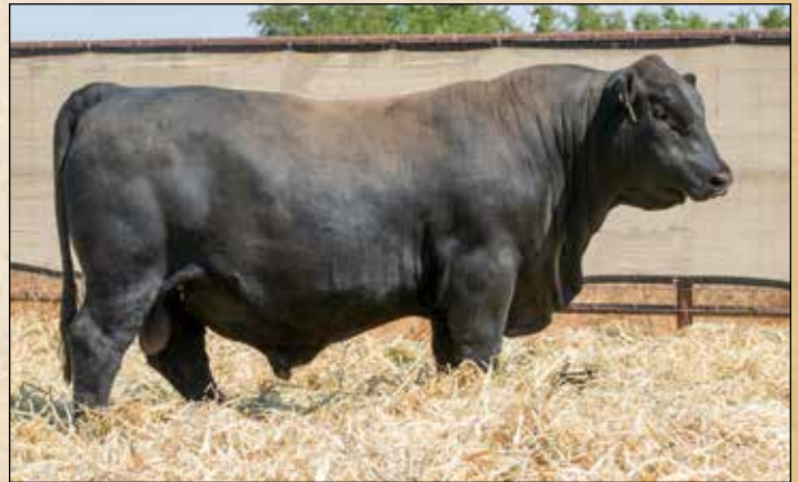
SUNBRIGHT GROWTH FUND L9