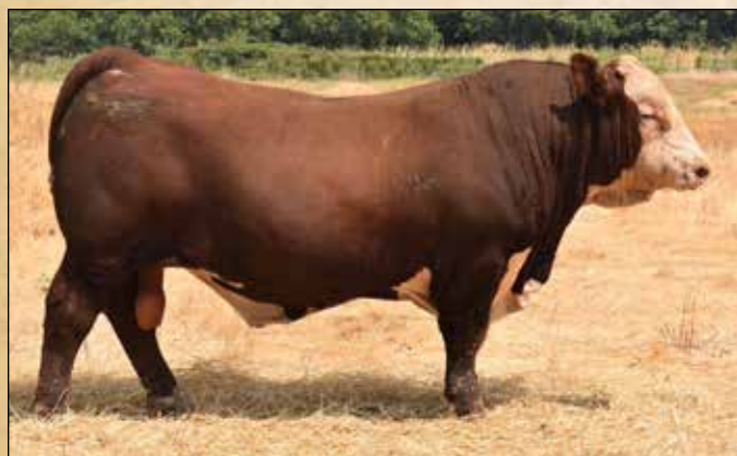
LAMBERT END GAME 59L