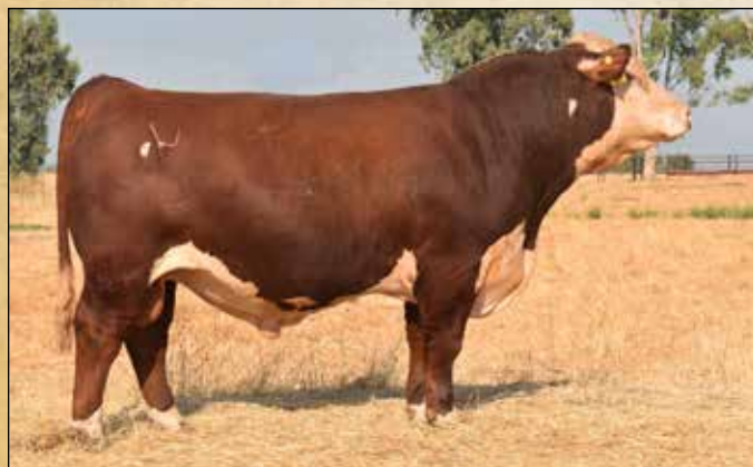
LAMBERT WHIT 35L