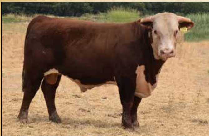
LAMBERT END GAME 109L