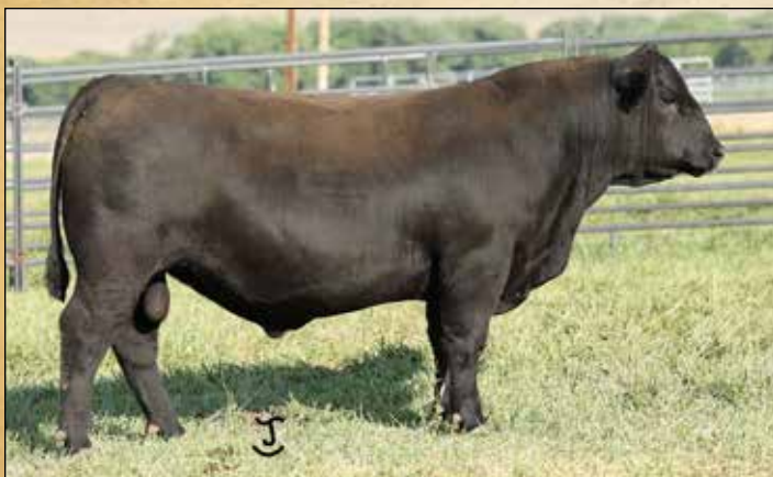
WESTWIND LE DOC RYAN 1465