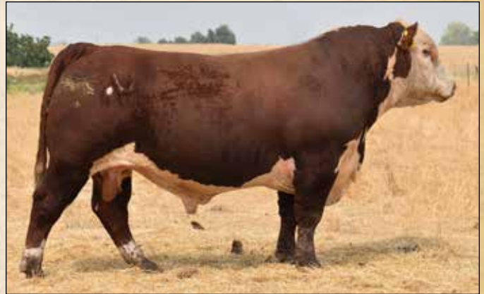
LAMBERT GAMBLER 19L

• Big and rugged beef bull, super long and a ranch favorite from birth