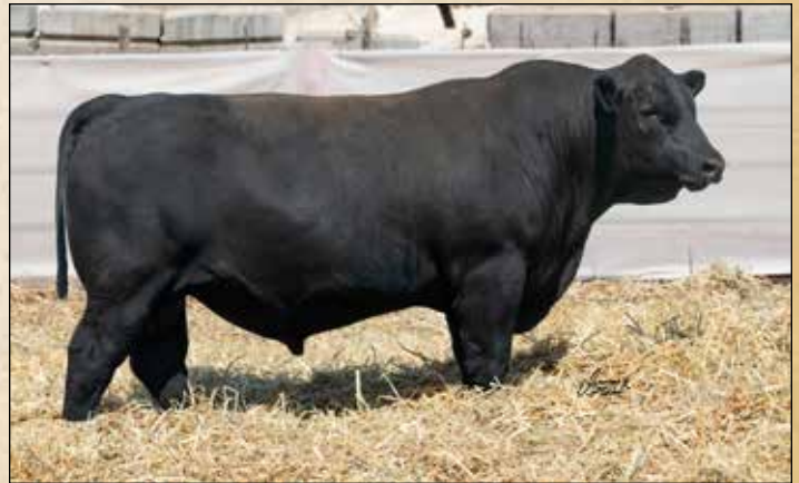
SUNBRIGHT PAYWEIGHT L22