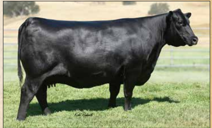
DCF CHLOE 5769 — Dam of Lot 50