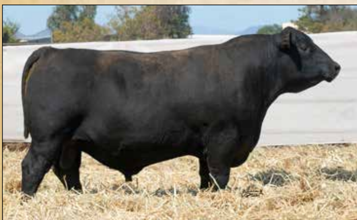
SUNBRIGHT EXPOTENTIAL L481