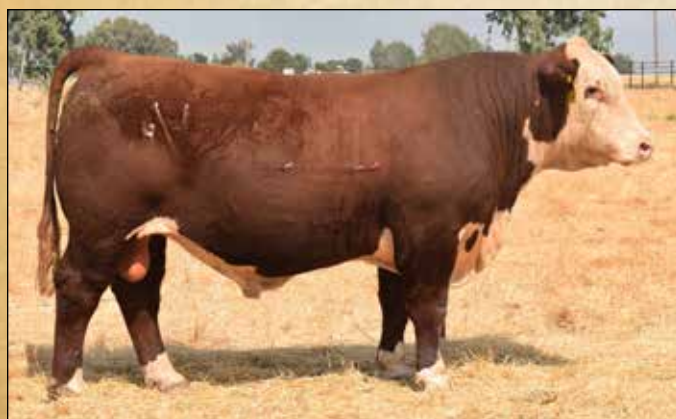
LAMBERT HOSS 65L