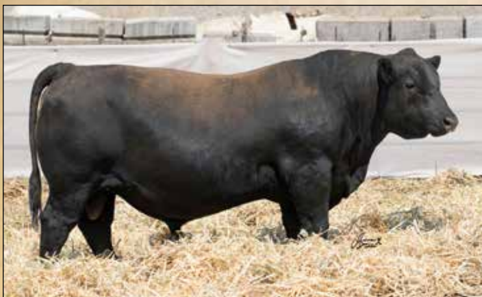
SUNBRIGHT COMMAND 46L