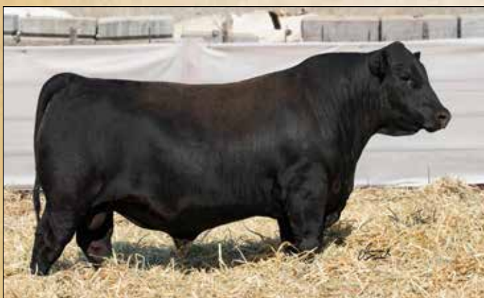
SUNBRIGHT RAWHIDE L50