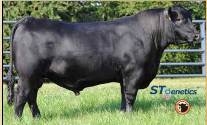
Reference Sire - MYERS FAIR-N-SQUARE M39 - 19418329