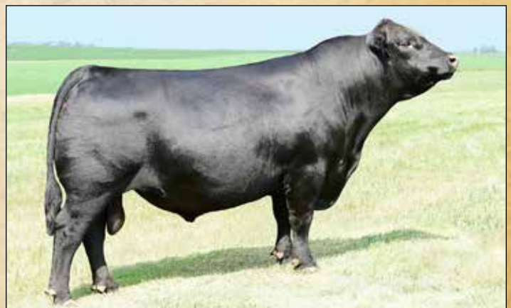
Reference Sire - T/D DOC RYAN 049 - 19820224