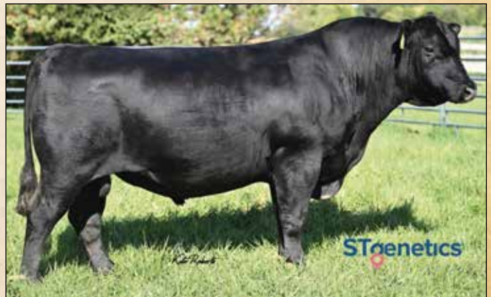
Reference Sire - BEAL BREAKTHROUGH - 19829112