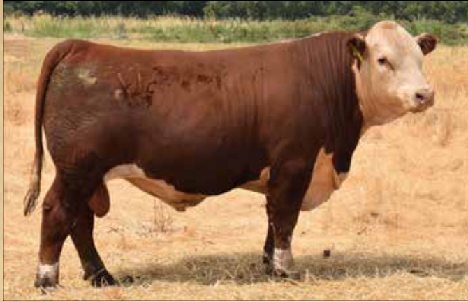
LAMBERT WHIT 101L