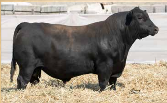
SUNBRIGHT EXPOTENTIAL L10