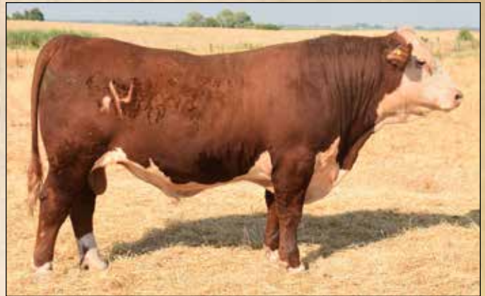
LAMBERT WHIT 69L