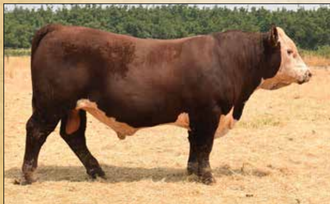
LAMBERT HOSS 61L