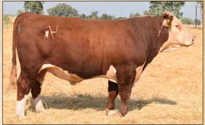
LAMBERT GAMBLER 17L

• Smoothly built heifer bull, traditionally marked and super complete