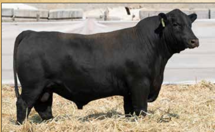
SUNBRIGHT RAWHIDE L210