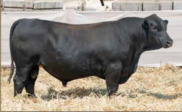
SUNBRIGHT ENTICE L140