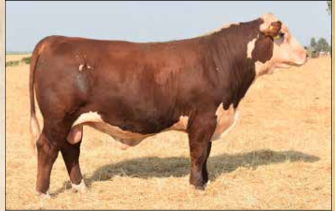
LAMBERT WHIT 95L