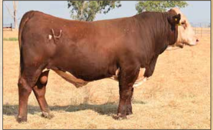
LAMBERT WHIT 39L