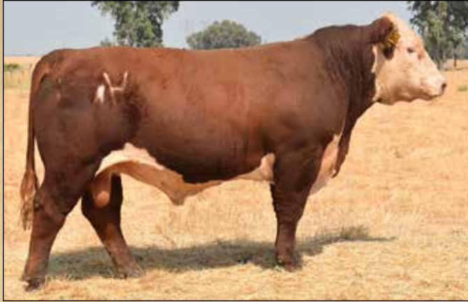
LAMBERT GAMBLER 79L