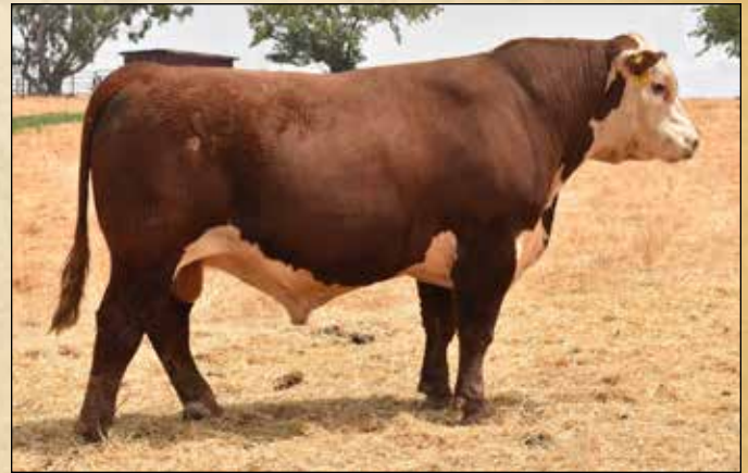
LAMBERT GAMBLER 99L