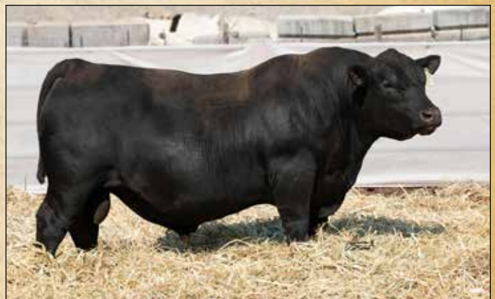
SUNBRIGHT FAIR N SQUARE L45