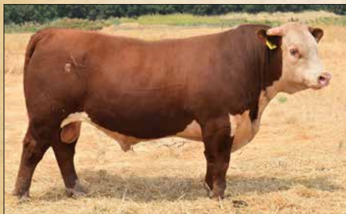
LAMBERT HOSS 7L