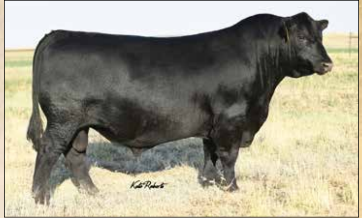
Reference Sire - BASIN JAMESON 1076 - 20071781

The average Westwind Bull in this sale has an average $C of 344 which ranks in the very elite top 3% of the Angus breed. The average Marbling EPD of the Westwind Bulls is 1.42 ranking in the ultra-elite top 2% of the Angus breed.