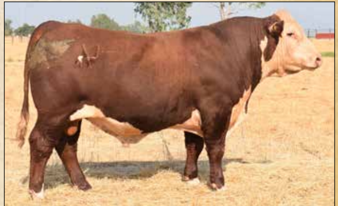
LAMBERT WHIT 21L

• Deep sided, strong topped and big footed with plenty of hip