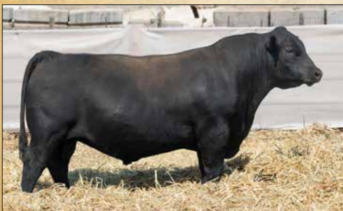
SUNBRIGHT FAIR N SQUARE L17