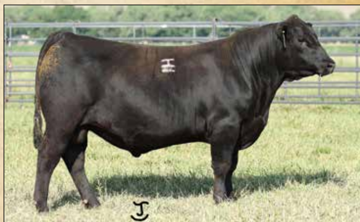
WESTWIND BADLANDS DJH 323