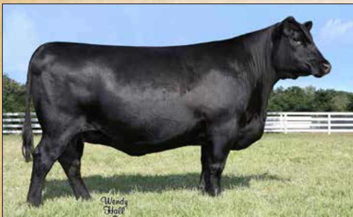
VINTAGE FIRST LADY 4389 — Dam of Lots 49 and 54