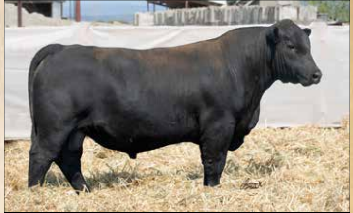
SUNBRIGHT REGIMENT L929