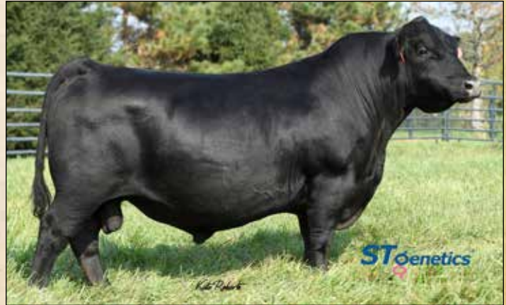
Reference Sire - POSS RAWHIDE - 19416968