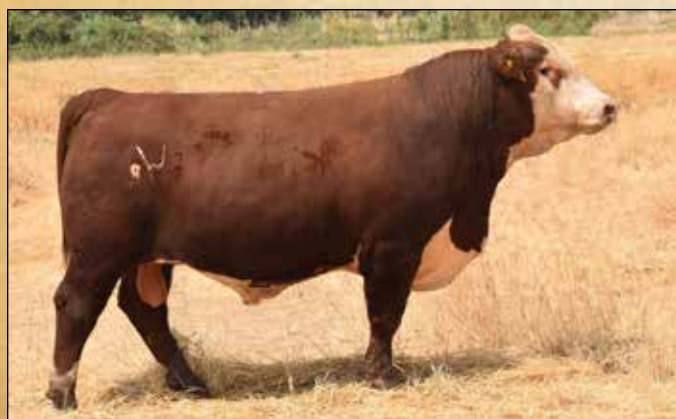
LAMBERT WHIT 37L