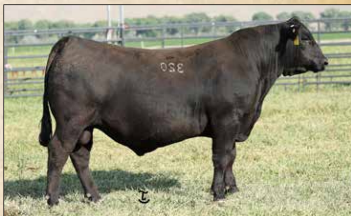
WESTWIND STURGIS DJH 320