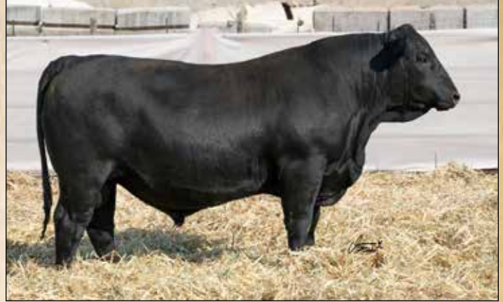
SUNBRIGHT PAYWEIGHT L211