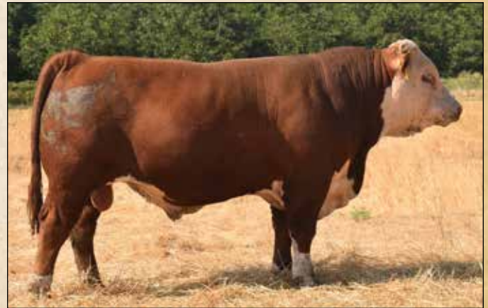
LAMBERT HOSS 97L