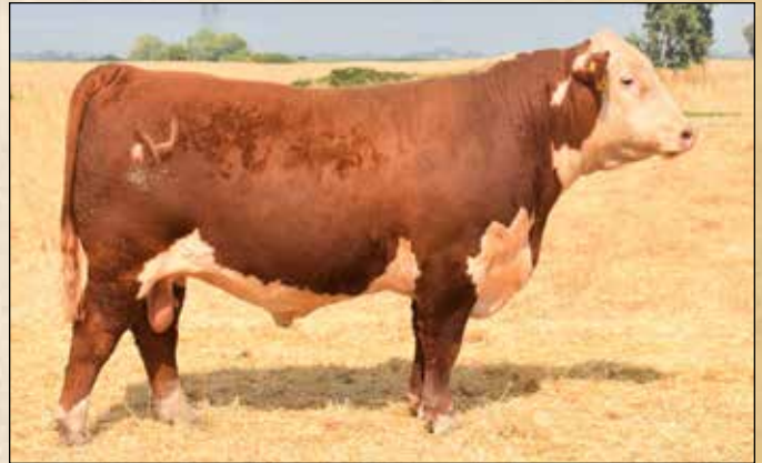
LAMBERT GAMBLER 41L