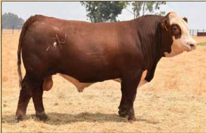
LAMBERT WHIT 83L