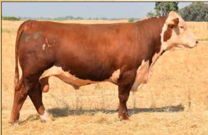
LAMBERT GAMBLER 87L