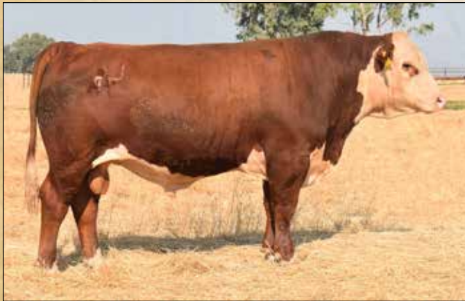
LAMBERT GAMBLER 107L