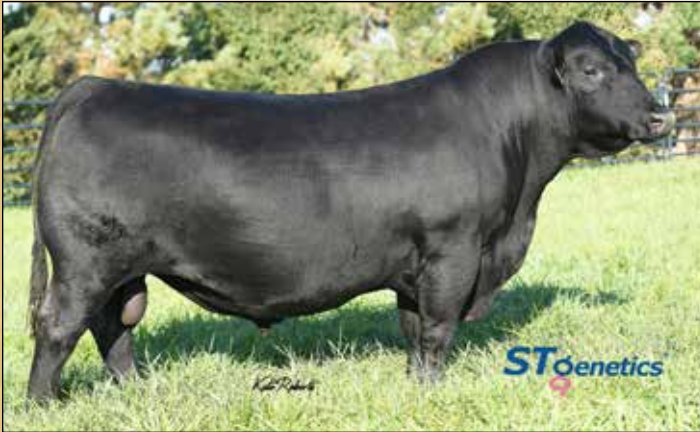
Reference Sire - K C F BENNETT EXPONENTIAL - 19507801

• He is a calving-ease son of MOGCK Entice.