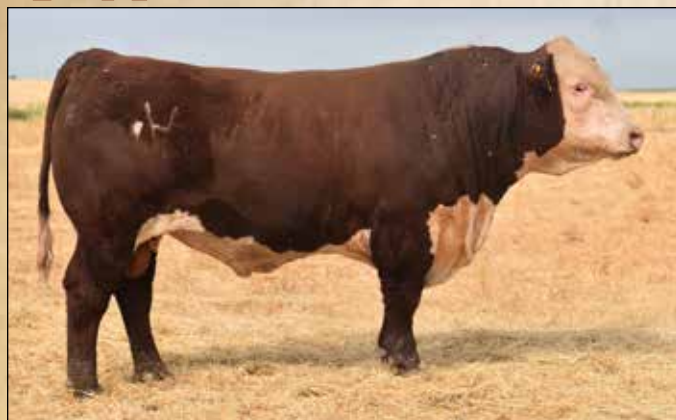
LAMBERT HOSS 5L