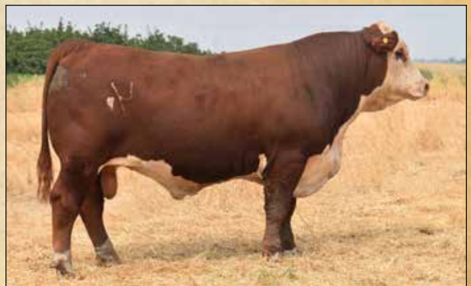
LAMBERT WHIT 49L