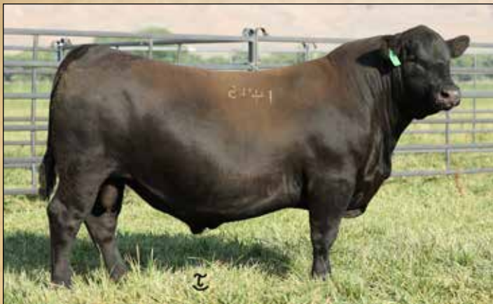
WESTWIND LE JAMESON 1445