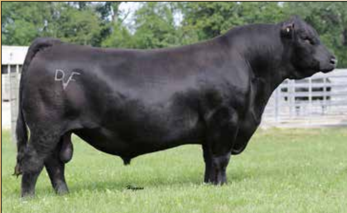
Reference Sire - DEER VALLEY GROWTH FUND - 18827828