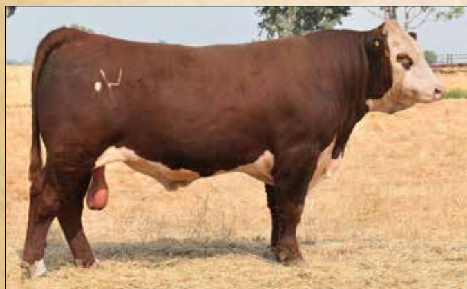
LAMBERT HOSS 33L