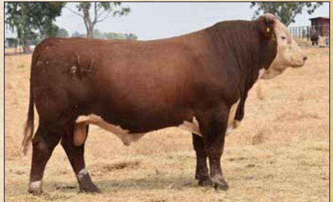
LAMBERT GAMBLER 75L