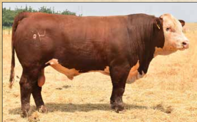
LAMBERT HOSS 9L