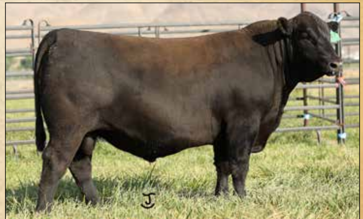
WESTWIND LE JAMESON 1439