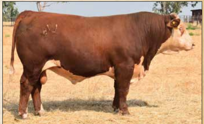
LAMBERT GAMBLER 71L