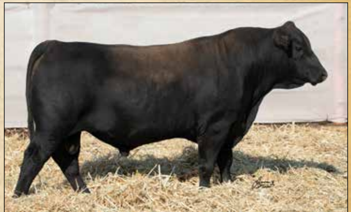
SUNBRIGHT COMMAND L92