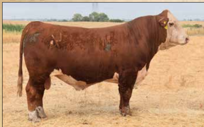
LAMBERT WHIT 31L