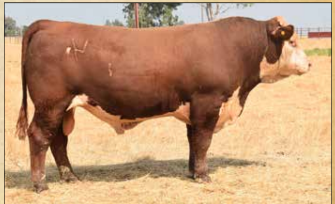
LAMBERT HOSS 23L

• Goggle eyed with high ribeye and marbeling ratios out of a nice Slingshot daughter