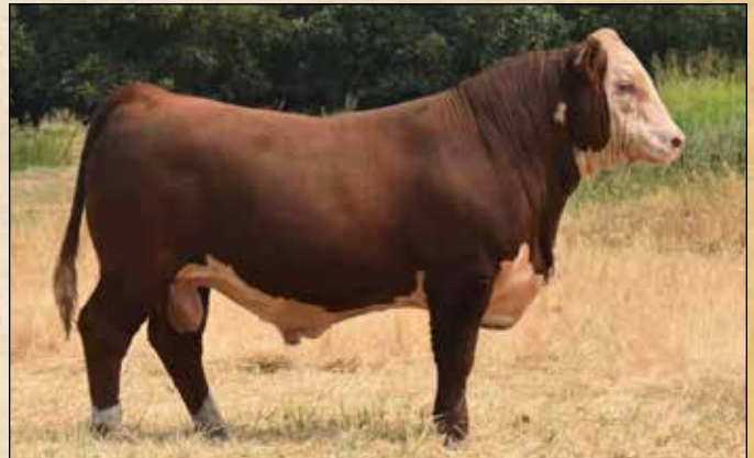
LAMBERT WHIT 43L