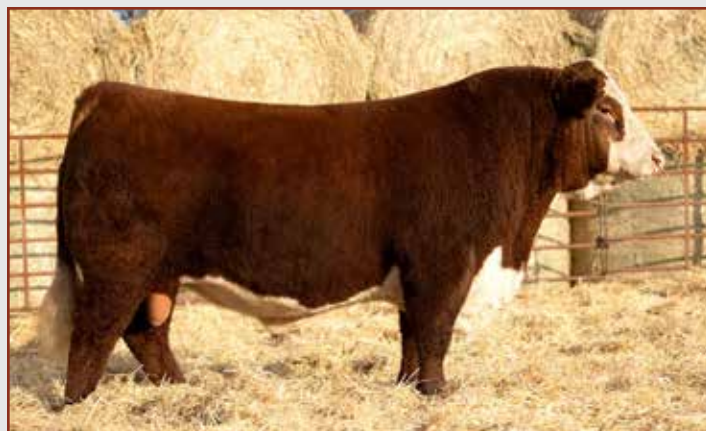
ASM 405B RED MAN 325L ET — Service Sire to Lot 6