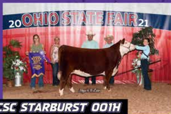
RCSC STARBURST 001H

GRAND CHAMPION HEREFORD FEMALE 2023 MARDI GRAS MASQUERADE