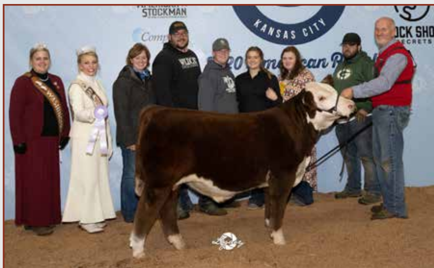
WILDCAT MF EL CHAPO 013 — Sire of Lots 17 & 18