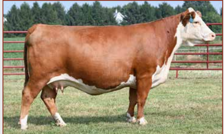
GLENVIEW Z426 ELANA J6 — 3/4 sib to Lot 21 Embryos

Donated by: Pitt Farms/ Broken Rock Farms — Bellville, Ohio — 515-290-1383