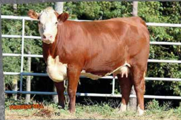
PROGENY 344 TC Initial Fall 720 1208 4010 ET