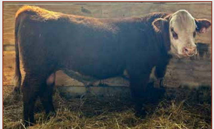
Lot 11 — POH MIDNIGHT RIDER LEDGEND