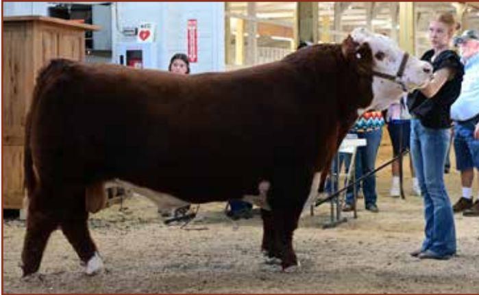
Lot 7 — EML MR HISTORIC MAUI L816