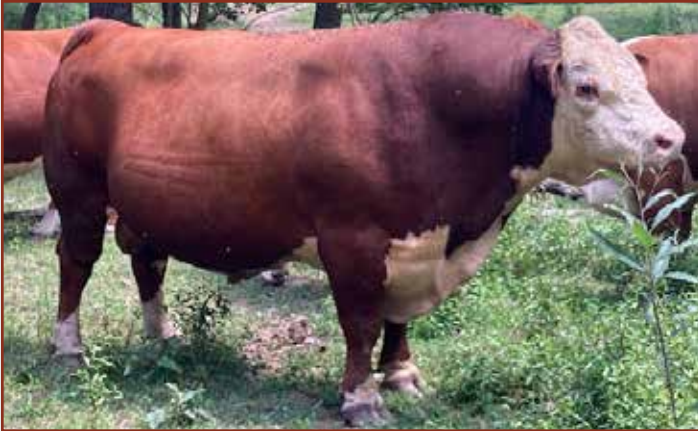
CREEK 611D 6964 FUSION 803F — Sire of Lot 13