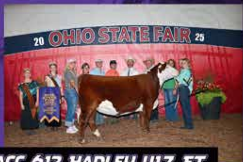
BACC 612 HADLEY 417 ET

GRAND CHAMPION HEREFORD FEMALE 2025 OHIO STATE FAIR