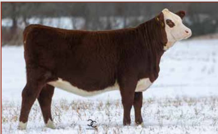
Lot 3 — SHAVER H086 NORA SF43