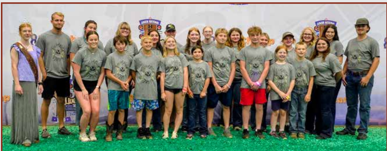
OBJHA Juniors at JNHE 2025