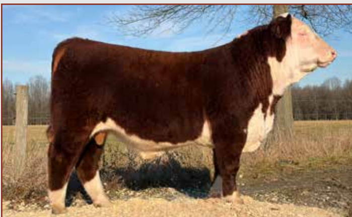
Lot 9 — CLS 10G PATRICK 213W