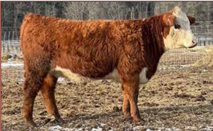
Lot 14 — CSF SUGAR LAMB 718N