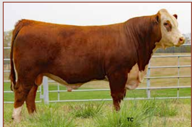
RMB PRIMETIME 341F — Sire of Lot 22