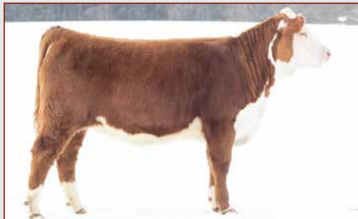
Lot 5 — A&J CHARLOTTE N327