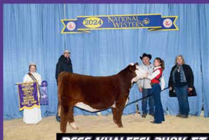
RCSC KHALEESI 248K ET

DIVISION CHAMPION FEMALE N.A.I.L.E. GRAND CHAMPION BRED AND OWNED FEMALE OHIO STATE FAIR