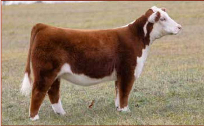
Lot 1 — KOVE NIKIS TIME 415N