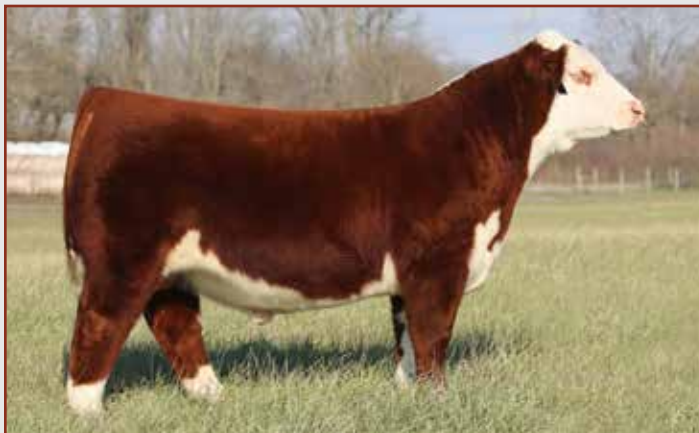
SCG SHOWTIME NO LIMIT 111ET — Sire of Lot 20