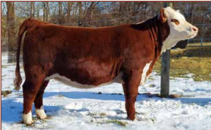
Lot 2 — JB JESSI JB31