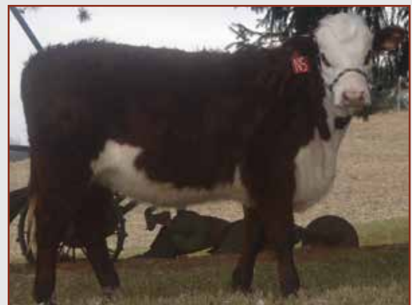
Lot 12 — POH NINA BEDROCK N05