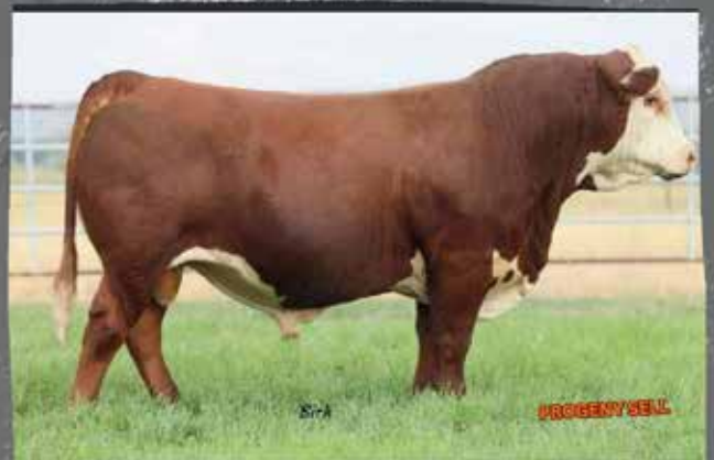
PROGENY 344 TC Mohican Harvest 304L ET

ALEXIS STITZLEIN CELL - 330-231-9538 EMAIL - LEXSTITZ@GMAIL.COM MATT STITZLEIN 330-231-0708