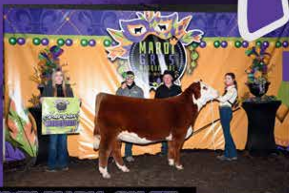
HAWK MARIA 9K ET

EMBRYOS AND PROGENY AVAILABLE THIS FALL!