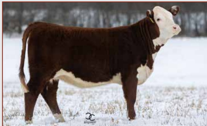
Lot 4 — SHAVER 156J NATALIE SF46