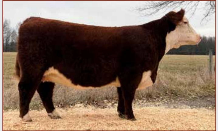
Lot 10 — CLS 418F MISS JUNIPER 123L