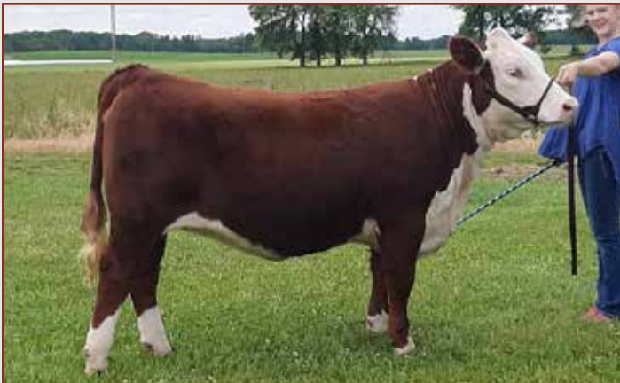
ELM SWEET CHAMOMILE G11 — Dam of Lot 8