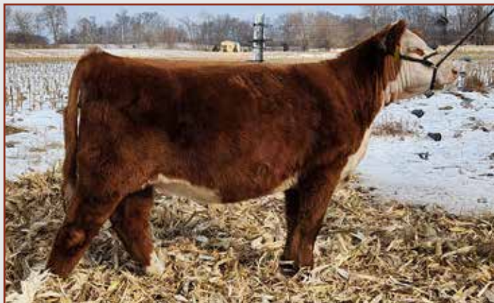
Lot 16 — SRF MISS MOLLY