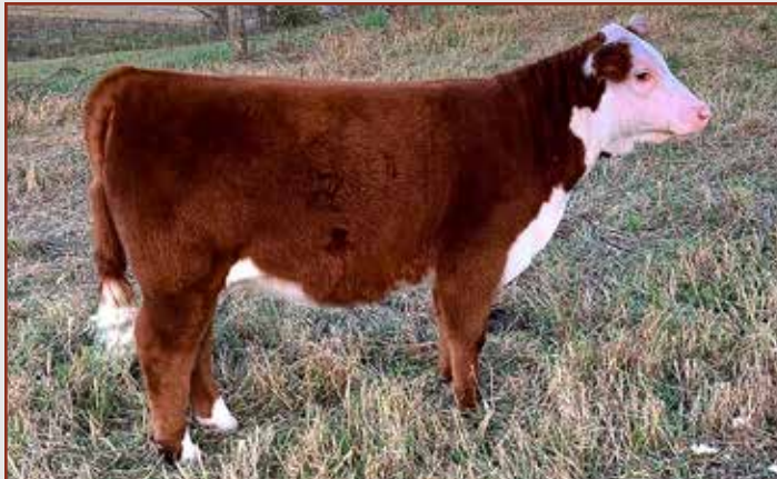
Lot 18 — GHF 2209 MISS ROXIE 2544