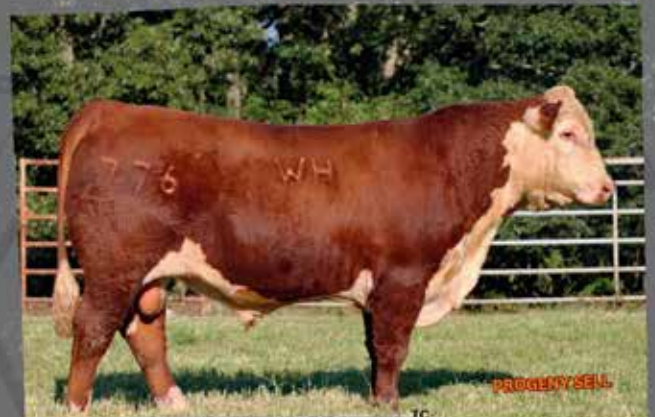
PROGENY 344 TC WHITEHORN 658F 541 ANG 7762