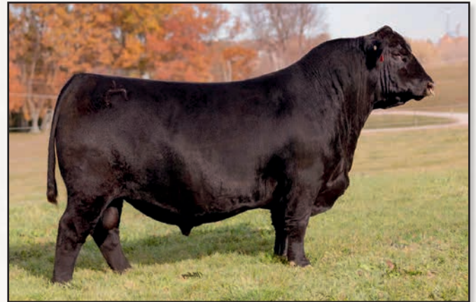
SITZ ETERNITY 739L- REFERENCE SIRE C.