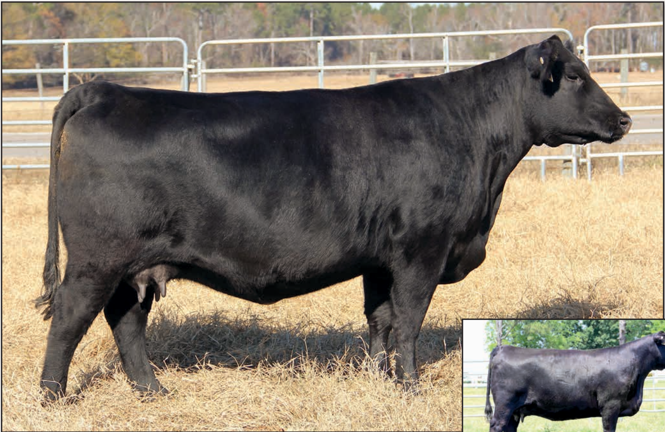
DESTIN EILEENMERE Y76 – SHE SELLS AS LOT 10.