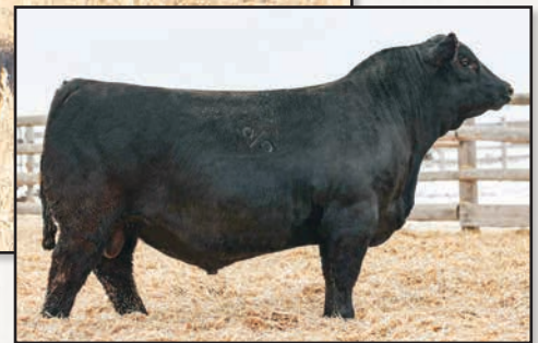
COLEMAN MATERNAL BALANCE 3734 - SIRE OF LOT 7.