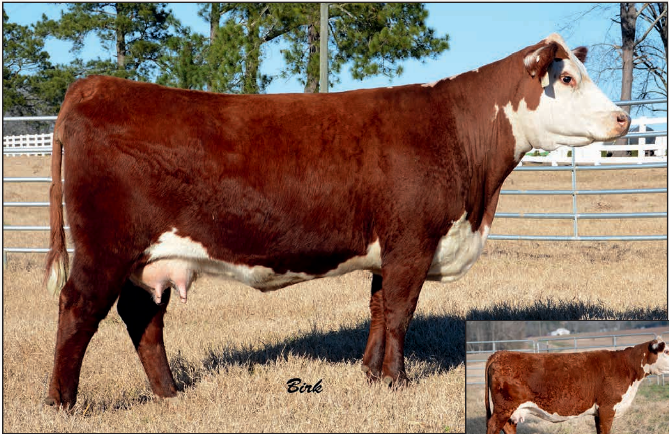
CES BLOOM 145R H100 – DAM OF LOT 102.