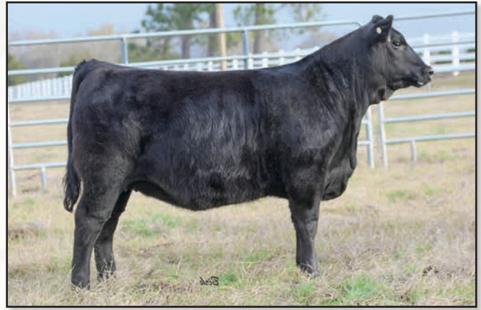
CES FOREVER LADY X111 – MATERNAL SISTER TO LOT 35.