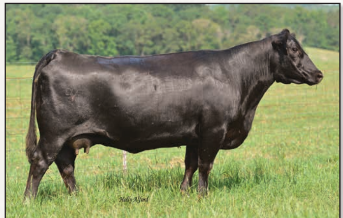
DEER VALLEY BLACKBIRD 3103 – DAM OF LOT 24.