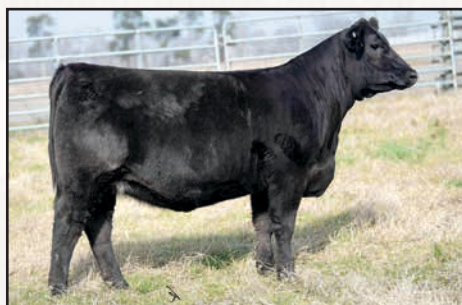
DESTIN BLACKCAP MAY B42 – SHE SELLS AS LOT 20.