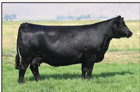
COLEMAN DONNA 9310 – THE $37,500 MATERNAL SISTER TO LOT 1.