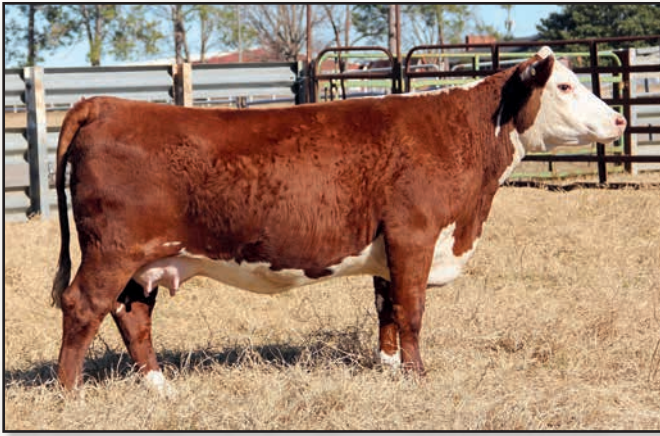
CES BLOOM G16 Y120 – SHE SELLS AS LOT 101.