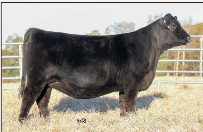
CES GRAYSTONE LUCY W117 – MATERNAL SISTER TO THE DAM OF LOT 14.