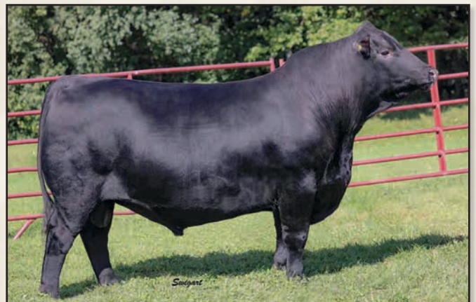
PEAK DRAFT PICK – REFERENCE SIRE B.