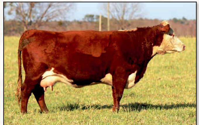
CES JULIA 4009 E195 – GRANDDAM OF LOTS 106A AND 106B.