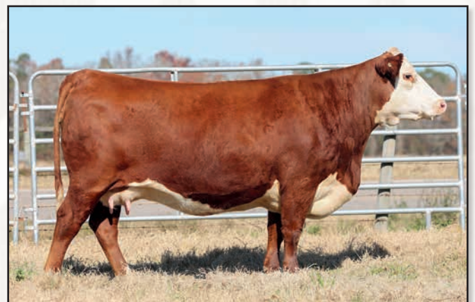
DESTIN DIXIE 174E W117 – MATERNAL SISTER TO LOT 125.