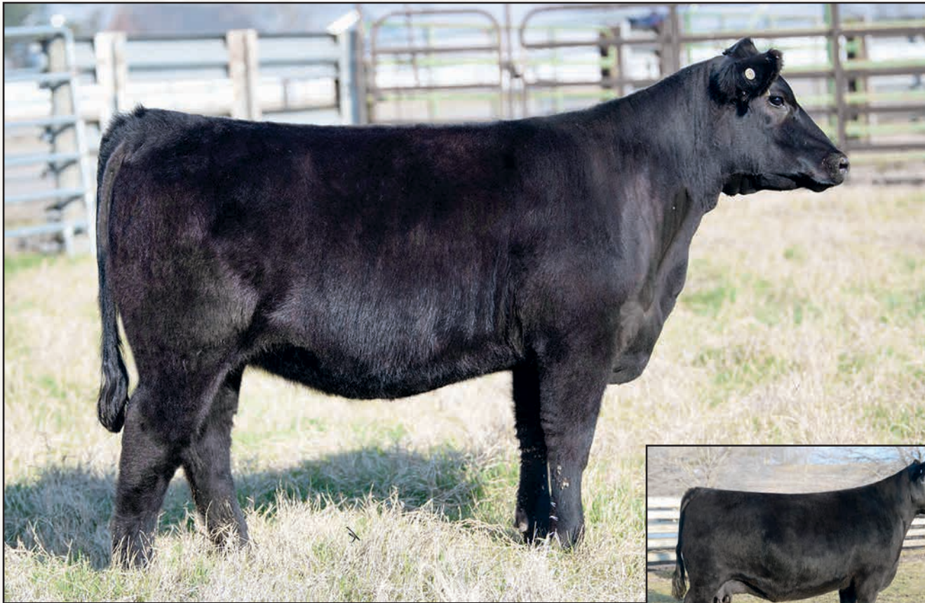
CES FLY MISS DOZA B61 – SHE SELLS AS LOT 6B.