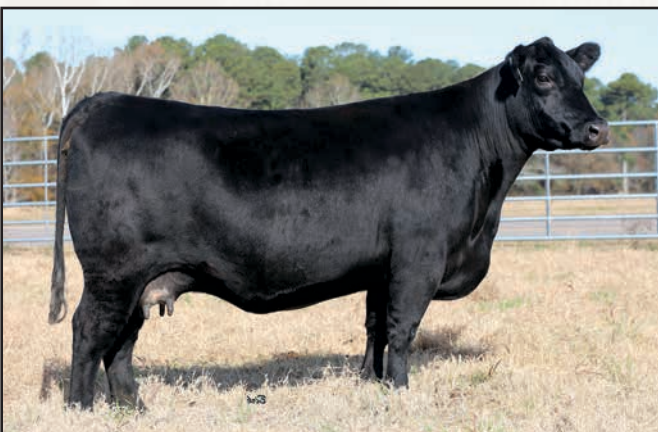
SFCC TRM JG STORMY 8146 – DAM OF LOT 4.