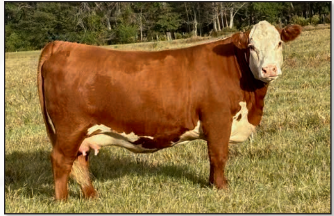
CES ALLIE BELLE H49 A13 ET– FLUSH TO THE BULL OF BUYER'S CHOICE SELLS AS LOT 104.