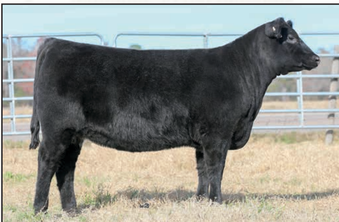
CES BARBARA Z188 – STEMS FROM THE SAME FAMILY AS LOTS 27 AND 28.