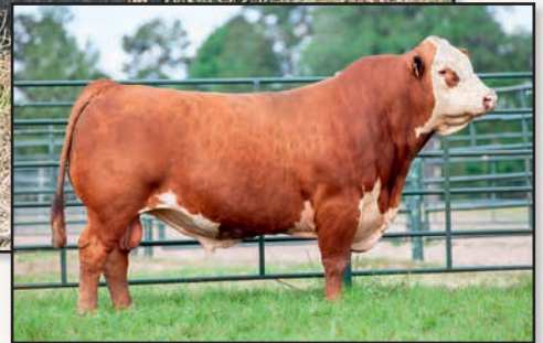
/S ARSENOL 00161 ET – SIRE OF LOT 118.