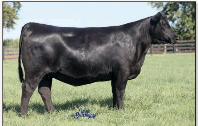
TAMME QUEEN 287 – DAM IS A MATERNAL SISTER TO THE GRANDDAM OF LOT 26.