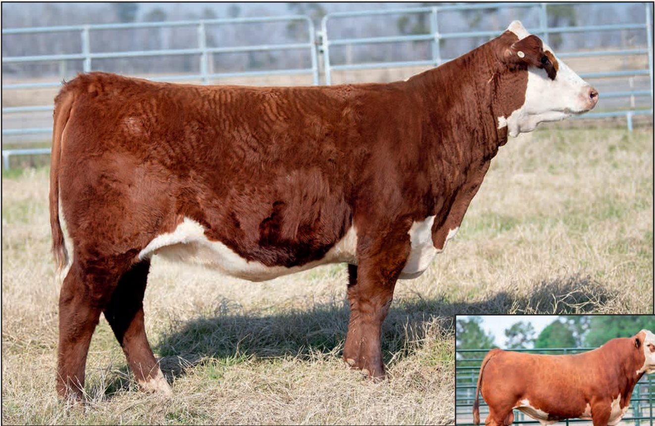
DESTIN SUNNY Y146 B37 – SHE SELLS AS LOT 119B.