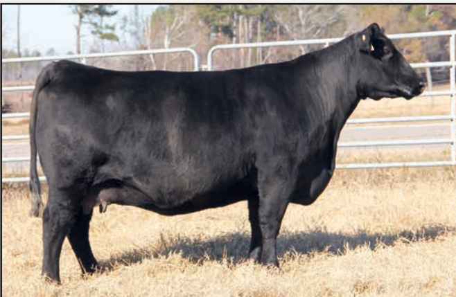
DESTIN WV EILEENMERE U68 – DAM OF LOTS 7-8 AND 9.