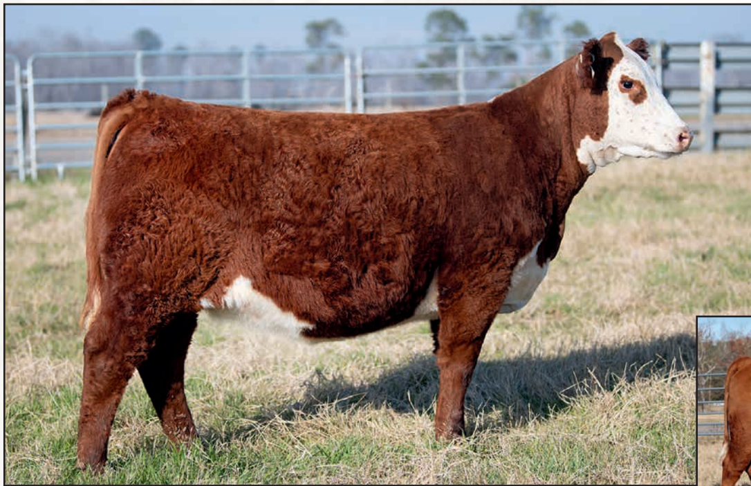
CES K ONE JULIA 3316L B81 – SHE SELLS AS LOT 107.

CES JULIA R1 U43 – Granddam of Lot 107 and dam of Lot 108.