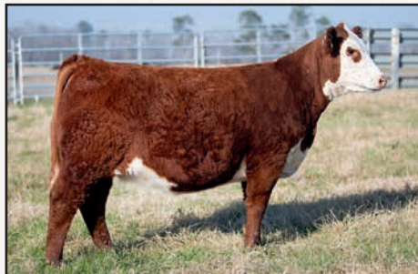
CES K ONE JULIA 3316L B81 – SHE SELLS AS LOT 107.