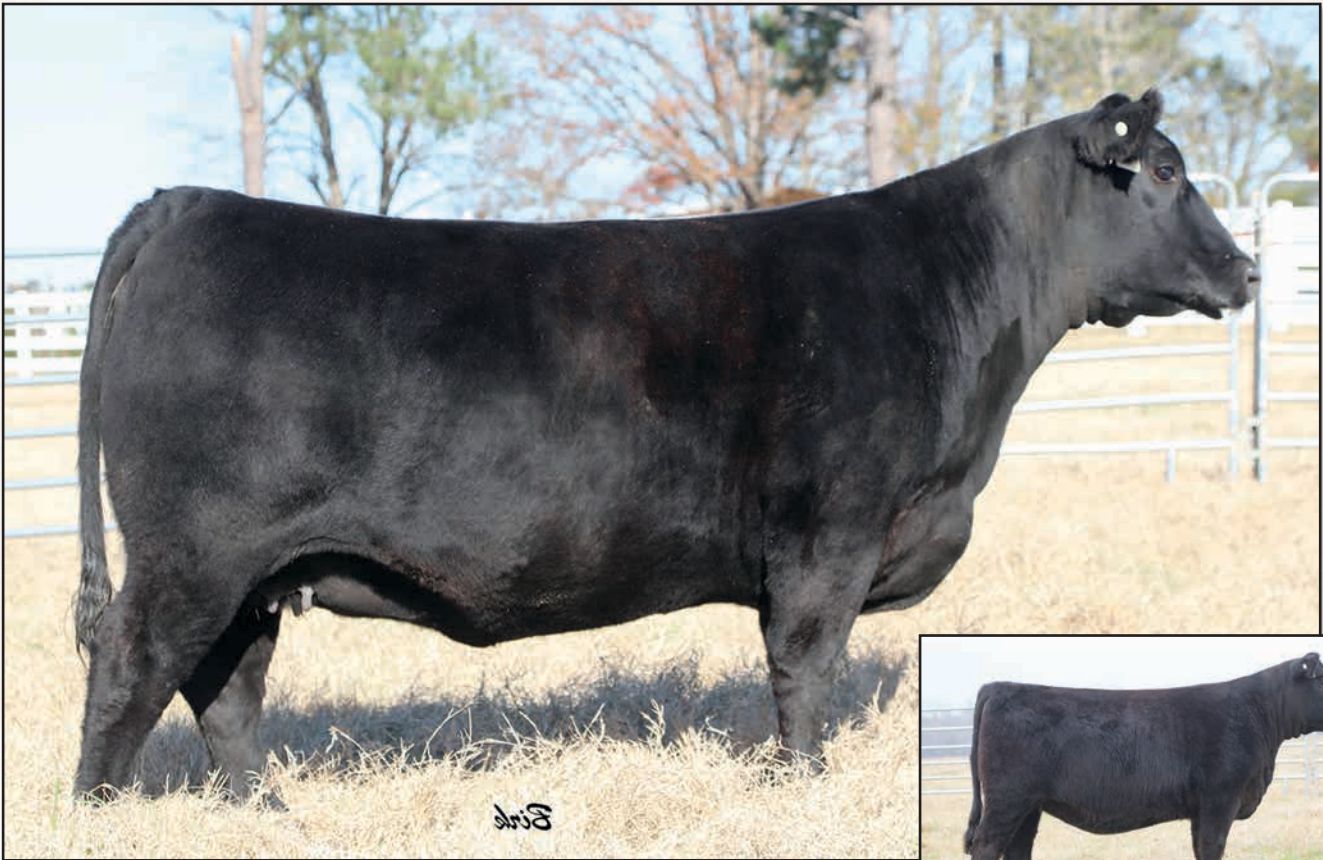
S/A FANNY T9 – DAM OF LOT 22.