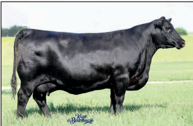
MYERS QUEEN M408 – STEMS FROM THE SAME FAMILY AS LOTS 26-26B.