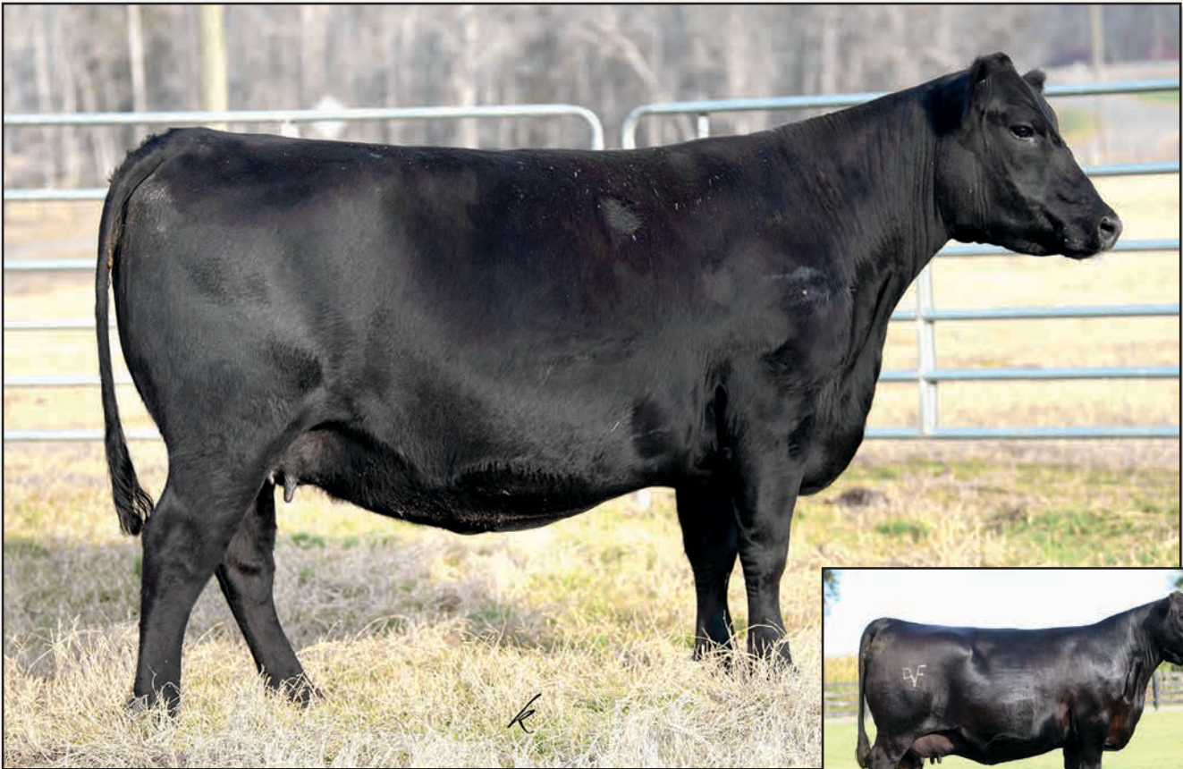
CES BLACKBIRD Y97 – SHE SELLS AS LOT 25.