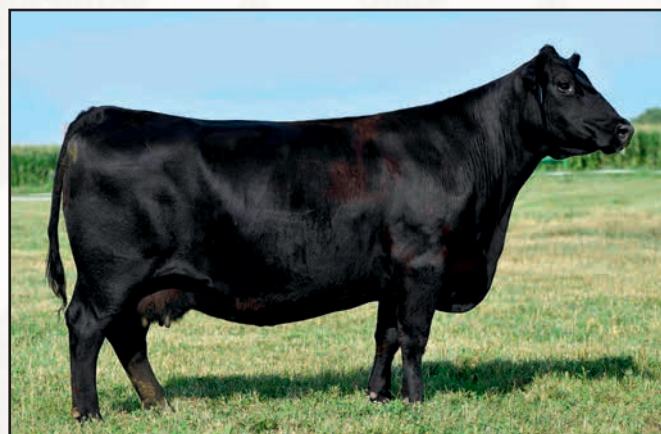
K A LADY BARBARA 1009 – GRANDDAM OF LOT 19.