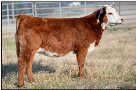
DESTIN CES BLOOM Z73 C1 – SHE SELLS AS LOT 101A.