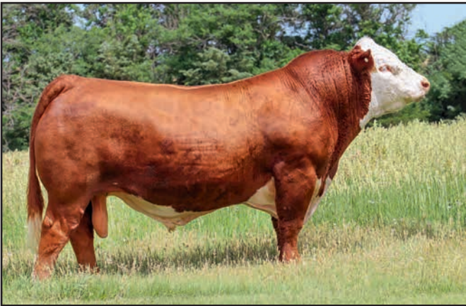
KJ TWJ 907E LIBERTY 159H ET - REFERENCE SIRE H.