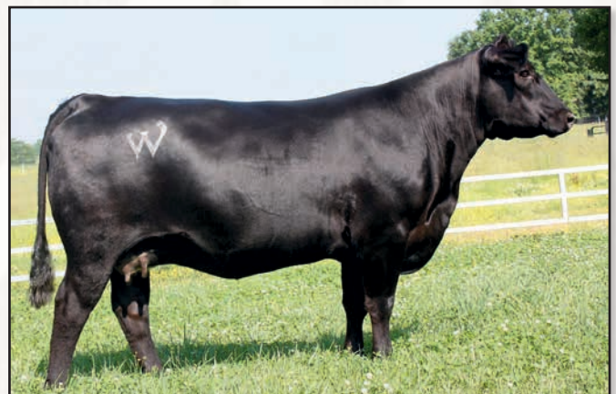
WHITESTONE BLACKBIRD W260 – THIRD DAM OF LOT 31.