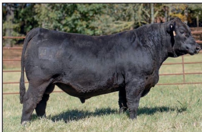
E/T TALMO - THE $24,000 SON OF REFERENCE SIRE A.