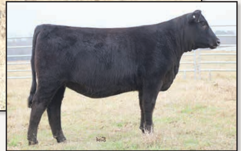
CES FANNY X62 – THE $10,000 FULL SISTER TO LOT 22.