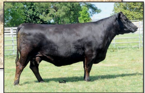
BOHI DONNA 7600 – GRANDDAM OF LOT 2.