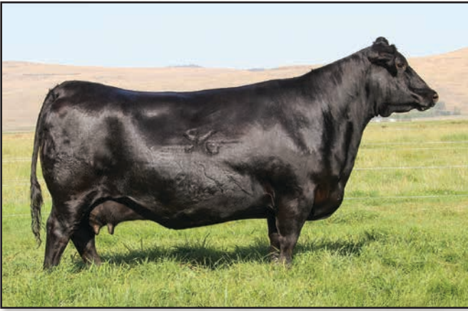
COLEMAN ABIGALE 0277 – DAM OF LOT 32.