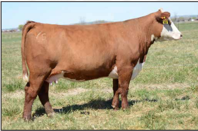
/S LADY PEERLESS 4007B - DAM OF LOT 115