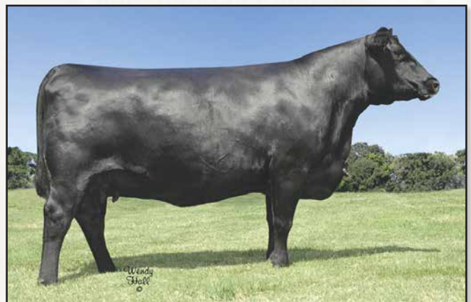
YR FOREVER LADY 715C - THIRD DAM OF LOTS 33 AND 34.