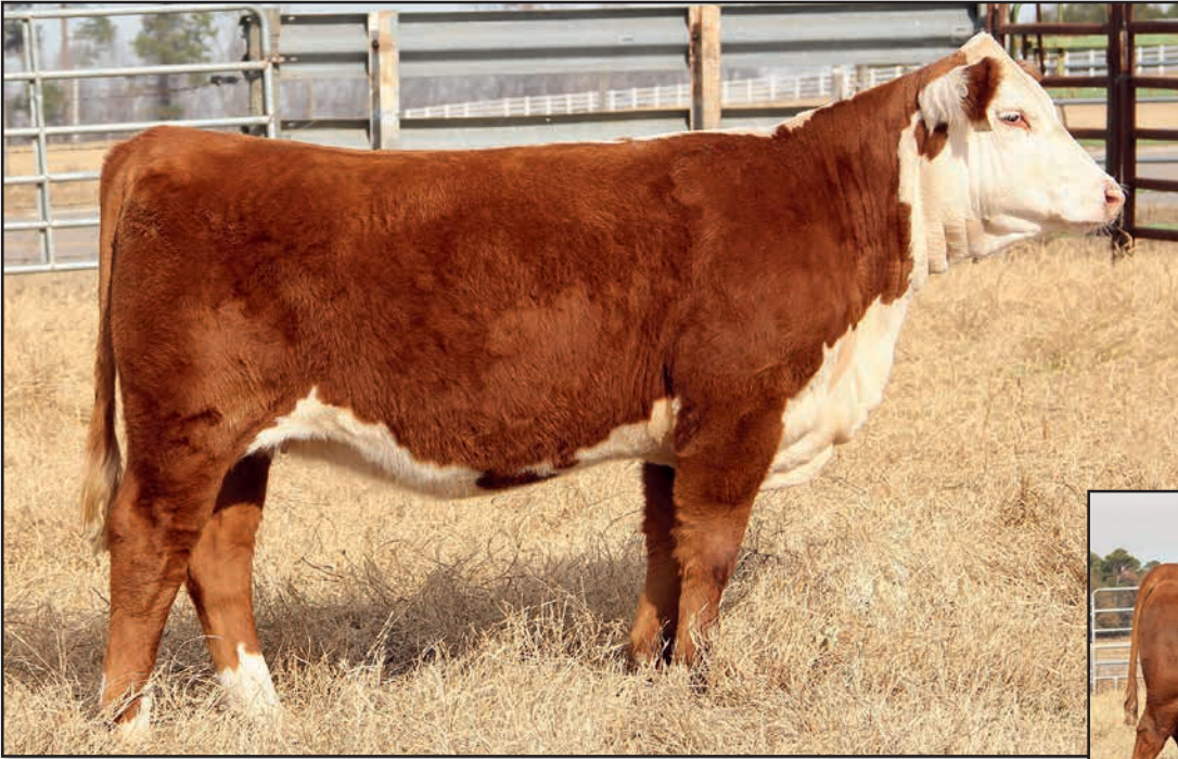
DESTIN DAISY BELLE 3316 B120 – SHE SELLS AS LOT 105A.

CES DEFINITIVE H49 Z73 – Full brother to the dam of Lots 105A and 105B.