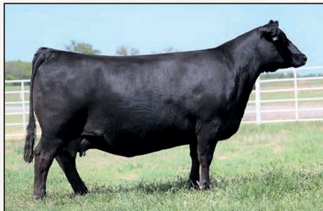
COLEMAN DONNA 9309 – THE $20,000 FULL SISTER TO THE DAM OF LOTS 1A-1E.