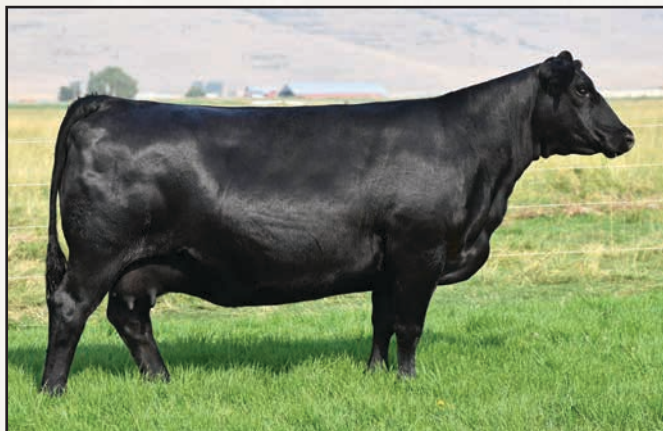
COLEMAN DONNA 9308 – THE $14,000 FULL SISTER TO THE DAM OF LOTS 1A-1E.