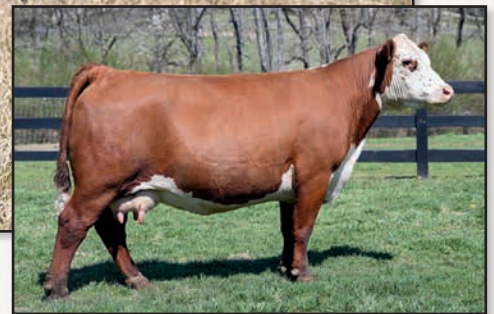
CES REIGNS 33B W5 ET – DAM OF LOT 114.