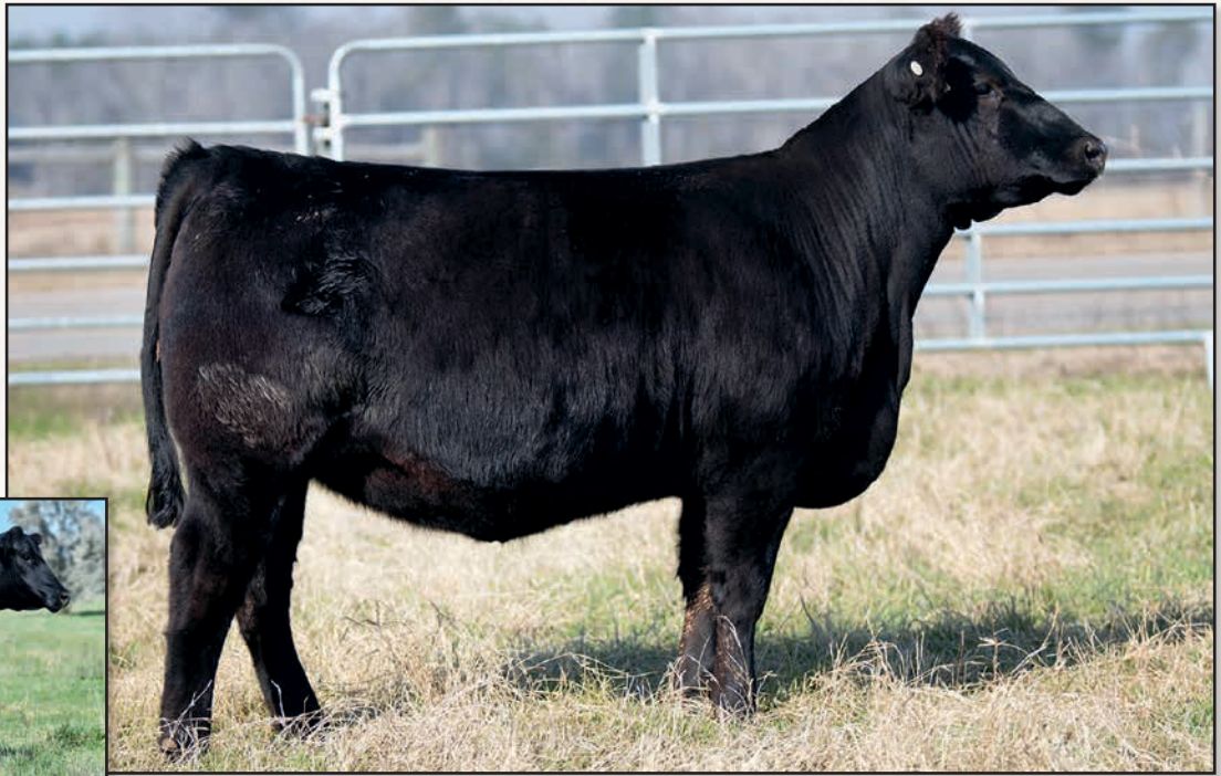
SITZ PRIDE 200B – Paternal granddam of Lots 4A and 4B.