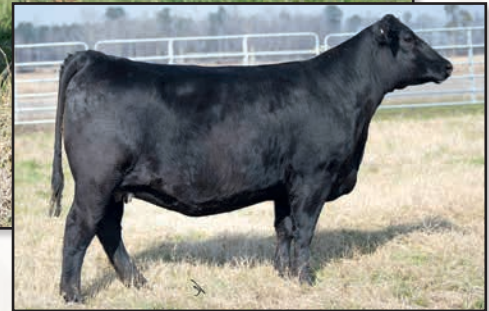
DESTIN EILEENMERE Z30 – SHE SELLS AS LOT 9.