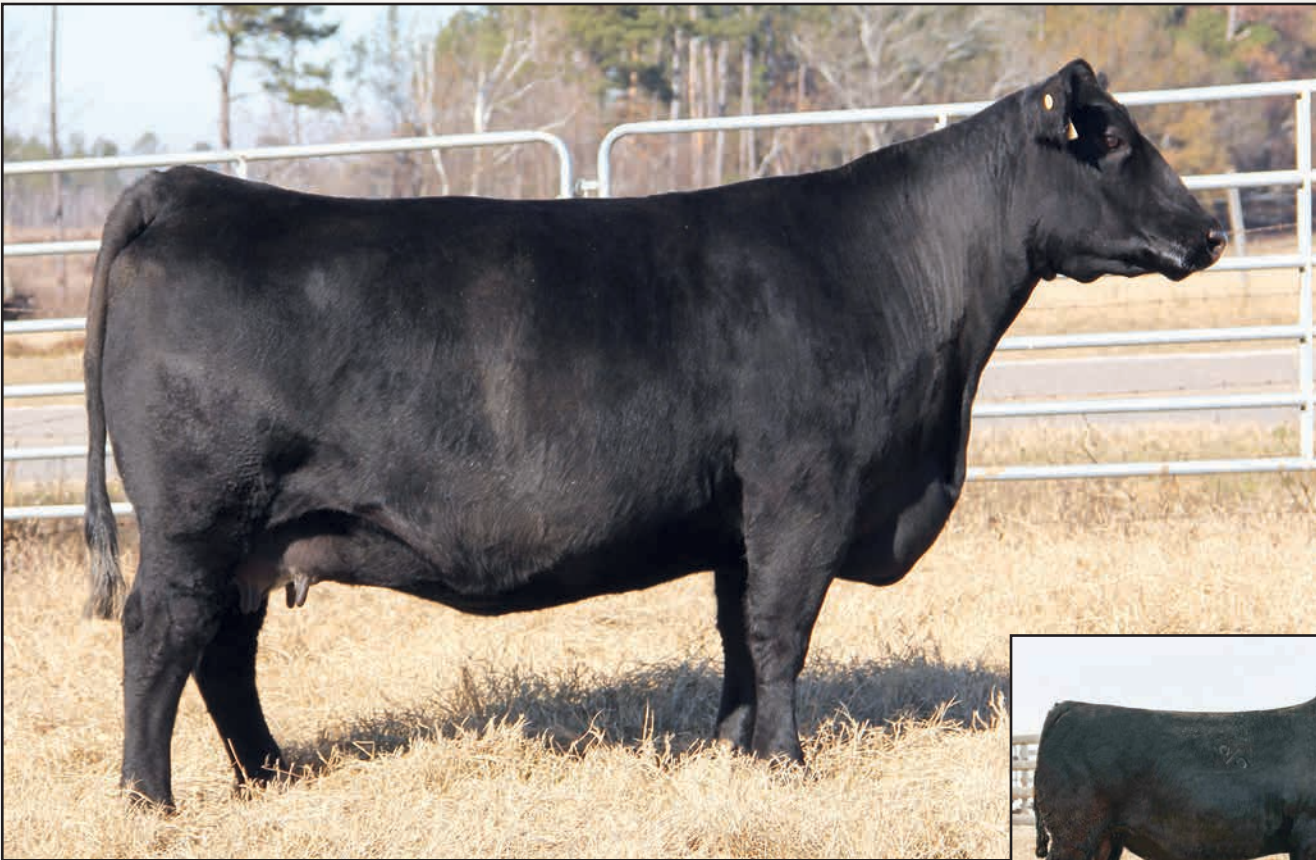
DESTIN WV EILEENMERE U68 – DAM OF LOTS 7 AND 7A.