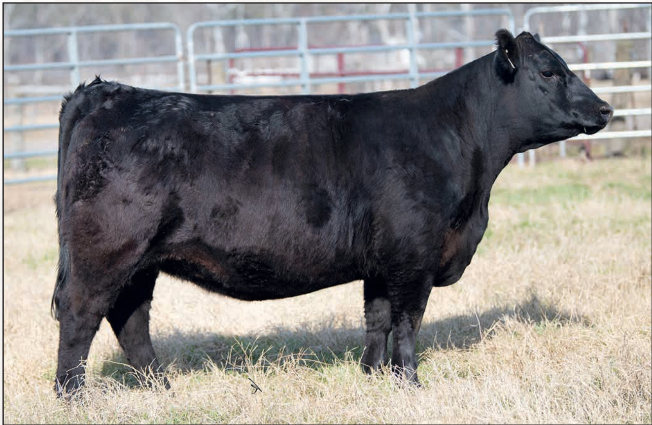
DESTIN GS JUDY B18 – SHE SELLS AS LOT 16.