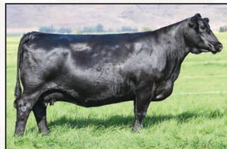
COLEMAN DONNA 0105 – A FULL SISTER TO LOT 1.