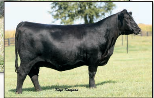
TAMME VALLEY QUEEN 814 – DAM OF LOT 26.