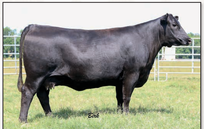
S/A BARBARA M161 – STEMS FROM THE SAME FAMILY AS LOTS 27 AND 28.