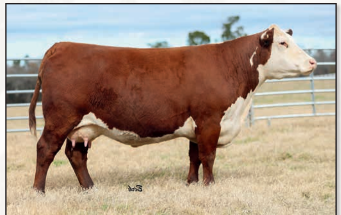
CES REIGNS L9 N155 – GRANDDAM OF LOT 114.