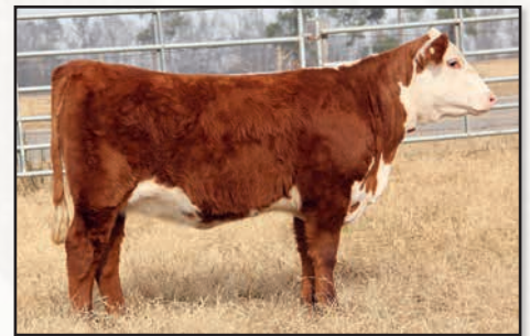
CES BELLE 3316L B72 – SHE SELLS AS LOT 105B.