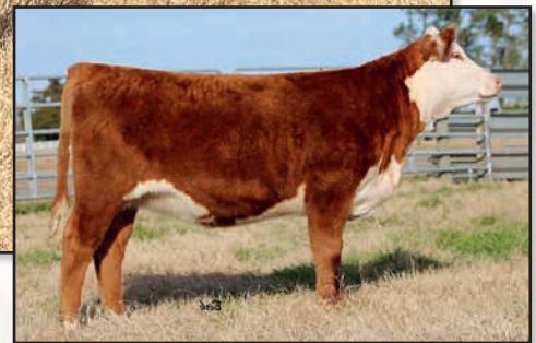
DESTIN BELLE H49 Z74 – FULL SISTER TO LOT 103.