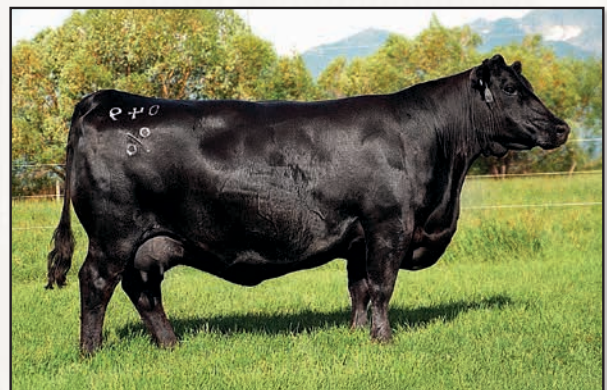
KMK DONNA J311 – THE THIRD DAM OF LOT 2.