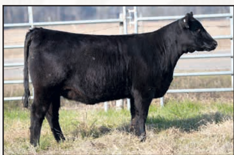
DESTIN DONNA B81 – SHE SELLS AS LOT 1B.