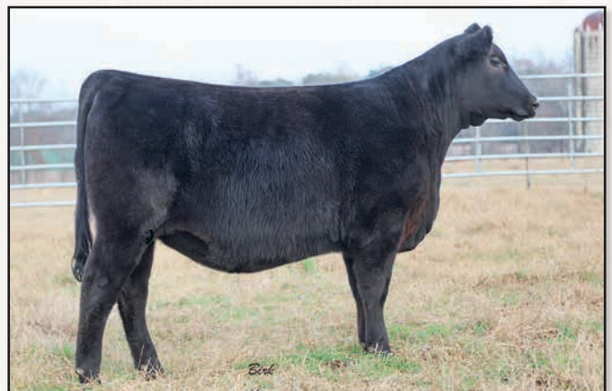
CES GRAYSTONE LUCY X105 – DAM IS A MATERNAL SISTER TO THE DAM OF LOT 14.