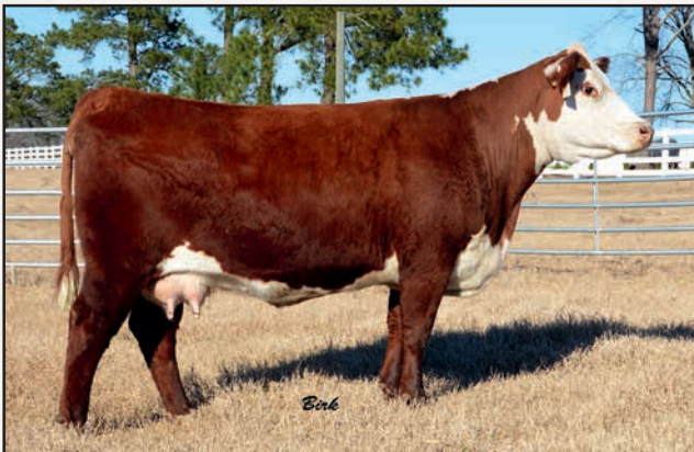
CES BLOOM 145R H100 – GRANDDAM OF LOT 101.