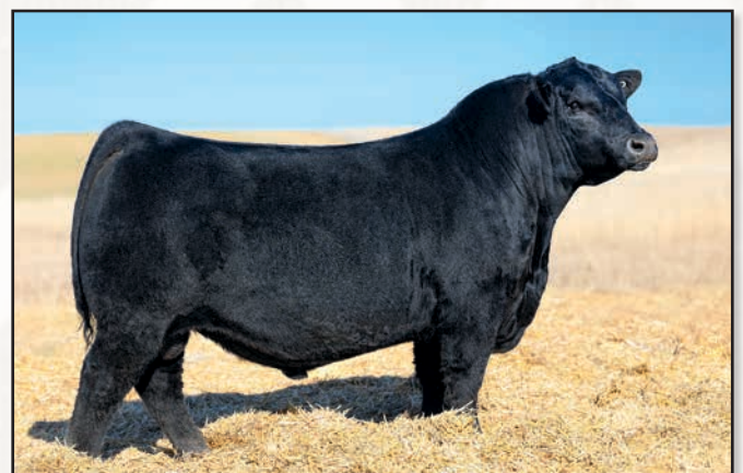
KR INSPIRATION 3078 – SIRE OF LOT 10A.