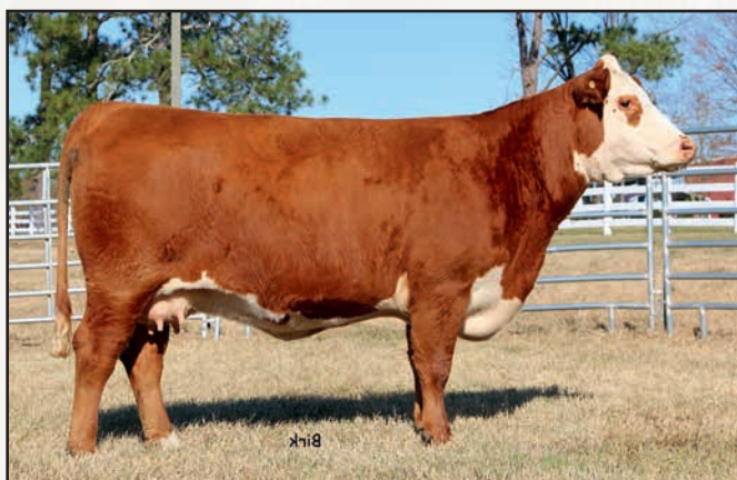
CPH SUNNY 100W K187 – GRANDDAM OF LOT 111.