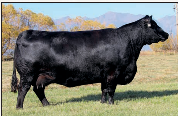
COLEMAN DONNA 801 – THE $48,000 FULL SISTER TO THE GRANDDAM OF LOT 2.