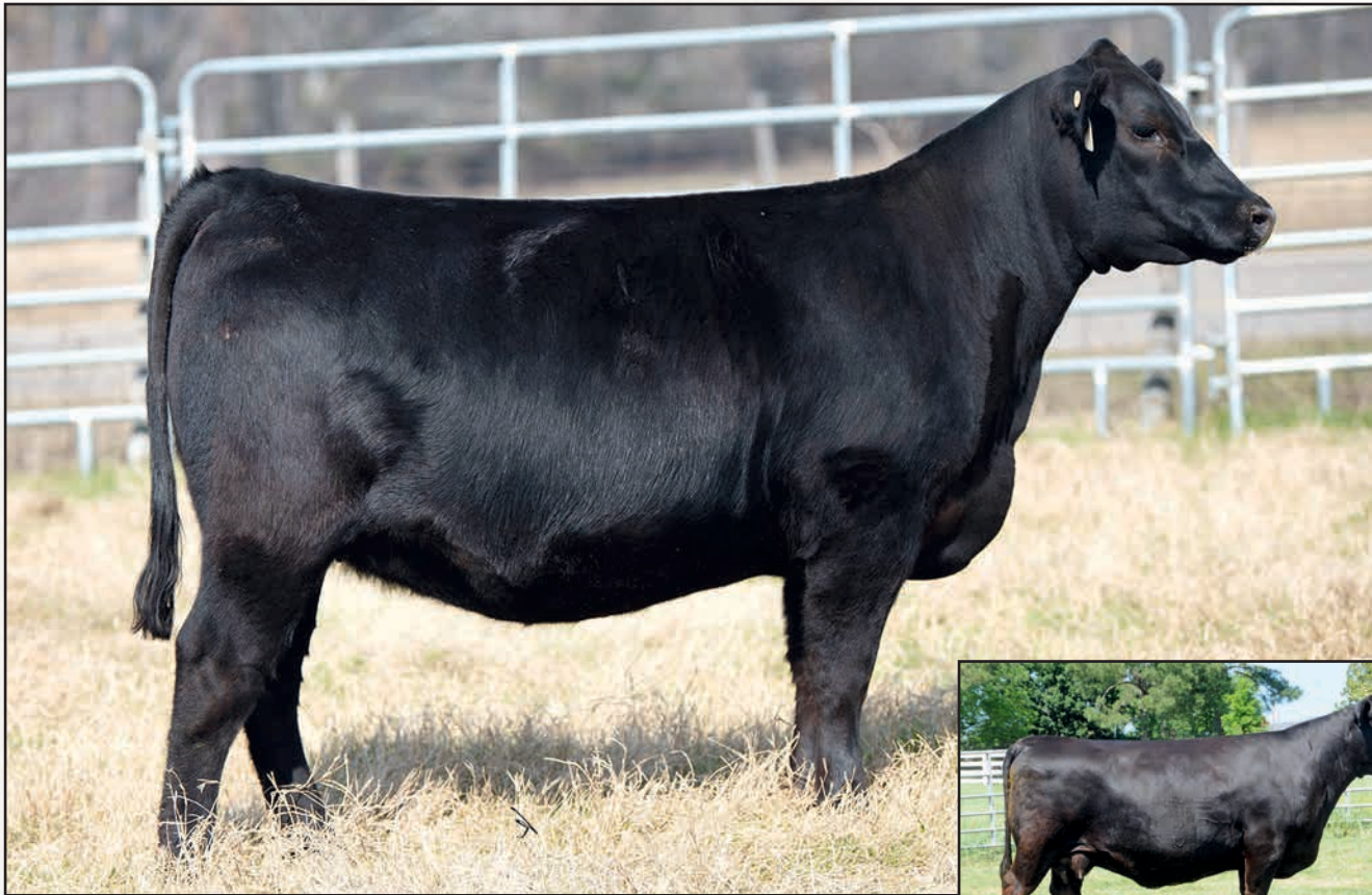
DESTIN DONNA B3 – SHE SELLS AS LOT 2.