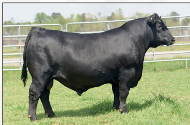
CES FA DEEP TRUST A28 – SON OF REFERENCE SIRE WHO SELLS AS LOT 4.