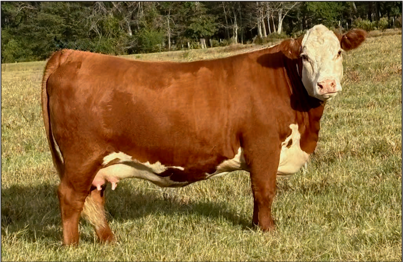
CES ALLIE BELLE H49 A13 ET – DAM OF LOT 104.