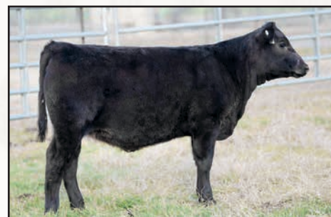
CES GS LUCY C34 – SHE SELLS AS LOT 15A.