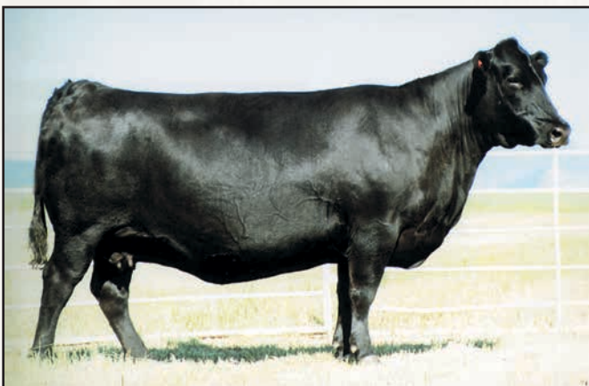
SITZ BARBARA PERFECTION 1882 – STEMS FROM THE SAME FAMILY AS LOTS 29-29B.