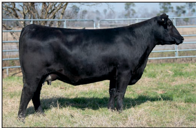
DESTIN EILENMERE Z26 – SHE SELLS AS LOT 8.