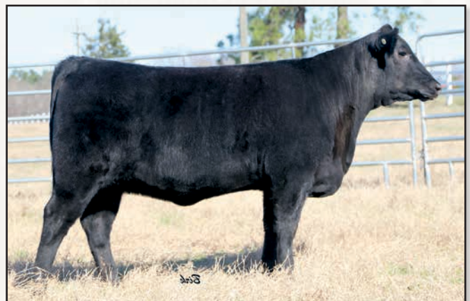
DESTIN PETUNIA T117 – MATERNAL SISTER TO THE GRANDDAM OF LOT 11.