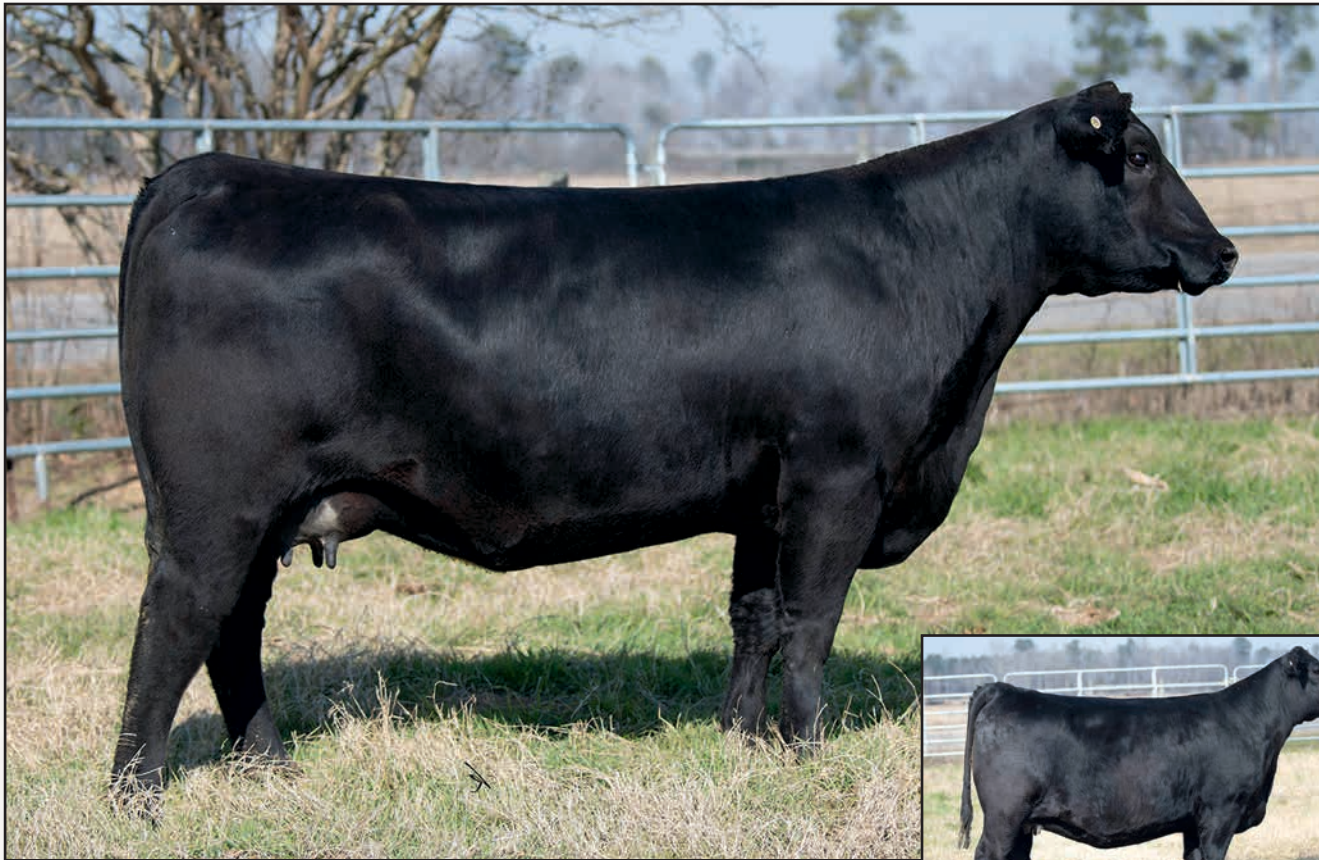
DESTIN EILEENMERE Z26 – SHE SELLS AS LOT 8.