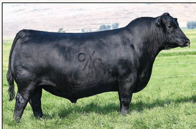
COLEMAN BELOW ZERO 2106 – THE $300,000 VALUED TOP SELLER WHOSE GRANDDAM IS A FULL SISTER TO THE GRANDDAM OF LOT 1.