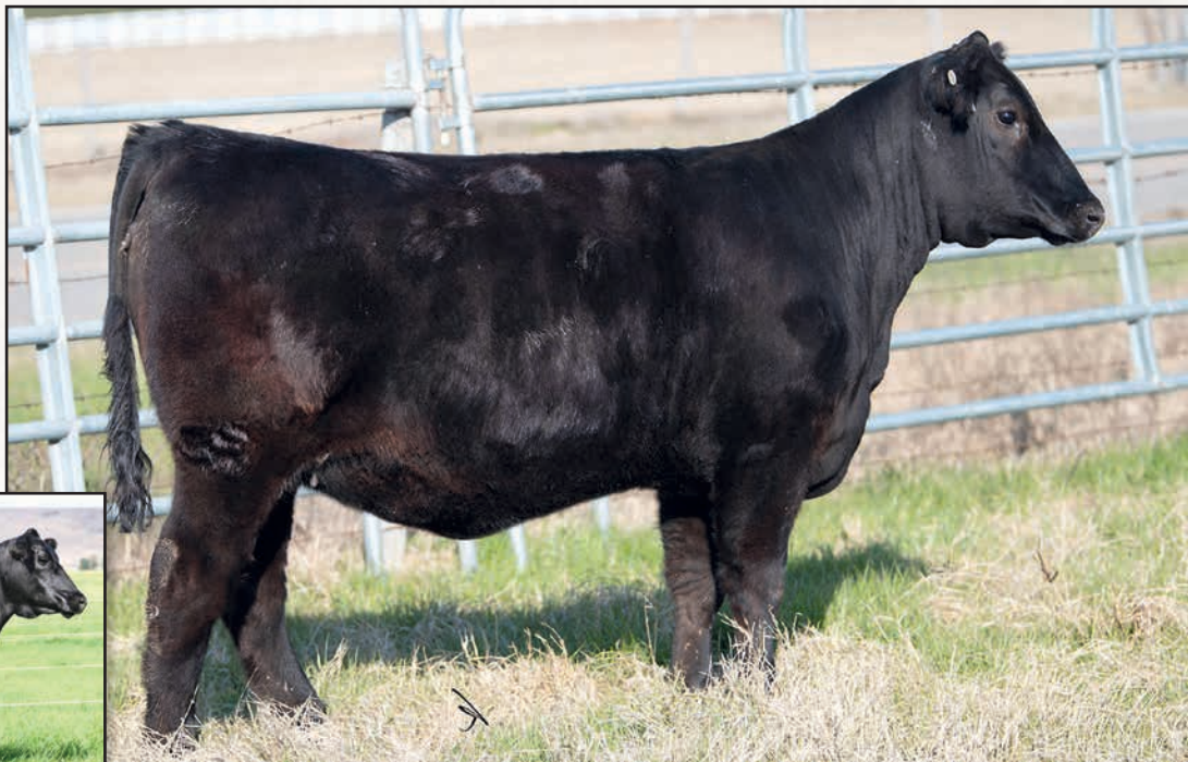
COLEMAN DONNA 0105 – A full sister to the dam of Lots 1A-1E.