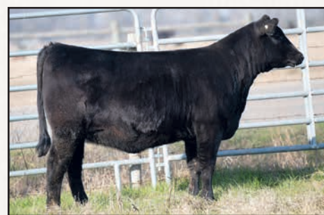
DESTIN DONNA B103 – SHE SELLS AS LOT 1D.