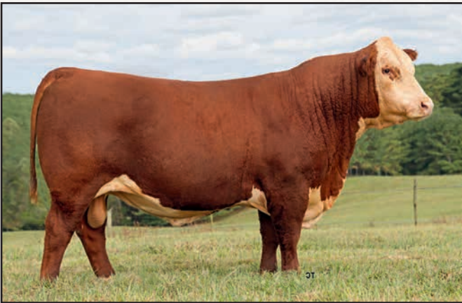
KCF BENNETT DOMINION K510 - REFERENCE SIRE I.