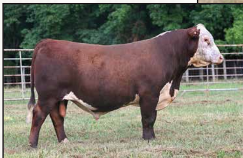
DESTIN Armory 00161 Y146 – Sire of Lot 109