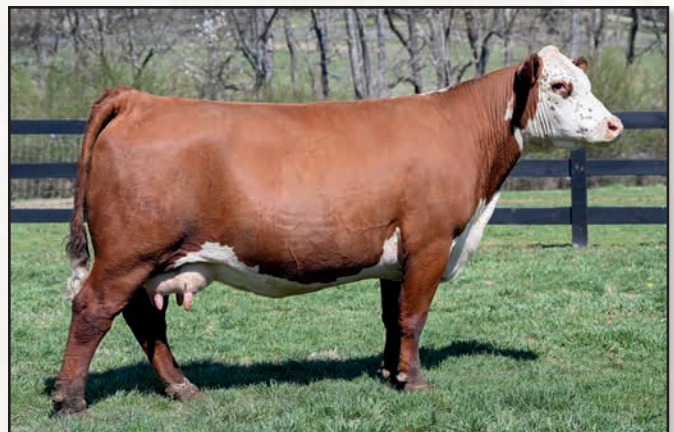
CES REIGNS 33B W5 ET – HER DAUGHTER SELLS AS LOT 114