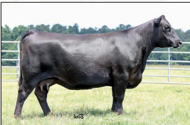
BRICTON FANNY 2037 – GRANDDAM OF LOT 22.