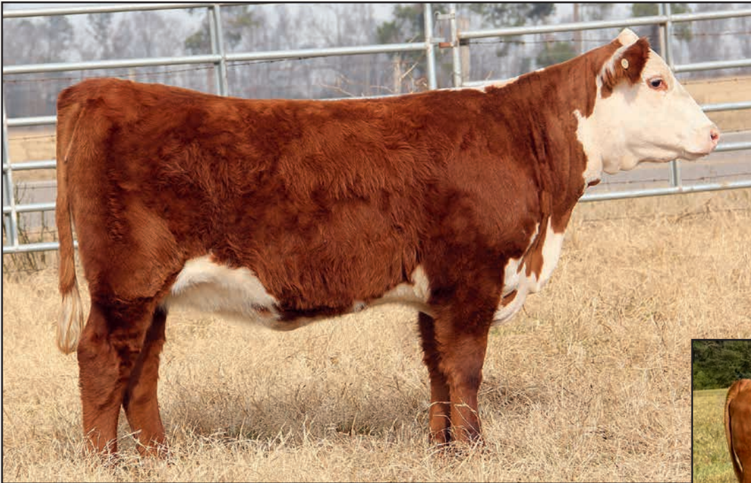
CES BELLE 3316L B72 – SHE SELLS AS LOT 105B.

CES ALLIE BELLE H49 A13 – A FULL SISTER TO THE DAM OF LOTS 105A AND 105B.