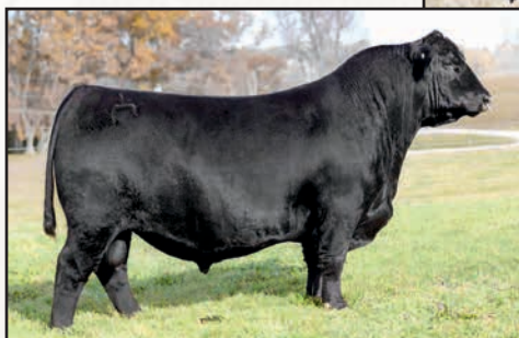
SITZ ETERNITY 739L – SIRE OF LOTS 4A AND 4B.