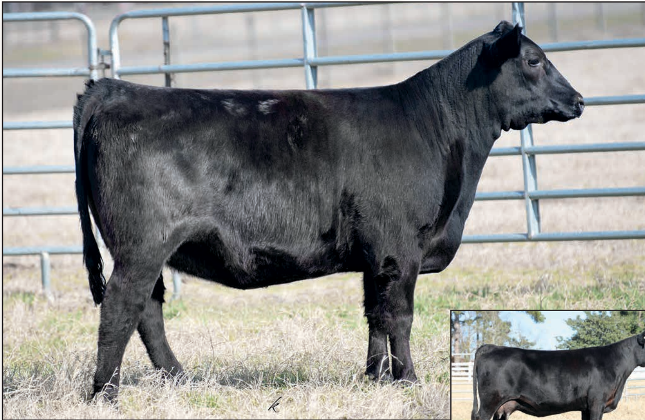
DESTIN PETUNIA B5 – SHE SELLS AS LOT 11.