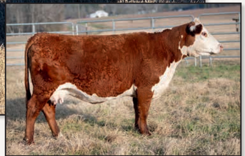
CES STONEGATE BLOOM X73 ET – SHE SELLS AS LOT 102.