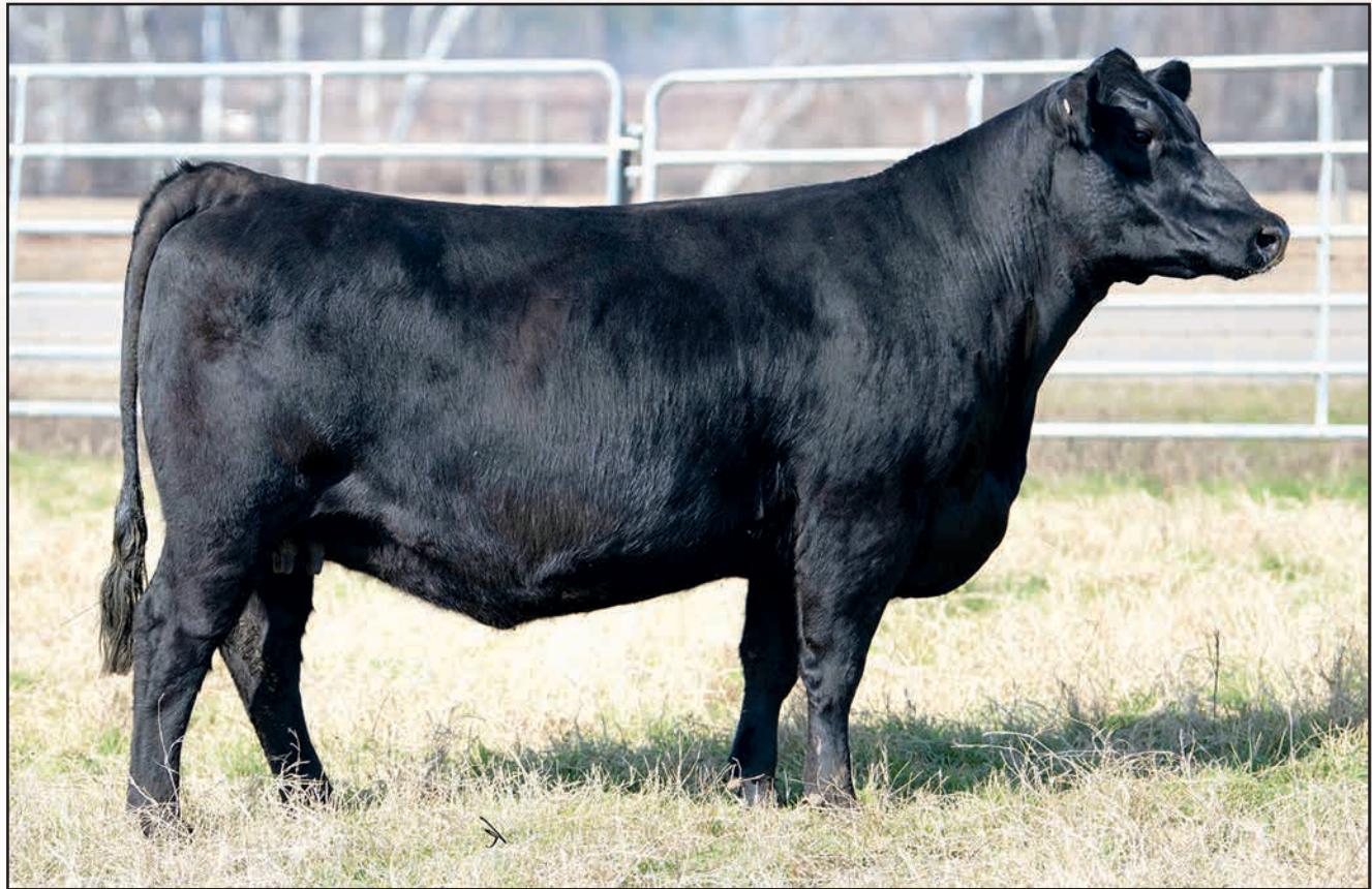
CES BLACKBIRD Z31 – SHE SELLS AS LOT 31.