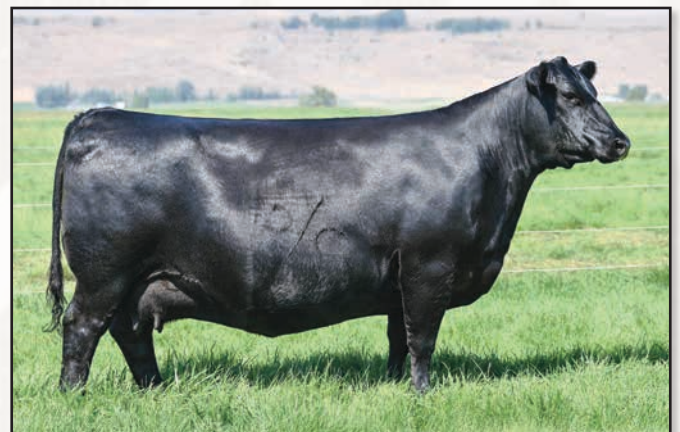
COLEMAN DONNA 9220 – THE $90,000 MATERNAL SISTER TO LOT 1.