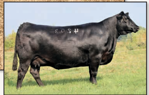
COLEMAN DONNA 4203 – THE $90,000 VALUED DAM OF LOT 1.