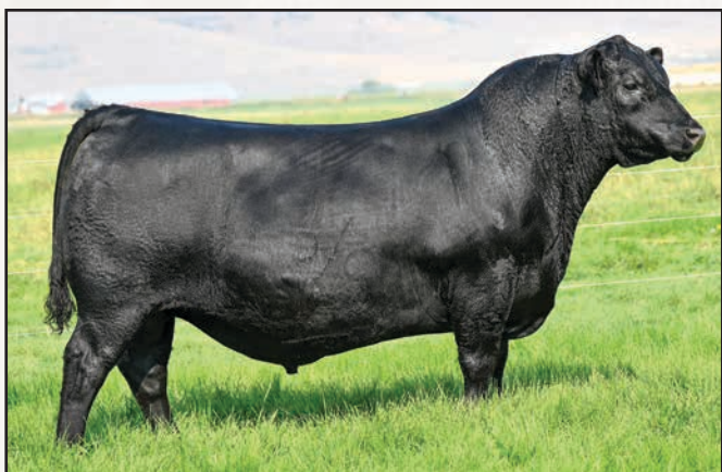
COLEMAN BANKER 9215 – THE $150,000 VALUED FULL BROTHER TO LOT 1.