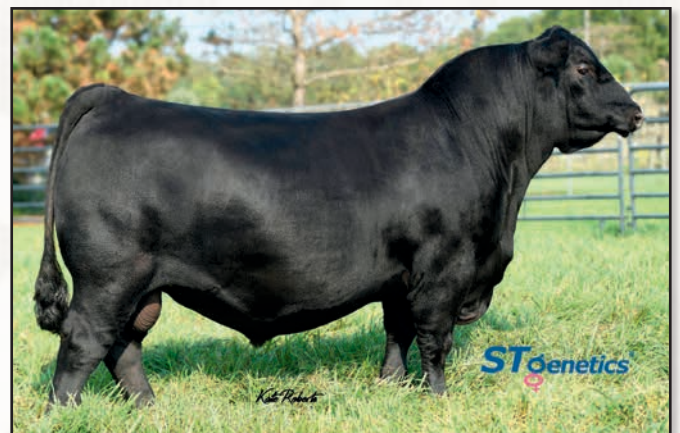
CONNEALY COMMERCE- REFERENCE SIRE E.