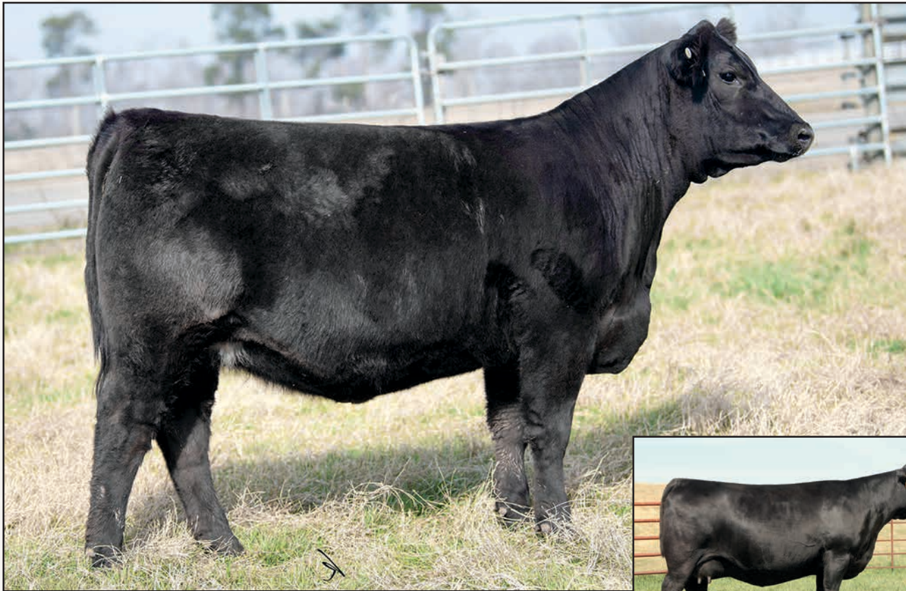
DESTIN BLACKCAP MAY B42 – SHE SELLS AS LOT 20.