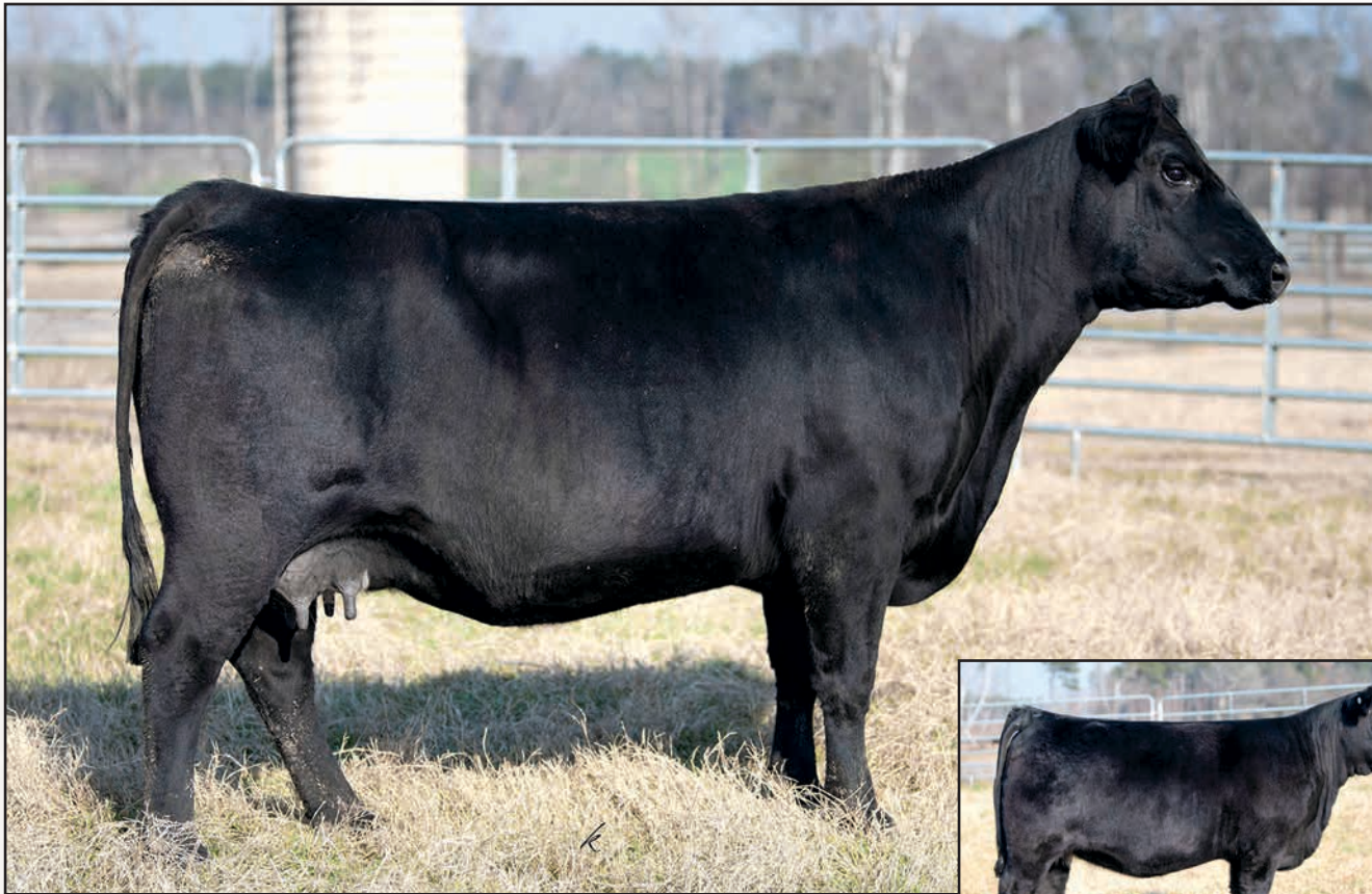
CES BARBARA X163 – SHE SELLS AS LOT 29.