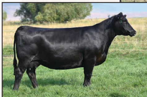
COLEMAN DONNA 9307 – THE $15,000 FULL SISTER TO THE DAM OF LOTS 1A-1E.

DESTIN DONNA B103 – SHE SELLS AS LOT 1D.