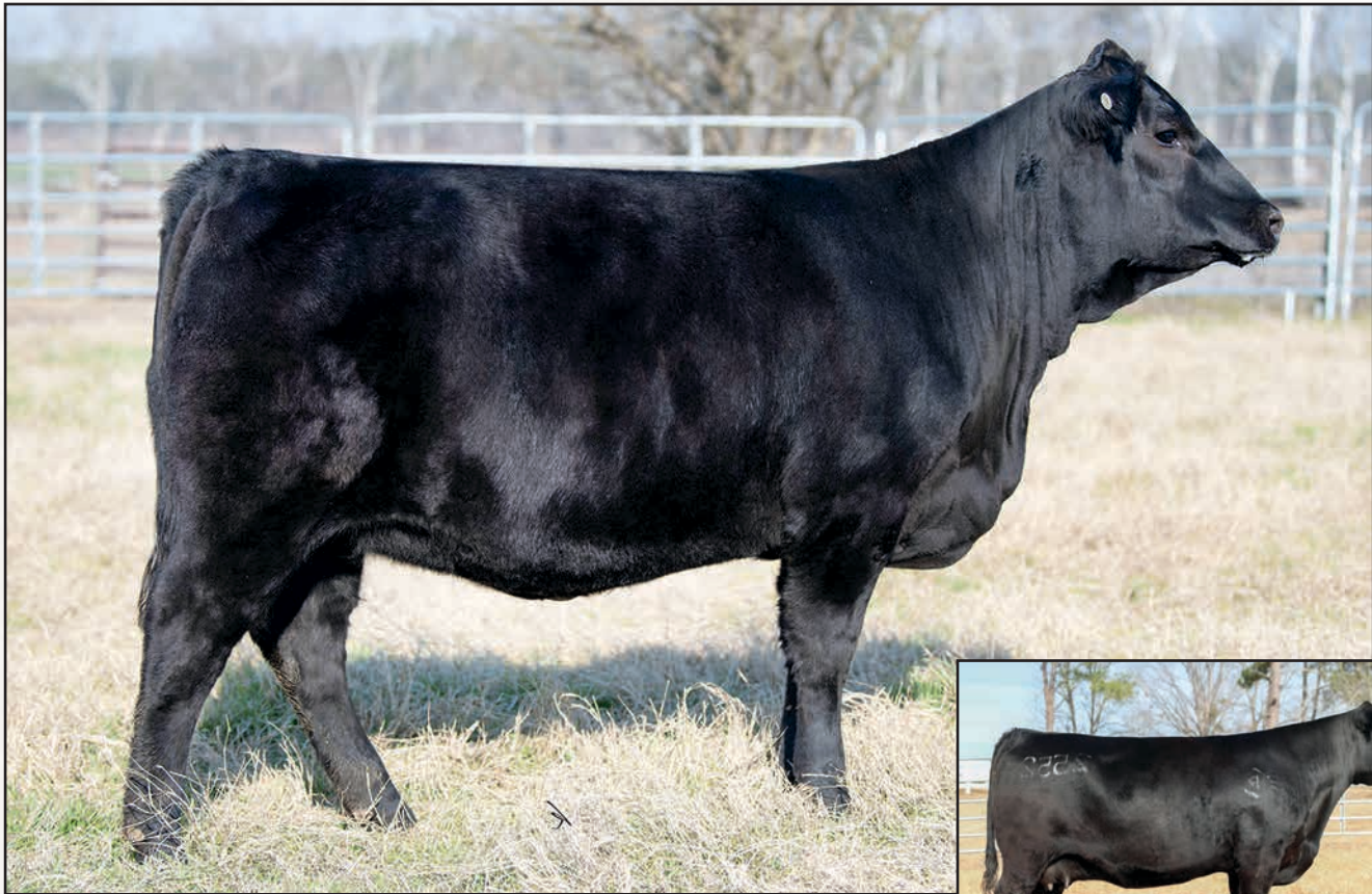
CES GS LUCY B53 – SHE SELLS AS LOT 14.