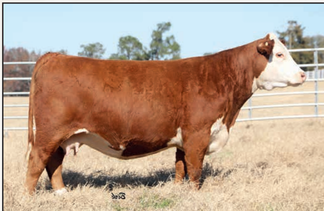
DESTIN SUNNY 65Z R5 – MATERNAL SISTER TO LOTS 120 AND 121.