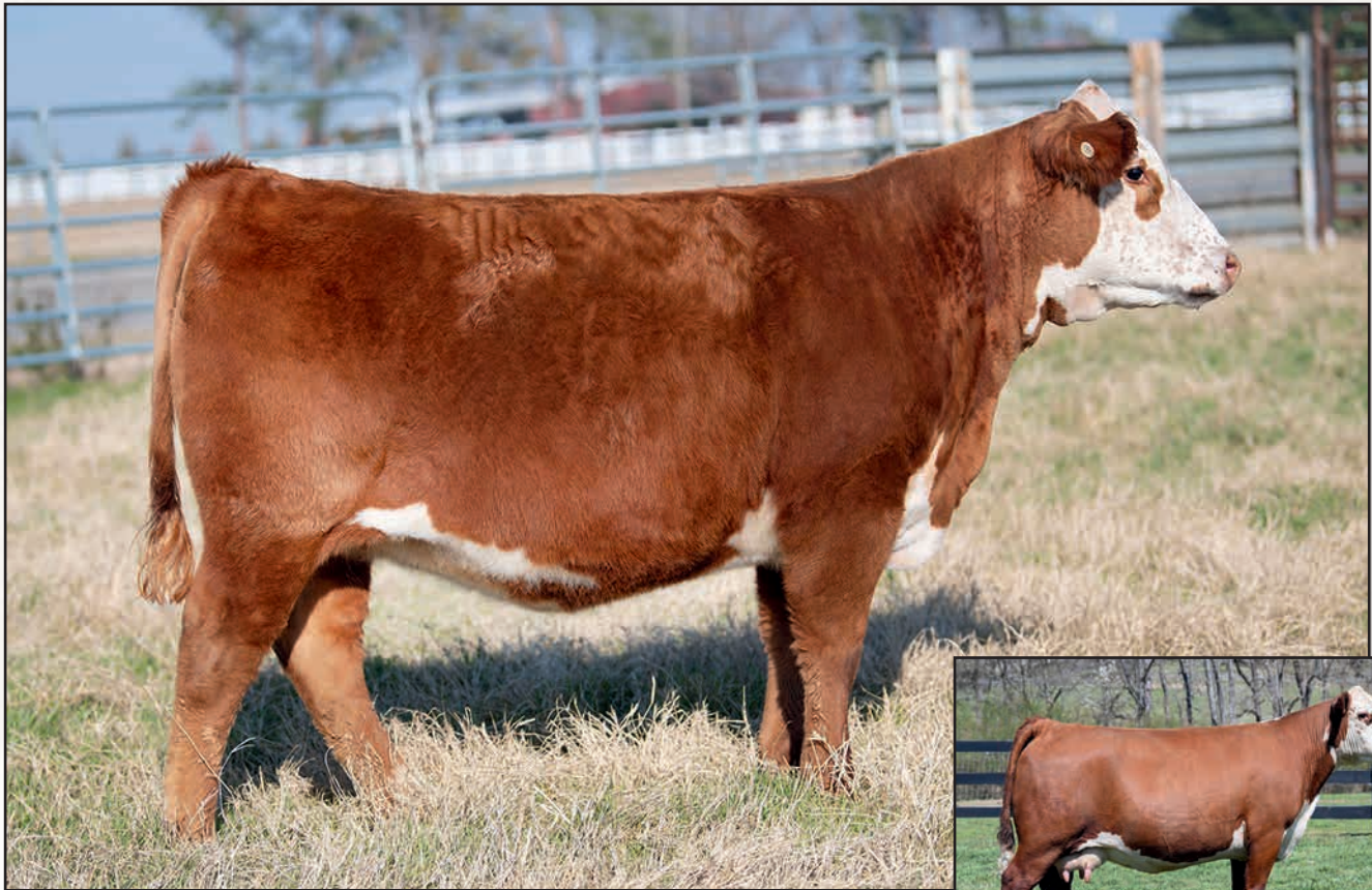
CES REIGNS Y146 B56 – SHE SELLS AS LOT 114B.