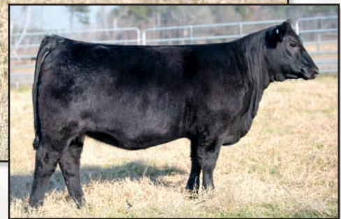
CES BARBARA B56 – SHE SELLS AS LOT 29B.