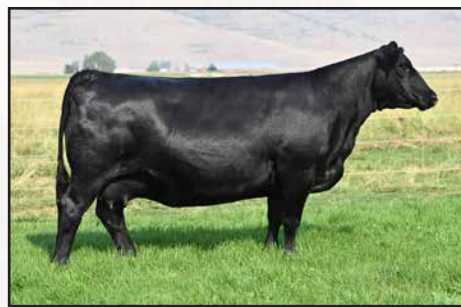
COLEMAN DONNA 9308 – THE $14,000 FULL SISTER TO LOT 1.