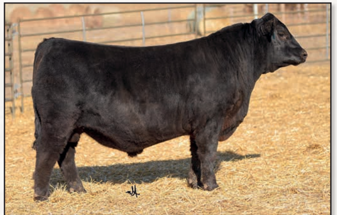
BEAR MTN PILOT 1520 - REFERENCE SIRE D.