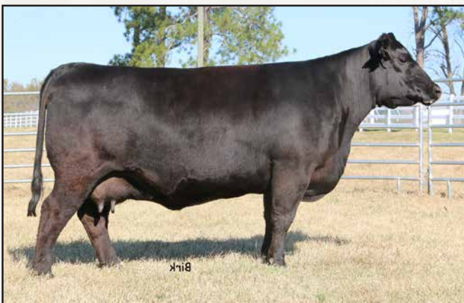
COLEMAN EVERELDA ENTENSE 907 – GRANDDAM OF LOT 21.