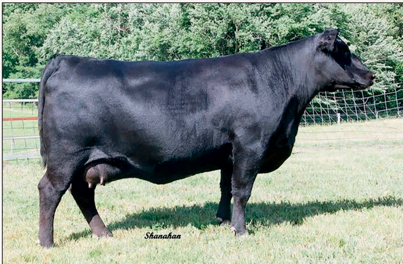
FROSTY ELBA LIZZY 564 – GRANDDAM OF LOT 18.