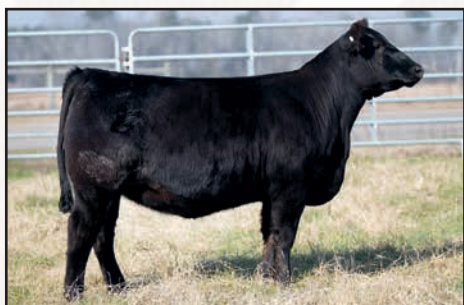
CES FA STORMY B79 – SHE SELLS AS LOT 4A.