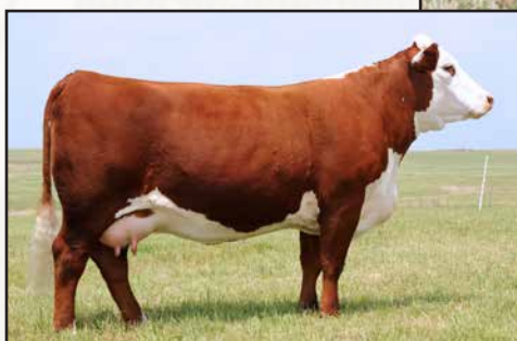
BPK CES PRETTY PENNIE B04 ET – SHE SELLS AS LOT 110.