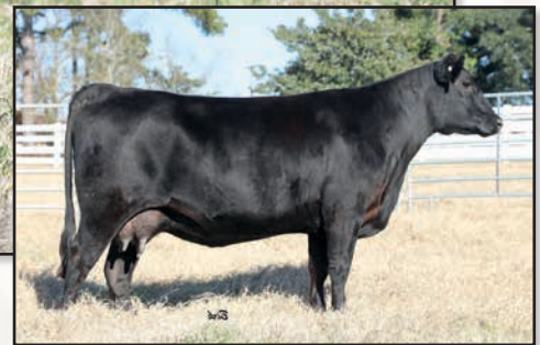
DESTIN PETUNIA S135 – DAM OF LOT 11.