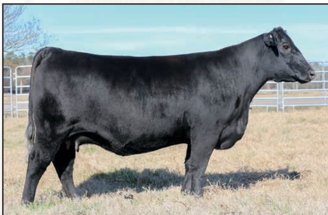
CES BLACKBIRD W143 – DAM OF LOT 30.