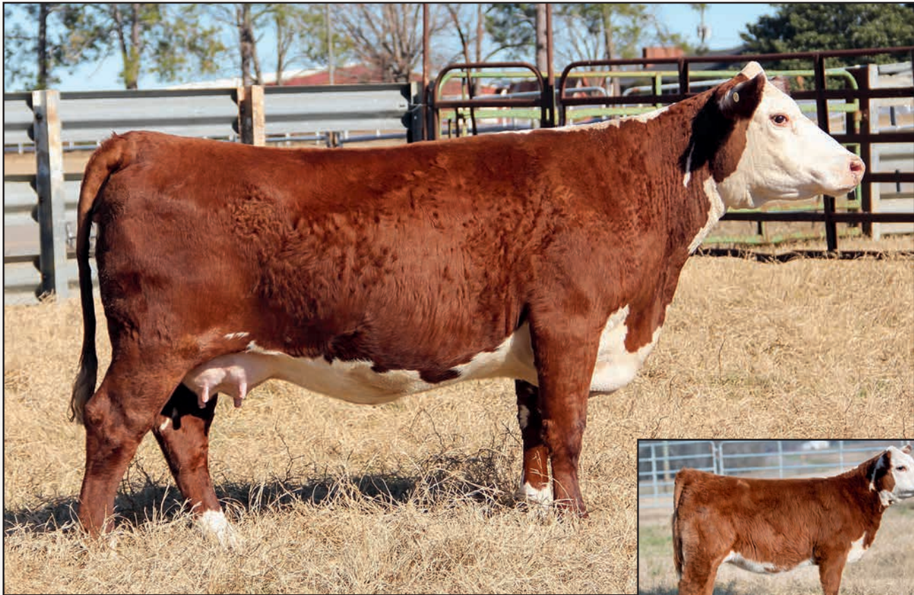
CES BLOOM G16 Y120 ET – SHE SELLS AS LOT 101.