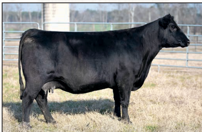
CES BARBARA X163 – SHE SELLS AS LOT 29.