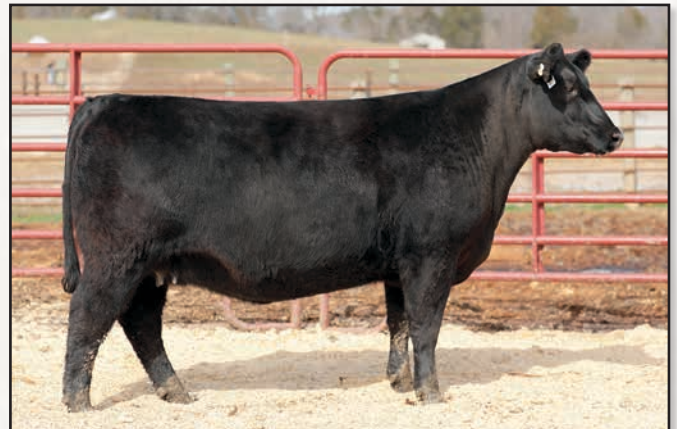
DEER VALLEY LADY 9228 – DAM OF LOT 17.