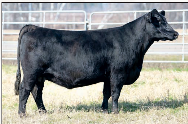
CES BLACKBIRD Z31 – SHE SELLS AS LOT 31