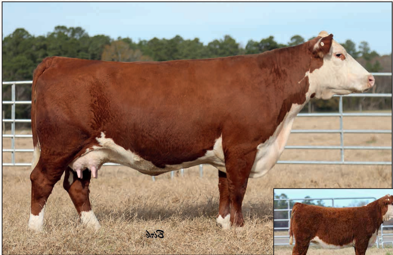
DESTIN DIXIE 88X N78 ET – DAM OF LOT 125