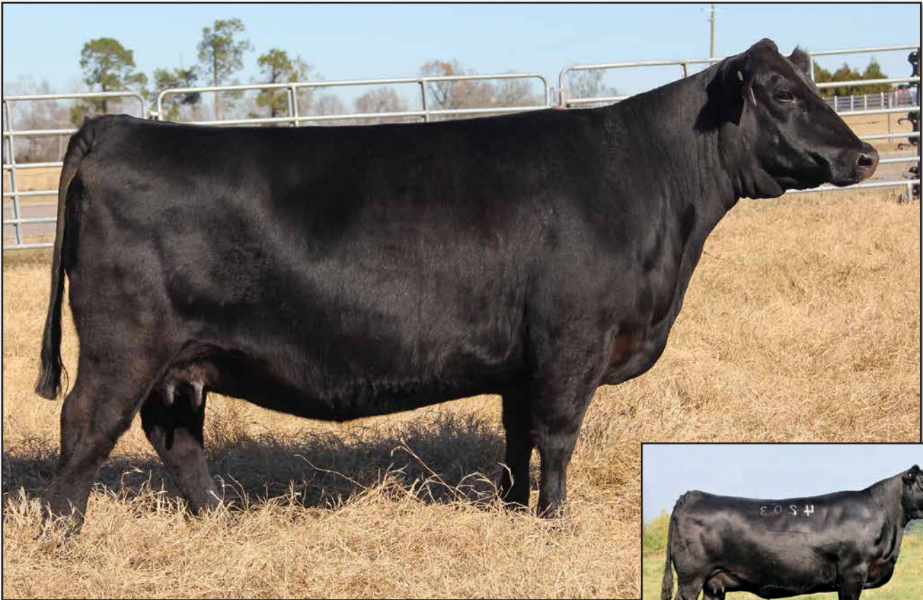
COLEMAN DONNA 9235 – SHE SELLS AS LOT 1.