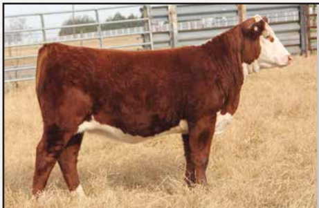
DESTIN JEWELS L356 B92 ET – SHE SELLS AS LOT 106A.