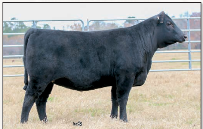
DESTIN BARBARA U96 – STEMS FROM THE SAME FAMILY AS LOTS 29-29B.