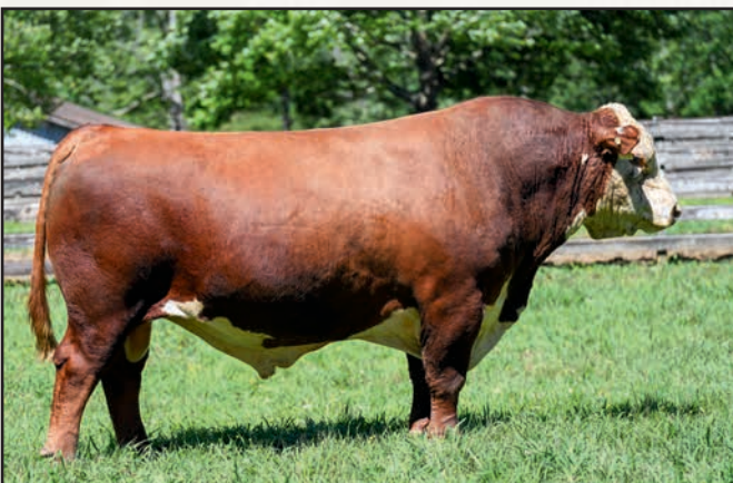
JW 1857 MERIT 21134 - REFERENCE SIRE J.