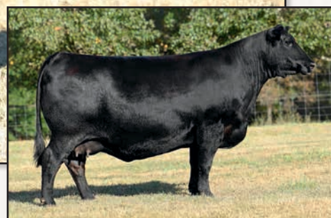
PARTISOVER BURGESS 744 – DAM OF REFERENCE SIRE A.