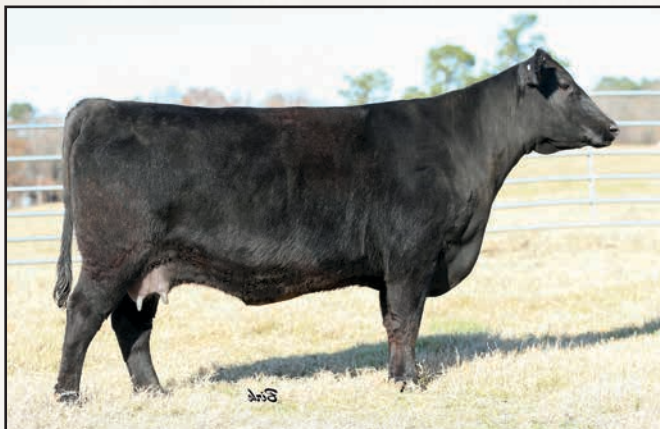
CES PROTET P160 – STEMS FROM THE SAME FAMILY AS LOT 23.