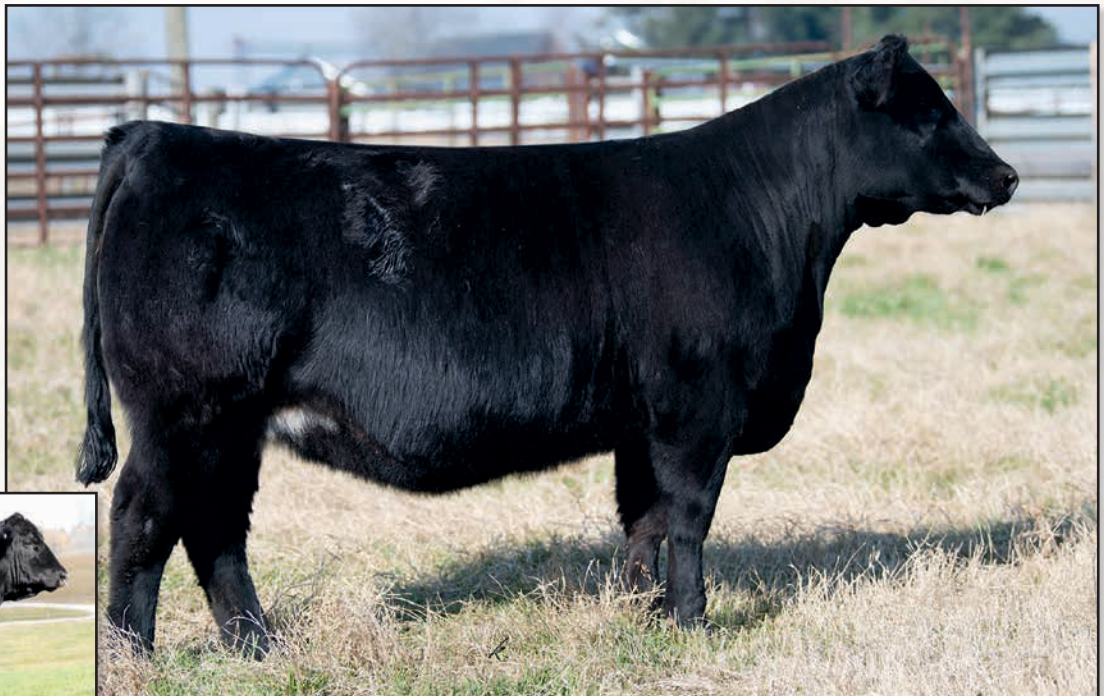
CES FA STORY B82 – SHE SELLS AS LOT 4B.