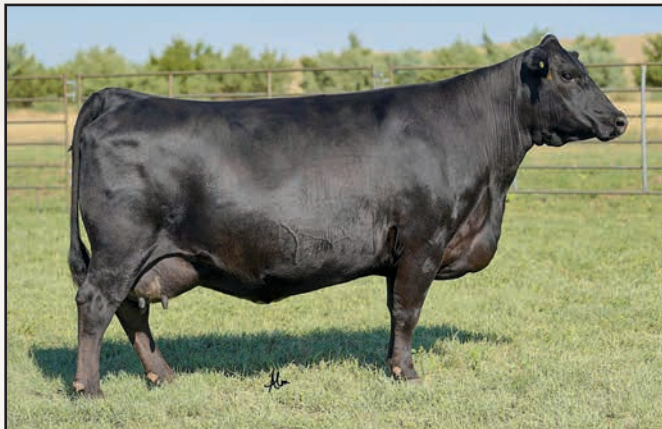
BEAR MTN JUDY 6535 – STEMS FROM THE SAME FAMILY AS LOT 16.