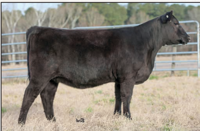
DESTIN PETUNIA Z160 – A MATERNAL SISTER TO LOT 11.