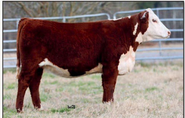
CES STONEGATE BLOOM Z109 – DAM IS A MATERNAL SISTER TO THE DAM OF LOT 101.