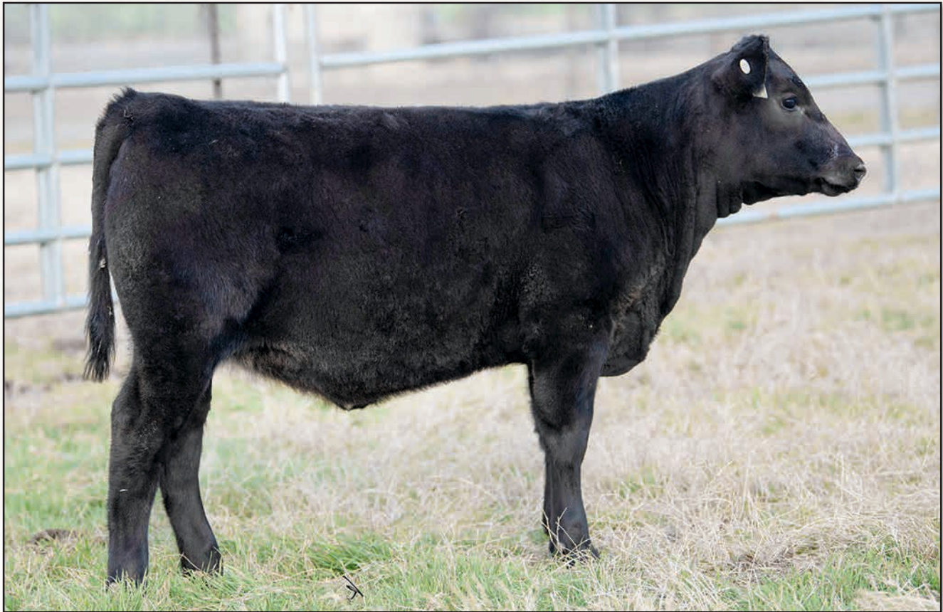
CES GS LUCY C34 – SHE SELLS AS LOT 15A.