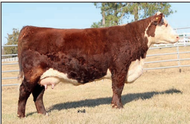
CES JULIA 122L N6 ET – HER DAUGHTER SELLS AS LOT 116.