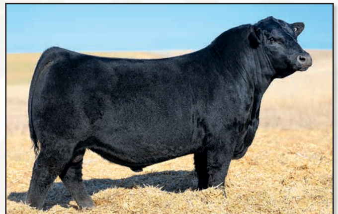
KR INSPIRATION 3078- REFERENCE SIRE F.