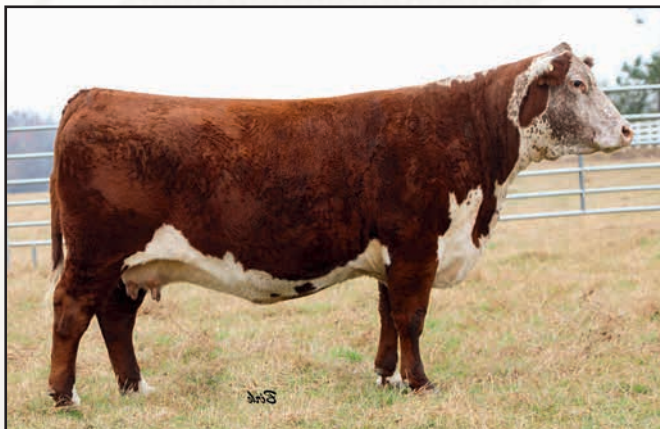
CES GG JEWELS 156T S14 ET – DAM OF LOTS 106A AND 106B.