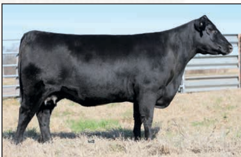
DESTIN WV EILEENMERE W110 – THE $10,500 MATERNAL SISTER TO THE DAM OF LOTS 7 AND 7A.