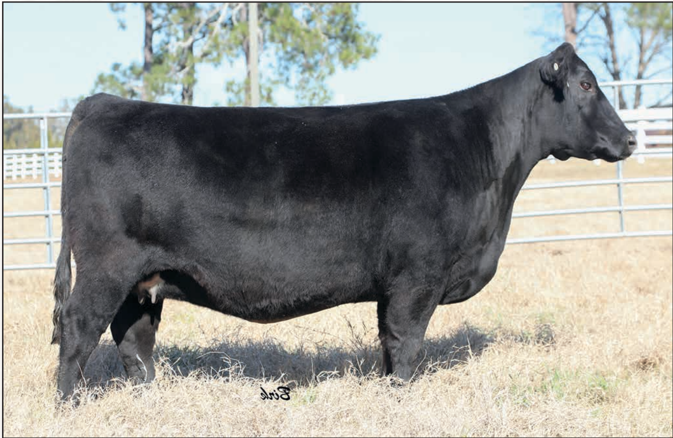
S/A PROTET M103 – DAM IS A MATERNAL SISTER TO THE DAM OF LOT 23.