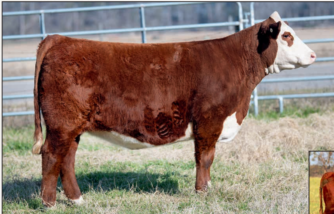
CES JULIA K225 B6 ET – SHE SELLS AS LOT 108.

CES JULIA 4009 E195 – FOURTH DAM OF LOT 107 AND THIRD DAM OF LOT 108.