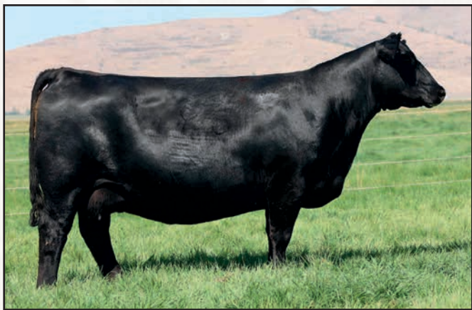
COLEMAN DONNA 1430 – THE $310,000 VALUED MATERNAL SISTER TO LOT 1.