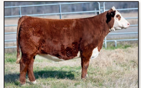
CES JULIA K225 B6 ET – SHE SELLS AS LOT 108.