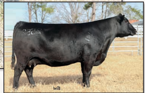
PF 7229 LUCY 2552 – GRANDDAM OF LOT 14.