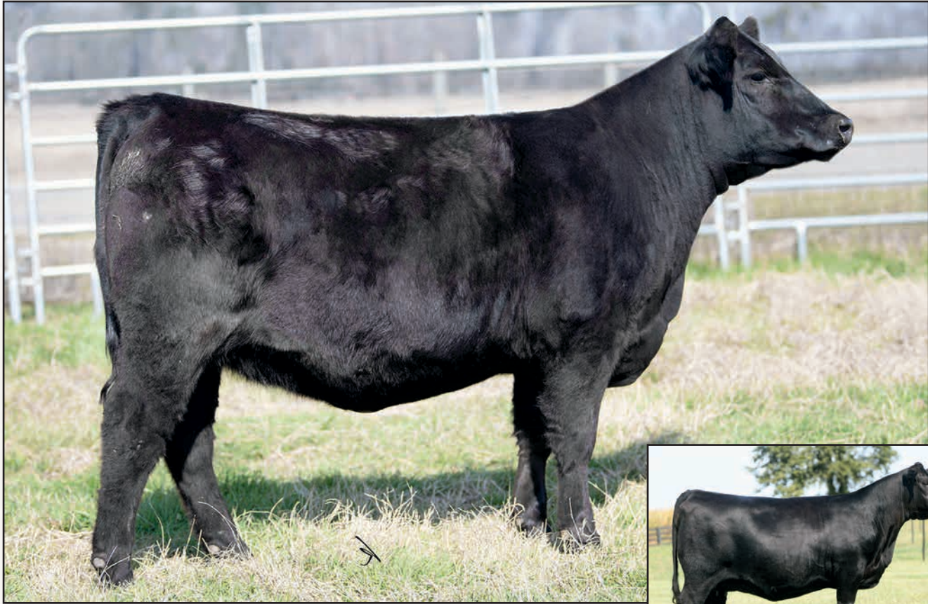
CES QUEEN B30 – SHE SELLS AS LOT 26B.