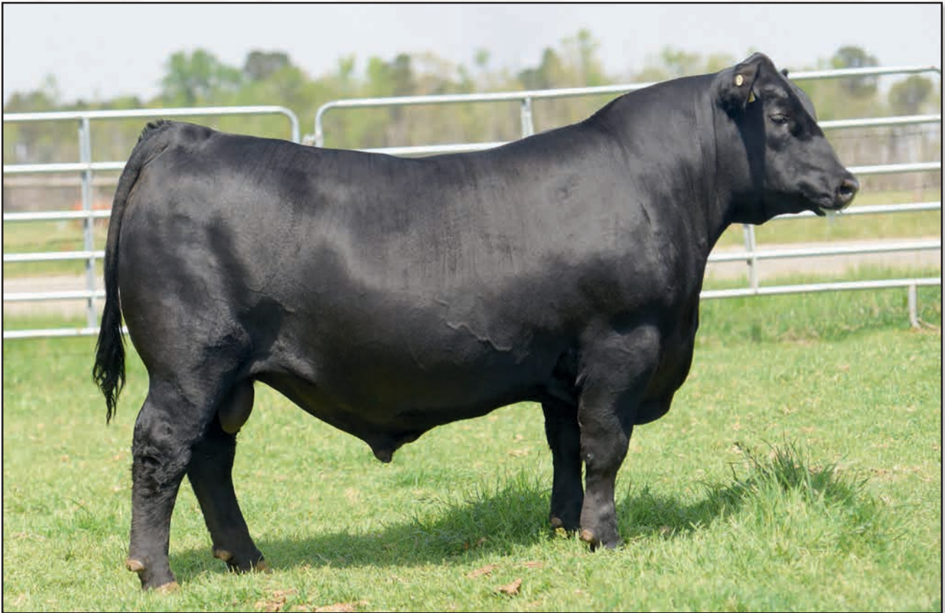
CES FA DEEP TRUST A28 – HE SELLS AS LOT 4.