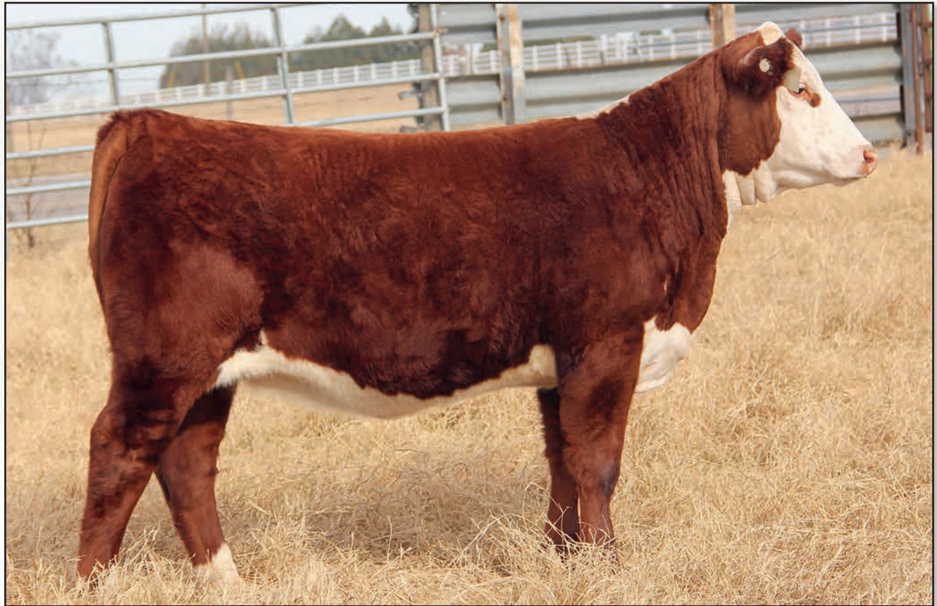
DESTIN JEWELS L356 B92 ET – SHE SELLS AS LOT 106A.