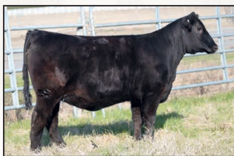
DESTIN DONNA B97 – SHE SELLS AS LOT 1C.