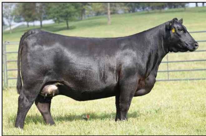
COLEMAN DONNA 2417 – THE $130,000 VALUED MATERNAL SISTER TO LOT 1.