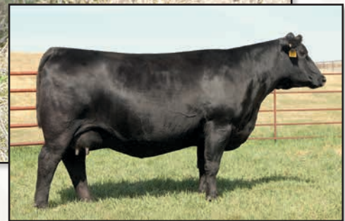
S A V BLACKCAP MAY 1442 – DAM OF LOT 20.