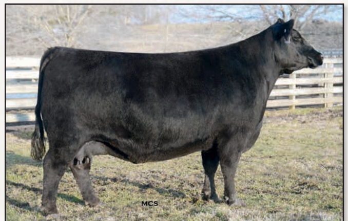
CF FLY BIS 110 – GRANDDAM OF LOT 4.