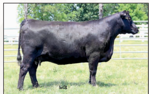
SYDGEN EILEENMERE 4061 – GRANDDAM OF LOTS 7 AND 7A.