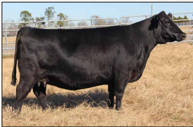
COLEMAN DONNA 9235 – SHE SELLS AS LOT 1.