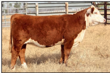
DESTIN DAISY BELLE 3316 B120 – SHE SELLS AS LOT 105A.