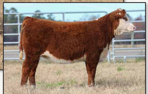
DESTIN DIXIE 00161 Z159 – DAUGHTER OF A MATERNAL SISTER TO LOT 125.