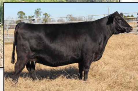
COLEMAN DONNA 9235 – DAM OF LOTS 1A-1E.