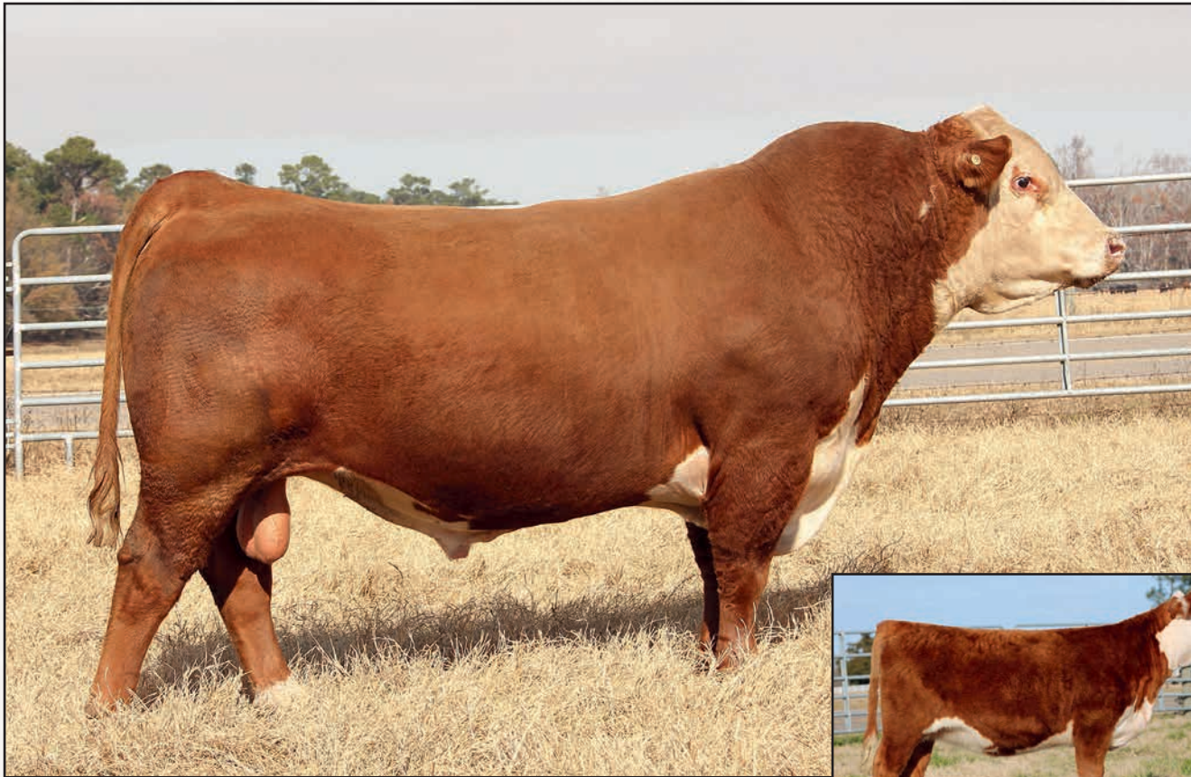
CES DEFINITIVE H49 Z73 ET – HE SELLS AS LOT 103.