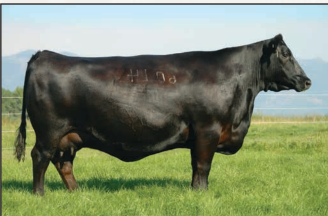
BOHI ABIGALE 6014 - THE $50,000 GRANDDAM OF LOT 32.