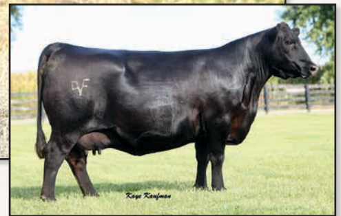
DEER VALLEY BLACKBIRD 31120 – DAM OF LOT 25.