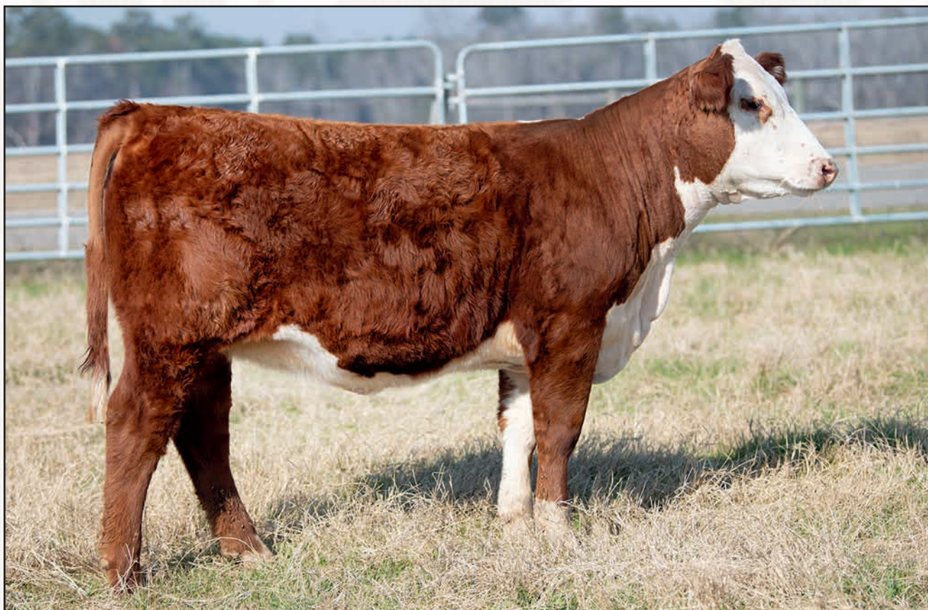
DESTIN SUNNY X20 B66 – SHE SELLS AS LOT 111.