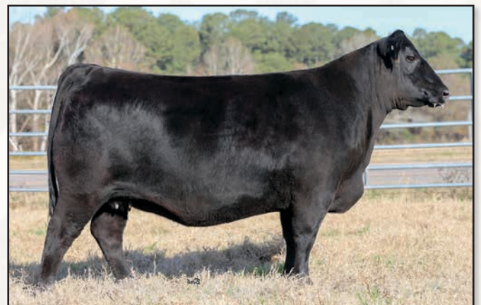
S/A FANNY U111 – MATERNAL SISTER TO LOT 22.