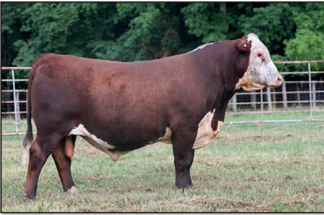
DESTIN ARMORY 00161 Y146 ET- REFERENCE SIRE G.