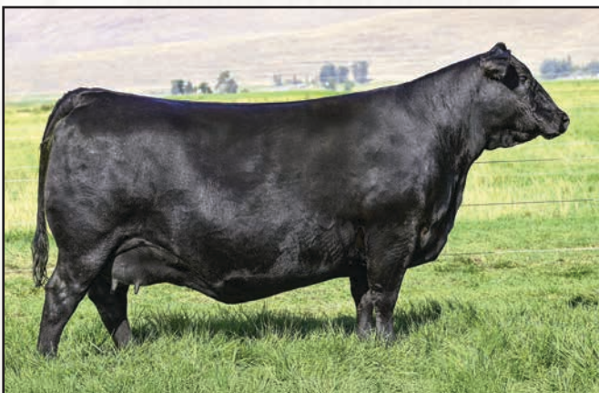
COLEMAN DONNA 8146 – THE $750,000 VALUED FULL SISTER TO THE DAM OF LOT 1.