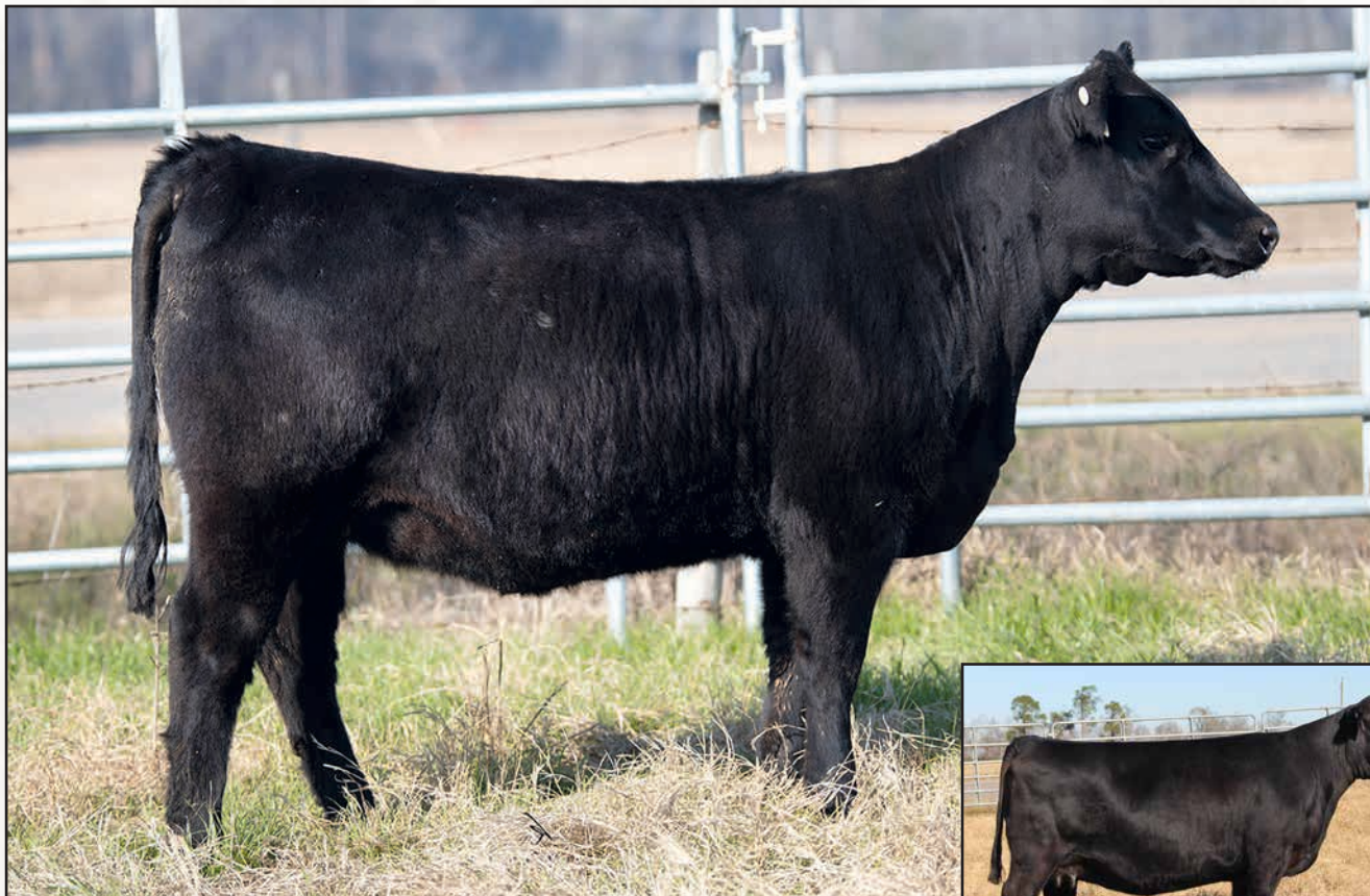
DESTIN DONNA B81 – SHE SELLS AS LOT 1B.