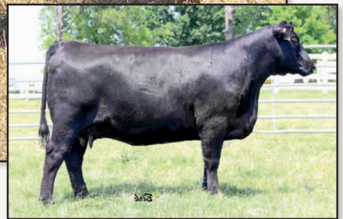
SYDGEN EILEENMERE 4061 – GRANDDAM OF LOT 10.