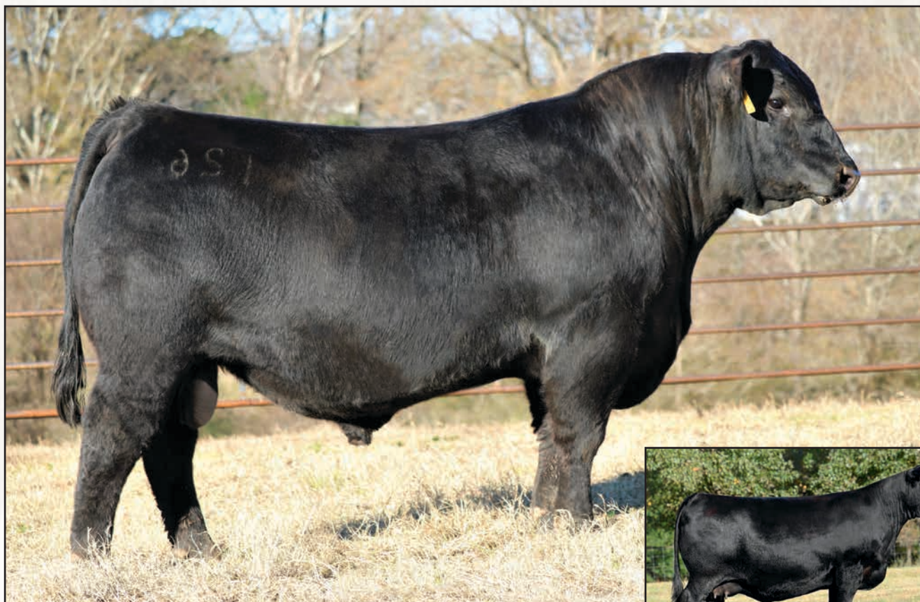
PARTISOVER DEEP ROOTS 126 – REFERENCE SIRE A.