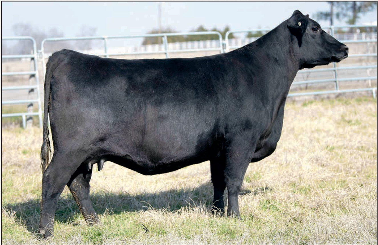
CES PETUNIA Y28 – SHE SELLS AS LOT 13.