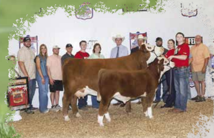
HPH 756 LADY LUCK 5480J - DAM OF LOTS 8, 9 AND 24 2024 JNHE RESERVE CHAMPION COW-CALF PAIR