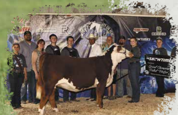
WILDCAT VIOLIN 4939 ET - MATERNAL SIB TO LOTS 10 & 11 2025 CHAMPION POLLED HEIFER ILLINOIS PREVIEW