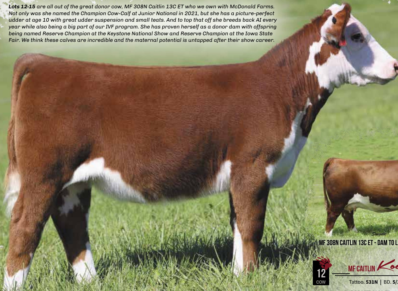
MF 308N CAITLIN 13C ET - DAM TO LOTS 12-15, 26A AND 26B

Lots 12-15 are all out of the great donor cow, MF 308N Caitlin 13C ET who we own with McDonald Farms. Not only was she named the Champion Cow-Calf at Junior National in 2021, but she has a picture-perfect udder at age 10 with great udder suspension and small teats. And to top that off she breeds back AI every year while also being a big part of our IVF program. She has proven herself as a donor dam with offspring being named Reserve Champion at the Keystone National Show and Reserve Champion at the Iowa State Fair. We think these calves are incredible and the maternal potential is untapped after their show career.