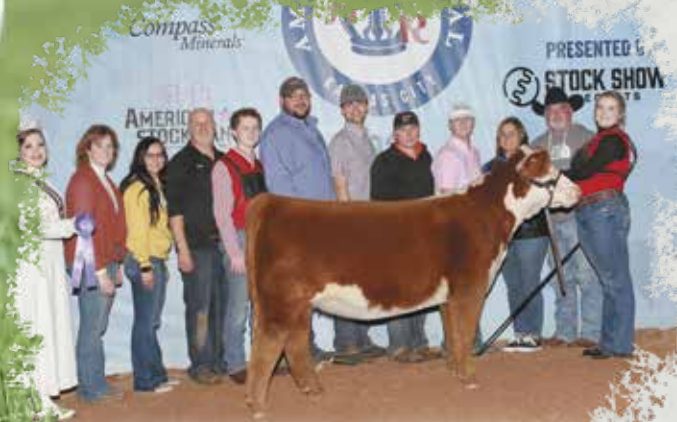
WILDCAT PARADISE 109 ET - FULL SIB TO LOTS 3, 4A-4C 2021 AMERICAN ROYAL JR SHOW SPRING CALF CHAMPION