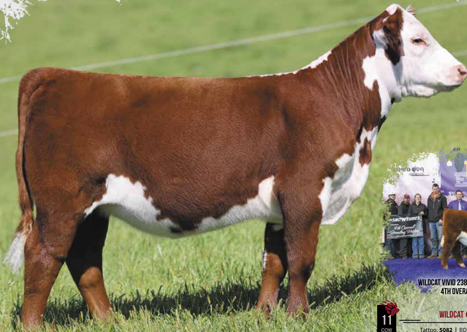
WILDCAT VIVID 2384 ET - FULL SISTER TO LOT 11 4TH OVERALL IOWA BEEF EXPO