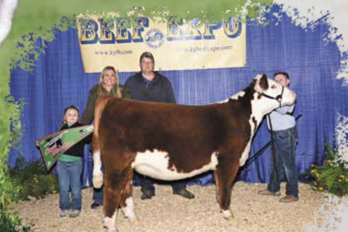
WILDCAT PARMA 3176 ET - FULL SIB TO LOTS 1&2 2024 KENTUCKY BEEF EXPO CHAMPION