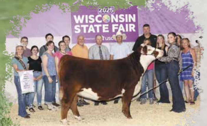
WILDCAT OVERTONE 4061 ET HERE - FULL SIB TO LOT 25 2025 WISCONSIN STATE FAIR CHAMPION FEMALE AND RESERVE SUPREME FEMALE