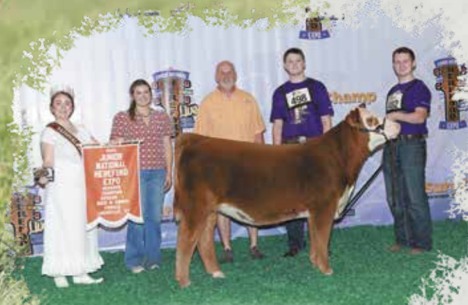
WILDCAT LEMONADE 502 ET 2025 JNHE RESERVE DIVISION 1 BRED & OWNED FEMALE