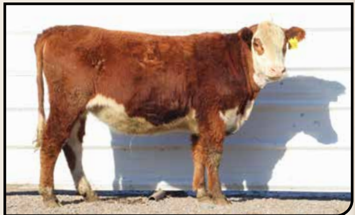
EPHR MISS ELKER 11079 508L