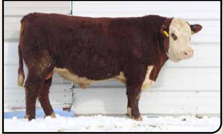
EPHR ELKER EXTRA 531L