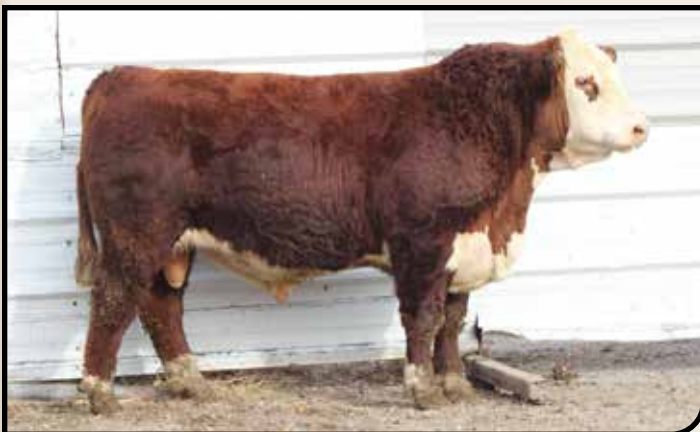
EPHR ELKER PATHFINDER 636L