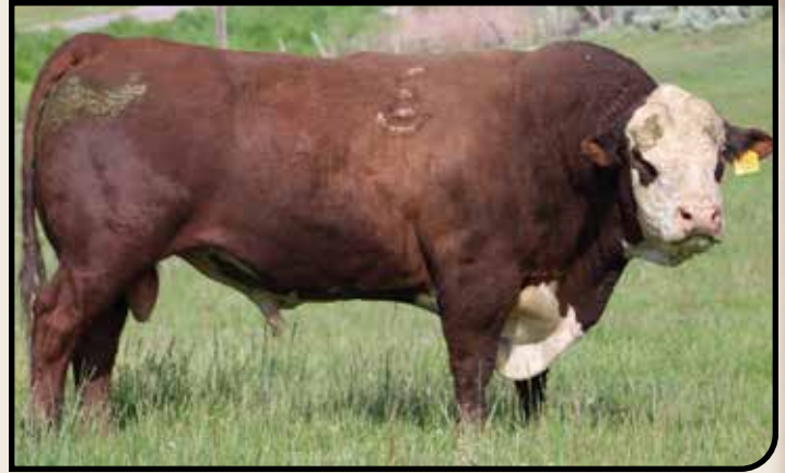
EPHR ELKER BROKER 444Z 005C

Ref Sire E EPHR ELKER PATHFINDER 842 266B {DLF,HVF,IEF,MSUDF} Calved: 3/11/16 P43675505 Tattoo: 266D