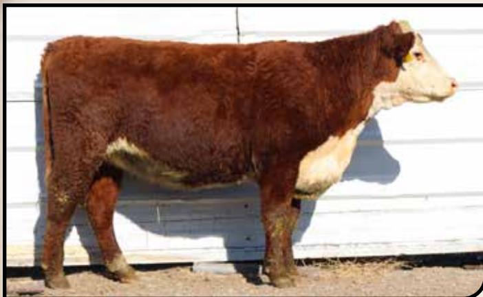
LE MISS ELKER BEXS 516L