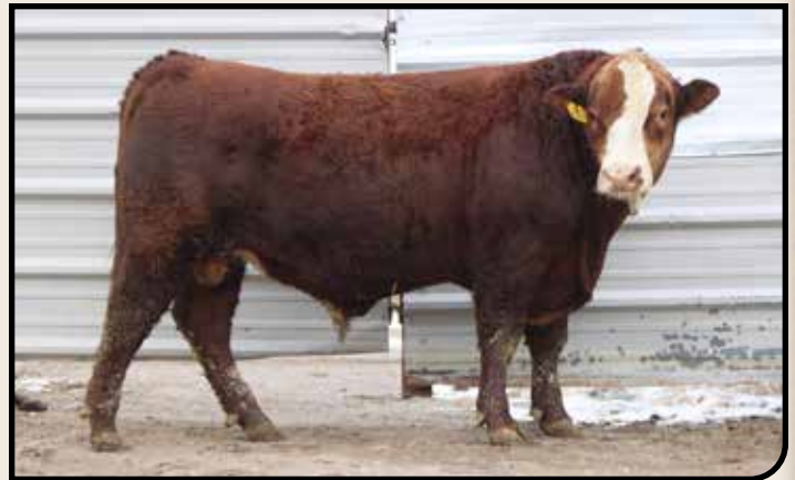
EPHR ELKER 693L