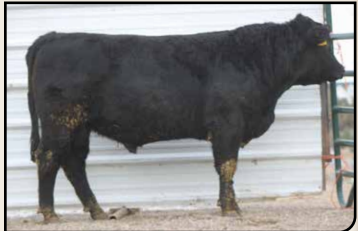
EBS ELKER REAGAL 592L