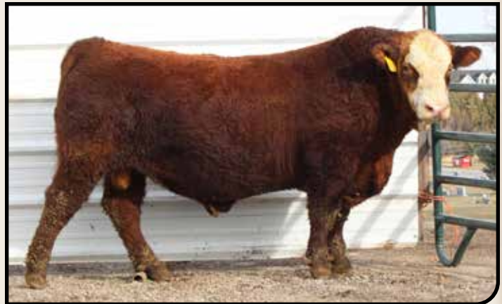
EPHR ELKER 666L