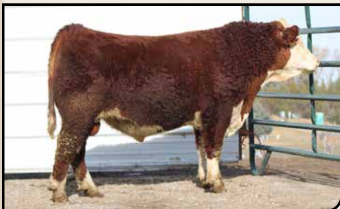
EPHR ELKER 570L