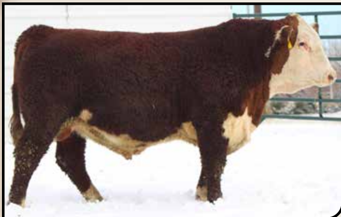
EPHR ELKER EXTRA 565L