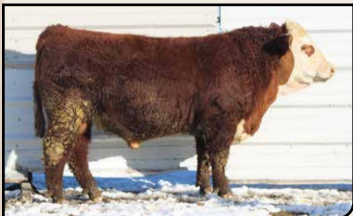
LE ELKER EXTRA 673L