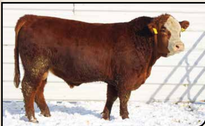
EBS ELKER EXTRA 702L