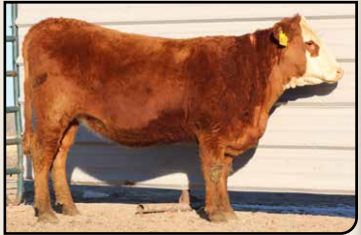
EBS MISS ELKER ETREEM 506L