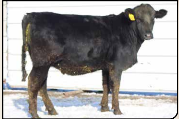
EBS MISS ELKER EXTRA 661L