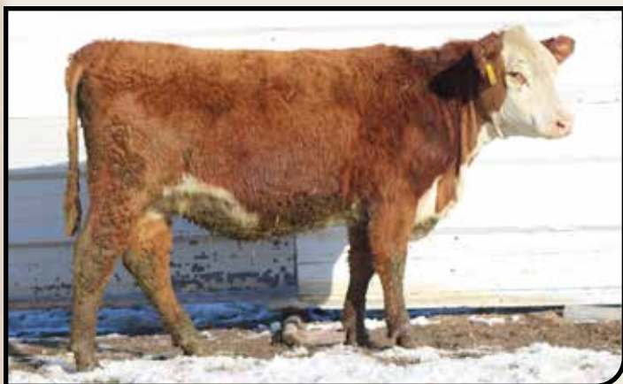
EPHR MISS ELKER 652L