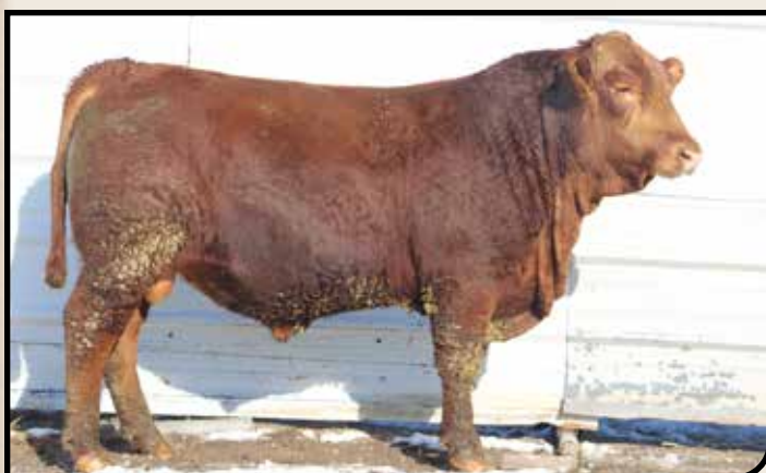
EBS ELKER EXTRA 598L

LOT NO. 598L EBS ELKER EXTRA 598L Calved: 3/24/23 222183 Tattoo: RE EBS598L/LE 598L