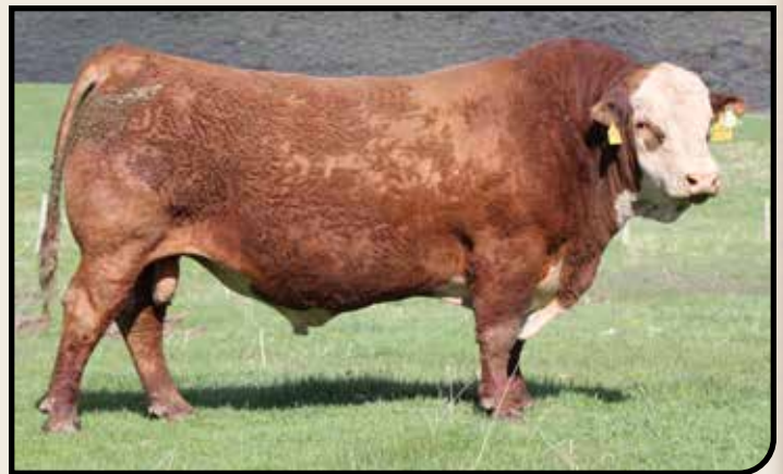
EPHR ELKER PATHFINDER 999G