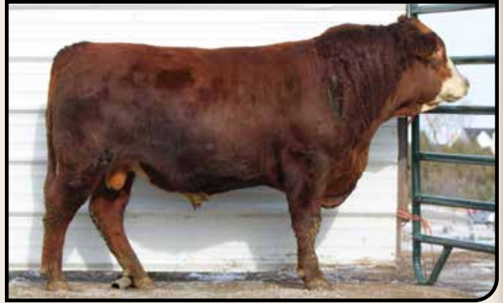
EBS ELKER EXTRA 523L