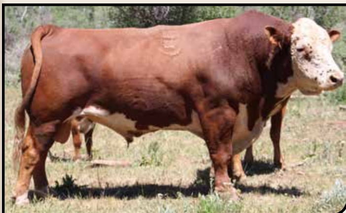
EPHR ELKER SURE BET 202D