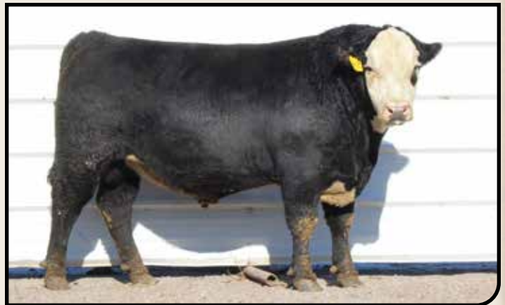
EBS ELKER POUNDMAKER 524L