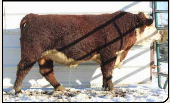
EPHR ELKER BROKER 638L

LOT NO. 642L EPHR ELKER BROKER 642L {HYP} Calved: 4/7/23 P44478081 Tattoo: 642L