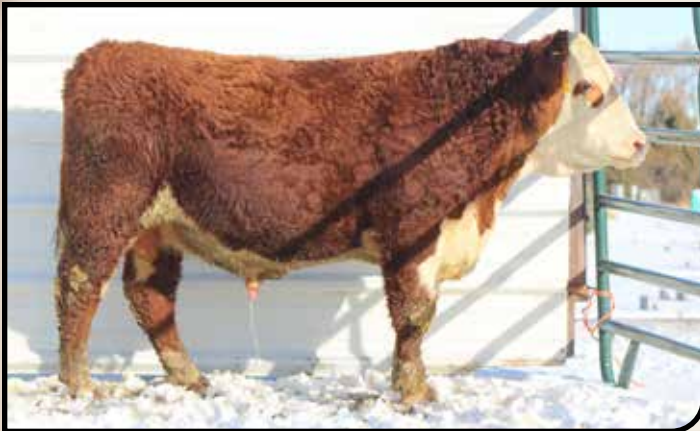
EPHR ELKER PATHFINDER 540L