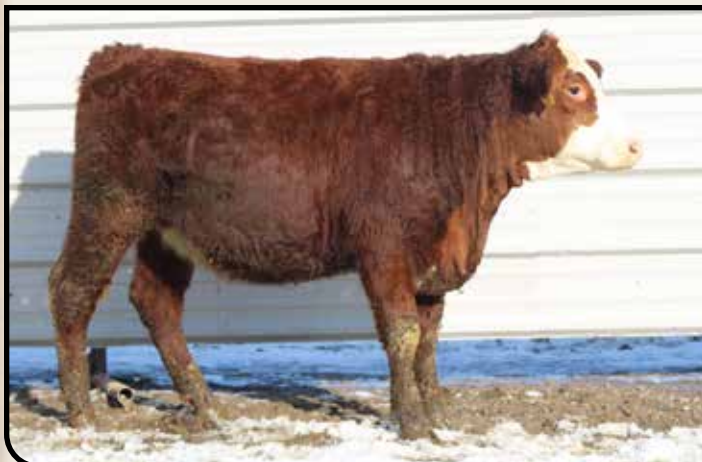
LE MISS ELKER BECCA 556L