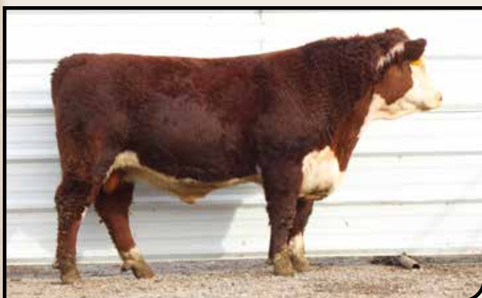
EPHR ELKER EXTRA 654L