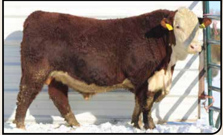
EBE ELKER BROKER 576L