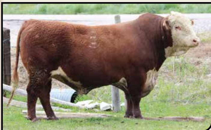
EPHR TRAIL BLAZER 724A