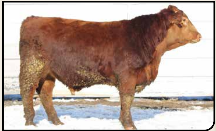
EBS ELKER EXTRA 617L