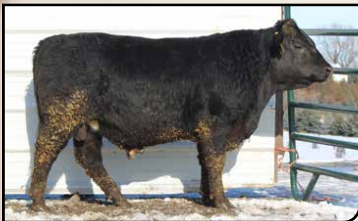
EBS ELKER EXTRA 594L

LOT NO. 594L EBS ELKER EXTRA 594L Calved: 3/15/23 222195 Tattoo: RE EBS594L/LE 594L