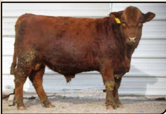
EBS ELKER REMEDY 703L