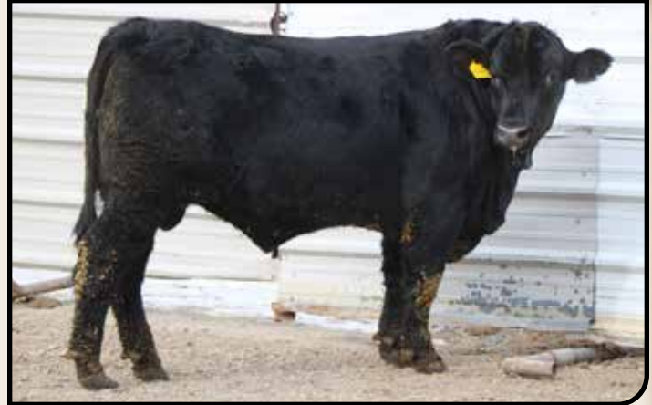
EBS ELKER BLACK JACK 562L