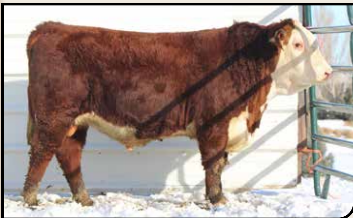
LE ELKER BROKER 634L