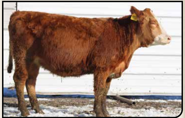
EPHR MISS ELKER PATH 605L

LOT NO. 612L EPHR MISS ELKER PATH 612L {HYP} Calved: 4/1/23 P44477368 Tattoo: 612L