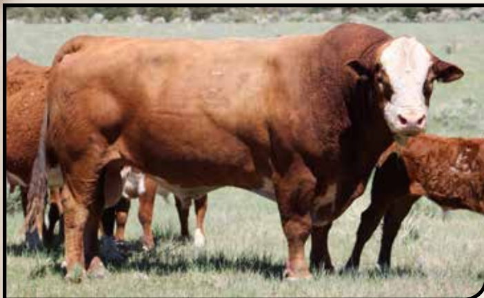
EPHR PATHEFINDER 4G 842B