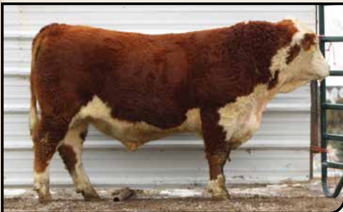
LE ELKER PATHFINDER 544L