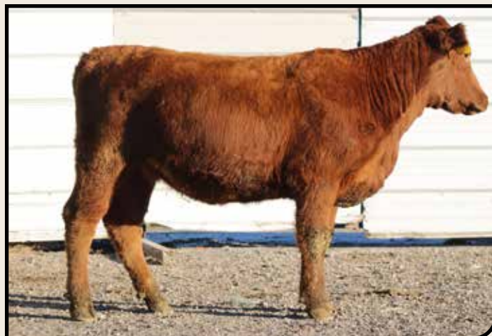
EBS MISS ELKER EXTRA 649L