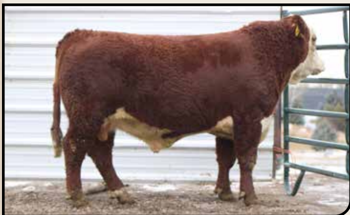
EPHR ELKER PATHFINDER 504L