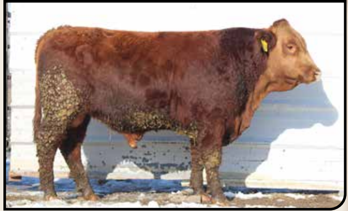
EBS ELKER EXTRA 613L