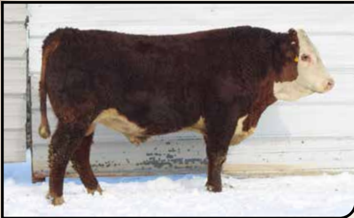
EPHR ELKER BROKER 629L