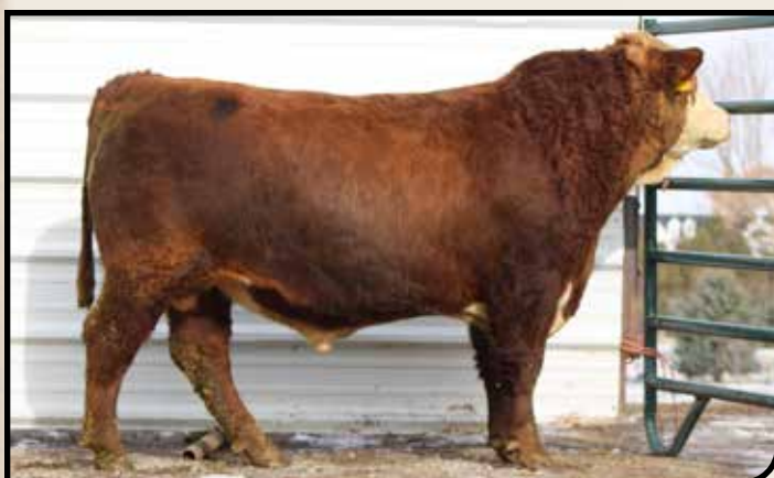
EPHR ELKER PATHFINDER 604L