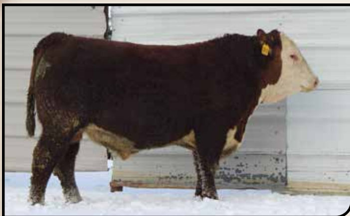
EPHR ELKER BROKER 648L