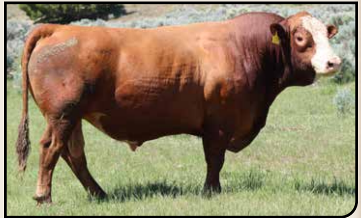
EPHR ELKER PATHFINDER 842 266B

Ref Sire F EPHR ELKER PATHFINDER 999G {DLF,HVF,IEF,MSUDF} Calved: 4/4/19 P44029852 Tattoo: 999G