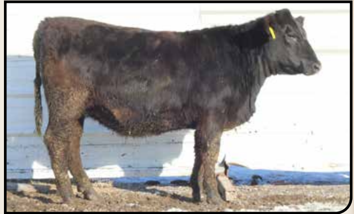
EBS MISS ELKER 688L