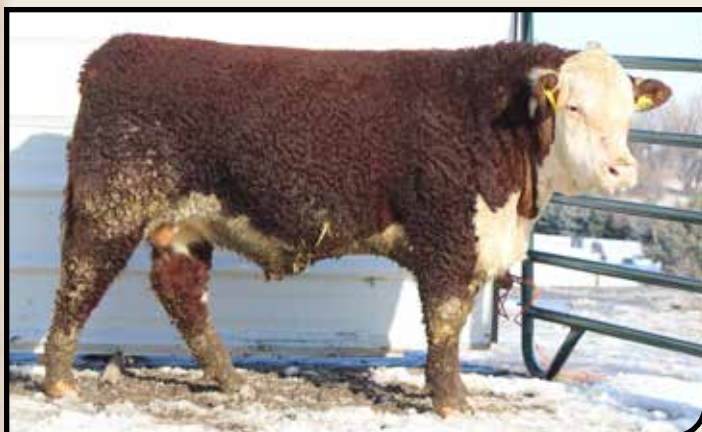
EBE ELKER CANAL 710L