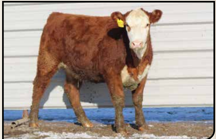
EPHR MISS ELKER BROKER 677L