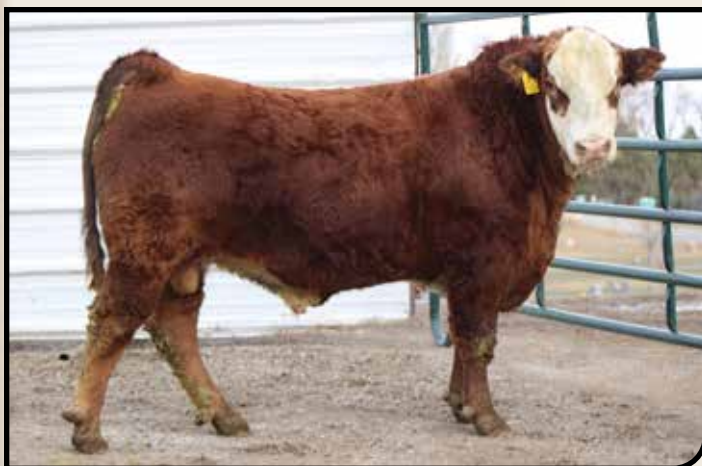
EBE ELKER PATHFINDER 575L