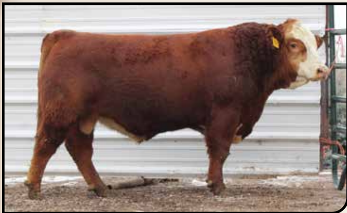
EPHR ELKER 500L