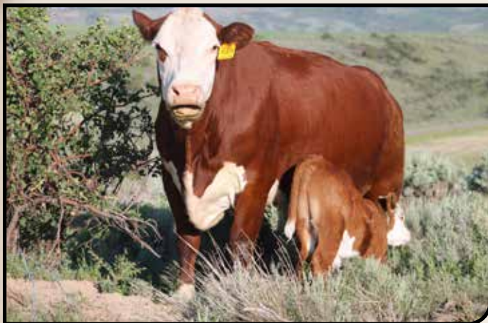
EBE MISS ELKER BROKER 635F – DAM OF LOT 710L