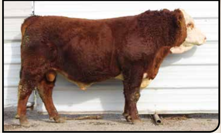
EPHR ELKER BROKER 637L

LOT NO. 638L EPHR ELKER BROKER 638L {HYP} Calved: 4/4/23 P44478089 Tattoo: 638L