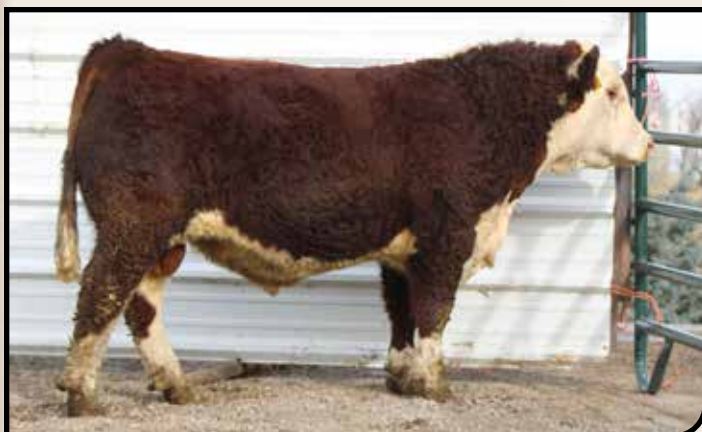
PRE ELKER BROKER POP 720L