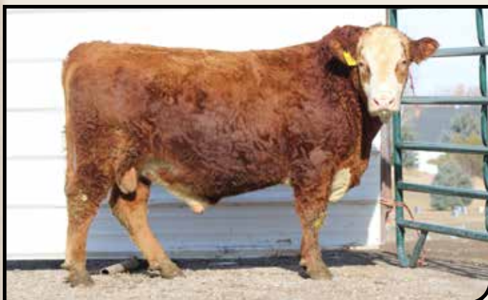
EPHR ELKER PATHFINDER 609L