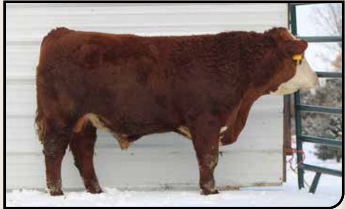
EPHR ELKER 583L