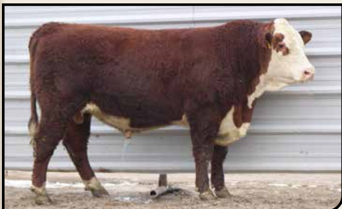
EPHR ELKER BROKER 678L