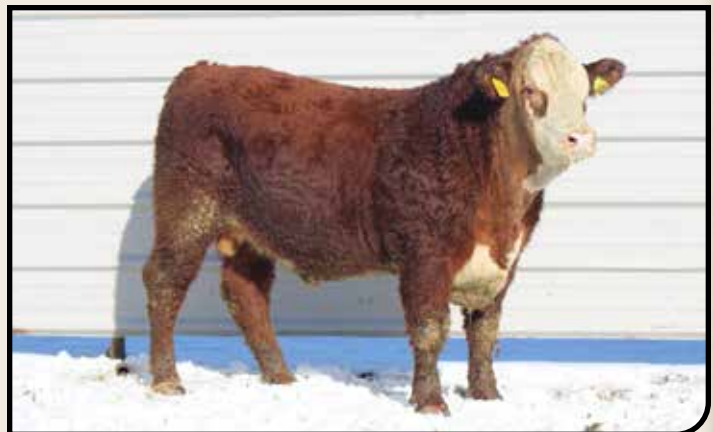
EPHR ELKER PATHFINDER 668L