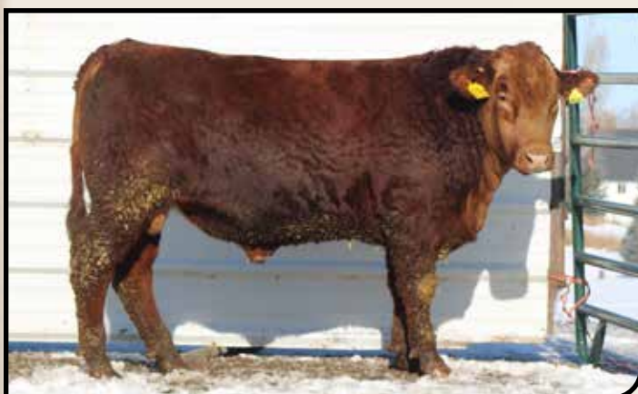
EBS ELKER EXTRA 607L

LOT NO. 607L EBS ELKER EXTRA 607L Calved: 3/18/23 222196 Tattoo: RE EBS607L/LE 607L