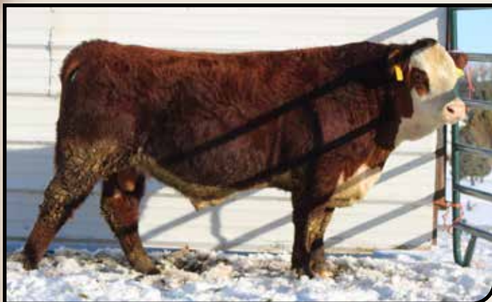
EPHR ELKER DAYBREAK 601L