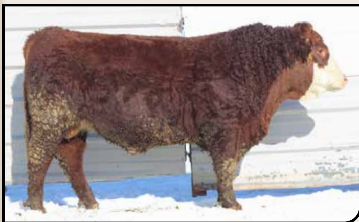
EBS ALKER EXTRA 708L

LOT NO. 639L EBS ELKER EXTRA 639L Calved: 4/6/23 222216 Tattoo: RE EBS639L/LE 639L