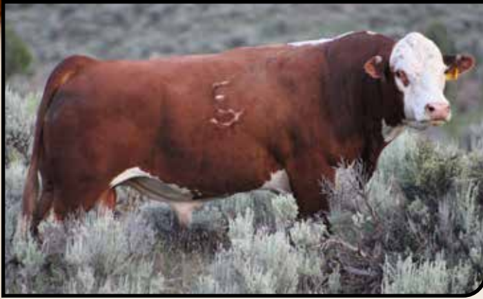
EPHR ELKER BROKER 005C 439E