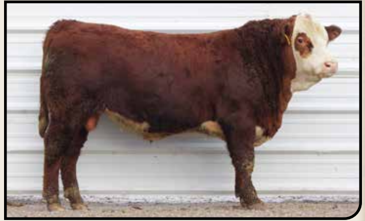
EPHR ELKER DAYBREAK 560L

LOT NO. 561L EPHR ELKER DAYBREAK 561L {DBP} Calved: 3/23/23 P44477308 Tattoo: 561L