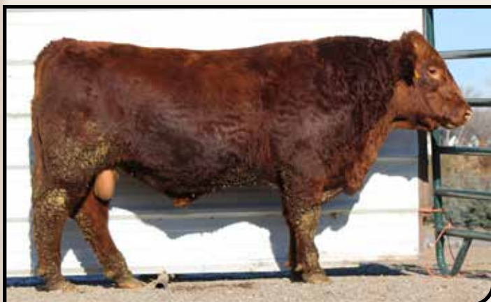
EBS ELKER EXTRA 542L

LOT NO. 542L EBS ELKER EXTRA 542L Calved: 3/13/23 222193 Tattoo: RE EBS542L/LE 542L