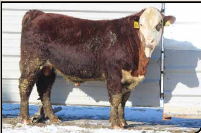
EPHR ELKER DAYBREAK 548L