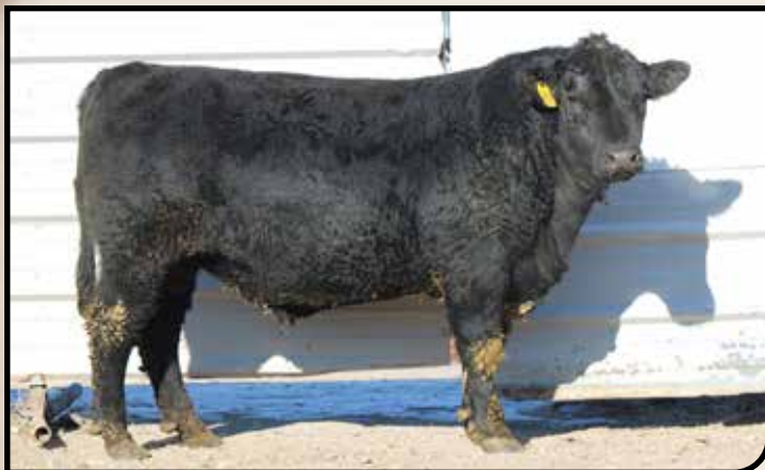
EBS ELKER EXTRA 534L

LOT NO. 534L EBS ELKER EXTRA 534L Calved: 3/14/23 222180 Tattoo: RE EBS534L/LE 534L