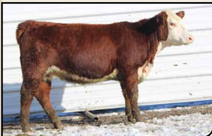
EPHR MISS ELKER 566L