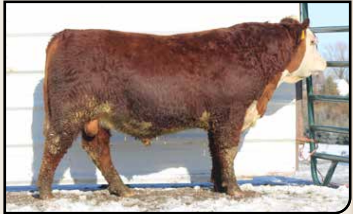
LE ELKER EXTRA 532L