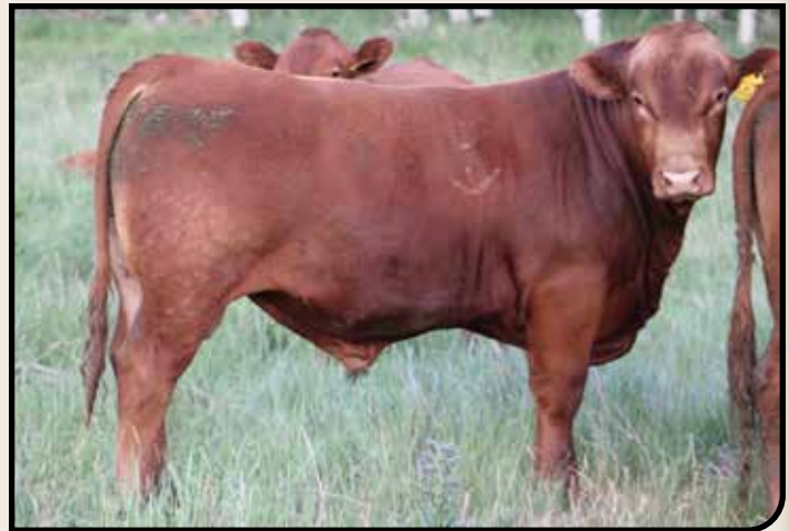
EBS ELKER 061H

SD Ref. Sire N EBS ELKER EZCALVER 156H Calved: 3/23/20 217891 Tattoo: RE EBS156H/LE 156H