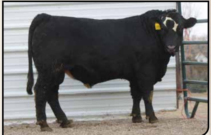
EBS ELKER POWER 614L