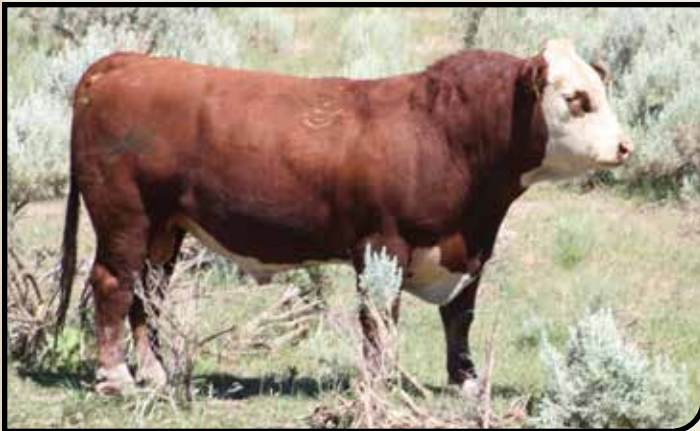
/S DAYBREAK 11079 ET