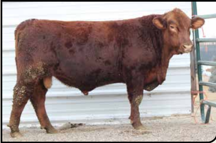
EBS ELKER EXTRA 735L