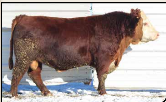
EPHR ELKER EXTRA 655L