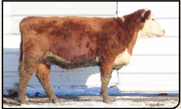
EPHR MISS ELKER 11079 672L