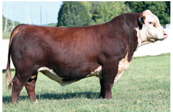
CHURCHILL EQUITY 3316L ET

The first progeny of this young resident herd sire are sale features, plus his service