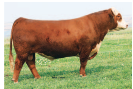
C CUDABELLE 2111 Sire of Lots 12 & 13 ...also the sire of Lot 6