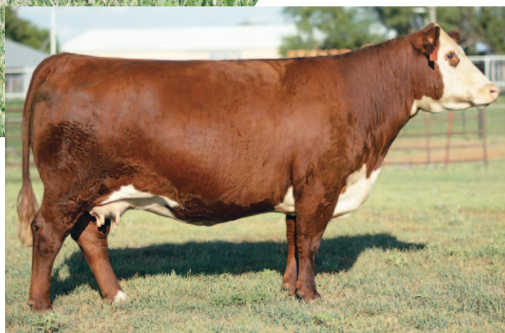
SPEARHEAD B413 HADLEY G16