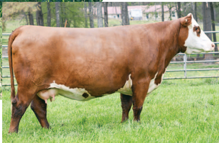
LOEWEN MISS GRADY 162G 32J