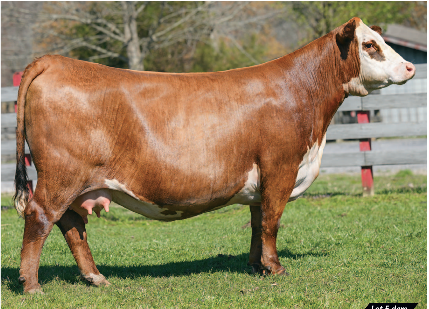
SFCC TRM LADY ENDURE 0244 ET