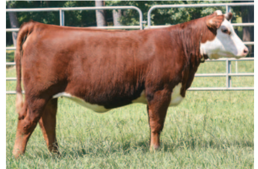
DCF J13 BAILEY 24L ET