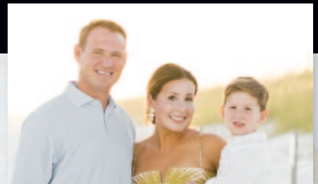
The Locke St. John Family