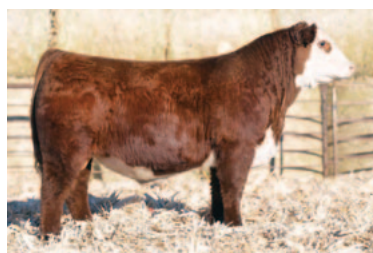
JDH JCS RED HOT 43M ET Sire of Lot 7A embryos