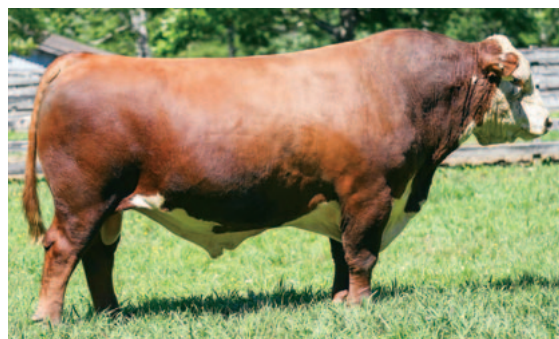
JW 1857 MERIT 21134

Sire of Lot 1 & sire of Churchill Equity