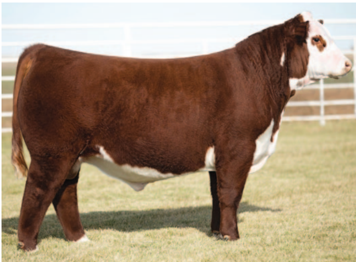
LOEWEN GENESIS G16 ET

Eight direct daughters of this influential herd sire sell