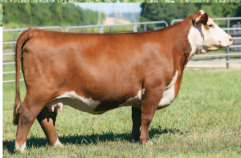
LOEWEN HADLEY 4013 J14 ET $54,000-valued full sister to Lot 4 ...Lot 2 in the 2024 sale