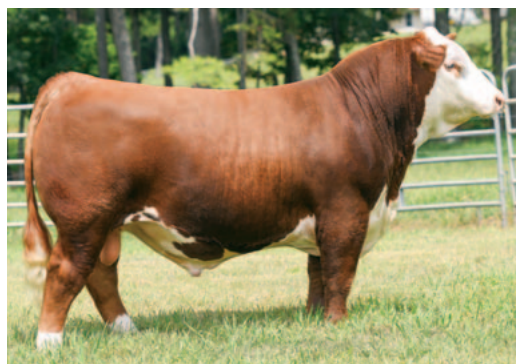
LAND SLINGER 2296 1046 Sire of Lots 34-37