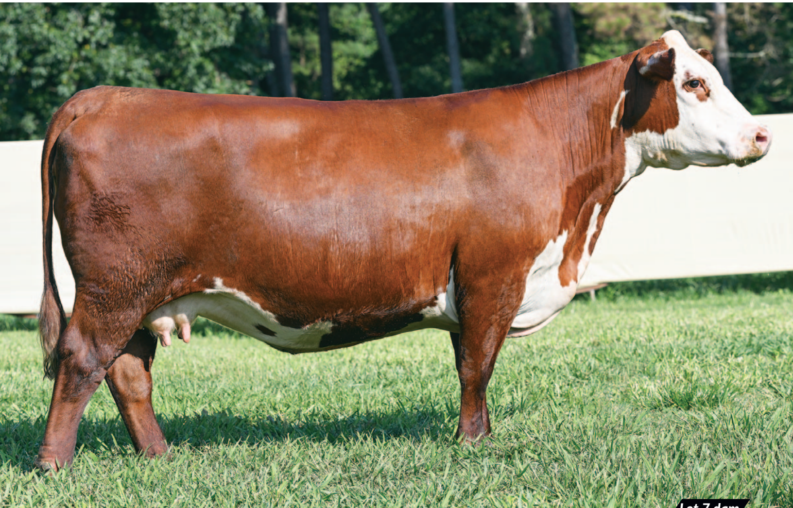
Lot 7 dam