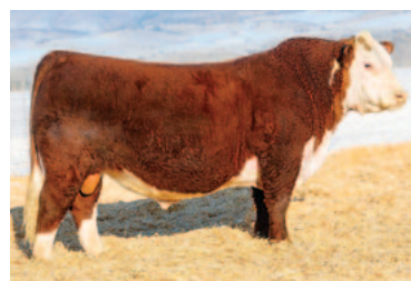
CHURCHILL RED THUNDER 133J ET Sire of Lot 7B embryos