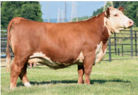
DCF PERKS 2110 DELILAH 601D ET Dam of Lot 14