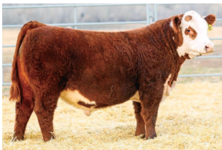
CHURCHILL LAREDO 3146L ET