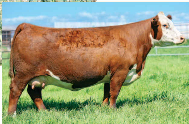
CHURCHILL LADY 023H ET