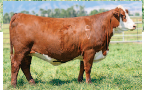
CHURCHILL LADY 4139M ET $30,000 maternal sister to Equity