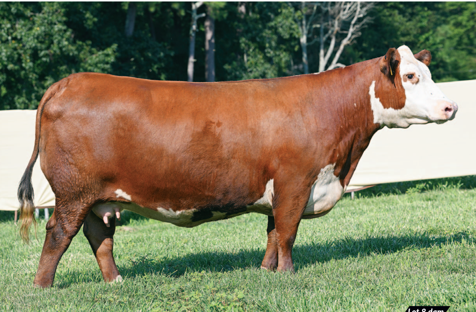
MCF 405D G16 GIDGET 107J ET