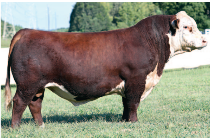
CHURCHILL EQUITY 3316L ET