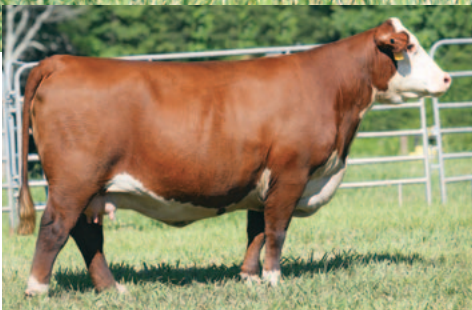
LOEWEN HADLEY G16 J12 ET $120,000-valued maternal sister to Lot 4 ...her daughters sell as Lots 9-13