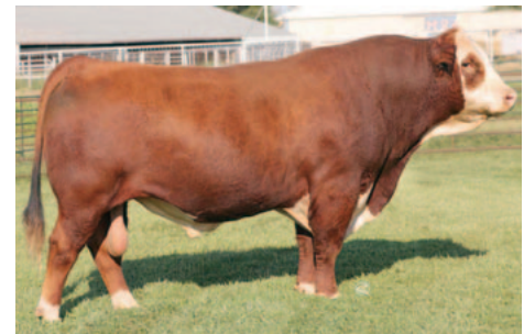
SPEARHEAD 22S CORPS COMMANDE14