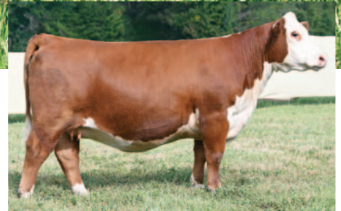
DCF J59 MS AMBER 91L This daughter of Lot 2 sells as Lot 3