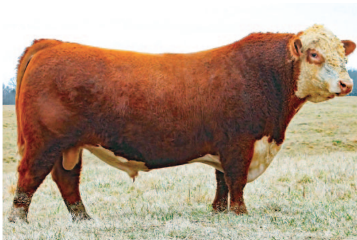
JW B716 DEVOUT 18051