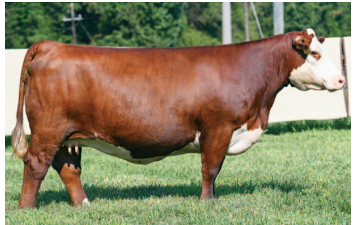
LOEWEN HADLEY 4013 J13 ET

Maternal granddam of Lot 16...she sells as Lot 4