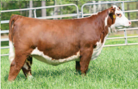
DCF J59 NANCY 106M ET Daughter of Lot 2