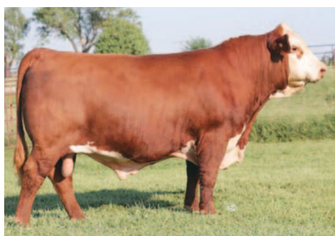
LOEWEN CMF MENDEL 7G