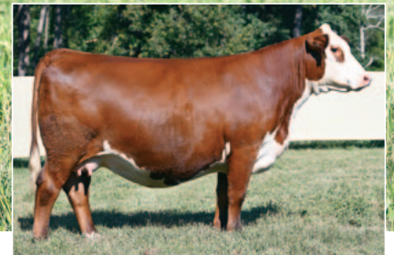
WLKR LF JH ROSE H086 2446 ET