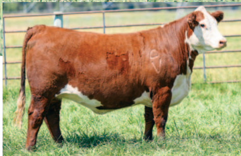
CHURCHILL LADY 4136M ET $35,000 maternal sister to Equity