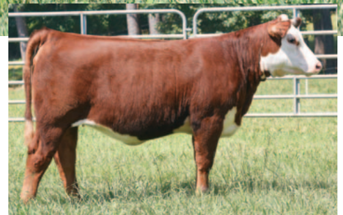
DCF J13 BAILEY 24L ET $47,000-valued first ET heifer calf of Lot 4 ...a daughter sells as Lot 16