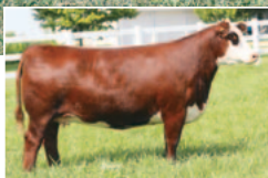
HAPP DARLA 33D ET Dam of Lot 47