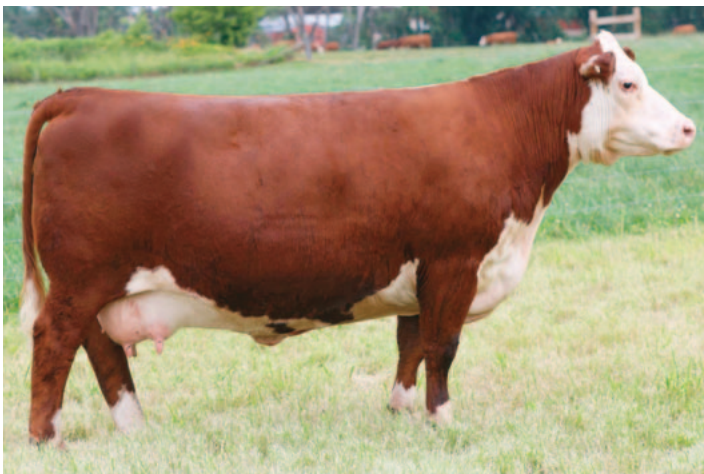
77 MISS ELLISON 60D 17G Maternal granddam of Lot 29