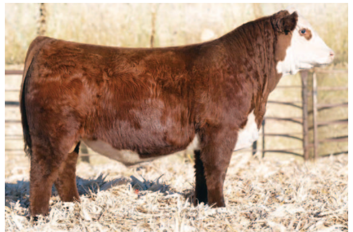
JDH JCS RED HOT 43M ET