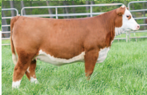
DCF J59 AMBER 110M ET Daughter of Lot 2