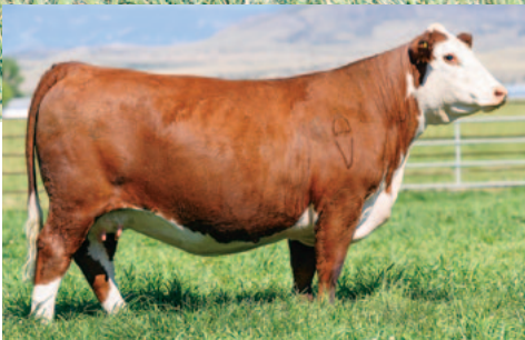
CHURCHILL LADY 3310L ET $160,000 maternal sister to Equity