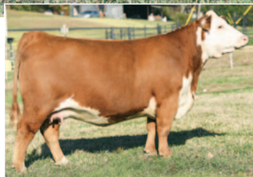
C 6018 X651 LASS 0067 ET Dam of Lot 36