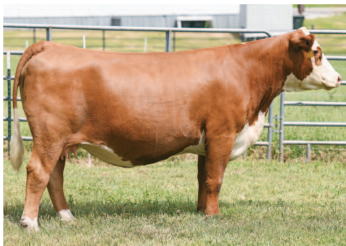
SPEARHEAD 001/B27 LULU G3 Dam of Lot 45