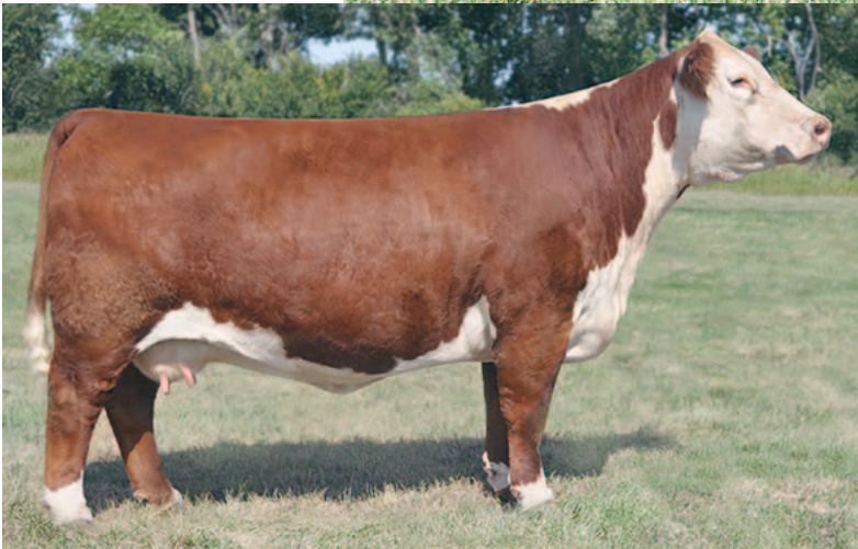
LCC TWO TIMIN 438 ET "HARLEY" Maternal granddam of Lot 27