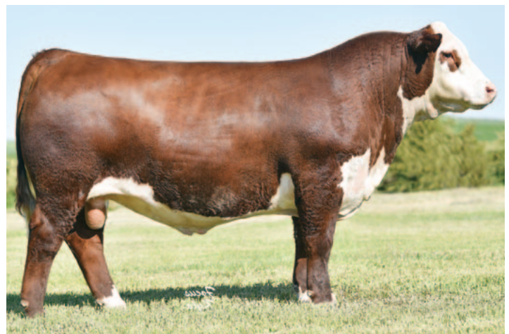
NJW 79Z Z311 ENDURE 173D ET