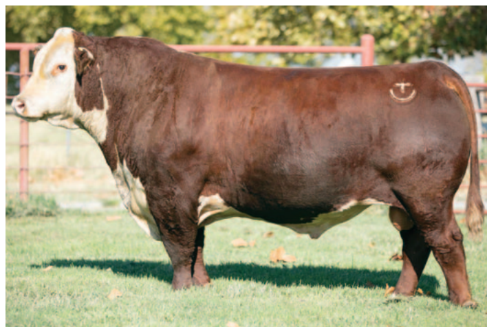
SHF HORIZON D287 H022 ET

■ Bred AI 3/11/25 to Churchill Equity 3316L ET. Safe AI. PE 3/24/25 to 5/30/25 to SFCC TRM Mandate 3047.