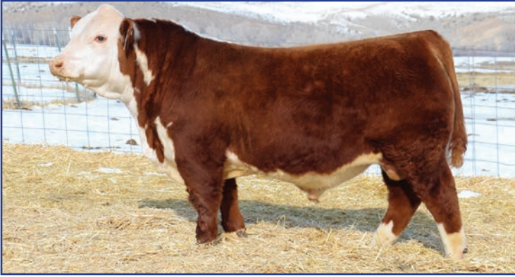
CHURCHILL LONG HAUL 234K ET

SANDROCK RANCH 7TH ANNUAL PRODUCTION SALE