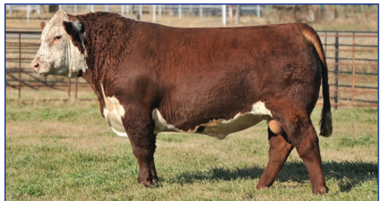
BR SRR C&L LOEWEN VALIANT (43855869)