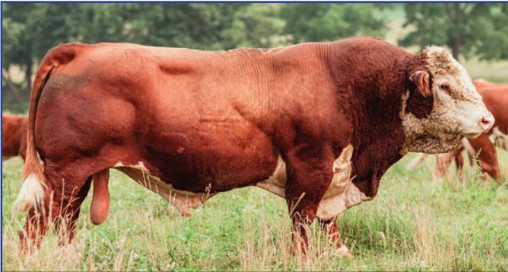
SHF EMPORIA 001A ET89 (43793602)