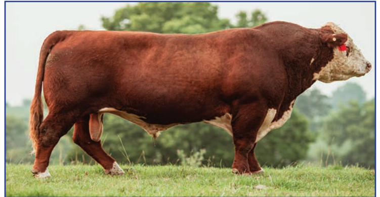
SHF HAVILAND F158 H028 (44123599)