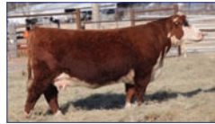
DAM OF 403M ET - 77 MISS ELLISON 60D 17G (P44015785)

JDH 11B STUD 3134 63E JDH AH MS 34X VICTOR 33Z46C ET SHF ELLISON 167Y E149 77 MISS BIG TIME 16B 11C 60D