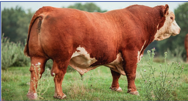
RHF 4013 RED RIVER 9021G ET (44069042)