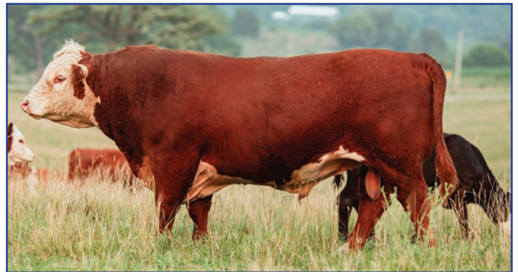
RV 4013 TESTED 0921 (44185510)