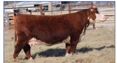
DAM OF 424M ET - 77 MISS ELLISON 60D 17G (P44015785)

We definitely hit a homerun with this one. This easy fleshing bull is excellent in his skeletal build and offers plenty of mass and substance. One look at his EPD profile and you'll see that he is well rounded. Top 5% CE, MARB & CHB$. TOP 10% CW