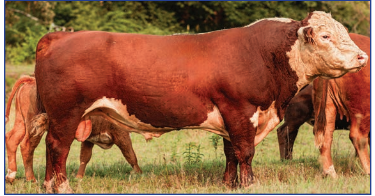
EFBEEF C615 RESOLVED H615 (44208618)