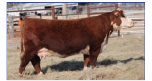
DAM OF 439M ET - 77 MISS ELLISON 60D 176 (P44015785)