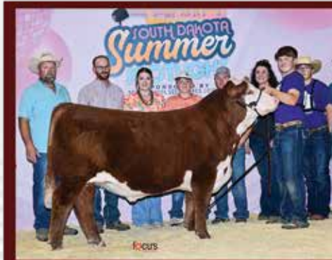
2024 CHAMPION FUTURITY STEER ECR FORT GEORGE 3576 RAISED BY FAWCETT'S ELM CREEK RANCH CONGRATULATIONS CHISUM BLUM