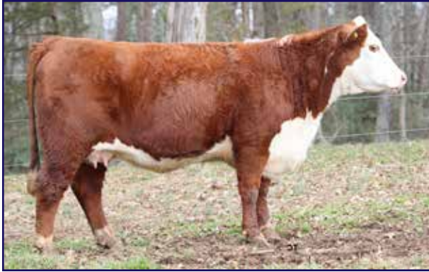
Lot 17 — BBF MISS EXPEDITION K3