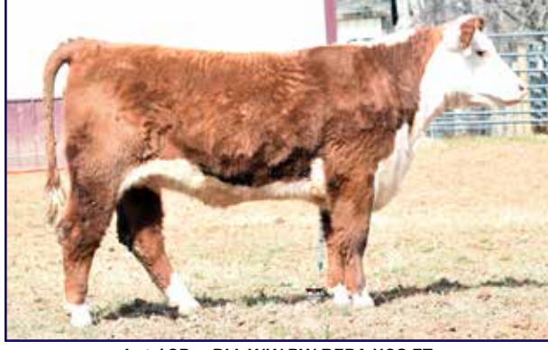
Lot 13B — BLL WW BW REBA K28 ET