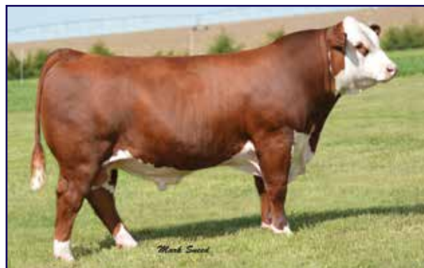
R LEADER 6964 — Sire of Lot 1 Embryos

HYALITE ON TARGET 936 (S00){(DLF,HYF,IEF,MSUDF)} R LEADER 6964 (S00){(DLF,HYF,IEF,MSUDF,DFB)} P43500058 R MISS REVOLUTION 1009 (D00){(DLF,HYF,IEF,DFB)} SCHU-LAR ON TARGET 22S (S00){(CHB)}{(DLF,HYF,IEF,MSUDF,MDF,DFB)} HYALITE TS LASS 310 (DLF,HYF,IEF) MSU TCF REVOLUTION 4R (S00){(DLF,HYF,IEF,MDF,DFB)} R MISS WRANGLER 3007 DR WORLD CLASS 517 10H (S00){(DLF,HYF,IEF)} DR LADY OF CLASS 10H S08 (DLF,HYF,IEF,MSUDF) P42686849 DR LADY LUCK 8020 P01 (D00) FELTONS 517 (S00){(DLF,HYF,IEF,MSUDF)} VPI MARATHON LADY 0081 OXH MARK DOMINO 8020 (S00){(DLF,IEF)} DR STYLE & SUBSTANCE LOZ