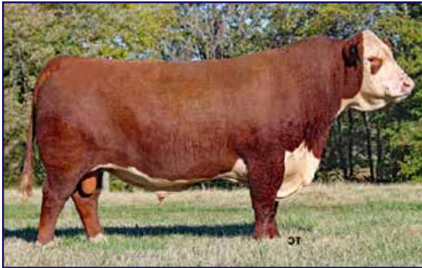
KCF BENNETT HOMEWARD C776 — Paternal Grand sire of 21A, 22 and 23