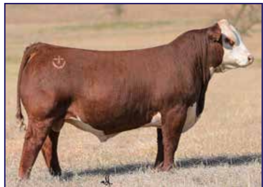
SHF HOUSTON D287 H086 — Sire of Lots 14A and 15A