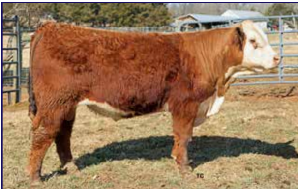
Lot 33 — MANTEWS H642 ROCKFORD 102L