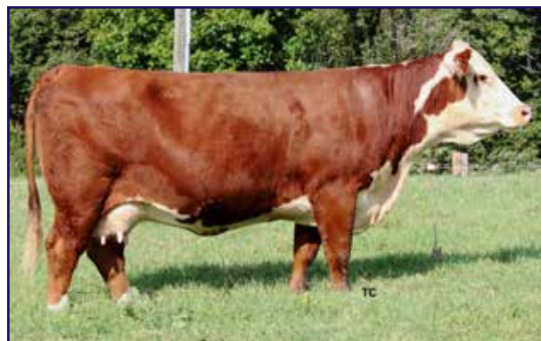
DR LADY OF CLASS 10H S08 — Dam of Lots 1, 2 and 3

LOT 3 THREE (3) GRADE ONE CONVENTIONAL EMBRYOS