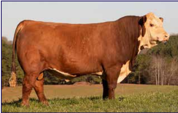
KCF BENNETT MONUMENT J338 — Sire of Lot 5