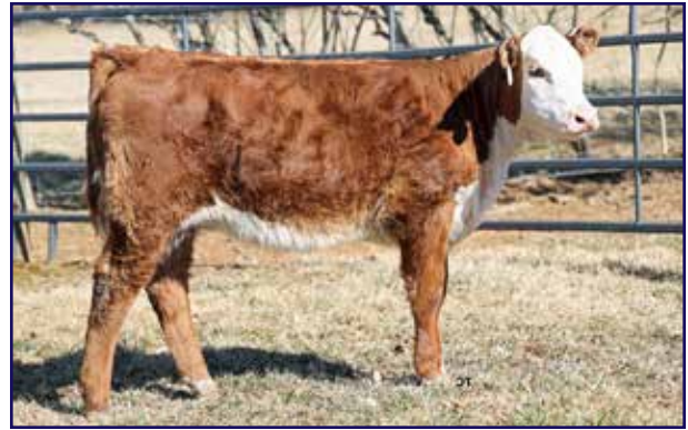
Lot 34A - MANTEWS 9023 AVA 119M