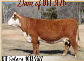
DTF Solara 4013 9627