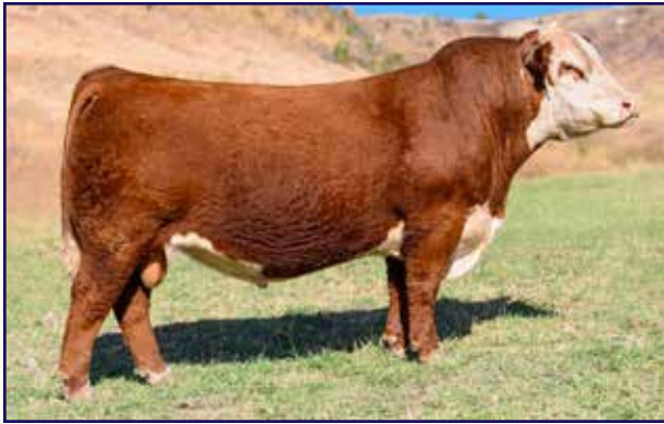
BAR JZ ON DEMAND — Service Sire