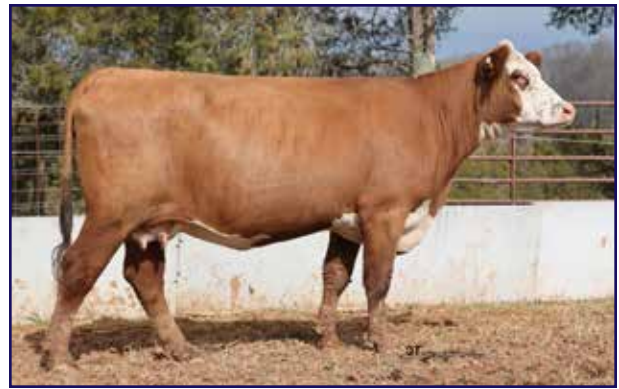
Lot 14 — BBF MISS STAND OUT H3