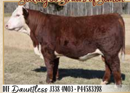
DTF Dauntless J338 4M03 - P44583398