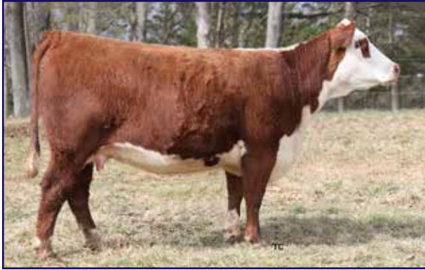
Lot 16 — BBF MISS BOBBIE 183F J13