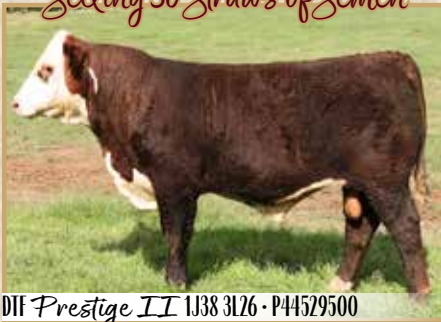
DTF Prestige II 1J38 3L26 - P44529500