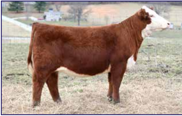
Lot 37 — ROOKER PRIDE 2425