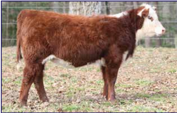
Lot 16A — BBF MISS KINGDOM 128J M4