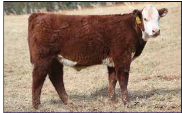
Lot 14A — WRF HOUSTON M30