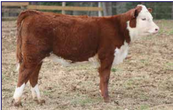
Lot 17A — BBF MISS EXPEDITION M21