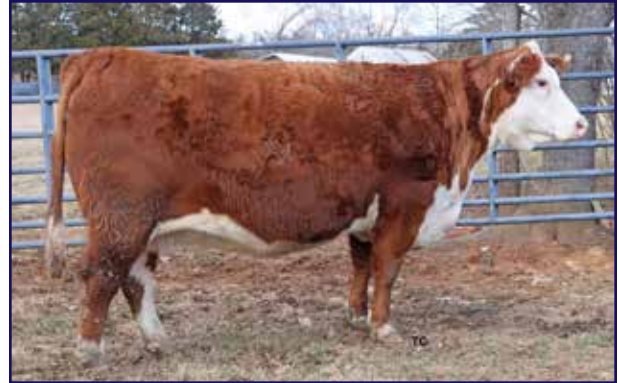
Lot 27 — BBF T'S LEGACY LEADER G14