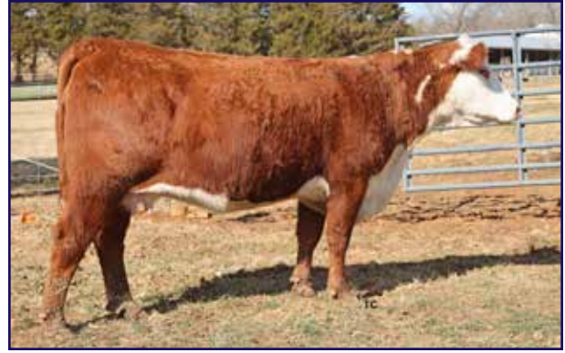
Lot 35 - DR HOME COOKIN C34 G01