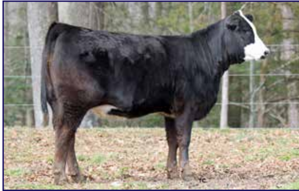
Lot 43 — HHF LAWSON'S AUDREY M7