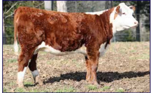
Lot 18 - HHF LAWSON'S SOCKS M16

Consigned by: Howling Hounds Farm, Lawson Family, Columbia, VA, 804-514-0297