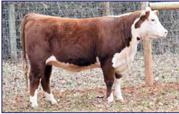
Lot 12 — BLL WW KW CAMILLA K26