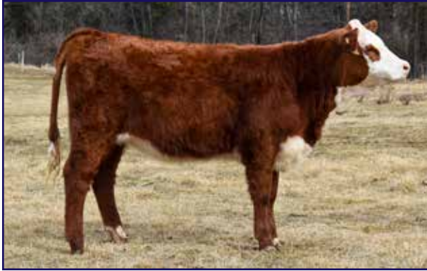
Lot 40 — TUDOR HALL CREST MISS M168