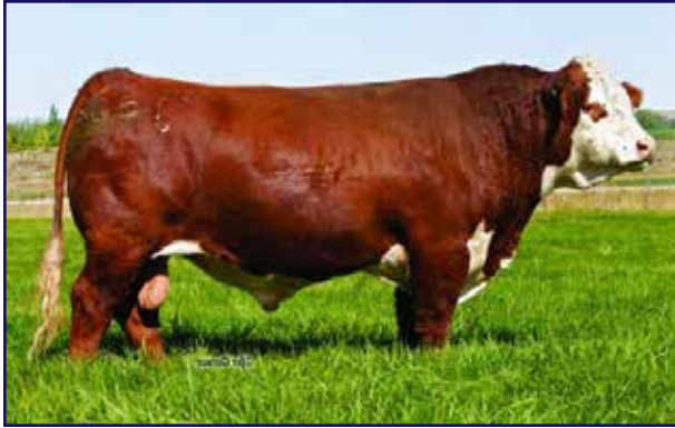
NJW 73S M326 TRUST 100W ET — Maternal Grand sire of Lot 23