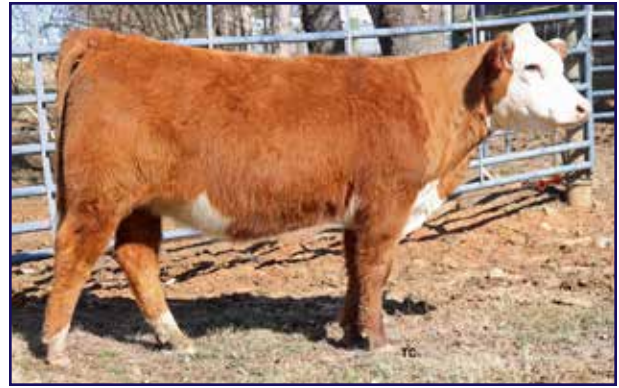
Lot 36 - MANTEWS 0558 LADY BIRD 104L