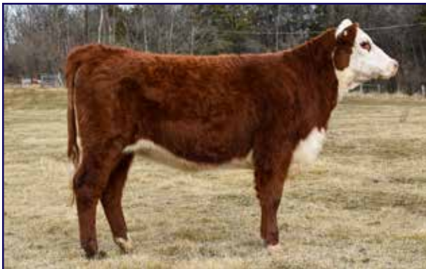
Lot 41 — TUDOR HALL CREST PROMISE M171