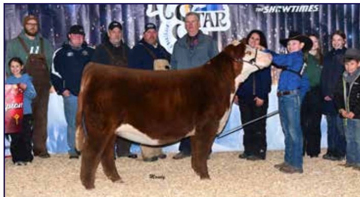
GOOD MISS MACY M1 — Full Sister to Lot 6 Embryos