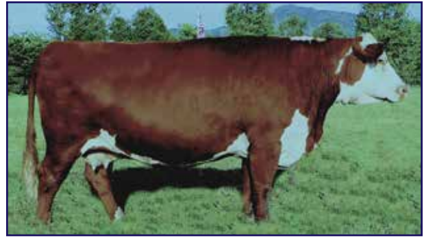
DR VICTORY LADY P606 A20 — Dam of Lot 25