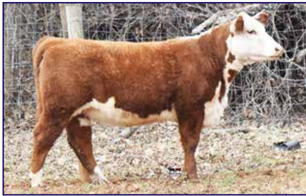
Lot 13A — BLL WW BW HARLEY GIRL K27 ET