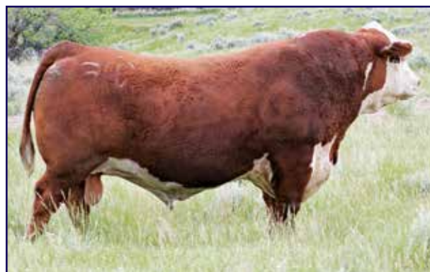
NJW 73S W18 HOMEGROWN 8Y ET — Sire of Lot 2 Embryos

SHF WONDER M326 W18 ET (S00){(CHB)}{(DLF,HYF,IEF,MDF,DFB)} NJW 73S W18 HOMEGROWN 8Y ET (S00){(DLF,HYF,IEF,MSUDF,MDF,DFB)} P43214852 NJW P606 72N DAYDREAM 73S (DLF,HYF,IEF,MSUDF,MDF) KCF BENNETT 3008 M326 (S00){(CHB)}{(DLF,HYF,IEF,MDF,DFB)} SHF GOVERNESS 236G L37 (DLF,HYF,IEF,MDF,DFB) PW VICTOR BOOMER P606 (S00){(DLF,HYF,IEF,MDF)} NJW 941 DEW 72N (DLF,HYF,IEF) DR WORLD CLASS 517 10H (S00){(DLF,HYF,IEF)} DR LADY OF CLASS 10H S08 (DLF,HYF,IEF,MSUDF) P42686849 DR LADY LUCK 8020 P01 (D00) FELTONS 517 (S00){(DLF,HYF,IEF,MSUDF)} VPI MARATHON LADY 0081 OXH MARK DOMINO 8020 (S00){(DLF,IEF)} DR STYLE & SUBSTANCE LOZ