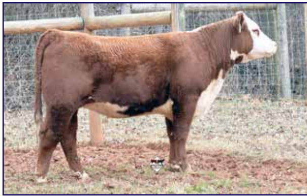
Lot 11 — BLL WW BW ATHENA K23