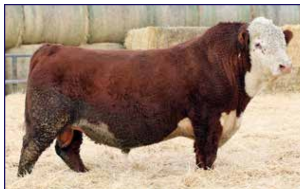
NJW 160Z 10W WHIT 33B — Sire of Lot 3 Embryos