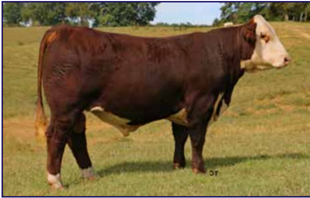
DTF PRESTIGE 33Z 1J38 ET — Sire of Lot 4