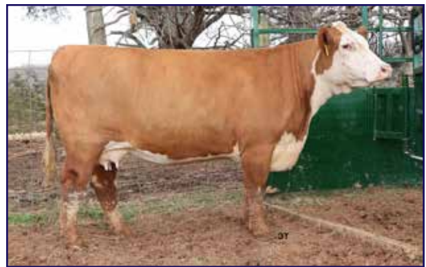
Lot 15 — BBF MISS STAND OUT G 4