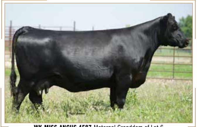
WK MISS ANGUS 4587 Maternal Granddam of Lot 6