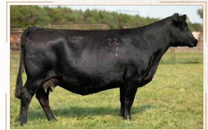
SITZ FOREVER LADY Y22 Maternal Granddam of Lot 1, Dam of Lot 65

A moderate framed bull that will get a lot of attention due to his mass and hip. Top 3% CEM, Top 10% Fat, Top 15% $M, Top 15% Angle, Top 15% DMI