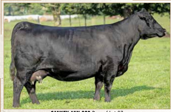
SANKEY ANN 930 Dam of Lot 87

A bull with high performance numbers that's attractive through his front third. He has good feet and a lot of maternal strength. Top 2% $F, Top 2% WW, Top 3% CWT, Top 4% Angle, Top 4% YW, Top 5% $AxJ, Top 10% $AxH, Top 10% $B, Top 10% RADG, Top 15% $C, Top 20% Claw, Top 20% REA