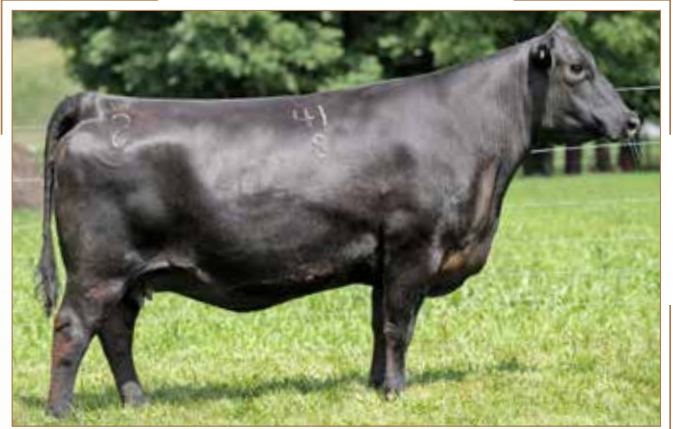
SITZ SHAUNA 418 Dam of Lots 66 and 69

A long fronted, long bodied bull that's correct in his structure. Top 3% Doc, Top 4% $M, Top 4% RADG, Top 5% $W, Top 10% $C, Top 10% Angle, Top 10% WW, Top 10% YW, Top 15% $AxJ, Top 15% HPreg, Top 15% Milk, Top 20% $AxH, Top 20% $B, Top 20% $F, Top 20% REA