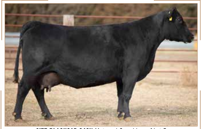
SITZ BLACKCAP 342U Maternal Granddam of Lot 5

Out of an 11-year-old cow. Very wide based, stout, and huge hipped. You won't find a better bull phenotypically. Top 5% CEM, Top 10% $F, Top 15% CWT, Top 15% Milk, Top 20% HPreg, Top 20% YW