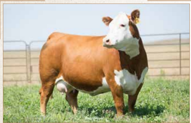
K&B BELLA 219Z 1ET Maternal Granddam of Lot 128