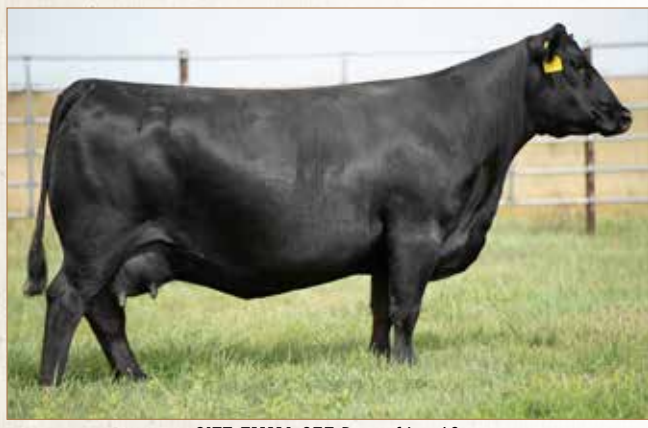
SITZ EMMA 67E Dam of Lot 10