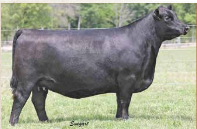
RUTH S S D180 Dam of Midwest

Can be used on heifers or cows. This is a high marbling bull that offers a lot of calving ease through his head, neck, and shoulder. Top 10% $AxH, Top 10% $B, Top 10% $C, Top 10% $F, Top 10% CED, Top 10% CEM, Top 10% RADG, Top 15% $AxJ, Top 15% $M, Top 15% Doc, Top 15% Marb, Top 20% $G, Top 20% $W, Top 20% BW, Top 20% Claw, Top 20% YW