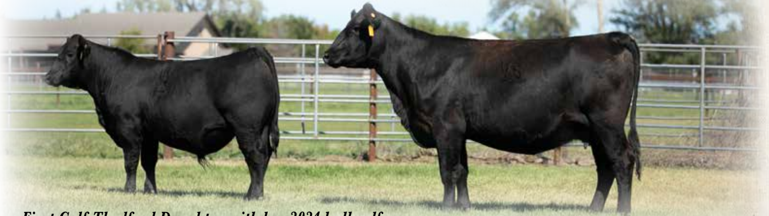
First Calf Thedford Daughter with her 2024 bull calf

Can be used on heifers or cows. This is one of the really good bulls of the sale. He's massive bodied, good looking, and smooth made. I love how maternal his pedigree is. Top 5% BW, Top 10% CED, Top 15% $W, Top 15% RADG, Top 15% WW, Top 15% YW