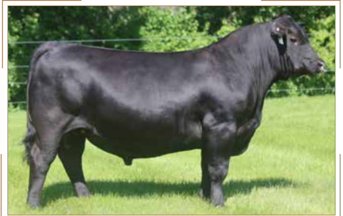
JFCC BOBCAT Full brother to Lot 78