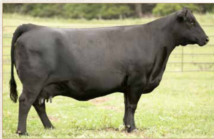
HA RITO LADY 3839 Foundation Donor & Maternal Granddam of Lots 24 and 25