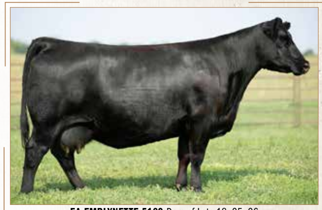
EA EMBLYNETTE 5169 Dam of Lots 18, 95, 96

A really robust made, stout bull that's exceptionally long through his front third. Top 5% Claw, Top 15% Angle