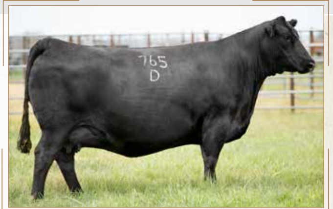
SITZ BARBARAMERE NELL 765D Dam of Lots 55 and 56