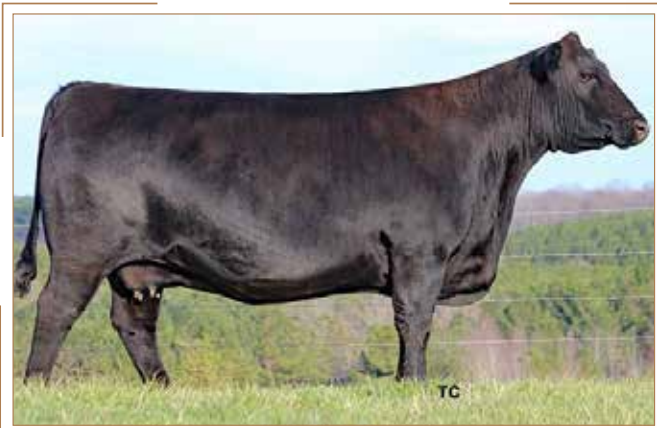
THOMAS PATRICIA 9705 Dam of Lots 38, 39, 40, and 41