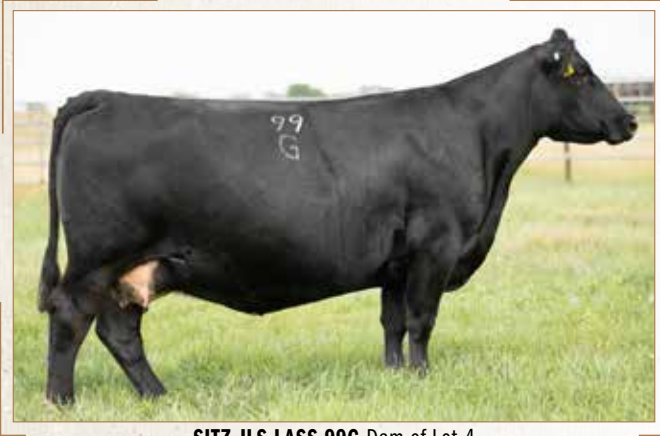
SITZ JLS LASS 99G Dam of Lot 4