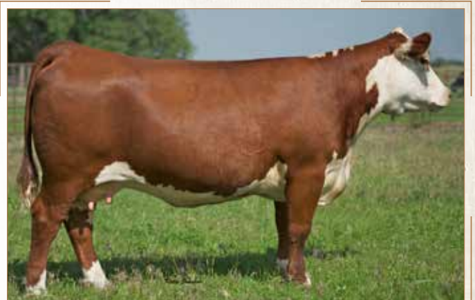
NJW 78P 63N LADYSPORT 51W ET Maternal Granddam of Lot 133

HORNED. Fully Pigmented. One of the highest quality bulls in the sale. He's excellent on his feet and legs, very attractive, well built, and extremely complete. Top 7% UREA, Top 16% Ufat, Top 18% SCHB, Top 20% CWT