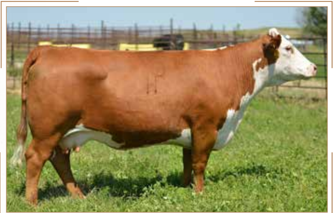
HH MISS ADVANCE 1181Y ET Maternal Granddam of Lots 129 and 142

HORNED. Fully Pigmented. Long, attractive, and good on his feet and legs. Top 1% Stay, Top 1% TEAT, Top 2% $BII, Top 2% UDDER, Top 3% $BII, Top 9% SC, Top 15% CEM