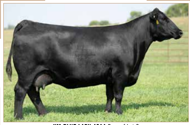
KM BLUE LADY 4214 Dam of Lot 2

SIRE OF LOTS 1-6 Bar None is owned with Genex and Hilltop Angus in Montana. He was the high seller in our fall bull sale two years ago. To me, he's as complete of a bull as 3839 has produced. There is absolutely no fall out in his calf crop. They are wide, thick, and dense. The females are pretty headed, elegant, and deep. He's one of the best breeding bulls we have used since we have been in the business.