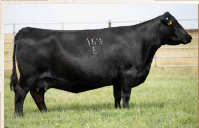
SITZ JLS BARBARAMERE NELL 16 Dam of Lots 14, 15, 16, 32, 33, 34, 57, 58, 59, 60, 61, 62, 63, 64