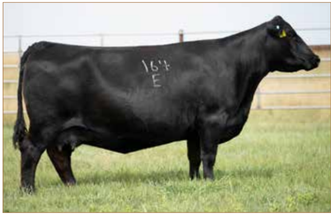
SITZ JLS BARBARAMERE NELL 16 Dam of Lots 14, 15, 16, 32, 33, 34, 57, 58, 59, 60, 61, 62, 63, 64