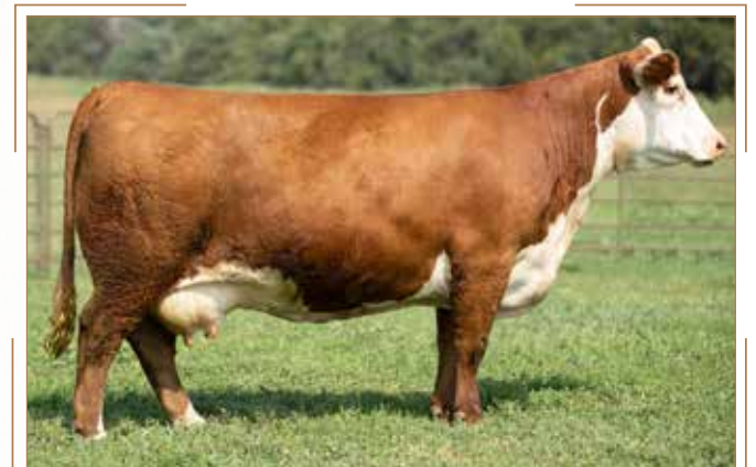
GERBER Z426 DIXIE E066 Dam of High Time

POLLED. Fully Pigmented. A low-birth-weight bull with high calving ease and a very solid pedigree. Top 4% SC, Top 7% CED, Top 8% UDDER, Top 9% CWT, Top 12% M&G, Top 12% TEAT, Top 13% WW, Top 18% CEM, Top 18% Milk, Top 19% YW