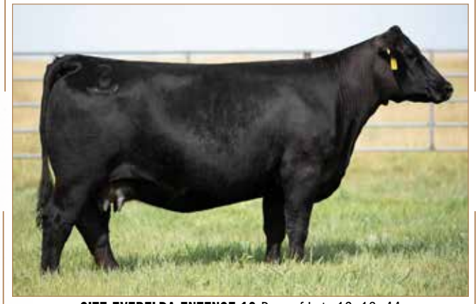
SITZ EVERELDA ENTENSE 10 Dam of Lots 12, 13, 44