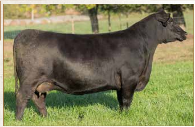
SANKEY ANN 934 Dam of Lot 78

ACT BW: 72 • WW RATIO: 100 • YW RATIO: 100 • ADJ SC: 37.4 Can be used on heifers or cows. Really massive made bull with an unbelievable set of numbers. He's out of an exceptionally good cow family. Top 3% $C, Top 3% CED, Top 3% Doc, Top 3% RADG, Top 5% $F, Top 10% $AxH, Top 10% $B, Top 10% HPreg, Top 15% $G, Top 15% BW, Top 15% CWT, Top 15% Marb, Top 20% $AxJ, Top 20% $M, Top 20% Angle, Top 20% YW