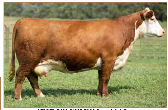
GERBER Z426 DIXIE E066 Dam of High Time

SIRE OF LOTS 109-113 High Time is a trend setter for the breeds current needs. He is homozygous polled, red eyed individual who offers great calving ease, carcass traits and udder quality that many of us are seeking. His sons have a lot of mass and power while his daughters are very broody made and they look like "the kind". High Time's dam is now owned by Stellflug Cattle Co.