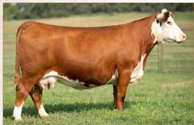
RMB 4013 SOUTHERN BELL 319F ET Dam of Lots 119, 120, 121, 122, 123