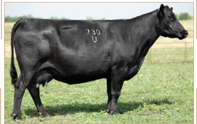
SITZ BARBARAMERENELL 730U 342U Maternal Granddam of Lot 21

A smooth fronted, very maternal bull that'll last a long time. Top 1% Angle, Top 3% $AxJ, Top 3% $C, Top 3% RADG, Top 4% $AxH, Top 5% $B, Top 10% $F, Top 10% $G, Top 10% Marb, Top 10% REA, Top 15% Claw, Top 15% DMI, Top 20% $M, Top 20% YW