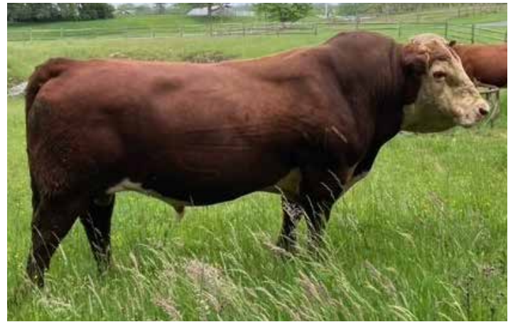
WLKR FAF GAUCHO 33Z 315A 939G — SIRE OF LOT 421