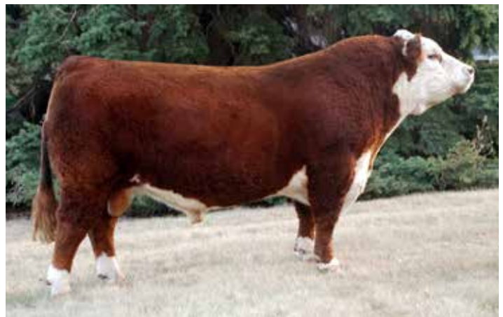
UPS SENSATION 2504 ET — GRANDSIRE OF LOTS 412, 413 & 414