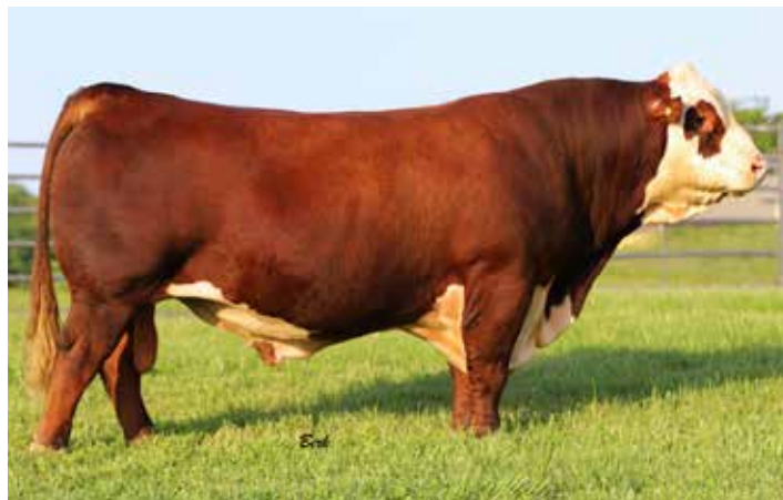
CMF 1720 GOLD RUSH 569G ET — AI SIRE OF LOTS 428 & 429