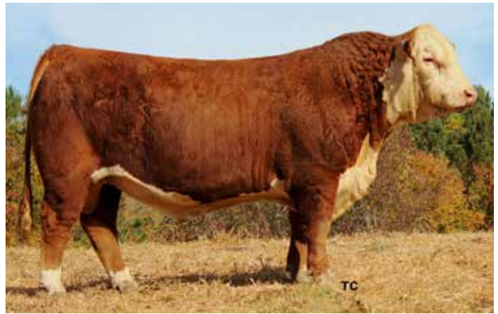
INNISFAIL WHR X651/723 4013 ET — SIRE OF LOT 411