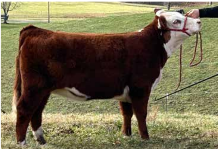
LOT 402 — SUNRIDGE 24 BELLA 224