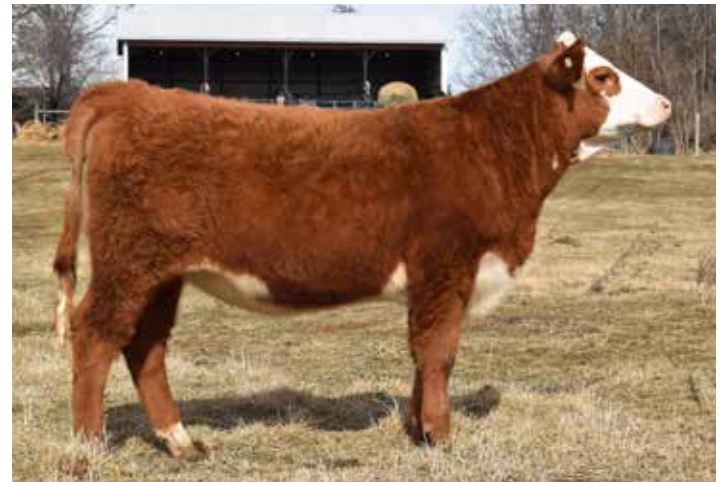
LOT 439 — TUDOR HALL HOSS JUSTA M165