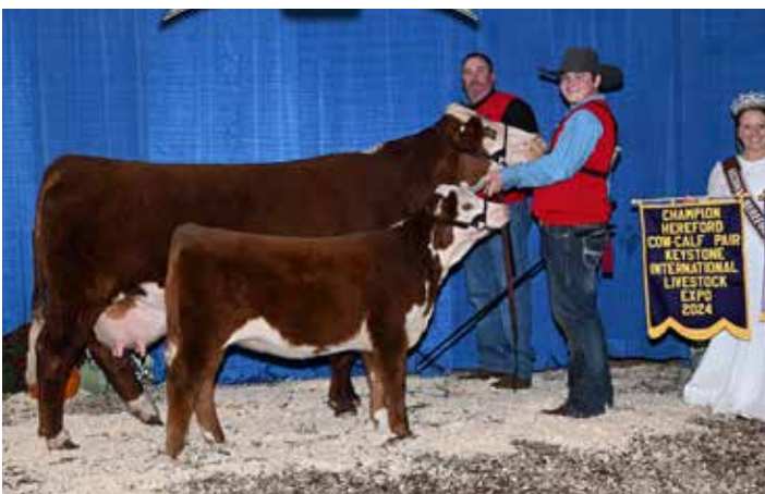
MATERNAL SISTER TO LOTS 401 & 402