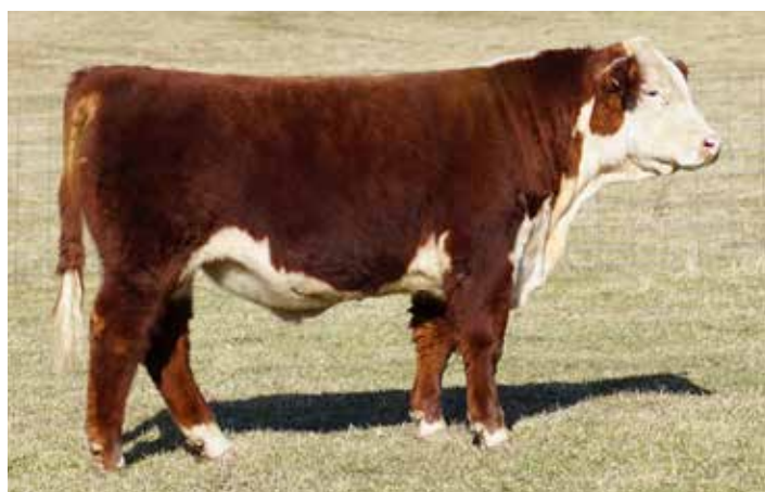
LOT 417 — CHF 156J STEADFAST 4040 ET