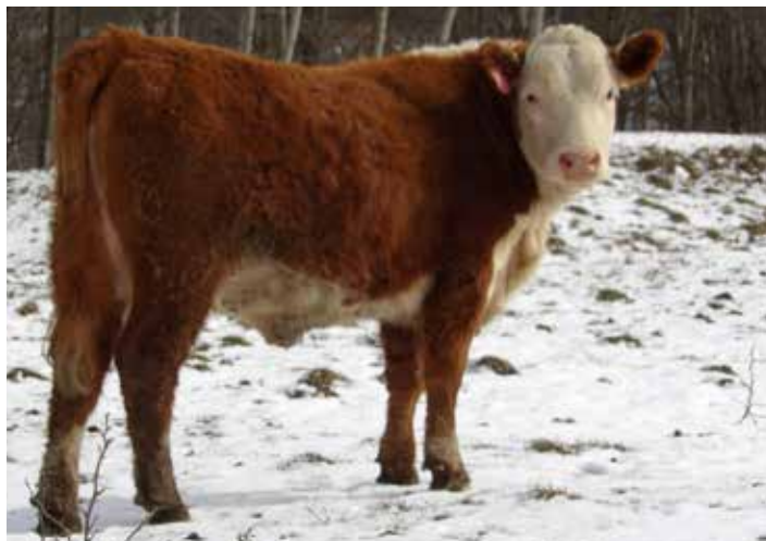
CHURCHILL DESPERADO 029H — SIRE OF LOT 435