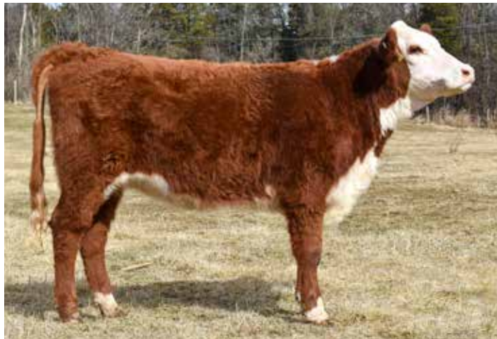
LOT 440 — TUDOR HALL CREST JACKIE M167