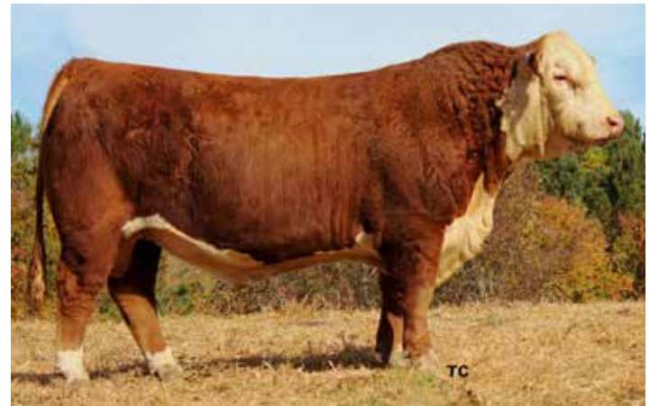
INNISFAIL WHR X651/723 4013 ET — SIRE OF LOTS 405, 407 & 411