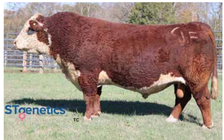
NJW 202C 173D STEADFAST 156J ET — SIRE OF LOT 406A AND AI SIRE OF LOT 407