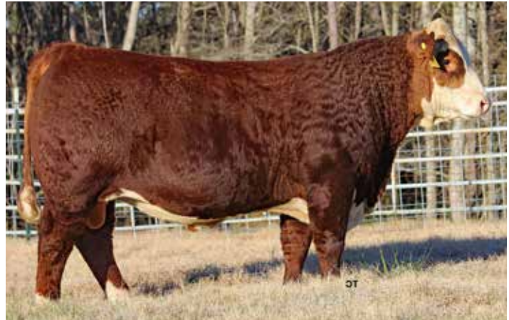
WHITEHAWK RING MASTER 396H