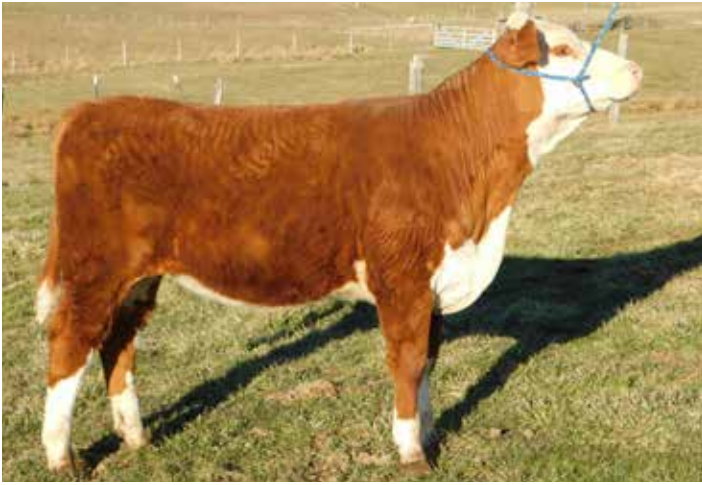
Lot 423 — GHF MS PRIDE 68E 136 M449