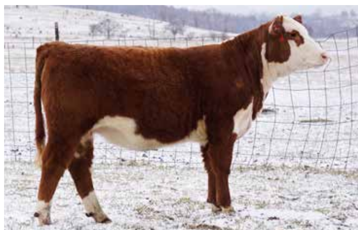
LOT 416 — CHF TTF 87G STELLA 4545 ET