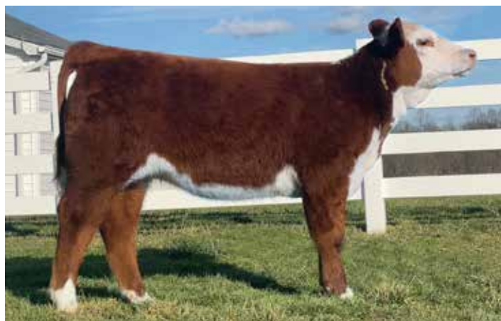
LOT 409 — UHF U08H ALEXIS U21M