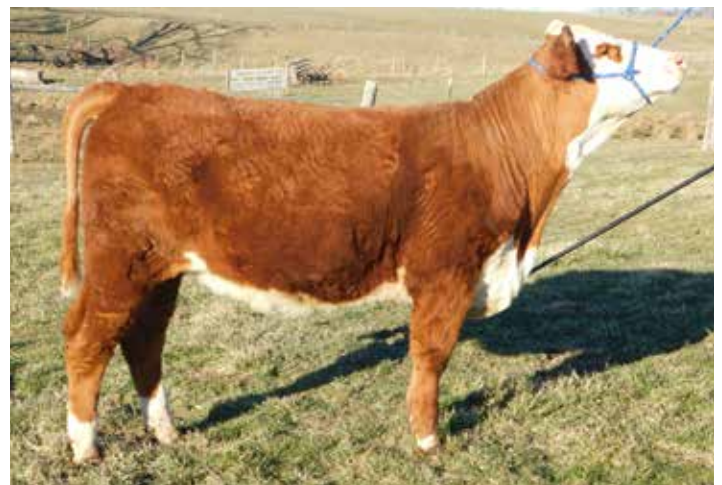
Lot 422 — GHF MS LUCKY ONE 68E 815 M425