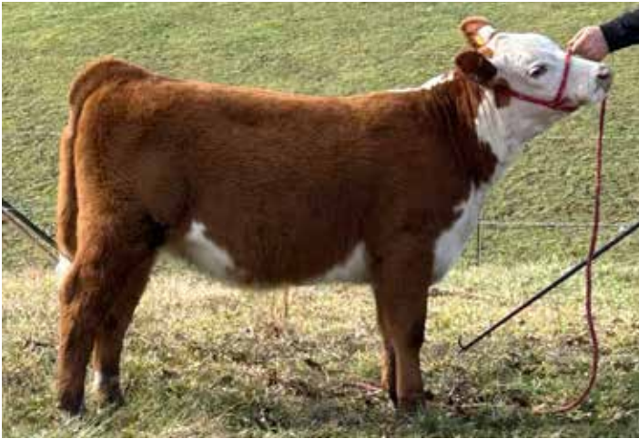
LOT 401 — SUNRIDGE 24 LADY UNA 724 Donated by Sunridge Livestock