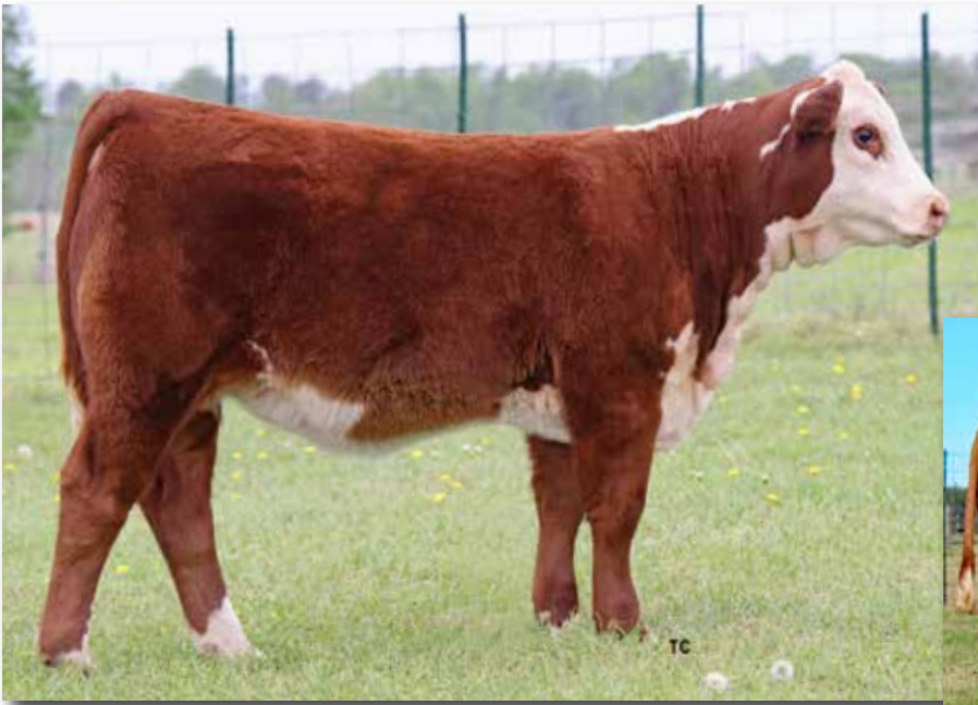
Lot 21A – THM 3211 DAHLIA TOO 6122