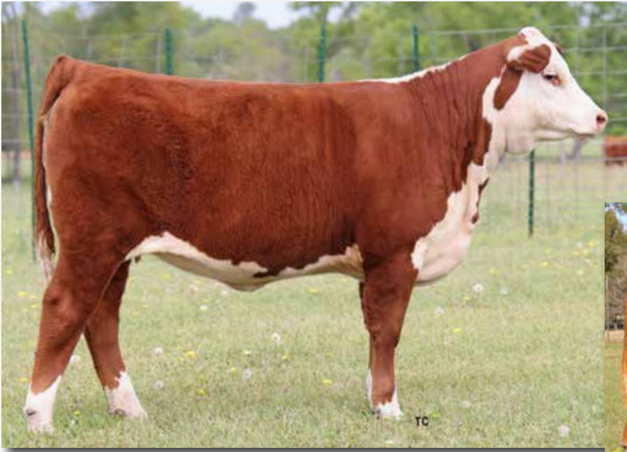
Lot 12A – THM 1077 MARIAM 6028