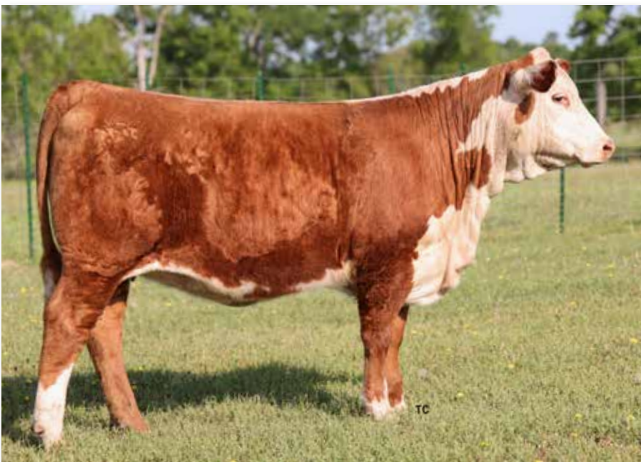
Lot 61 – THM 1077 BEEFMAID 5233