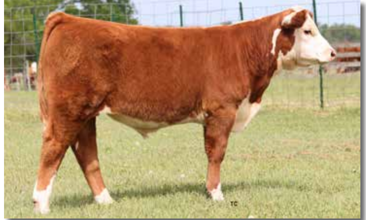
Lot 34A – THM BELMONT 6098