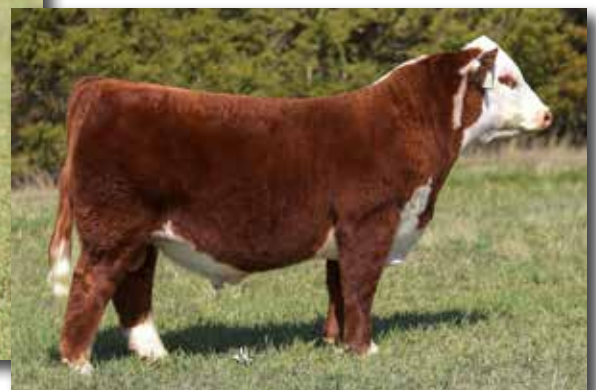
KJ 488G Justice 606M – Featured A.I. Sire