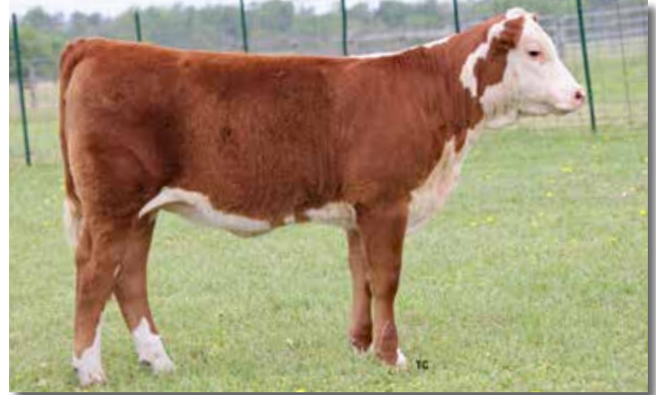
Lot 26A – THM 2018 LADY TANK 6150

26A THM 2018 LADY TANK 6150 {DLF,HYF,IEF,MSUDF,MDF,DBF} COW • P44733819 • DOB: 11/27/25 • TATTOO: RE THM/LE 6150