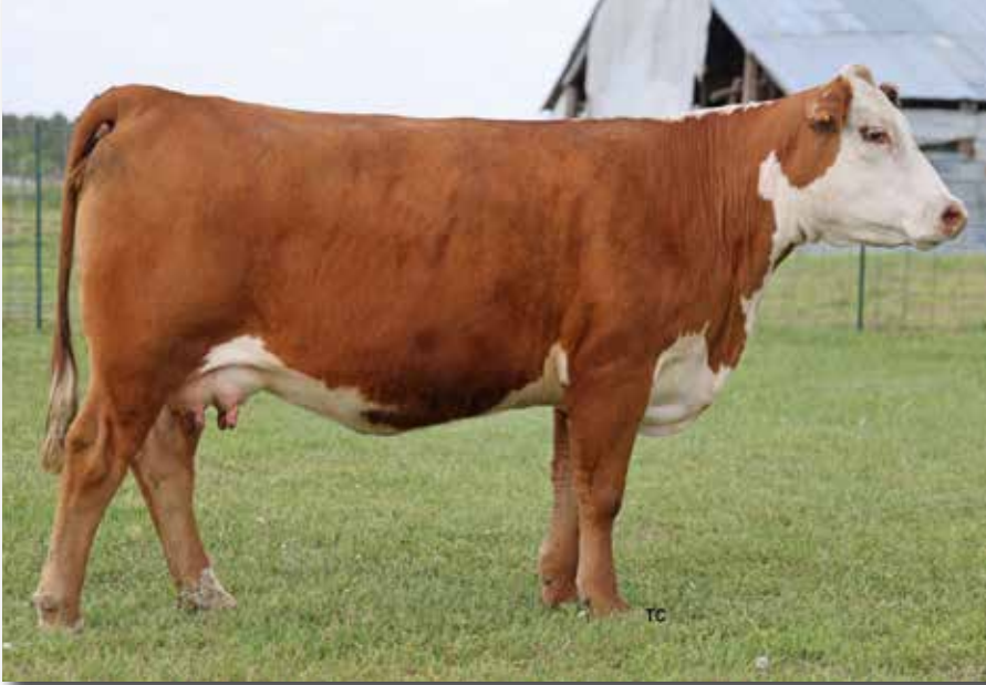
Lot 42 – THM H086 TARYN 3035