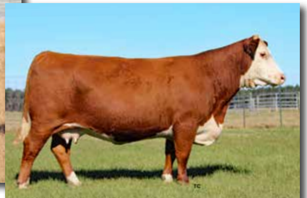
THM 2161 ROCKIN' ROBIN 5110 – Dam of Lot 35