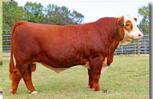
HUTH CLC WF DELUXE KO16 – Sire of Lots 4 & 5