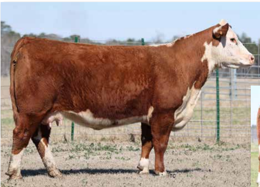
Lot 21 – THM 79G DALIA 2051 ET