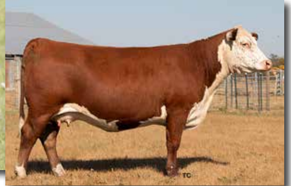
THM Z426 ROSEMARY 0028 – Dam of Lots 8 & 9