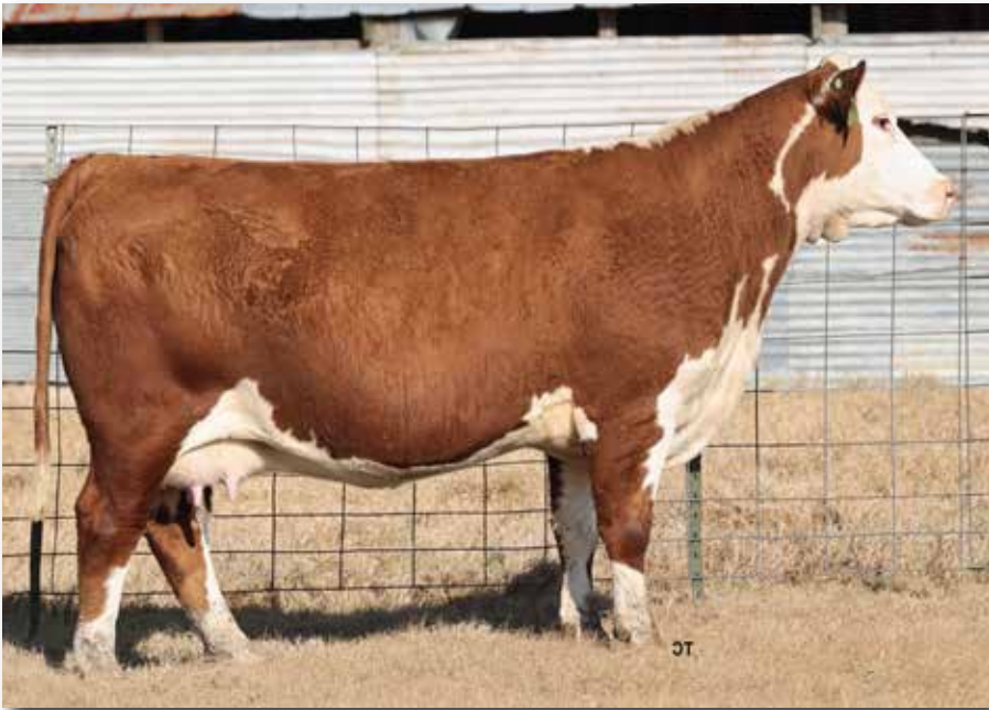
Lot 32 – THM 6964 LORIE 0226 ET