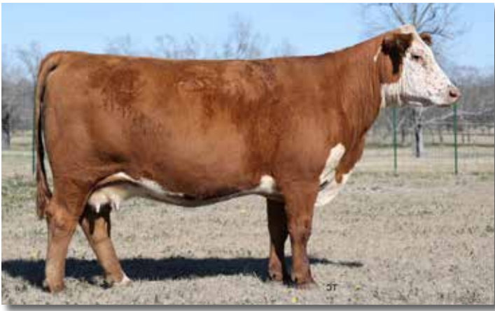
Lot 25 – THM 53D PREC -OUS 0007 ET

25 THM 53D PREC -OUS 0007 ET {DLF,HYF,IEF,MSUDF,MDF,DBF} COW • P44079620 • DOB: 8/30/19 • TATTOO: RE THM/LE 0007