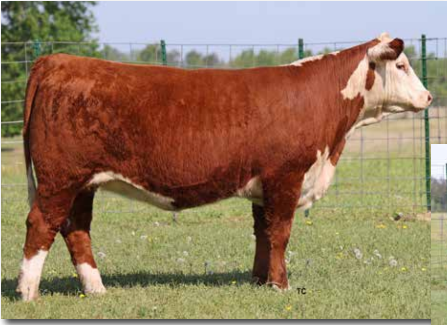
Lot 51 – THM 3016 LILLA 5217