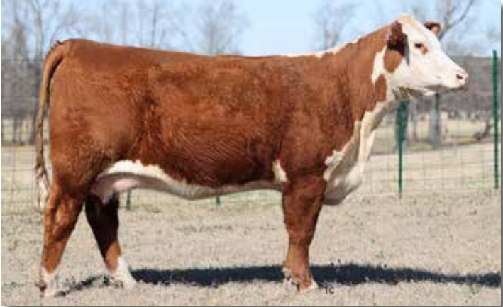
Lot 37 – JLG 7040 VICTRA 5779