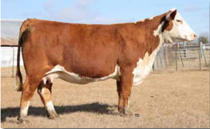
Lot 34 – THM 7040 MAY BELLIN 0137