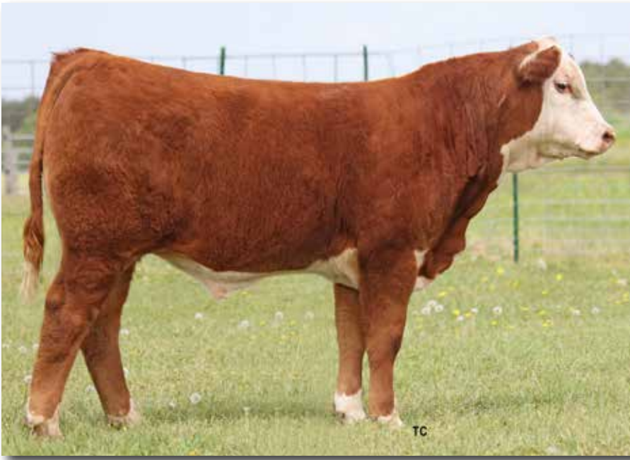
Lot 38A – THM BIG TANK 6103