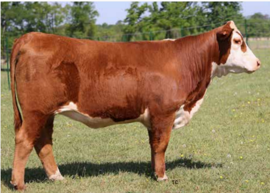
Lot 52 – JLG VICTORIA 5828