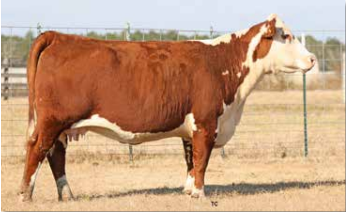
Lot 19 – THM 199B VICTORIA 2011 ET