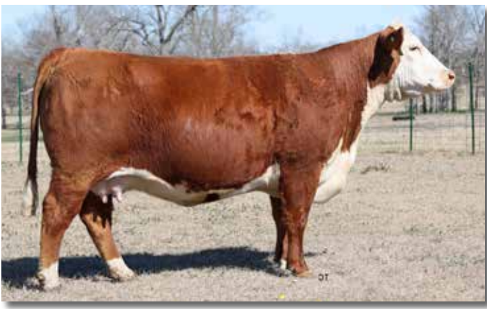
Lot 36 – THM 652D LADY TANK 1190 ET