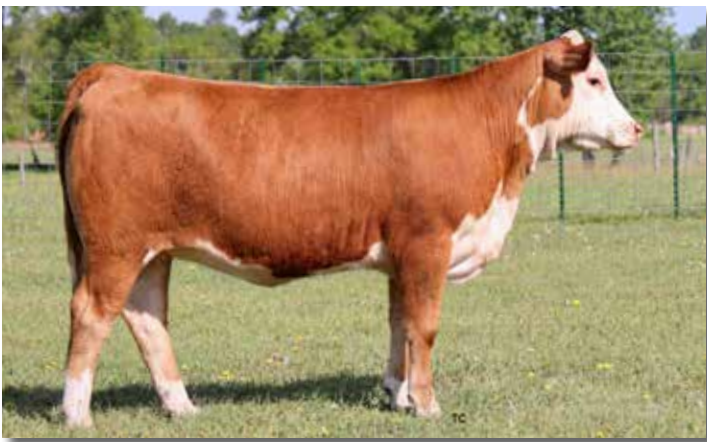
Lot 58 – THM J28 TARYN 5210

58 THM J28 TARYN 5210 {DLF,HYF,IEF,MSUDF,MDF,DBF} COW • P44736068 • DOB: 1/5/25 • TATTOO: RE THM/LE 5210 BEHM100W CUD4 504C (SOD)(CHB)(DLF,HYF,IEF,MSUDF,MDF,DBF) NJW 73S M326 TRUST 100W ET (SOD)(CHB)(DLF,HYF,IEF,MSUDF,MDF,DBF) 111F CUD4 J28 ET (DLF,HYF,IEF,MSUDF) BEHM R294 JASMAN102Y (DOD)(DLF,HYF,IEF,MSUDF) P44415803 KCF MISS TESTED C422 (DOD)(DLF,HYF,IEF,MSUDF) EFBEEF TFL U208 TESTED X651 ET (SOD)(CHB)(DLF,HYF,IEF,MSUDF) AHA GE-EPD KCF MISS X51A407 (DLF,HYF,IEF,MSUDF,MDF,DBF) SHF HOUSTON D287 H086 (CHB)(DLF,HYF,IEF,MSUDF,MDF,DBF) SHF DAYBREAK Y02 D287 ET (CHB)(DLF,HYF,IEF,MSUDF) THM H086 TARYN 3035 (DLF,HYF,IEF,MSUDF,MDF,DBF) SHF MISS 1420Z D223 (DLF,HYF,IEF,DBP) P44437109 THM 5666 TARYN 5120 (DLF,HYF,IEF) THM JLG TREUTLEN 5666 (DLF,HYF,IEF) LJR LORIE 363S (DOD)(DLF,HYF,IEF,MSUDF)