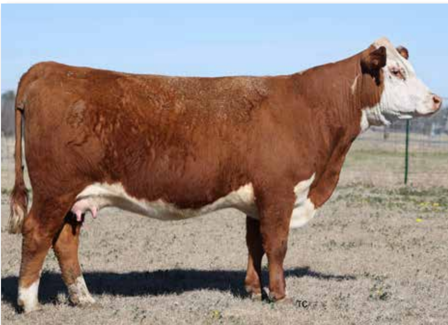
Lot 22 – THM 8122 MAY BELL 2078