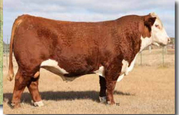
THM CRAFTSMAN 4163 ET – Service Sire on Yearlings