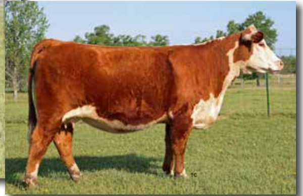
THM RILEY H086 CARLA SUE 3085 – Dam of Lot 2