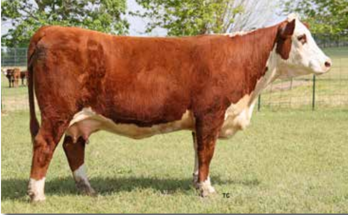
Lot 39 – THM 199B ROSEMARY 2014 ET