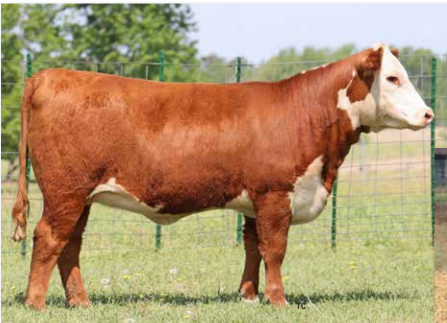
Lot 48 – THM 0016 MS BEAUTY 5197 ET