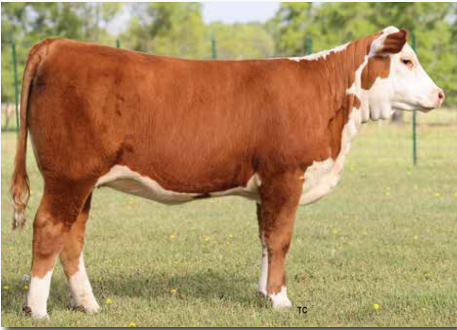
Lot 31A – THM RED PRINCESS 6001