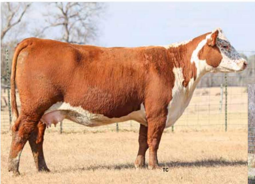
Lot 16 – THM 7040 EVEN BETTER 2136