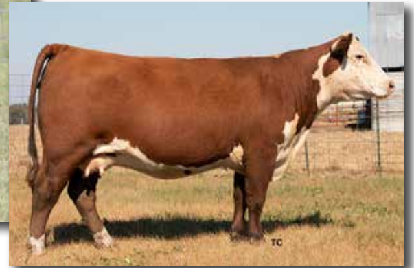
THM 53D PRECIOUS 0001 ET – Dam of Lot 10