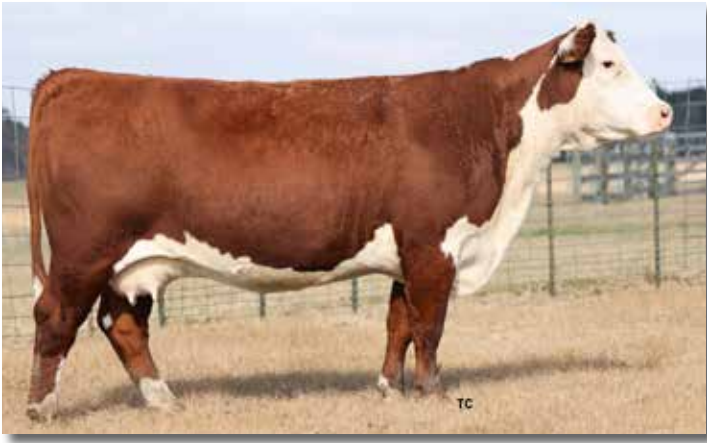
Lot 33 – THM 3097 TARYN 0042