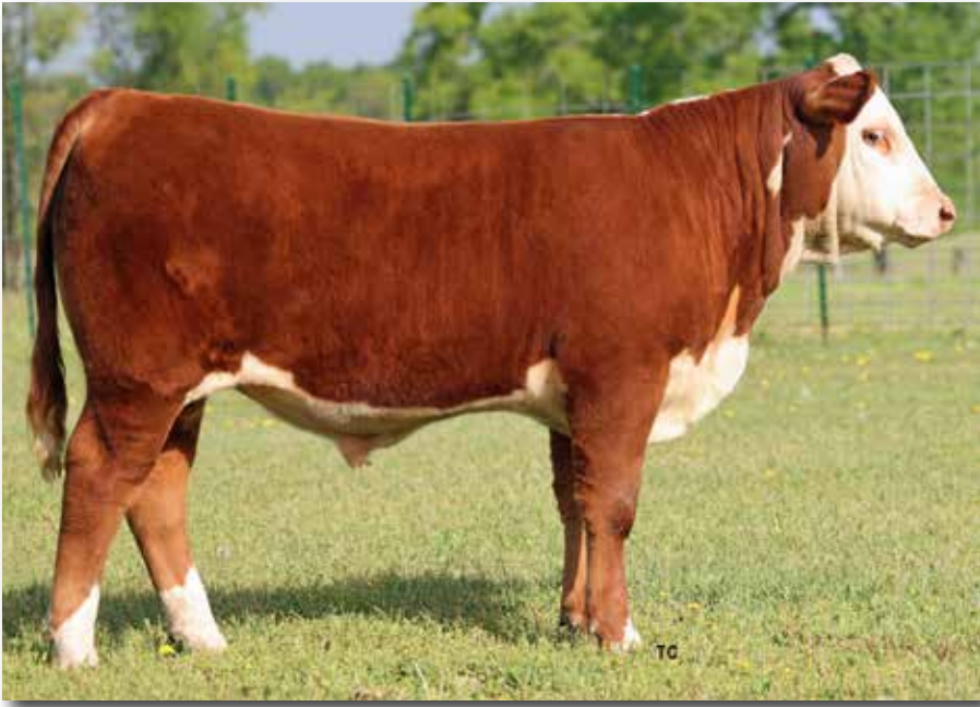
Lot 35A – THM ROBERT 6063