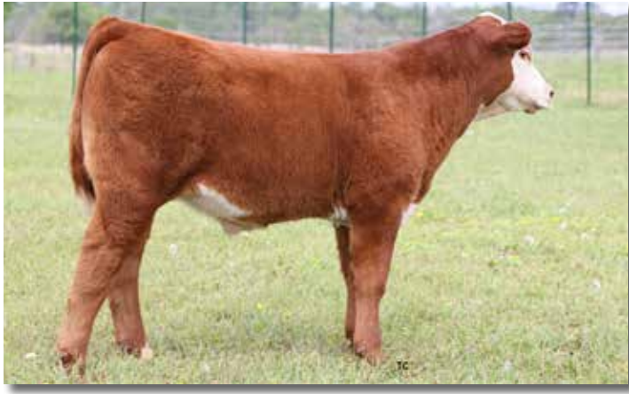
Lot 36A – THM MASTERLOCK 6159