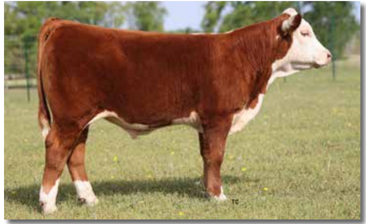
Lot 33A – THM TARZAN 6097