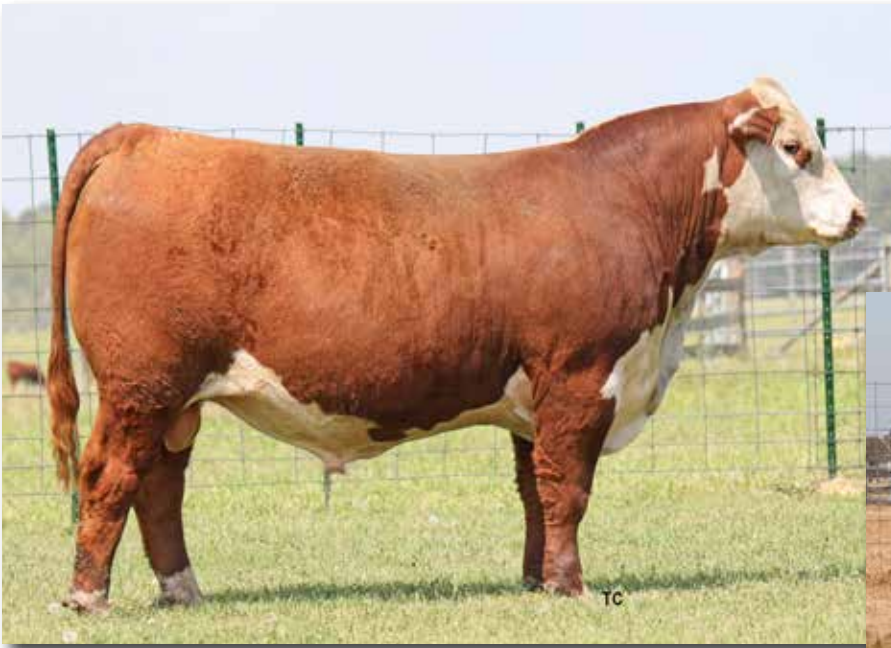
Lot 6 – THM SILVERMAN 5092