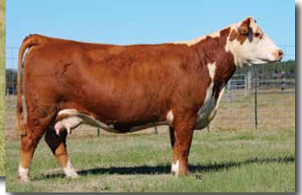
THM 6005 HANNAH MAY 8088 – Dam of Lot 17