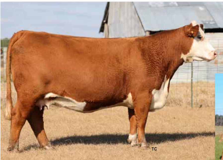
Lot 35 – THM C776 ROBIN 1016 ET