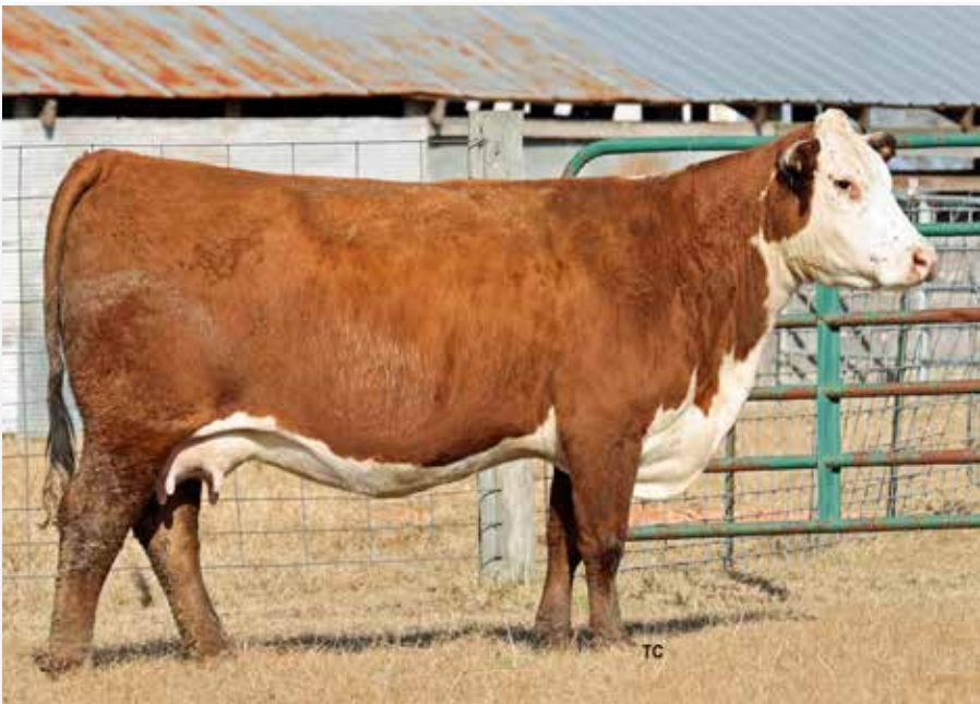
Lot 12 – THM 8122 MARIAM 2084