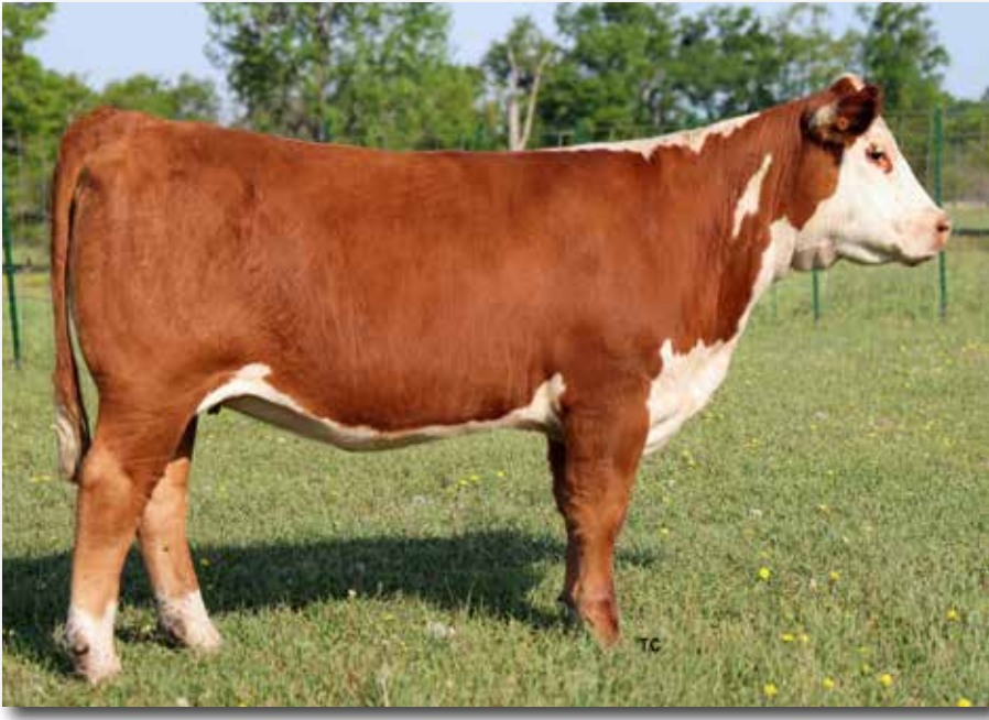
Lot 53 – THM 2186 CARRIE 5186