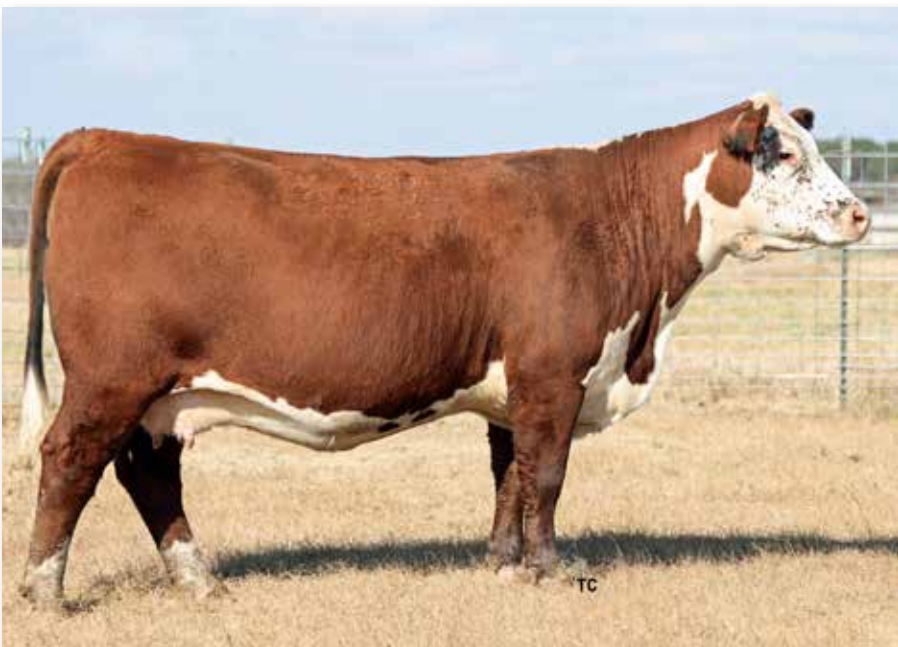
Lot 31 – THM 8122 PRINCESS 0138