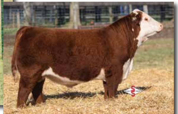
BOYD RUNWAY 4028 – Featured A.I. Sire