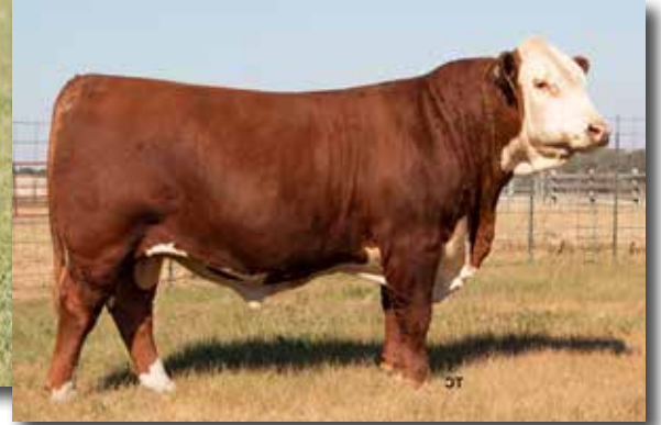
THM OGEECHEE 2018 ET – Sire of Lots 23A-26A