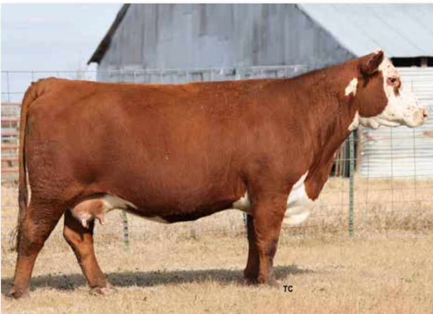
Lot 24 – THM 8122 BROWN BEAUTY 0145