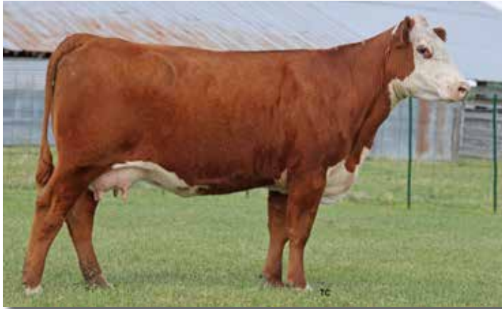
Lot 44 – THM 3018 DAHLIA 2124 ET