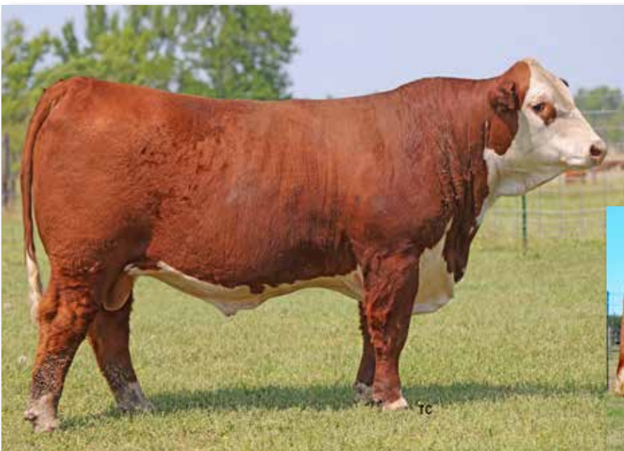
Lot 7 – THM YELLOWWOOD 5087