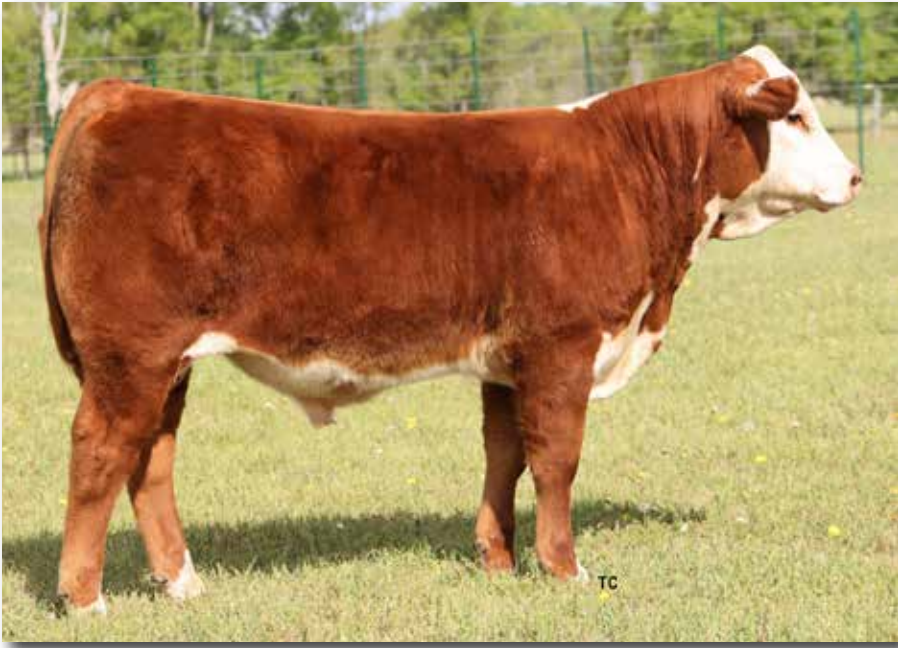
Lot 32A – THM LUCUS 6100