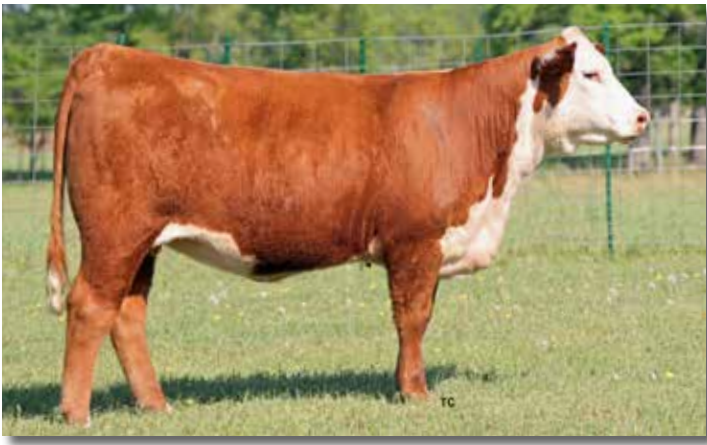
Lot 57 – JLG J28 VICTRA 5843

57 JLG J28 VICTRA 5843 {DLF,HYF,IEF,MSUDF,MDF,DBF} COW • P44736070 • DOB: 12/20/24 • TATTOO: RE JLG/LE 5843 BEHM100W CUD4 504C (SOD)(CHB)(DLF,HYF,IEF,MSUDF,MDF,DBF) NJW 73S M326 TRUST 100W ET (SOD)(CHB)(DLF,HYF,IEF,MSUDF,MDF,DBF) 111F CUD4 J28 ET (DLF,HYF,IEF,MSUDF) BEHM R294 JASMAN102Y (DOD)(DLF,HYF,IEF,MSUDF) P44415803 KCF MISS TESTED C422 (DOD)(DLF,HYF,IEF,MSUDF) EFBEEF TFL U208 TESTED X651 ET (SOD)(CHB)(DLF,HYF,IEF,MSUDF) AHA GE-EPD KCF MISS X51A407 (DLF,HYF,IEF,MSUDF,MDF,DBF) /SMANDATE 66589 ET (SOD)(DLF,HYF,IEF,MSUDF,MDF,DBF) R LEADER 6964 (SOD)(DLF,HYF,IEF,MSUDF,DBF) JLG VICTRA 5800 /S LADY DOMINO 0158X (DLF,HYF,IEF) P44449990 JLG 53D VICTRA 5763 (DLF,HYF,IEF,MSUDF) NJW 84B 10W JOURNEY 53D (SOD)(DLF,HYF,IEF,MSUDF,MDF,DBF) JLG 200Z VICTRA 5736 (DLF,HYF,IEF,MSUDF)