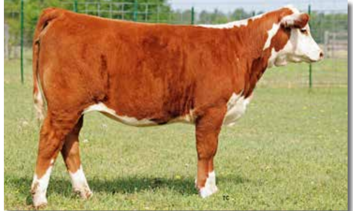
Lot 19A – THM 1077 VICTORIA 6042