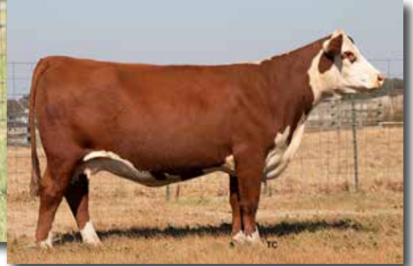
THM 66589 DAHLIA 0237 ET – Dam of Lot 6