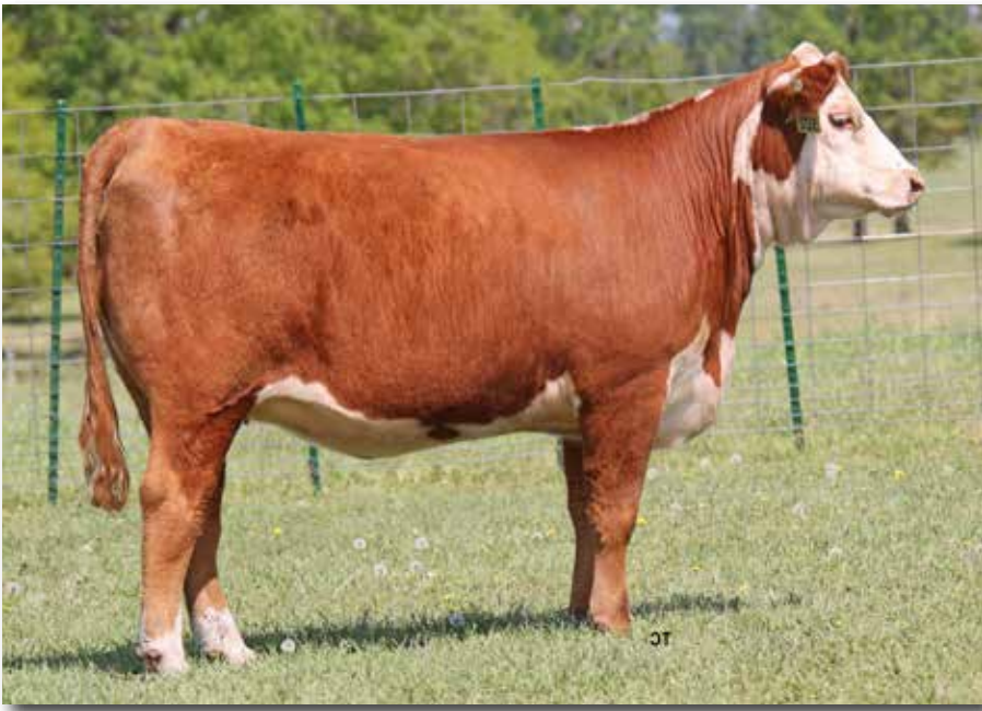
Lot 49 – THM 3016 EXPRESSION 5172