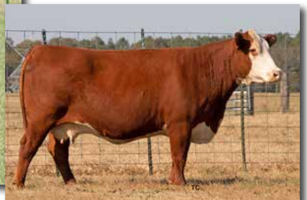
THM 6104 BOLD BEAUTY 8170 ET – Dam of Lot 3