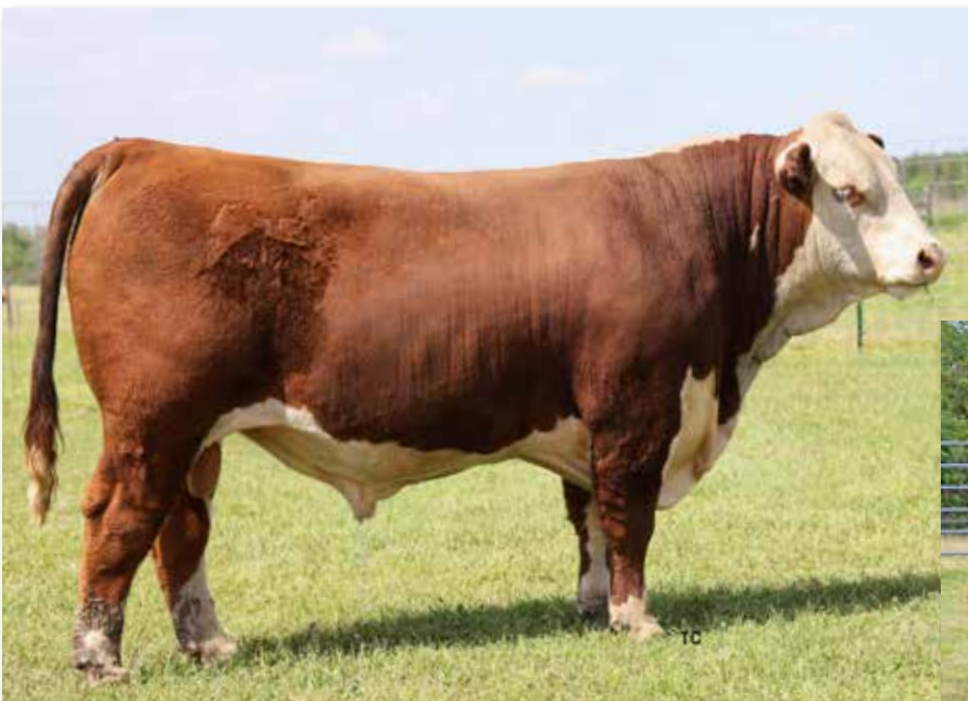
Lot 5 – THM THORNTON 5009 ET