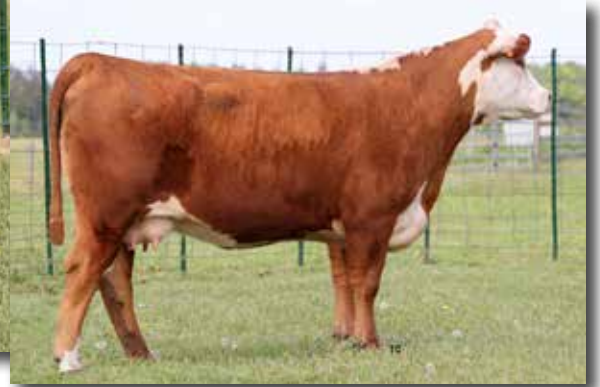
Lot 43 – THM 0176 LIL 3181 – Dam of Lot 51