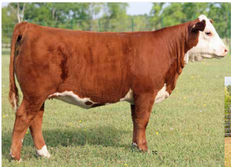
Lot 11 – THM ANNIE 6006 ET