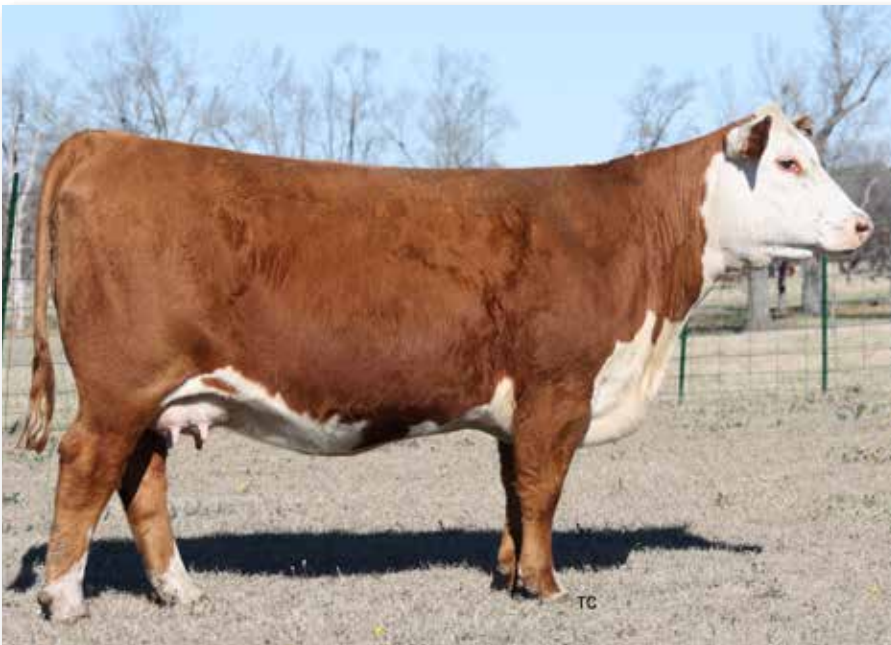
Lot 13 – THM 9108 MAVIS 2110