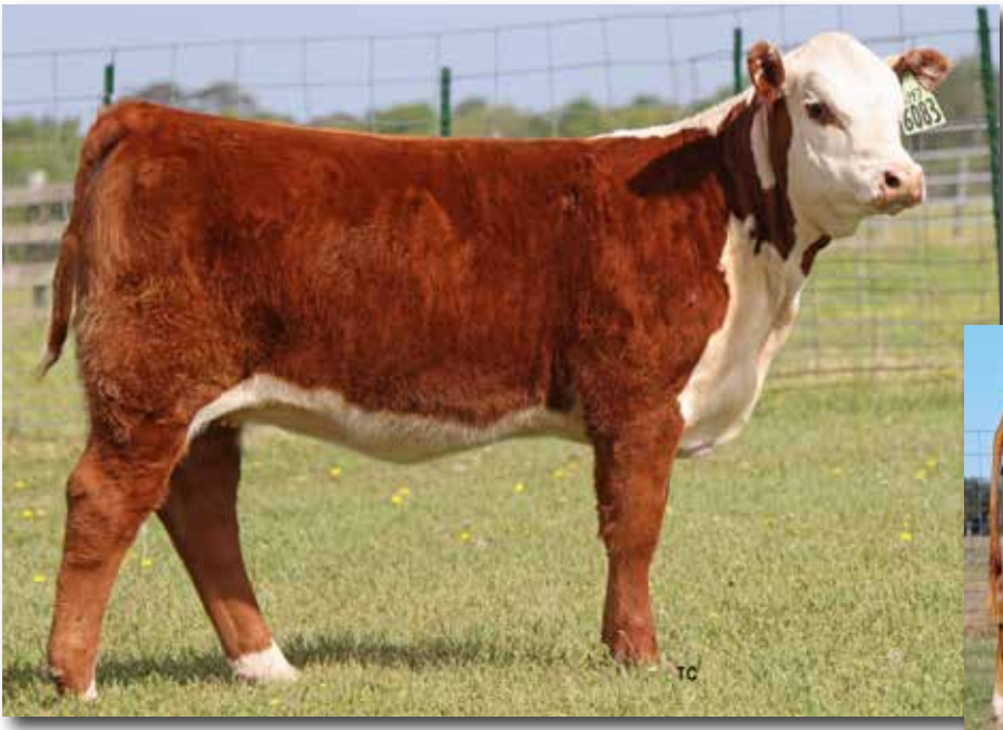
Lot 17A – THM 1077 HANNAH 6083