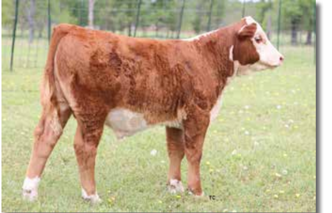
Lot 37A – JLG VICTOR 5963