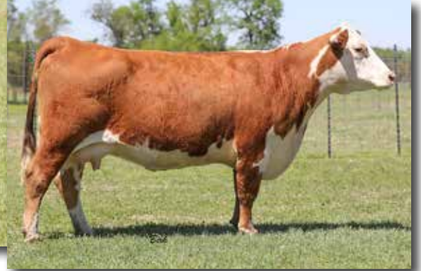
THM Z426 VISTA 6132 – Dam of Lots 4 & 5