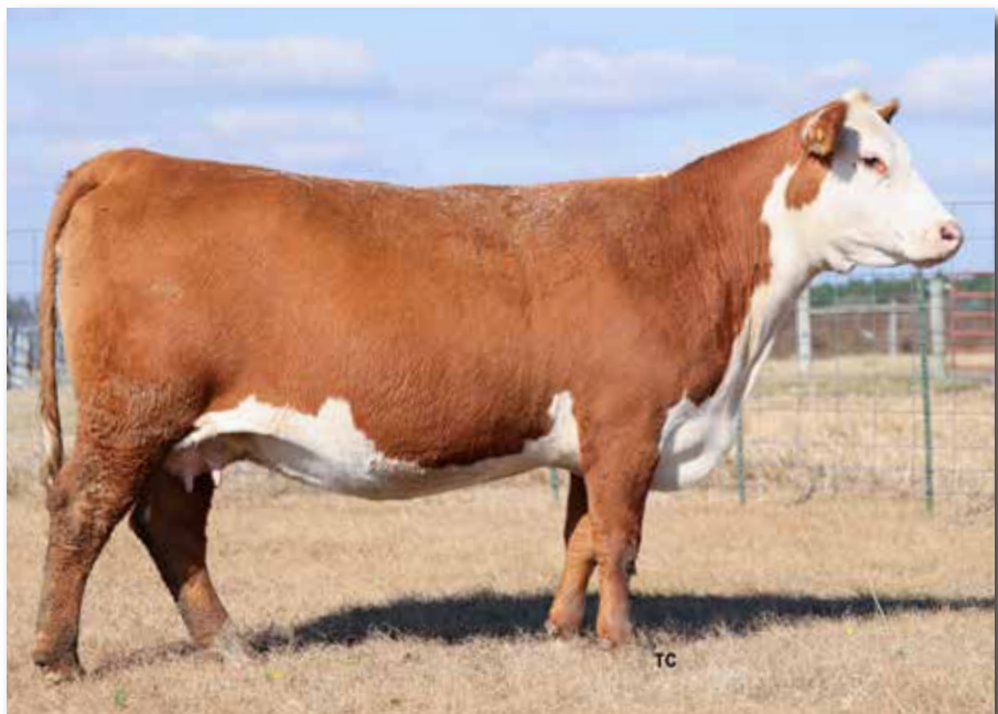
Lot 20 – THM 53D MISS BESS 1104