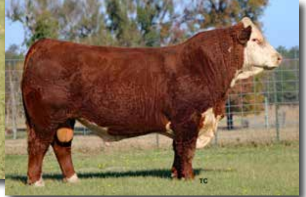
THM BLANTON 1009 ET – Sire of Lot 20A