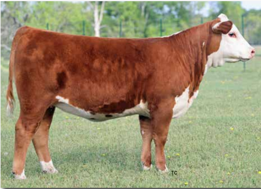
Lot 15A – THM 1077 MISS MADDIE 6035