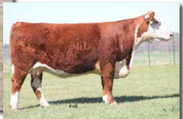
THM 4037 BEKKAS DAISY 1069 ET – Grandam of Lot 21