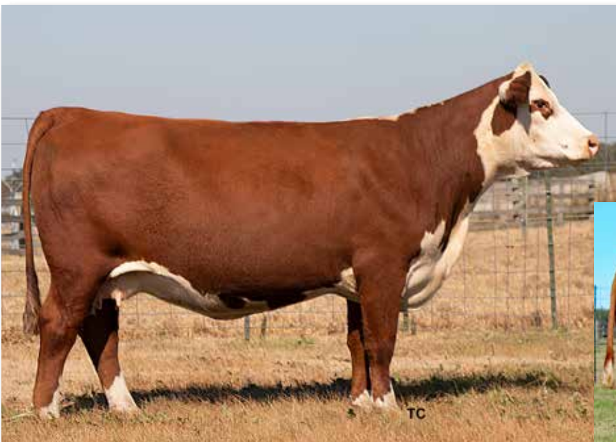
Lot 23 – THM 66589 DAHLIA 0237 ET