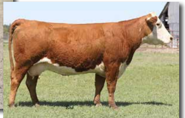
RHF 10Y TANKTOWN 5036C ET – Dam of Lot 38