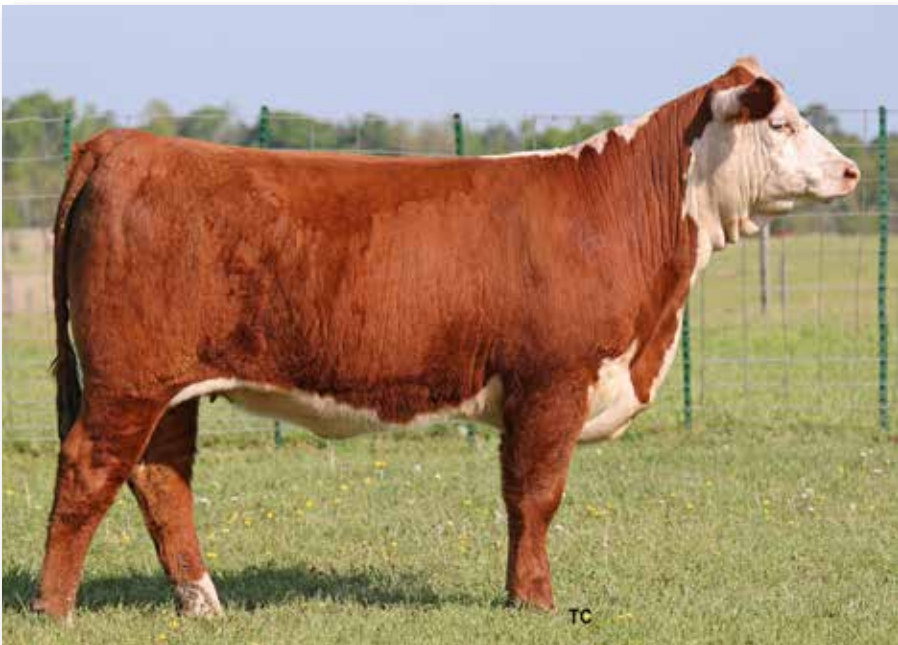
Lot 54 – THM 2186 VICTORIA 5184