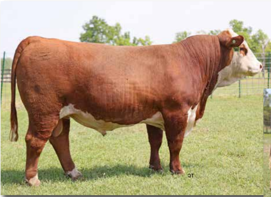
Lot 4 – THM BOND 5007 ET