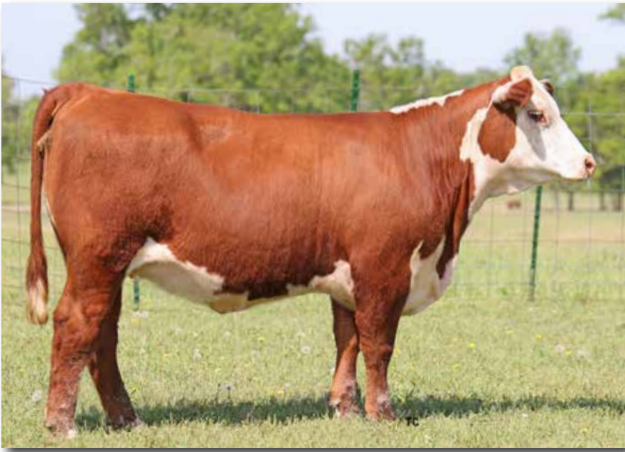
Lot 60 – THM 2186 ROSEMARY 5232