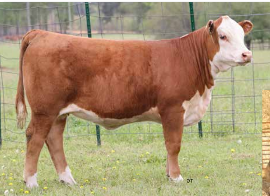
Lot 9 – THM RED ROSE 6020 ET