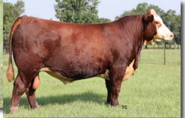
THM EMINENT 3211 ET – Sire of Lots 21A & 22A