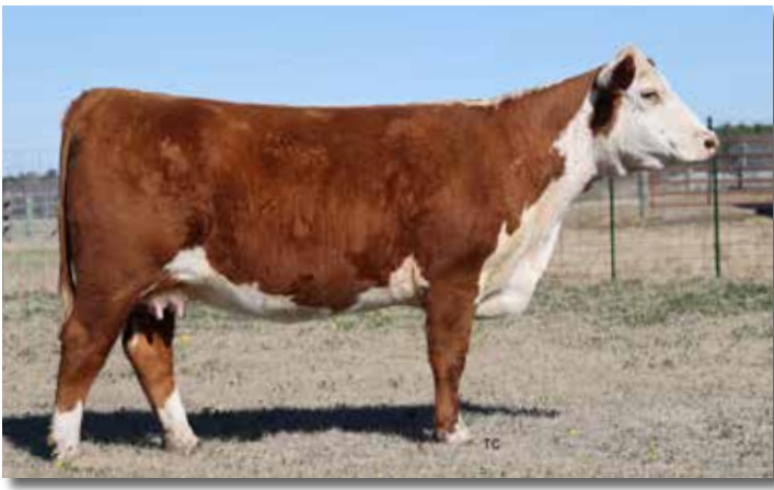
Lot 18 – THM 53D MAYBELL 0084 ET