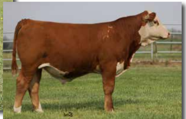
MOHICAN THM YELLOWSTONE 43J – Sire of Lot 56