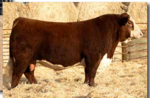
ASM 405B RED MAN 325L ET – Featured A.I. Service Sire