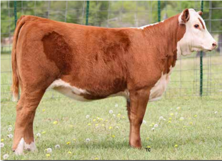
Lot 13A – THM 1077 MAVIS 6108