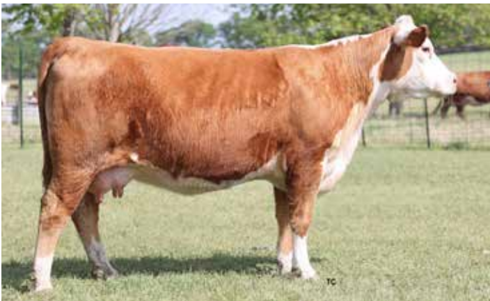
Lot 41 – THM 79G CARMELLA 3176

39 THM 199B ROSEMARY 2014 ET {DLF,HYF,IEF,MSUDF,MDF,DBF} COW • P44332798 • DOB: 9/2/21 • TATTOO: RE THM/RE 2014