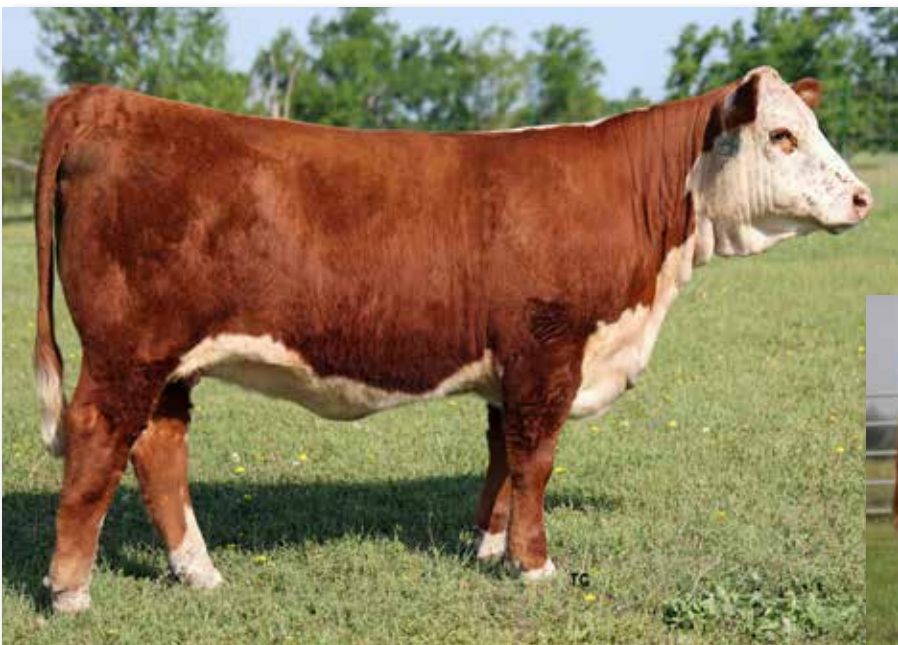
Lot 56 – THM 43J ROSEMARY 5225