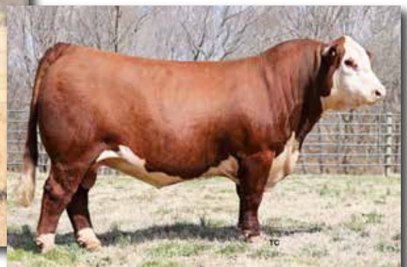
WF CLC JT Wildcard 76E 2505 ET – Featured A.I. Sire