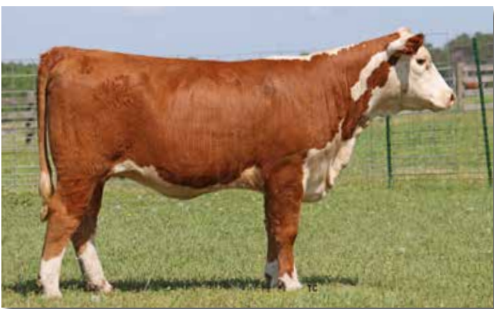
Lot 59 – THM J28 CHERISH 5170

59 THM J28 CHERISH 5170 {DLF,HYF,IEF,MSUDF,MDF,DBF} COW • P44686099 • DOB: 11/26/24 • TATTOO: RE THM/LE 5170 WHITEHAWK R GOVERNOR 413H (CHB)(DLF,HYF,IEF,MSUDF,MDF) WHITEHAWK NATURAL 290E (CHB)(DLF,HYF,IEF,MSUDF) 111F GOVERNOR K6 ET (DLF,HYF,IEF,MSUDF) WHR 5344C 4015 BEEFMAID 610FET (DLF,HYF,IEF,MSUDF,MDF) P44439543 KCF MISS CUD4 E368 (DLF,HYF,IEF) BEHM 100W CUD4 504C (SOD)(CHB)(DLF,HYF,IEF,MSUDF,MDF,DBF) KCF MISS ENCORE C559 (DLF,HYF,IEF,MSUDF) THM TRUST WORTHY 0673 6144 (DLF,HYF,IEF,MSUDF) NJW 73S M326 TRUST 100W ET (SOD)(CHB)(DLF,HYF,IEF,MSUDF,MDF,DBF) THM 6144 CHERISH 2242 THM KUDZU CHLOE 0673 ET (DLF,HYF,IEF,MSUDF) P44491865 THM 28M CHERISH 3108 ET (DLF,HYF,IEF,MSUDF) GOLDEN-OAK 4J MAXIMUM 28M (SOD)(DLF,HYF,IEF) TRM NT J6 CHLOE L176 4263 (HYPP)