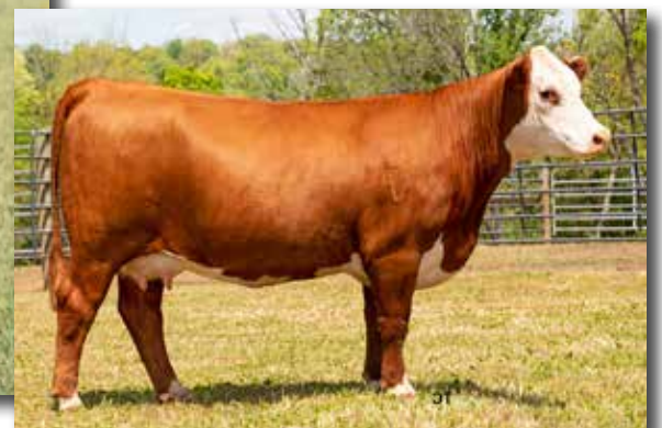
CHURCHILL LADY 2207K ET – Dam of Lot 11