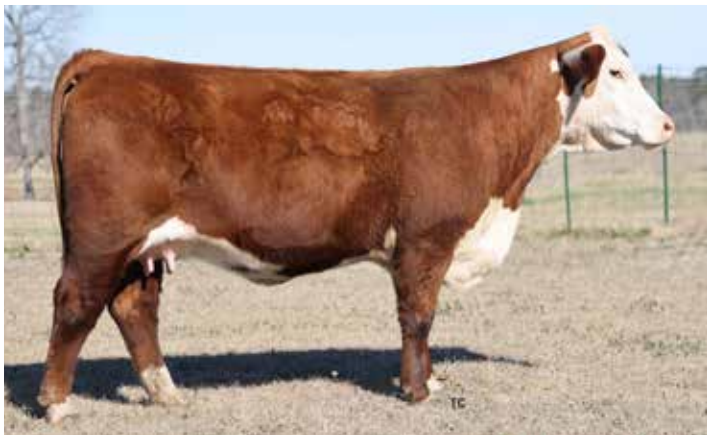
Lot 46 – THM 318G ROSEMARY 3030 ET

44 THM 3018 DAHLIA 2124 ET {DLF,HYF,IEF,MSUDF,MDF,DBF} COW • P44428408 • DOB: 11/15/21 • TATTOO: RE THM/LE 2124