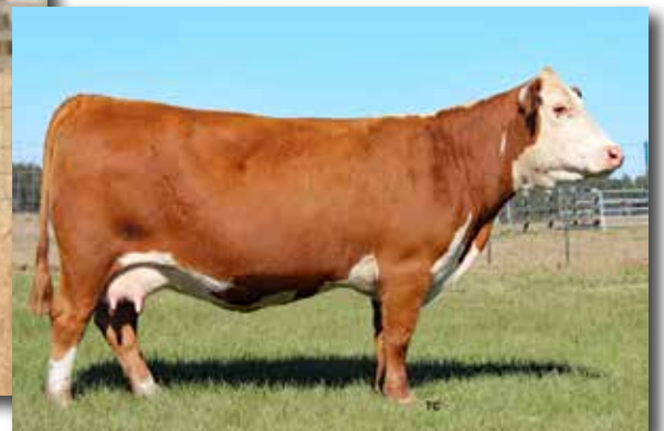
TRM HANNAH 5183 – Grandam of Lot 17