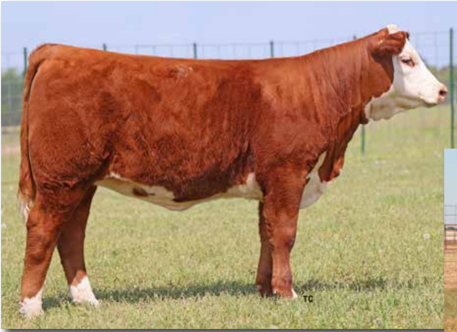
Lot 24A – THM 2018 MISS BEAUTY 6050