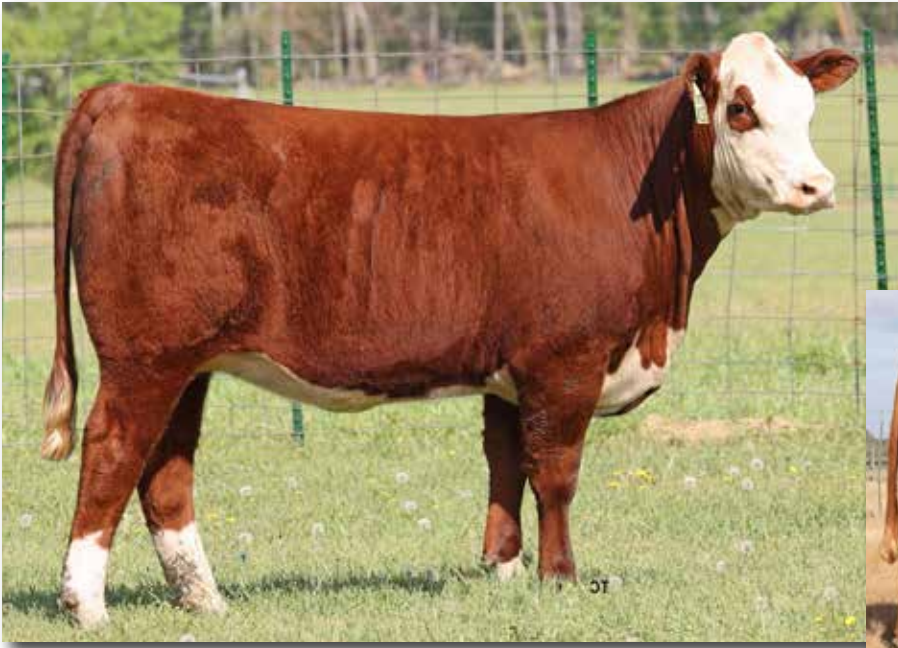
Lot 55 – THM 1077 MS BEAUTY 5224