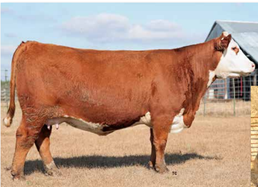
Lot 15 – 4B MS MANDATE J16