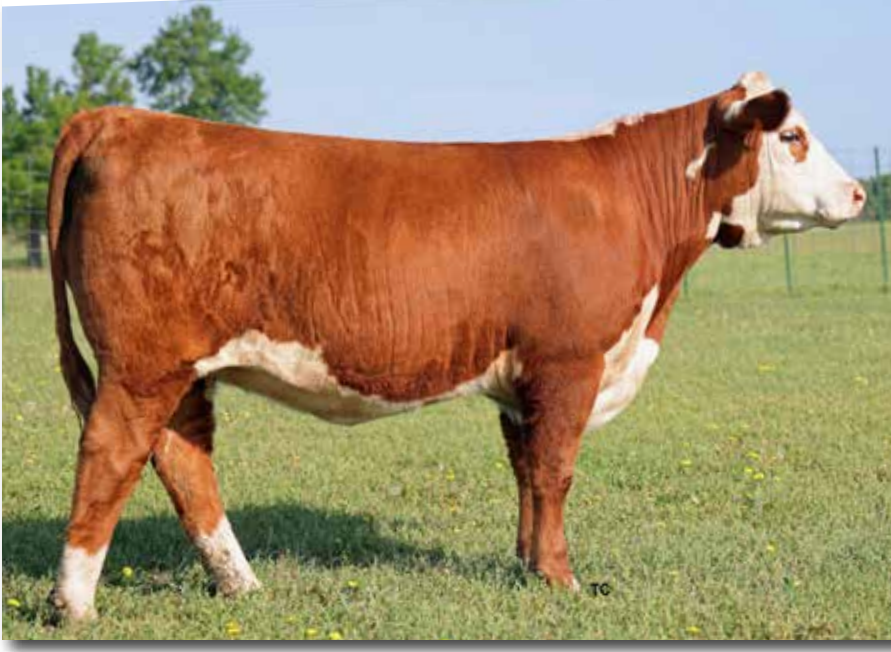
Lot 47 – THM 569G CARMELL 5192