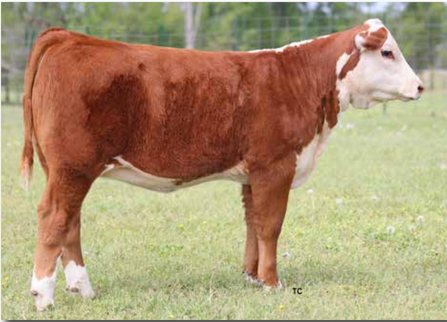
Lot 14A – THM 1077 MISS BEE 6143