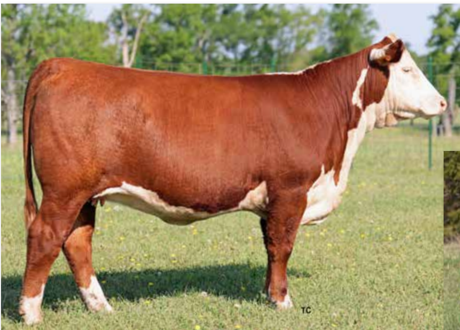
Lot 50 – THM 3016 VICTRA 5181