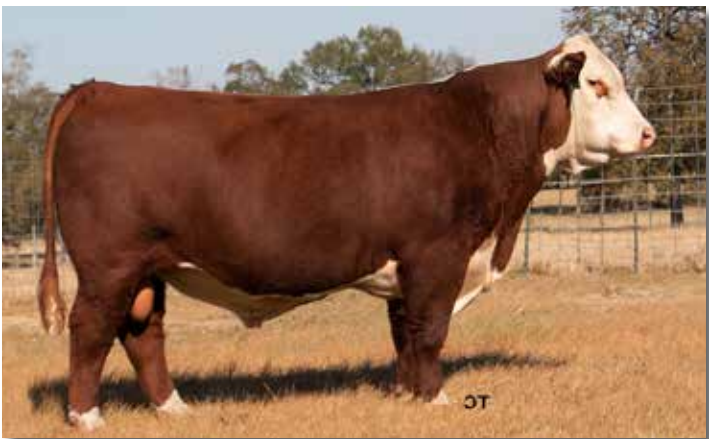
THM CONASAUGA 2059 ET – Sire of Lot 1