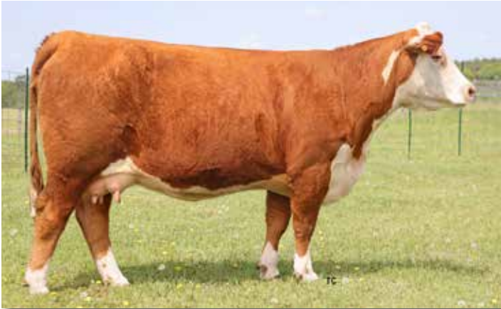
Lot 40 – THM 199B MARCHELLE 2127 ET