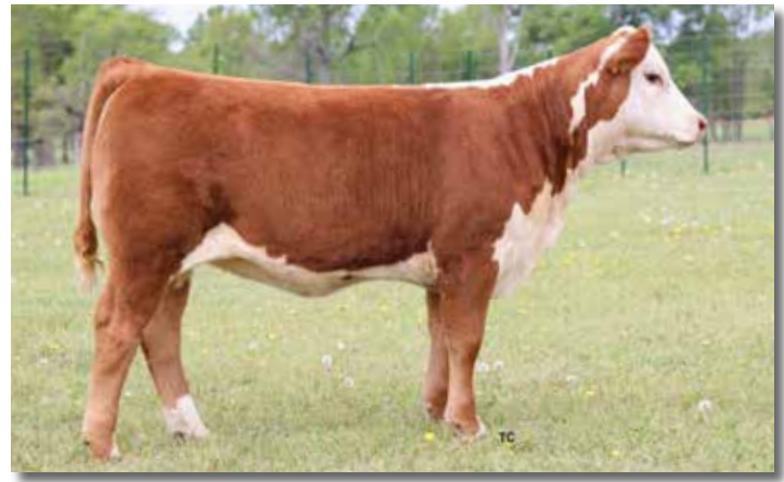
Lot 25A – THM 2018 PRECIOUS 6074

25A THM 2018 PRECIOUS 6074 {DLF,HYF,IEF,MSUDF,MDF,DBF} COW • P44733806 • DOB: 10/12/25 • TATTOO: RE THM/LE 6074