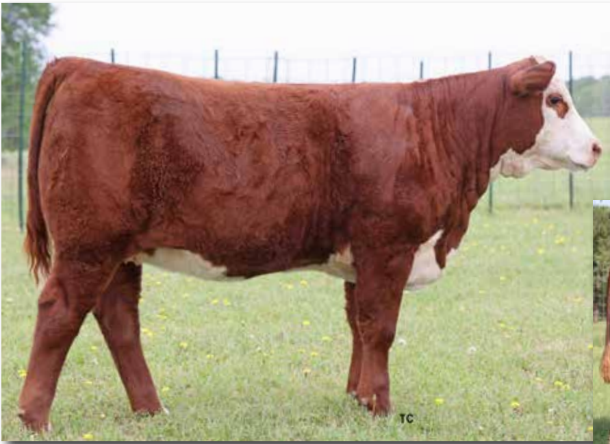
Lot 22A – THM 3211 MAY BELL 6091