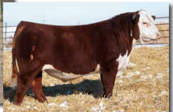
CRR 66589 BALANCE 107 – Featured A.I. Sire