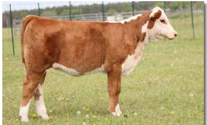
Lot 18A – THM 1077 MAYBELL 6175