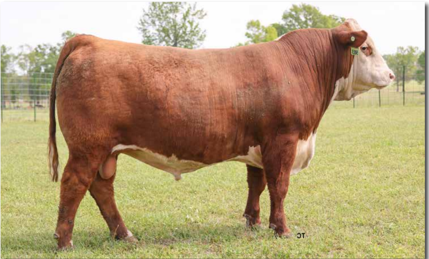
Lot 1 – THM SINCLAIR 5013