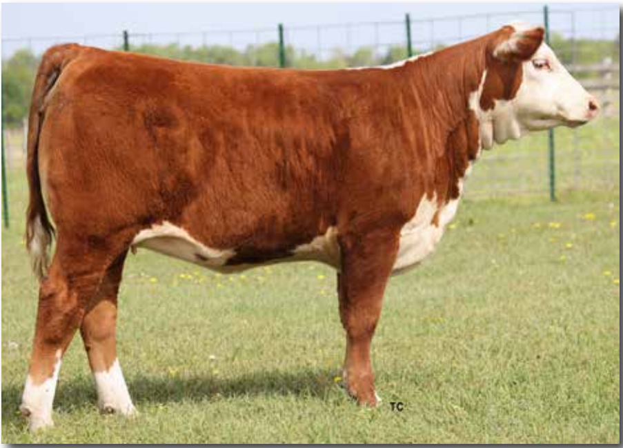
Lot 27A – THM 43J THERESE 6039