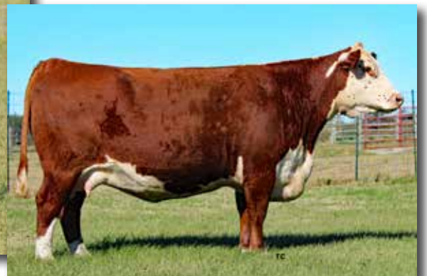
THM 755T DAHLIA 6105 ET – Grandam of Lots 6 & 7