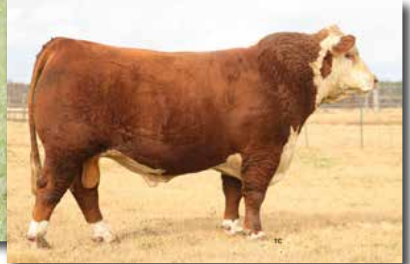
Lot 30A – THM 3016 KATIE 6132