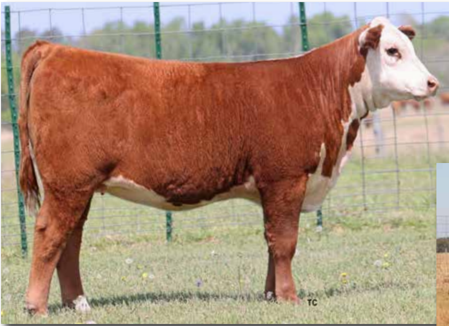
Lot 10 – THM HEY GIRL 6027 ET