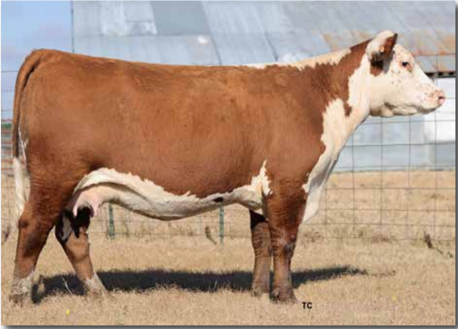
Lot 27 – THM 8122 THERESE 2185