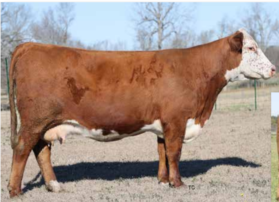
Lot 38 – THM 7014 TANKY II 0204