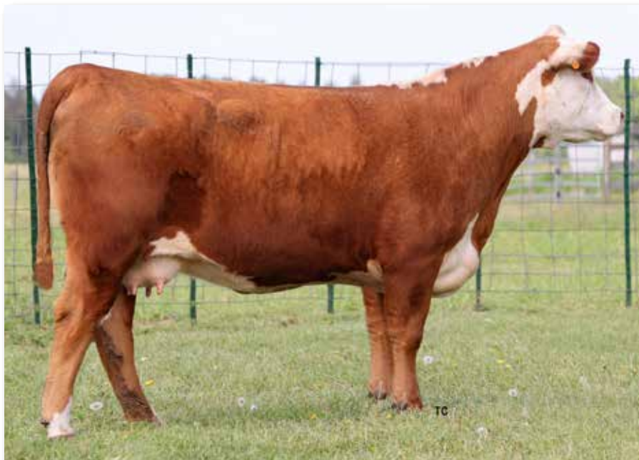
Lot 43 – THM 0176 LIL 3181

43 THM 0176 LIL 3181 {DLF,HYF,IEF,MSUDF,MDF,DBF} COW • P44441338 • DOB: 12/19/22 • TATTOO: RE THM/LE 3181