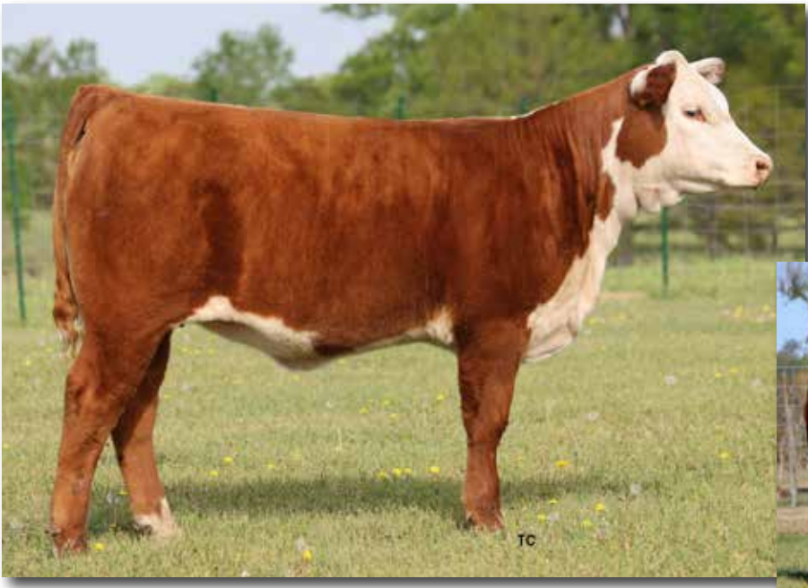
Lot 20A – THM 1009 MISS BESS 6030