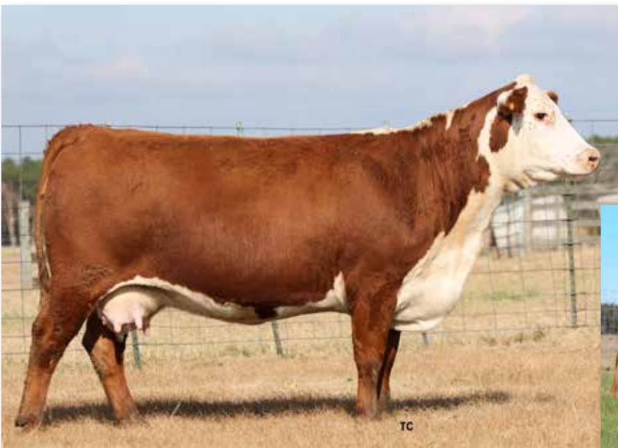
Lot 17 – THM 9108 HANNAH MAY 2147