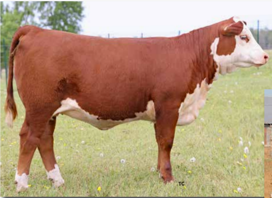
Lot 8 – THM MS RED ROMMARY 6008 ET