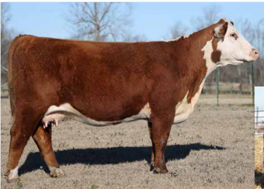
Lot 14 – THM 6081 MS ZEE 1138