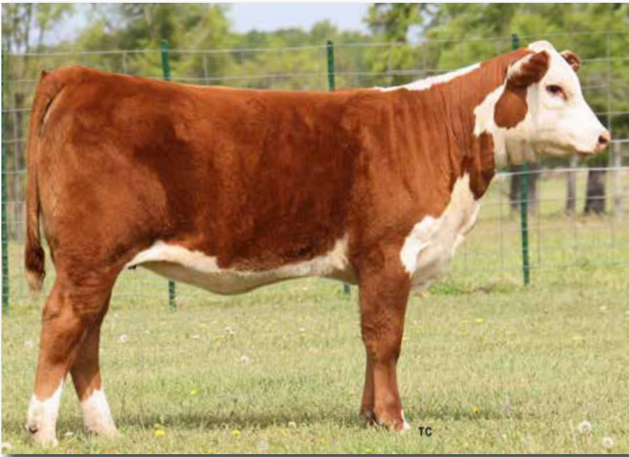
Lot 16A – THM 1077 EVENYLN 6099