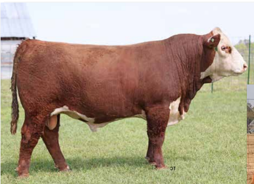
Lot 3 – THM BOLD PRINT 5205 ET