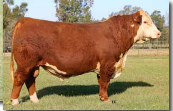
THM PATRON 1077 ET – Sire of Lots 12A-19A