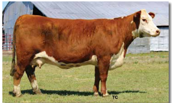
THM 28M VICTORIA 2132 ET – Paternal Grandam of Lot 1