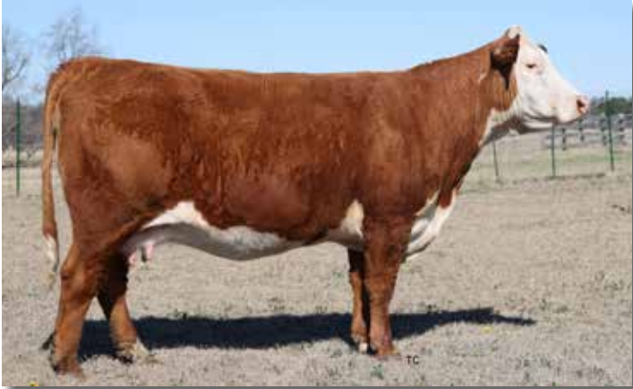
Lot 26 – THM 81E LADY TANK 1164 ET

26 THM 81E LADY TANK 1164 ET {DLF,HYF,IEF,MSUDF} COW • P44236138 • DOB: 11/14/20 • TATTOO: RE THM/LE 1164