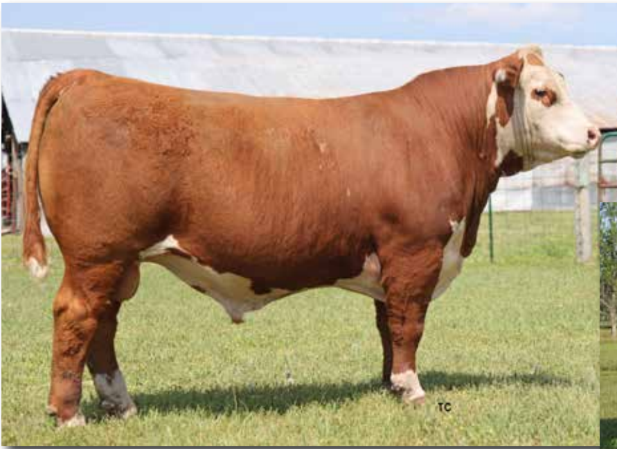
Lot 2 – THM MCCALL 5150 ET