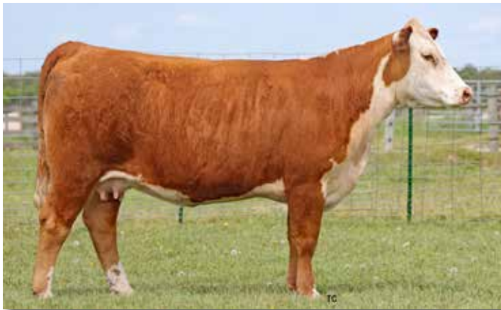
Lot 45 – THM 2059 VICTRA 5823