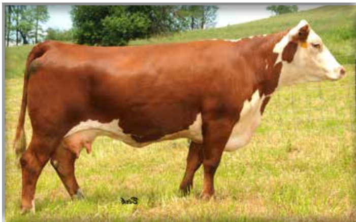
Glenview 5052 Victoria W90 ET – Paternal Grandam of Lots 69-70