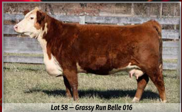
Lot 58 — Grassy Run Belle 016