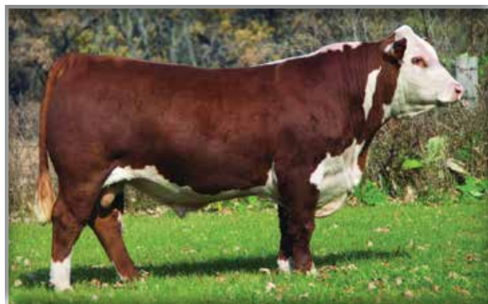
Boyd Ft Knox 17Y XZ5 4040 – Grand sire of Lot 66 & 67