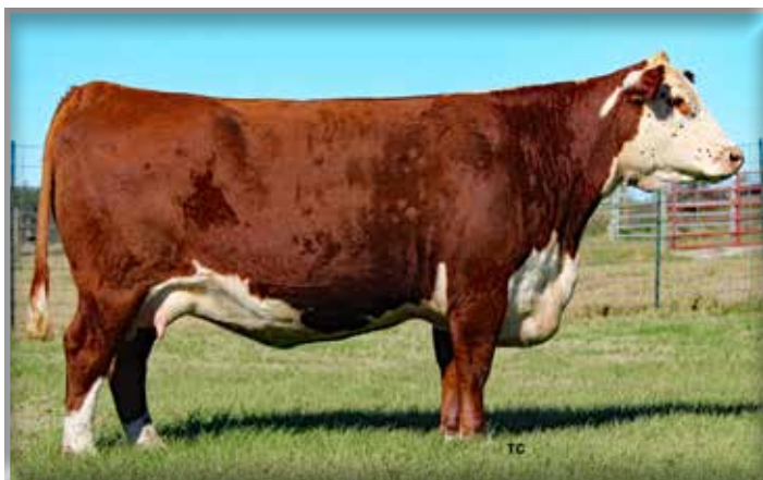
THM 755T Dahlia 6105 ET