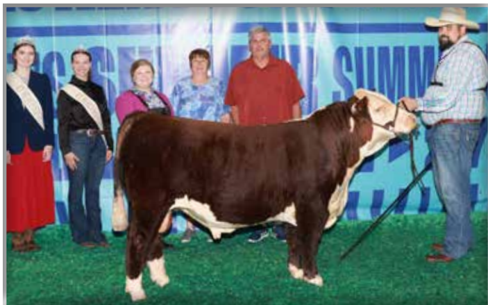
K3 36E G138 Deputy 240 – Featured Service Sire