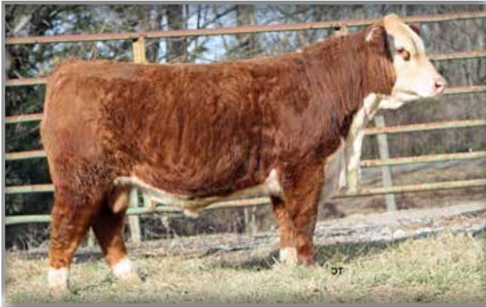
Lot 46 — K3 9140 Maverick 352