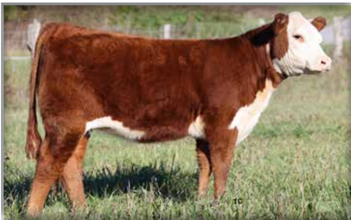
Lot 20 — CHF Steady 156J 08M