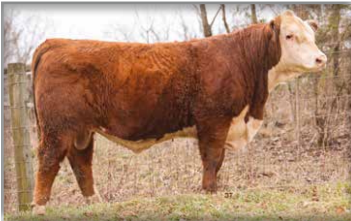
Lot 47 — K3 9140 025 Mr Heart 346