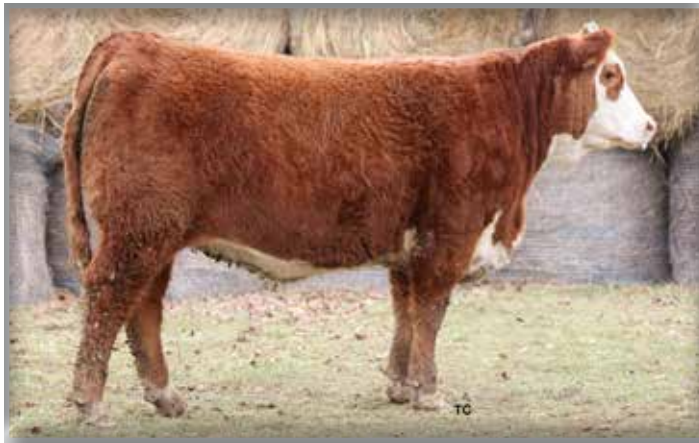
Lot 11 – CHF Doris 144F 73L