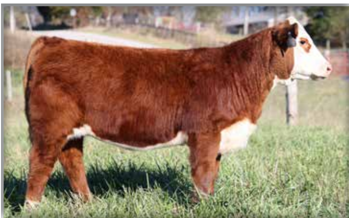
Lot 21 — CHF Clara 210 45M