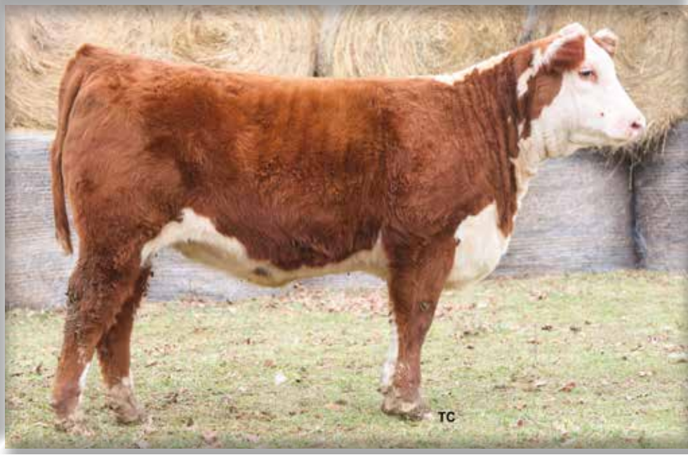
Lot 33 — K3 9140 830 Elizabeth 405