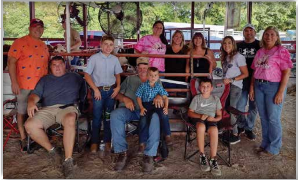
The Weinel Family