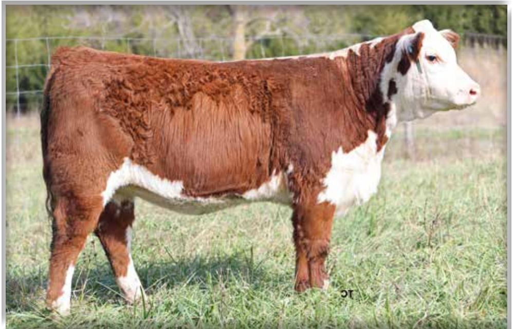
Lot 36 — K3 9140 952 Katy Did 425