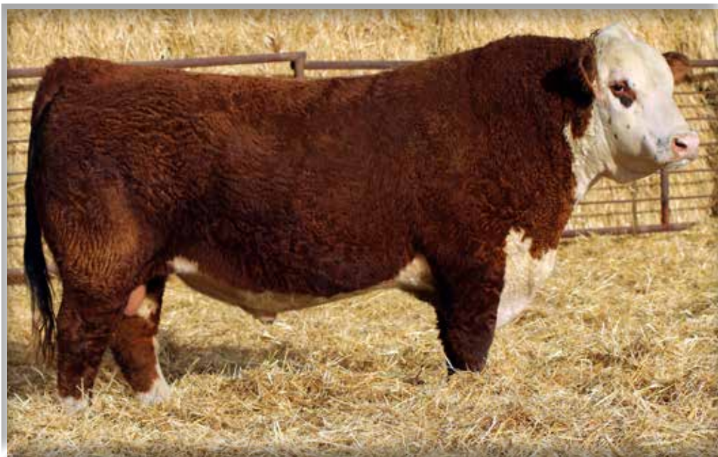
"216j" Popular AI Sire