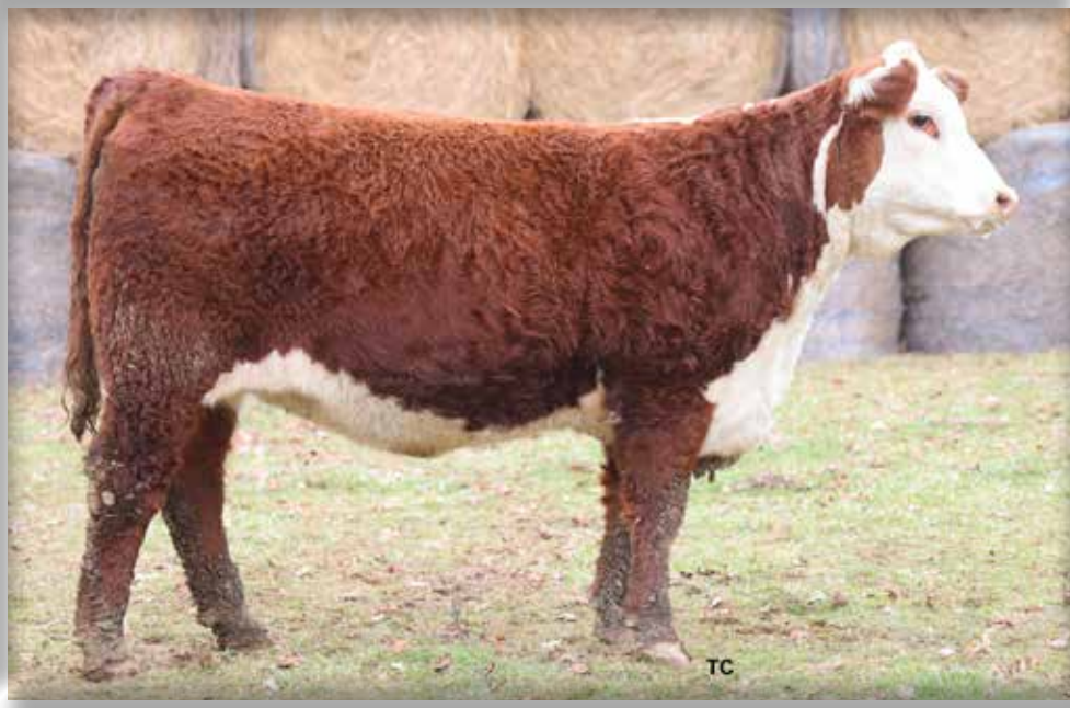
Lot 7 – CHF WH Lyla 4G 109L