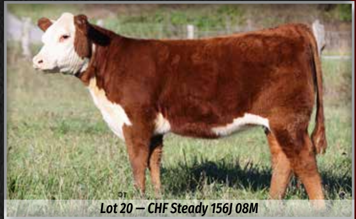
Lot 20 — CHF Steady 156J 08M