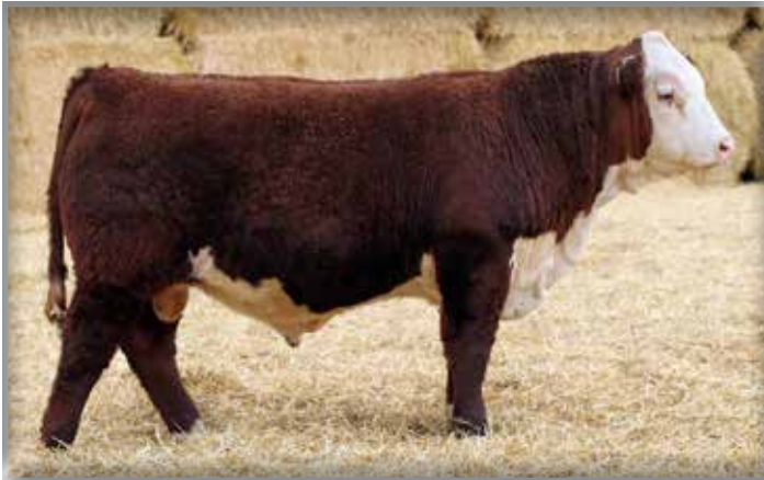
NJW 129E 173D Endure 92H ET – Sire of Lots 62, 64 & 65