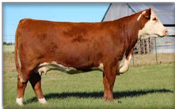
THM TL'S 6005 Maricey 8123 – Dam of Lot 71