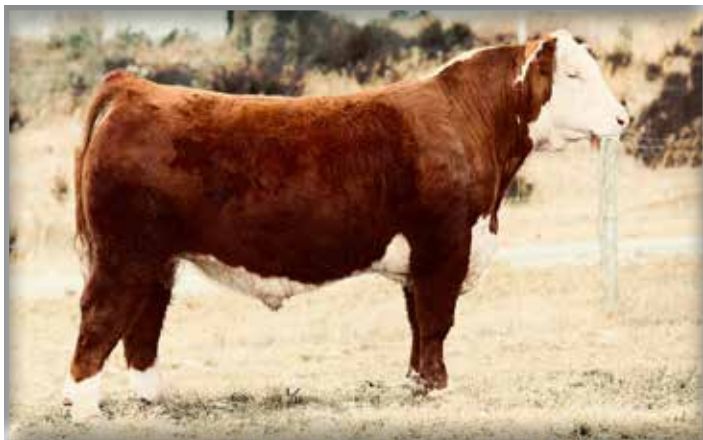
K3 WC 13 Dream On 628 – Sire of Lot 42