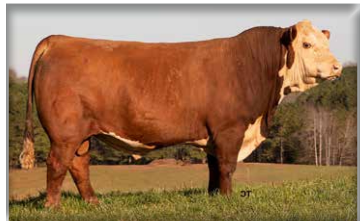
KCF Bennett Monument J338 – Sire of Lot 62A