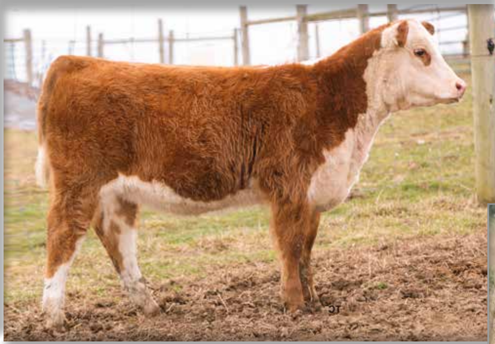
Lot 90A — NJB TDP 132E 217H Dolly 407