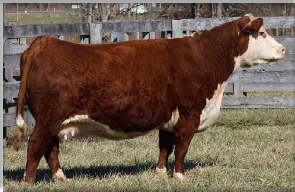
Lot 55 – Grassy Run Rachael 013