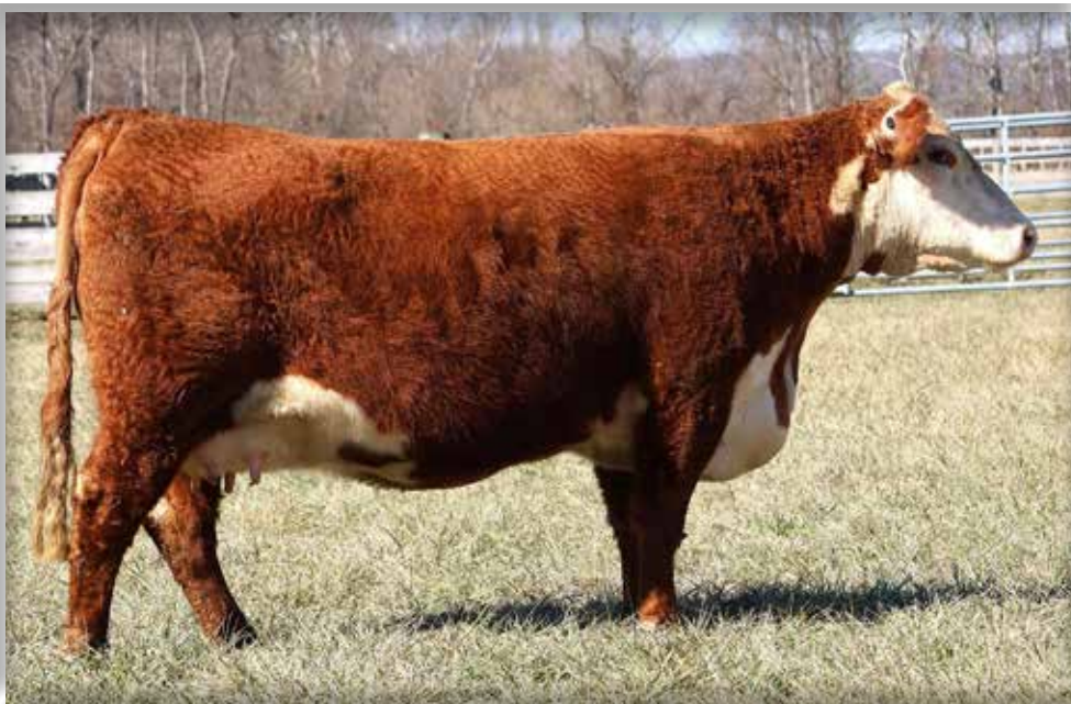
Lot 57 — Grassy Run Queen Ten 112