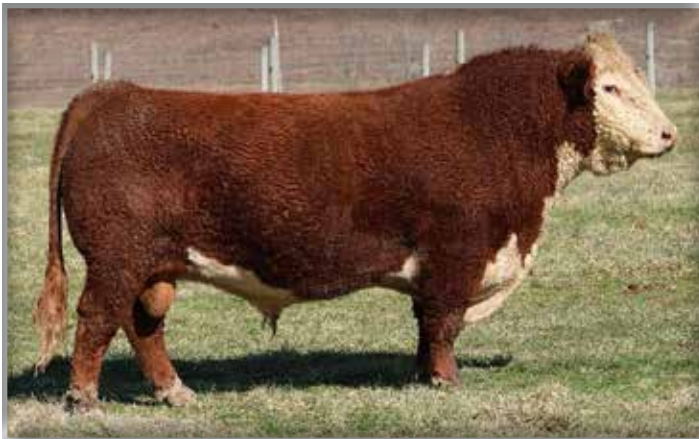
Grassy Run Long Range 009 — Sire of Lots 55A, 56A & 57A