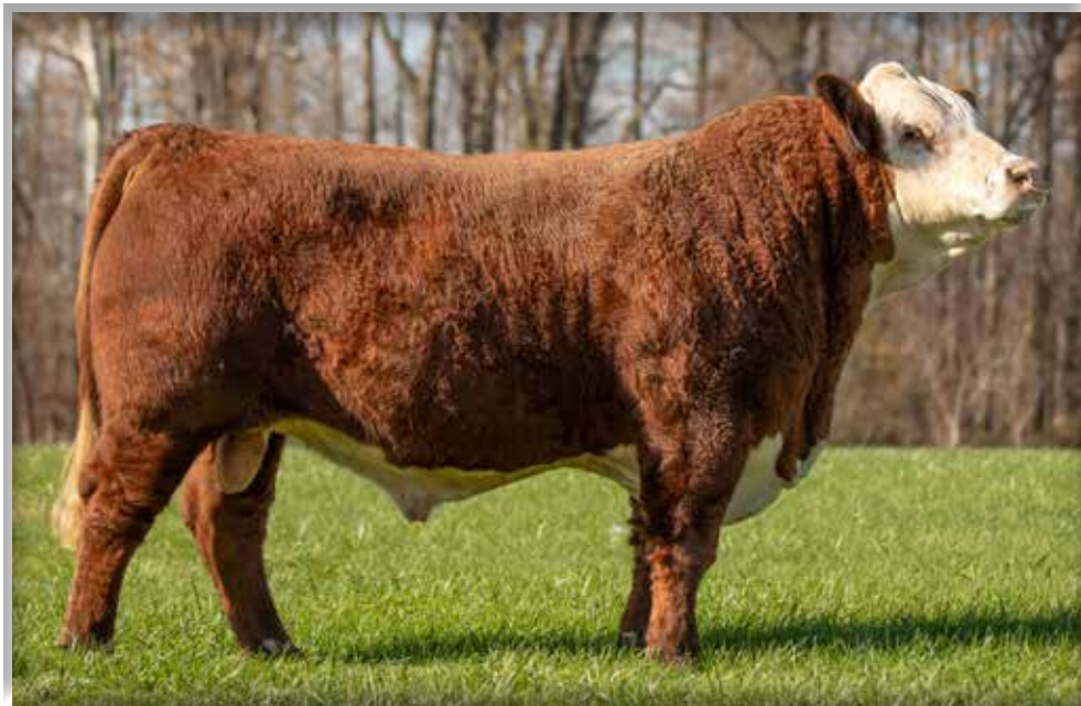
Ryan's 179 882 Nation R119