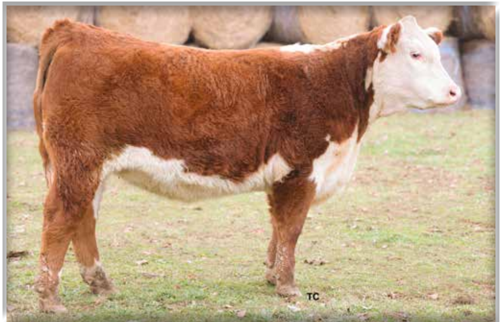
Lot 34 — K3 9140 301C Langley 411