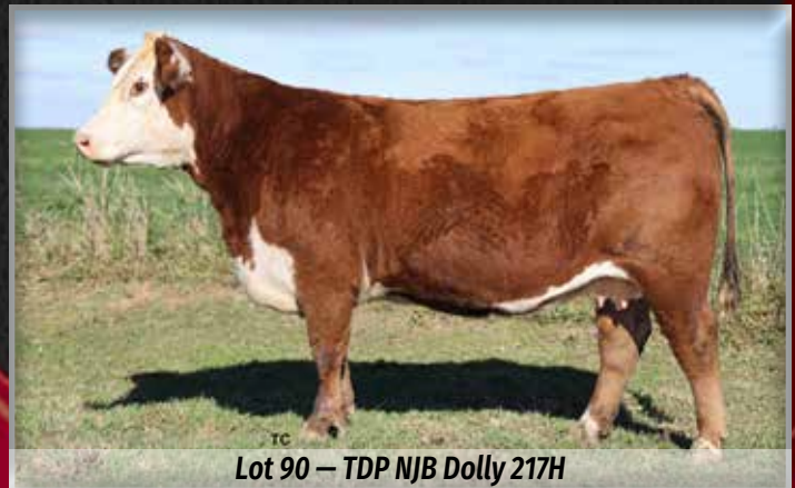
Lot 90 — TDP NJB Dolly 217H

Gordon Cattle Co. .... Danville, KY Grassy Run Farms ..... Winfield, WV K3 Cattle ..... Cynthiana, KY NJB Limited ..... Mays Lick, KY Underwood Farms ..... Campbellsville, KY Weinel Farm ..... Alexandria, KY Wells Farm ..... Corbin, KY