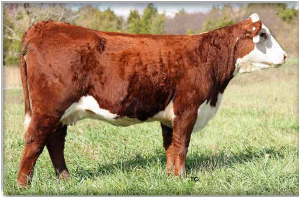
Lot 18 – CHF Robbi 144F 82K