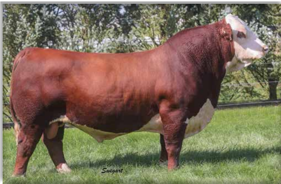
Boyd 76E Forecast 0050