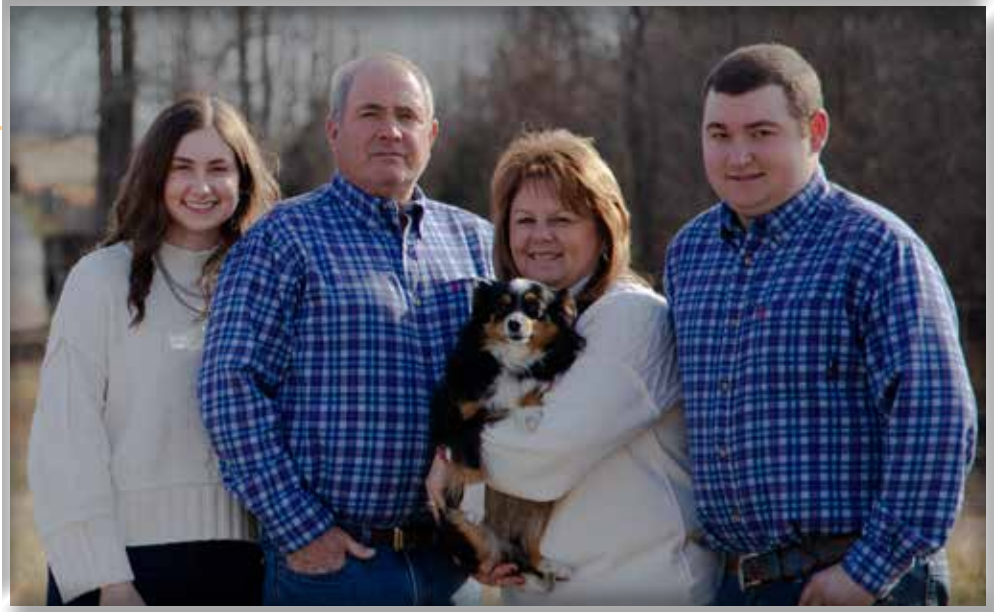
The Underwood Family