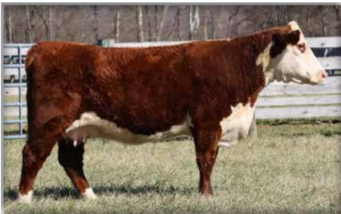
Lot 59 — Grassy Run Tippi 204