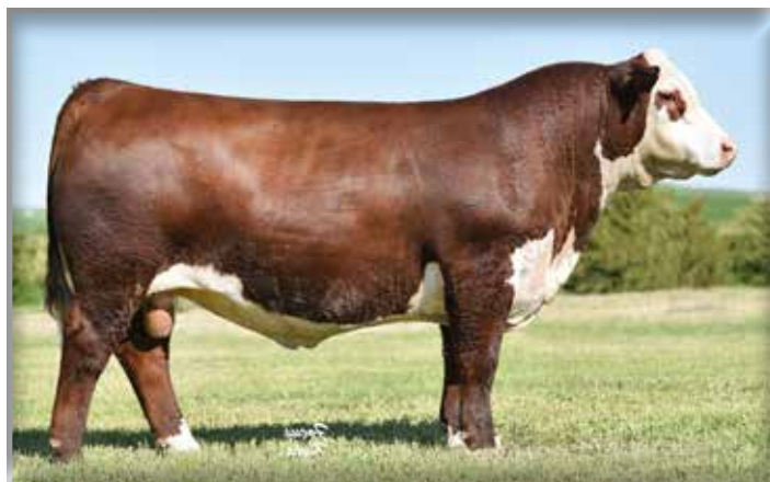
NJW 79Z 2311 Endure 173D ET – Sire of Lot 61