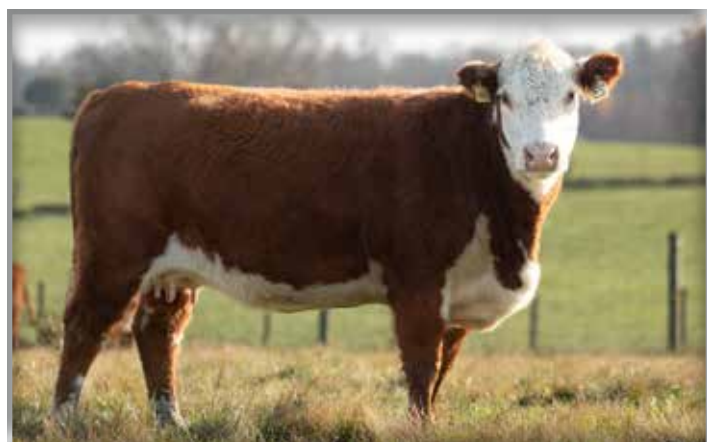
Lot 84 – EPH Mae Lois 172 2101