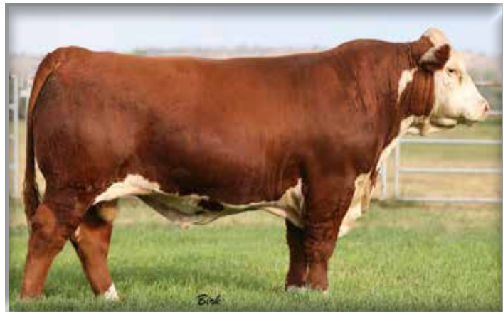
Mohican Playbook 4G – Sire of Lots 7, 8, 9, 19, 23, 26, 27 & 30