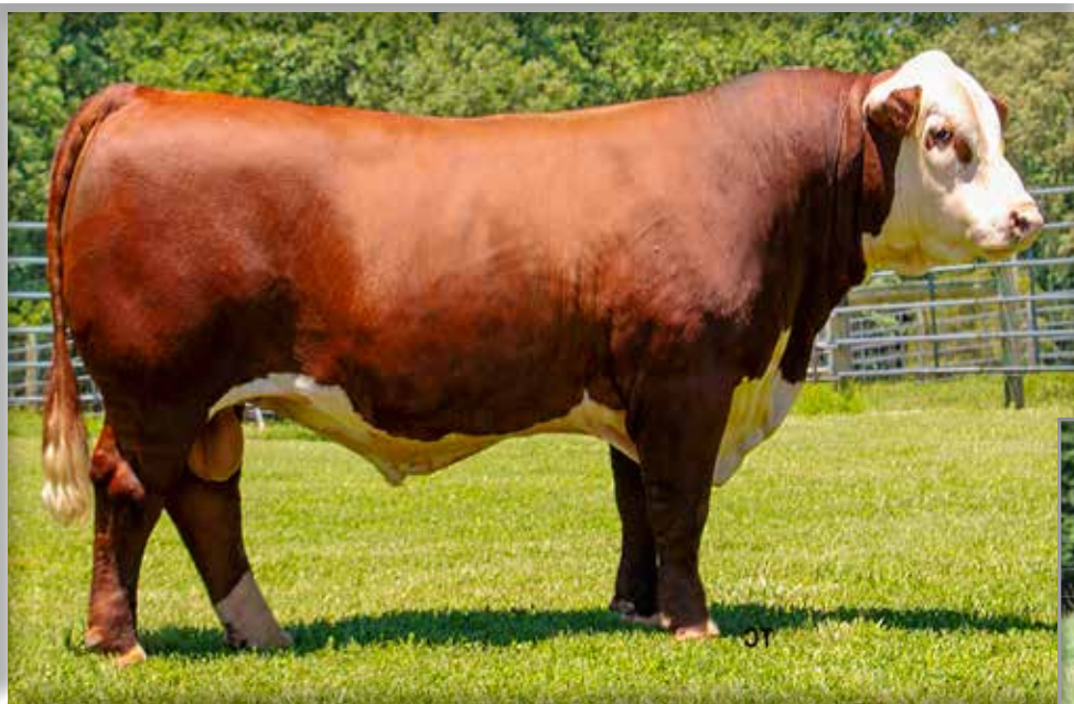
WF CLC JT Wild Card 76E 2505ET