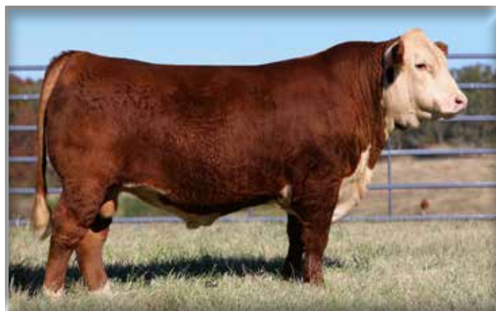
CMF 297 Kernel 827K