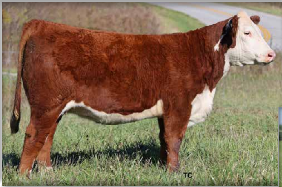
Lot 5 – CHF 15A 9024 08L