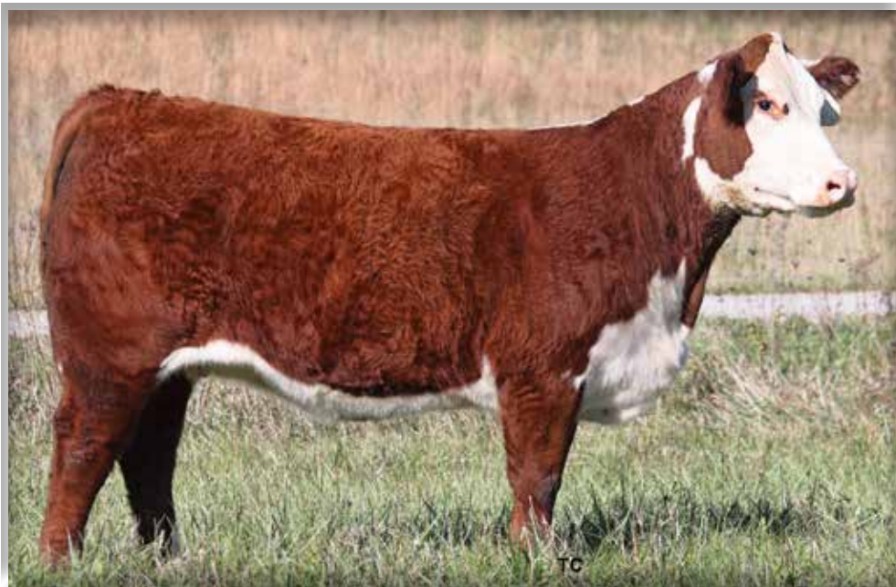
Lot 3 — CHF Dora 0050 17L