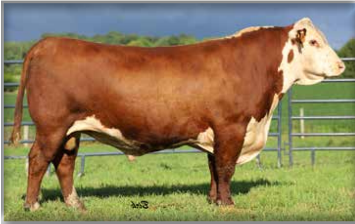
J LCS Z426 Step Ahead F30 ET – Sire of Lots 61A & 63A