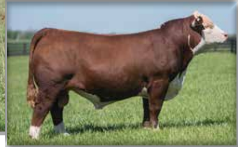
Boyd Power Surge 9024 – Sire of Lots 5 & 6