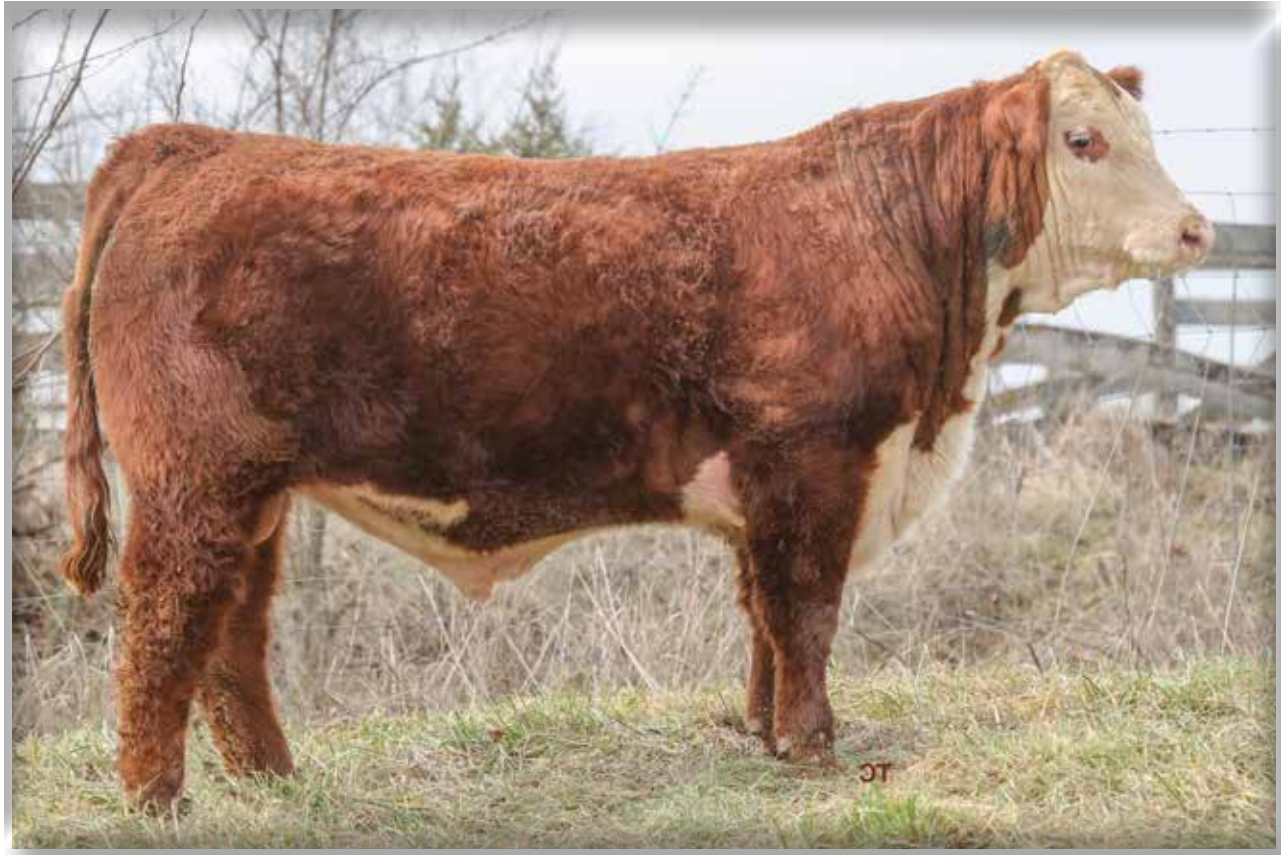
Lot 49 – K3 9140 6028 Oakdale 426