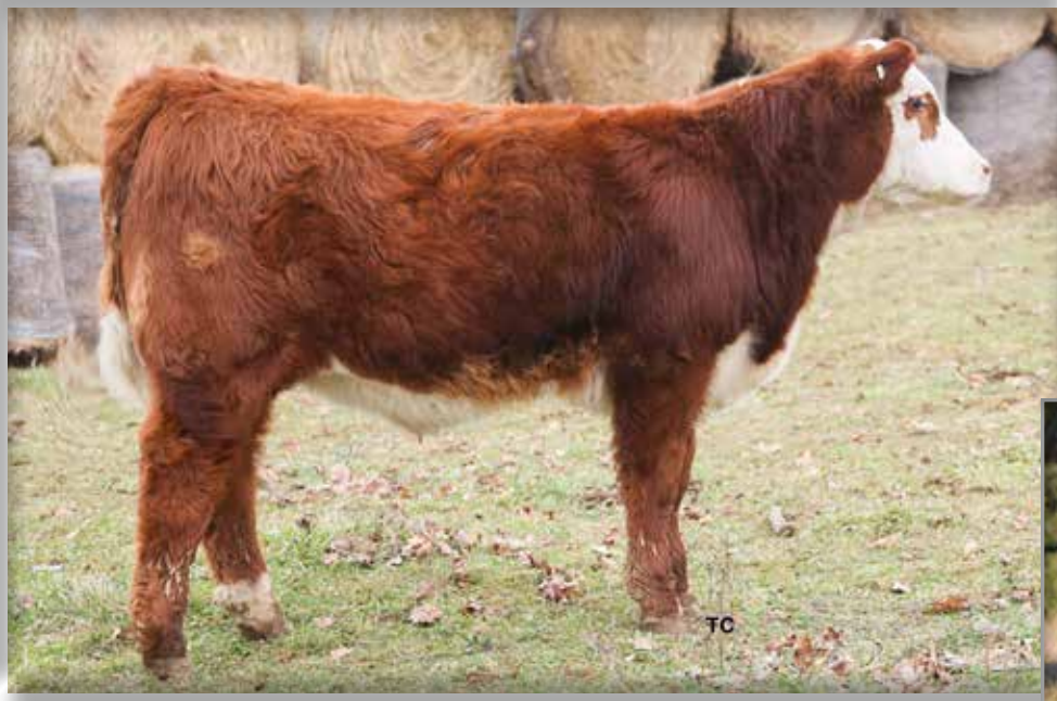
Lot 51A — GCC 2035H McIntock 178J 2419