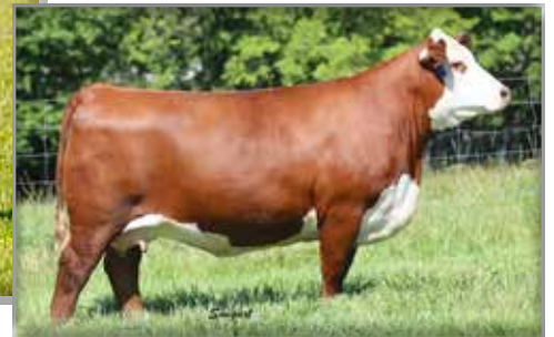
TH 329 358C Lana 76E