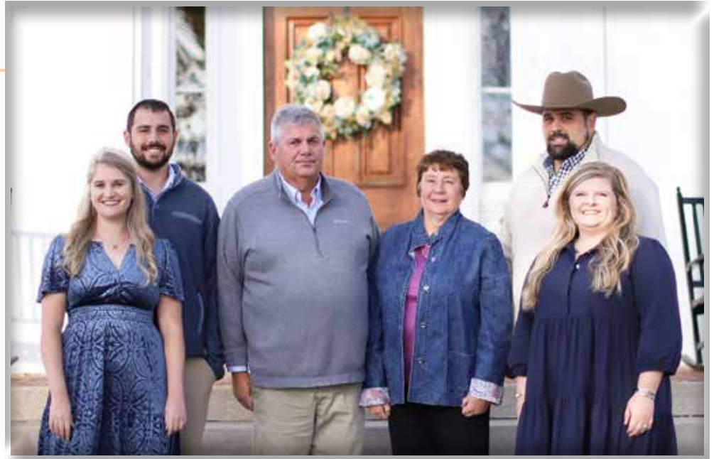
The Bush Family