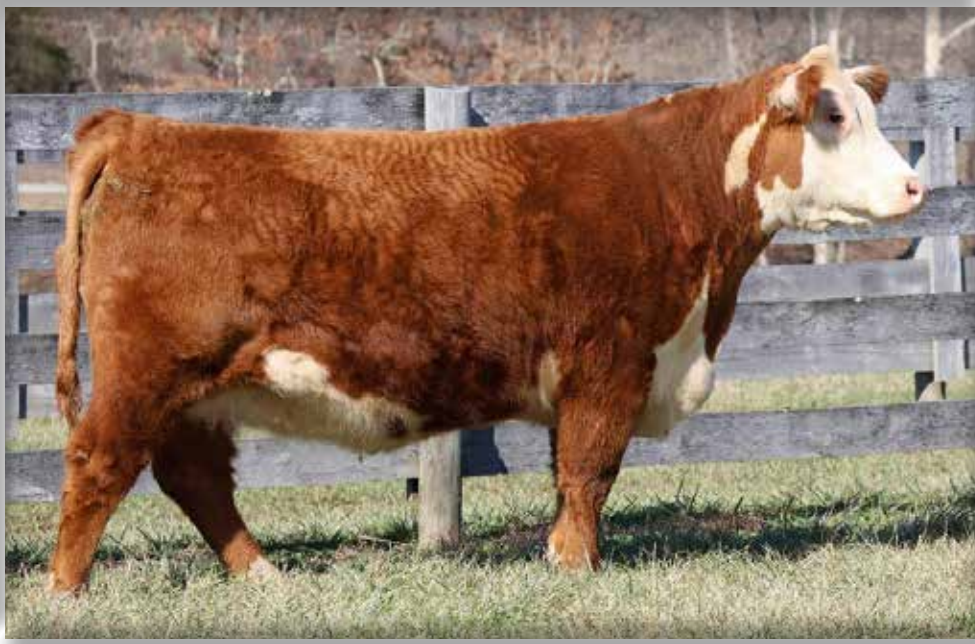
Lot 56 — Grassy Run Anchor 203