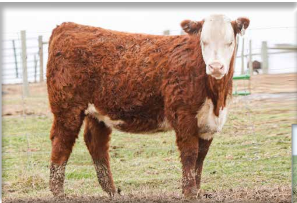
Lot 89 – NJB TDP 132E Dolly 276