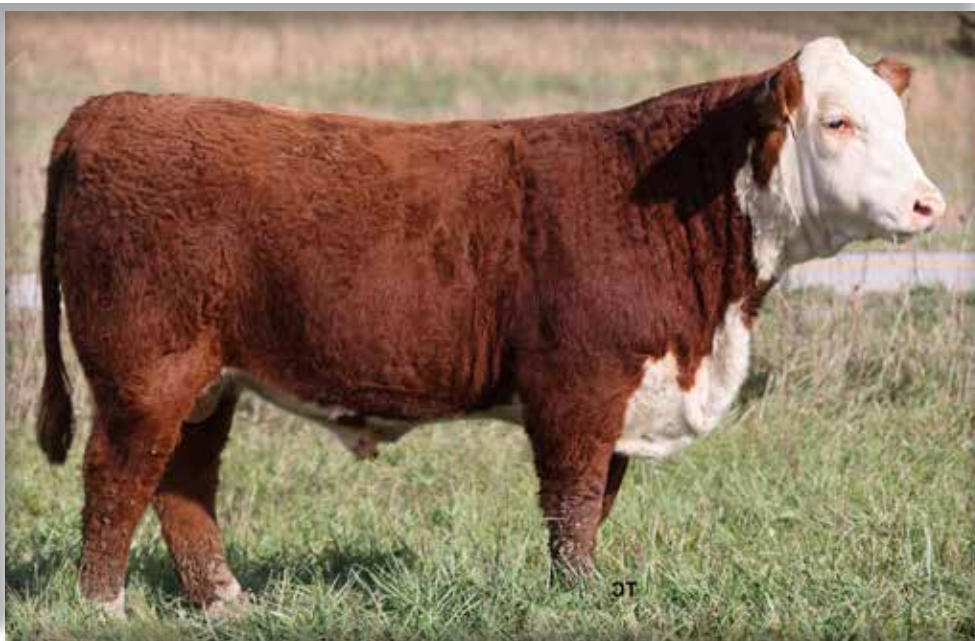
Lot 25 – CHF Harrison 9097 97L