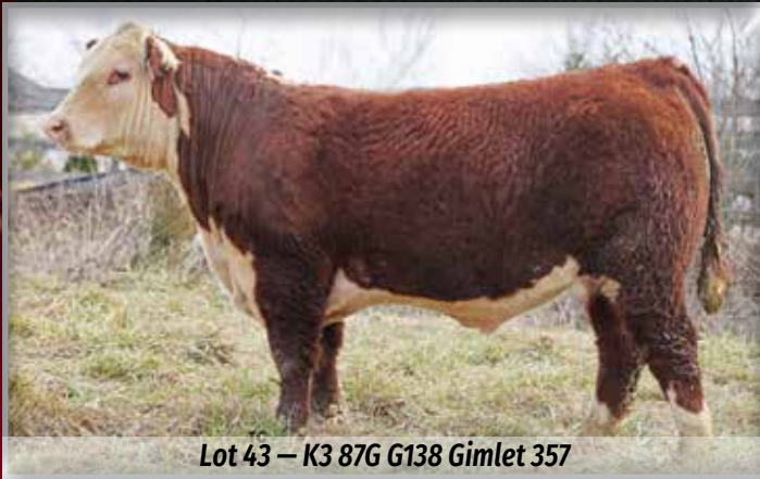
Lot 43 — K3 87G G138 Gimlet 357

Dale Stith 5239 Old Sardis Pike Mays Lick, KY 41055