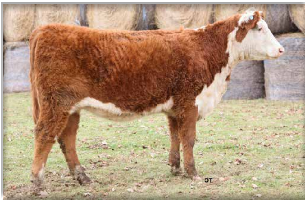
Lot 31 – K3 9140 743 Dragon Queen 343