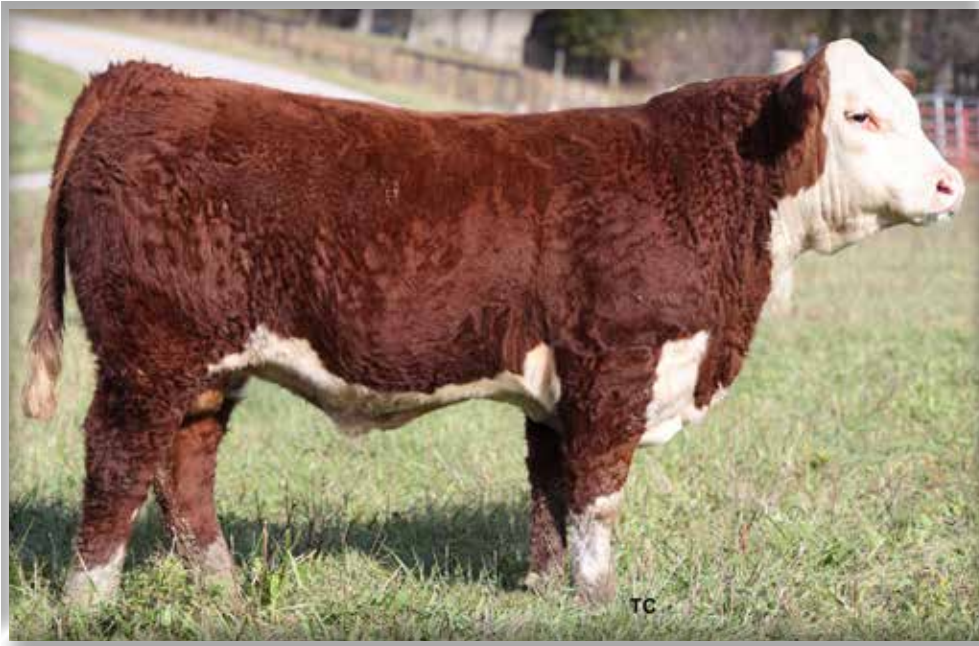
Lot 29 – CHF Ridgeline 254G 01M