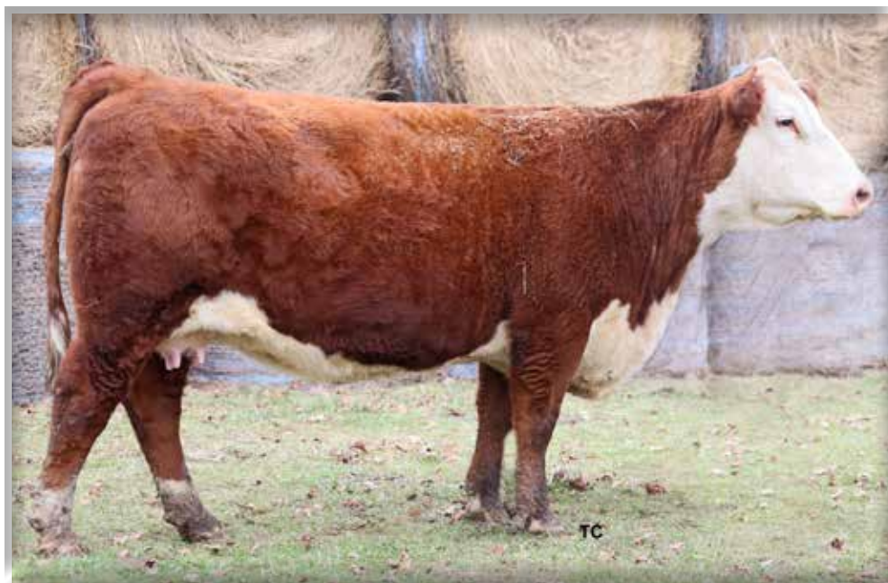
Lot 32 — FPH Ms Homeland G108