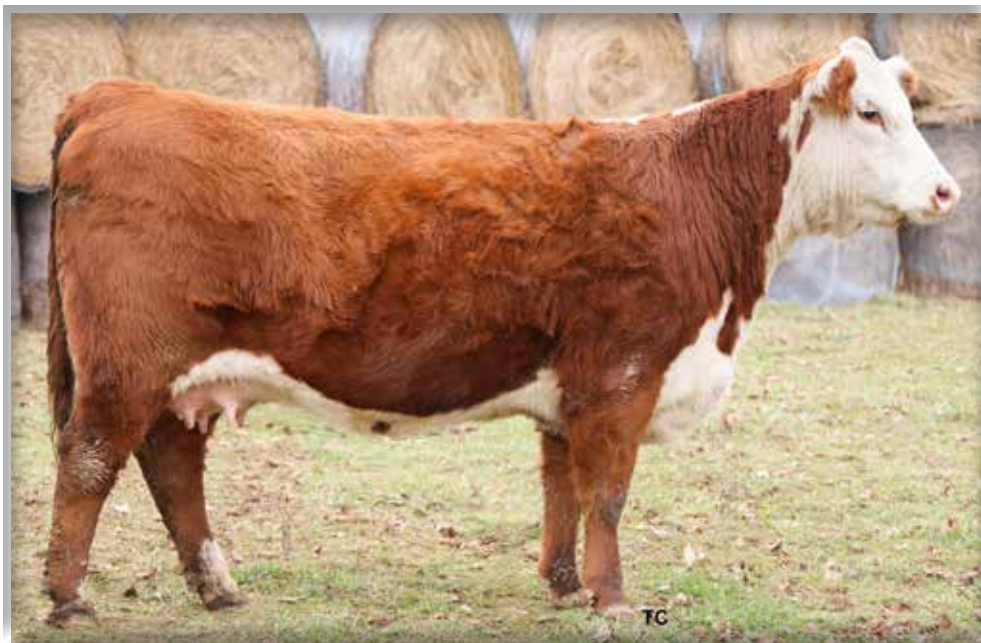
Lot 50 – GCC 4013 Ms Beefmaid 539E 216K