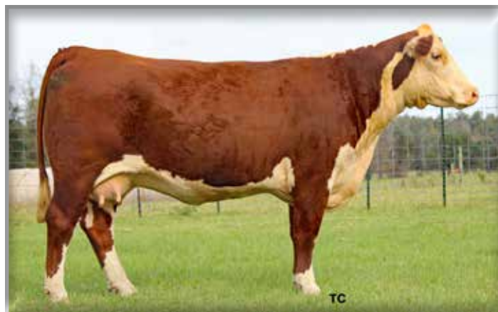
THM EDLT Lady Has Game 6110 ET – Maternal Grandam of Lot 67