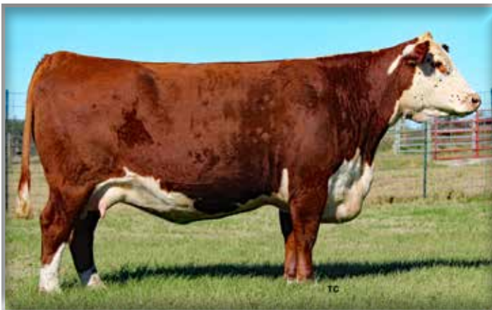
THM 755T Dahlia 6105 ET — Dam of Maverick 9140