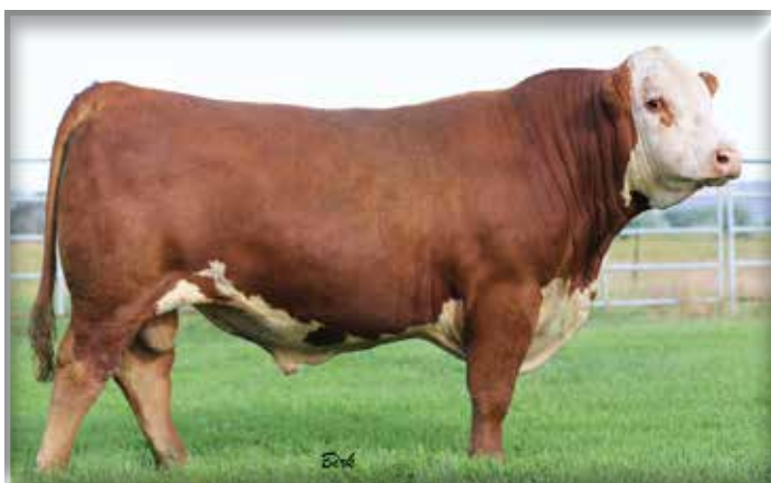
Mohican Dow Jones 65J — Featured Sire