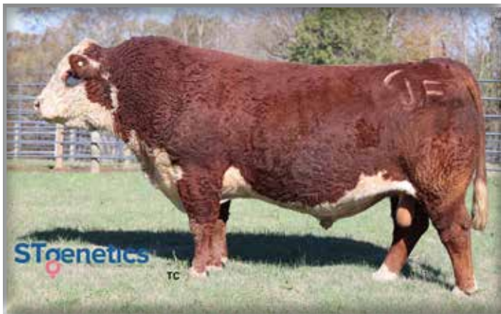
NJW 202C 73D Steadfast 156J ET – Sire of Lots 20 & 28

Join us Friday evening for cattle viewing and a light meal.