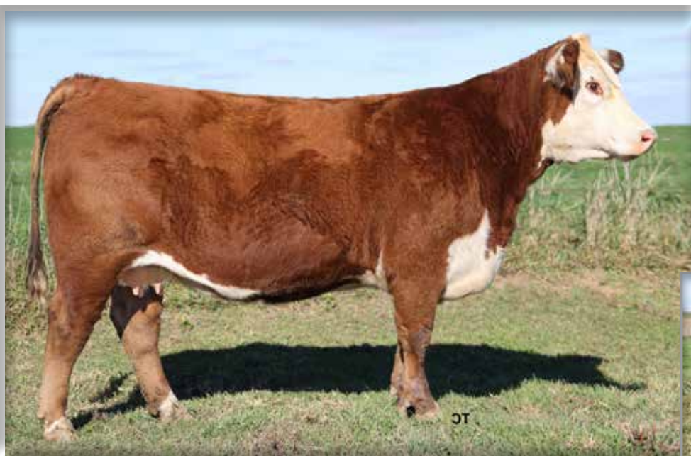
Lot 90 — TDP NJB Dolly 217H