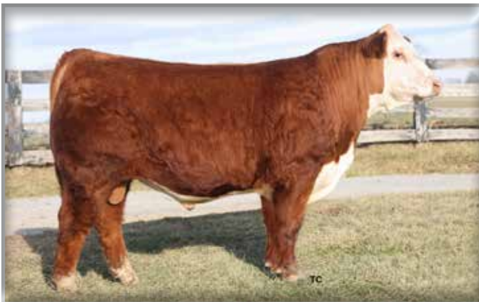
BT Mr. Bodacious J338 L23 – Service Sire for Lots 64 & 65