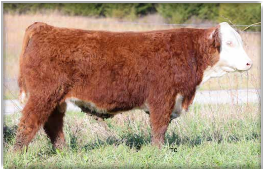
Lot 30 – CHF Plays 4G 17M