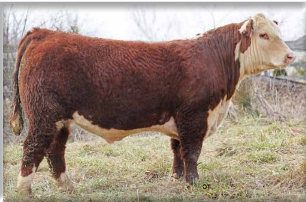
Lot 43 – K3 87G G138 Gimlet 357