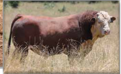
NJW 76C 10W Whitmore 132E