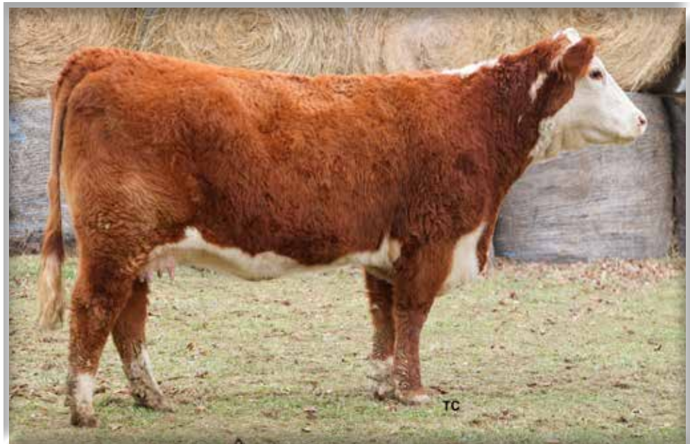
Lot 51 — GCC Ms Honeysuckle 2035H