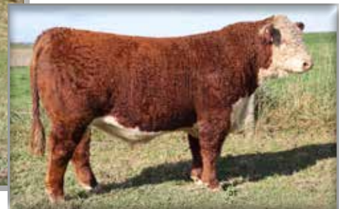
NJB Quest For Quality 273