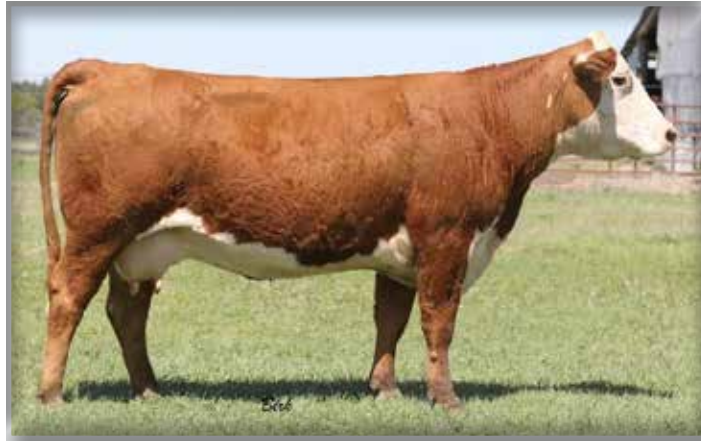
RHF 10Y Tanktown 5036C ET