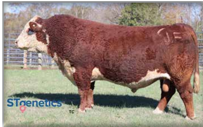
NJW 202C 173D Steadfast 156J – Sire of Lots 58A & 60A