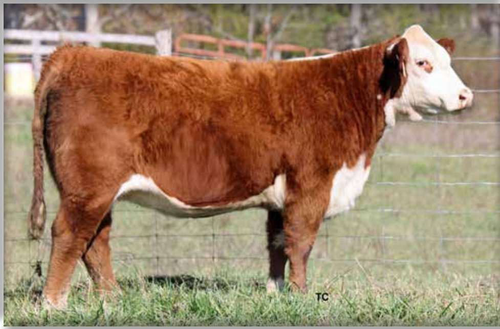
Lot 14 – CHF Robbie 144F 20K