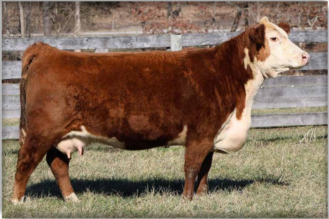
Lot 58 – Grassy Run Belle 016