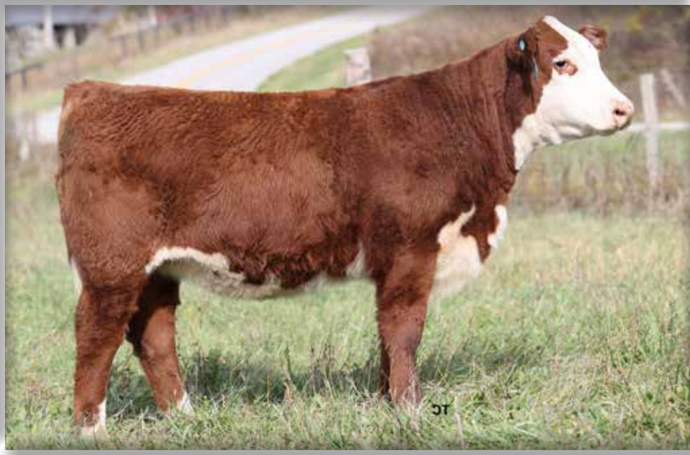
Lot 35 — K3 9140 952 Rodrigo 418