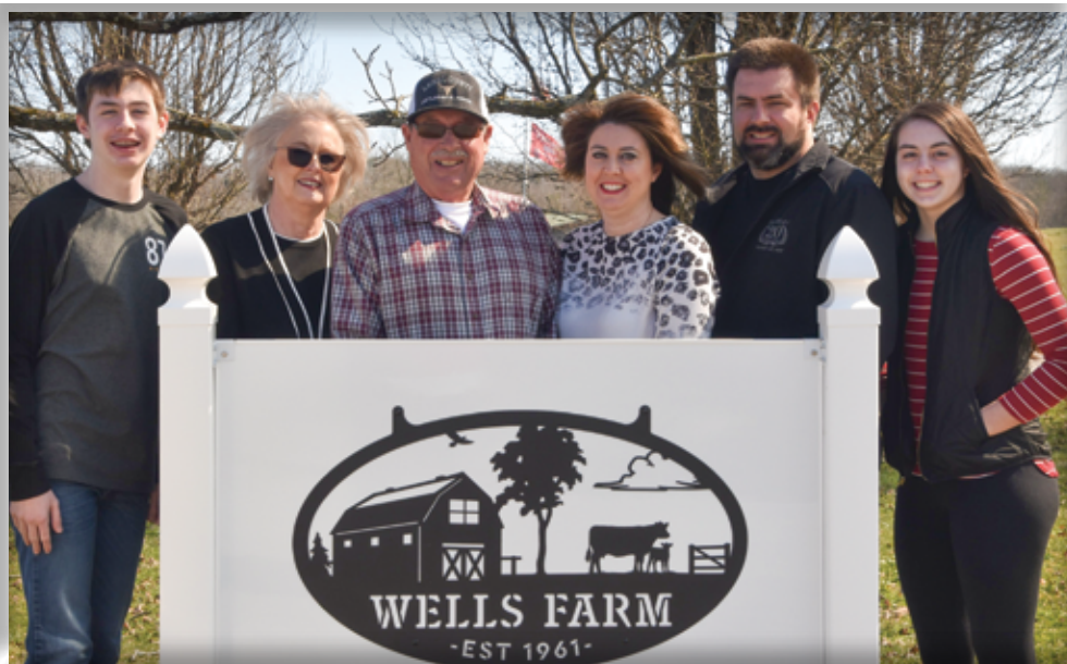
The Wells Family