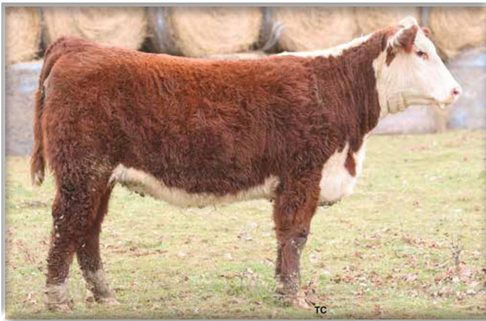
Lot 10 – CHF Legs 3001 74L