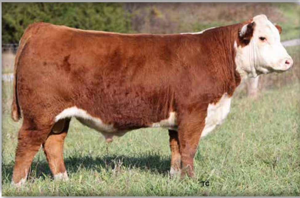
Lot 24 – CHF Jones 65J 96L