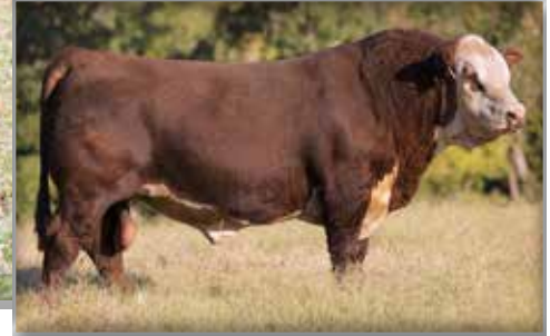
NJW 11B 173D Character 178J ET