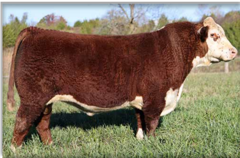
CSC 817 Hayday 210