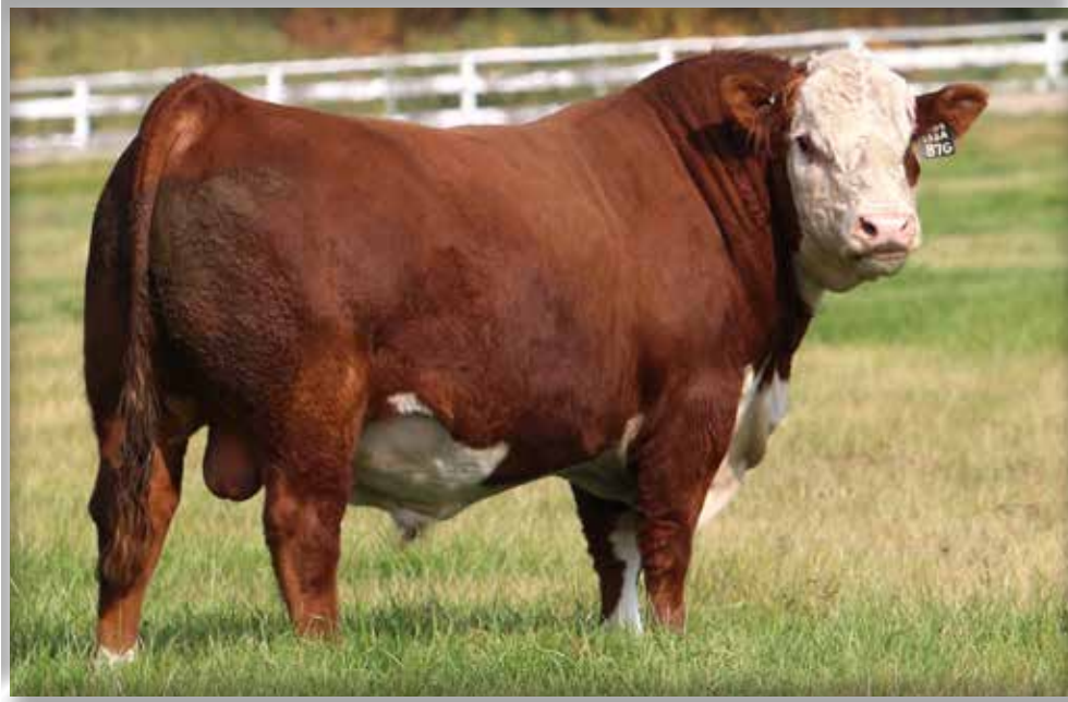
NJW 133A 6589 Manifest 87G ET – Sire of Lots 43, 44 & 45