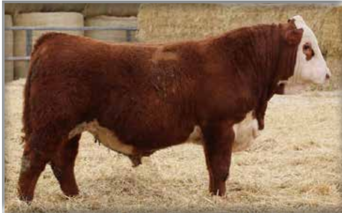
NJW 84B 33B Rob 144F ET – Sire of Lots 11, 12, 14 & 18