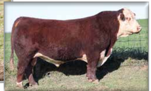
NJB 950 718 Cash 917 – Service sire for Lot 89