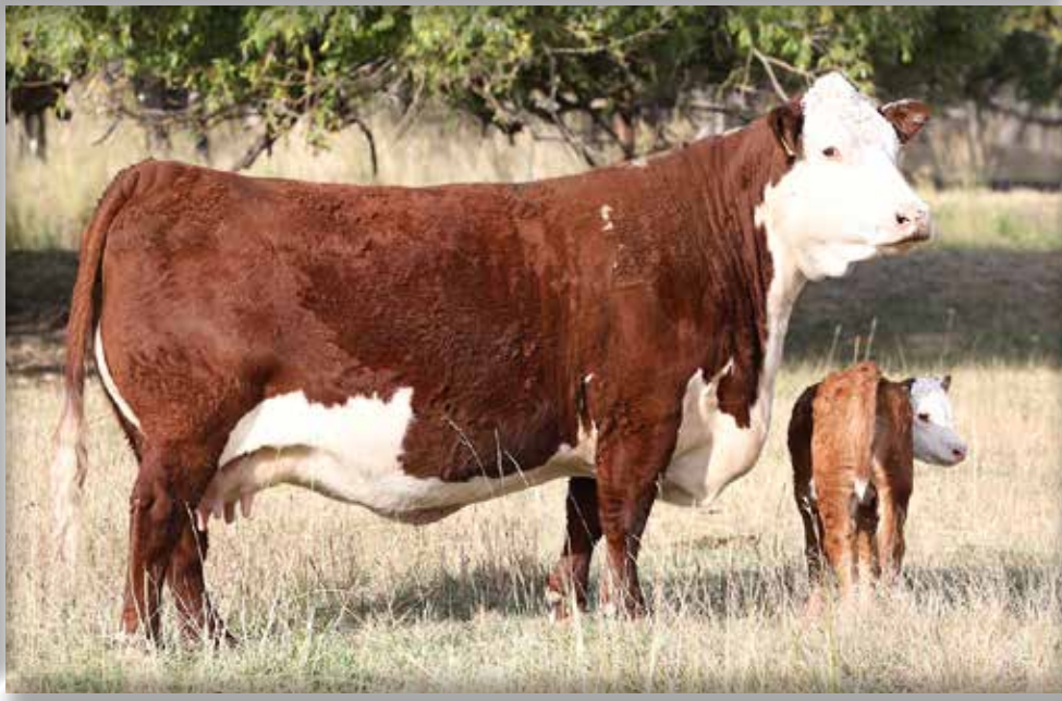
Victoria "11B" Dam of Lot 90 Grandam of Lots 89 & 90A