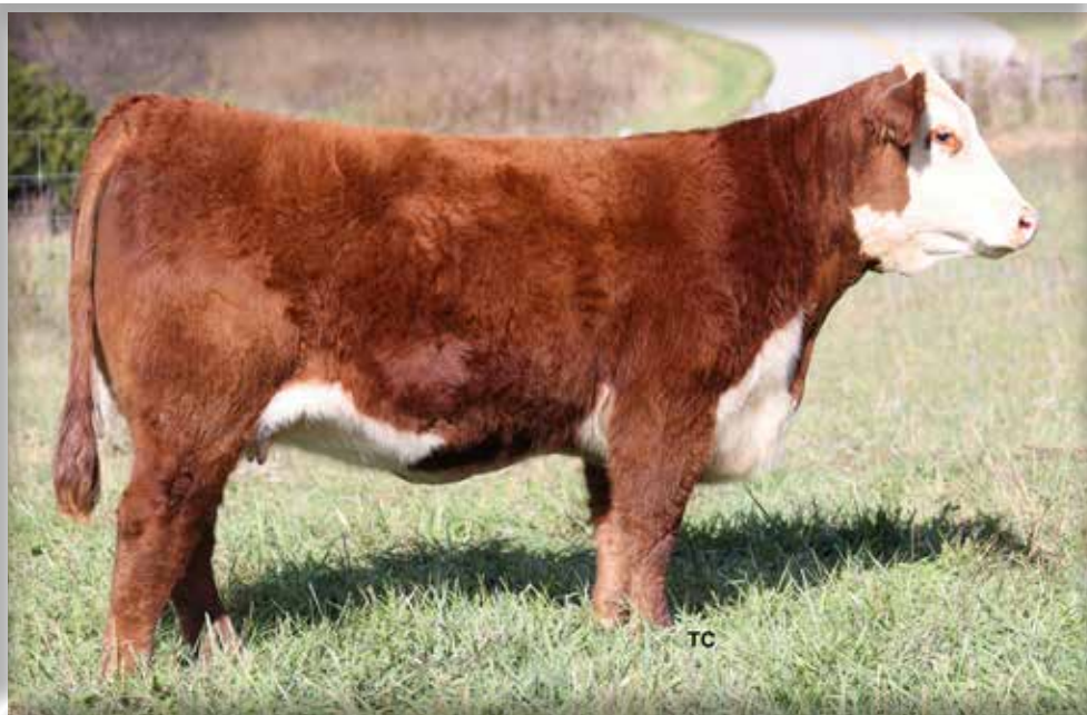
Lot 15 – CHF Robbi 144F 13J