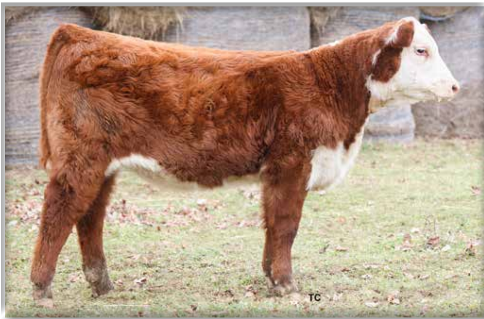
32A — K3 0050 G108 St Helen 454