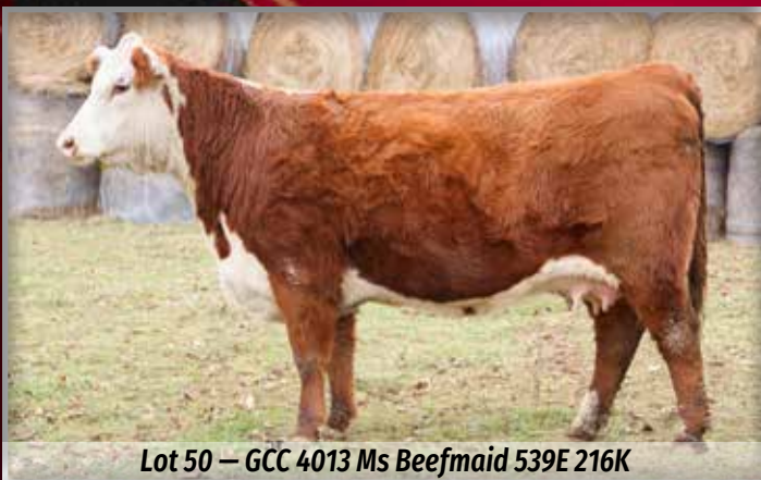
Lot 50 — GCC 4013 Ms Beefmaid 539E 216K