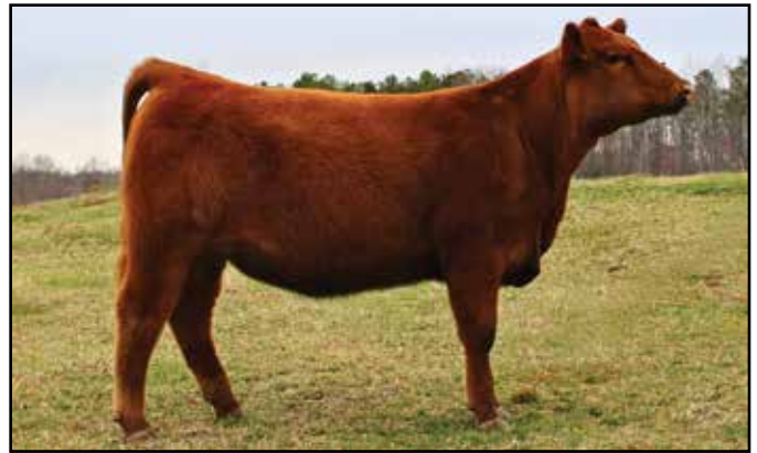
Lot 32 - PR3S Little Miss Mimi M354