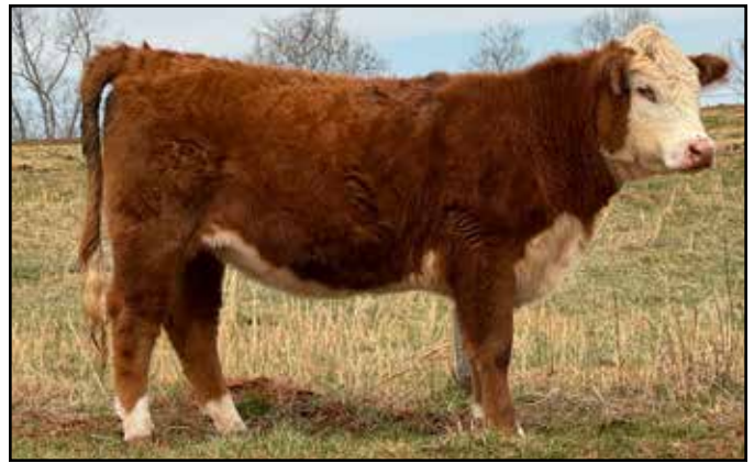
LOT 8 - QRF L9 FIONA F1