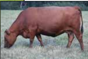
PH14 Hyphus 04B CAN-707 - Dam of Lot 39