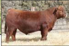
PIE Cadillac 3289 - Service Sire of Lot 38