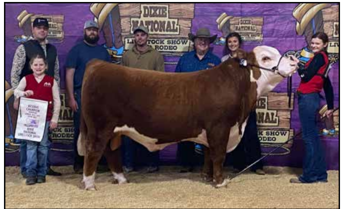
MTM 125 050 POTUS 343 - PASTURE EXPOSURE SIRE FOR LOT 10