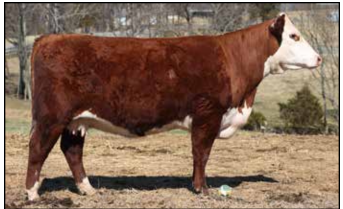
LOT 2 - TF PRISSY DIOR 831E 183F 908K