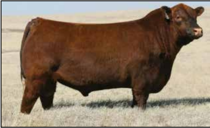
Red Box 55C - Grandsire of Lot 36