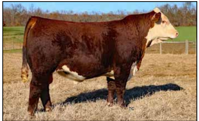
KCF BENNETT MONUMENT J338 - SERVICE SIRE OF LOT 17