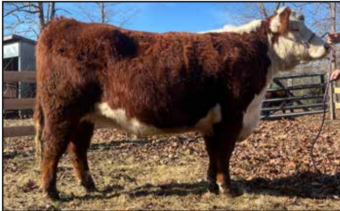
LOT 5 - RCF 977 H921 HUSH PUPPY L317