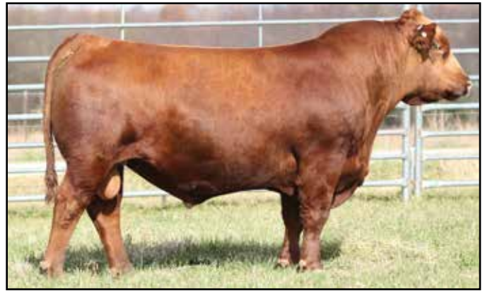
Brown PRA Patriot G6291 - Sire of Lot 40A