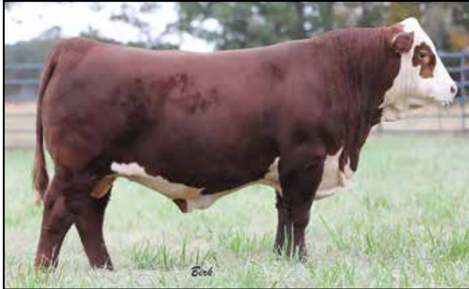
CMF 1720 GOLD RUSH 5696 ET - SERVICE SIRE OF LOT 6