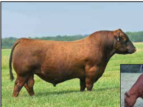
Lacy Iron Mike 005E - Sire of Lot 39