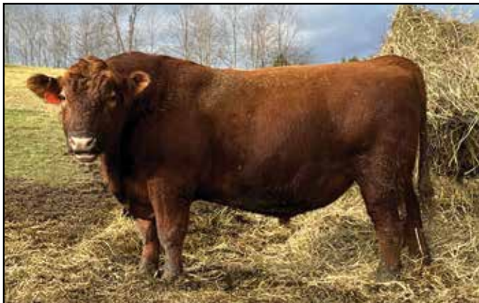
Lot 47 - Bull Hill Game On 1209