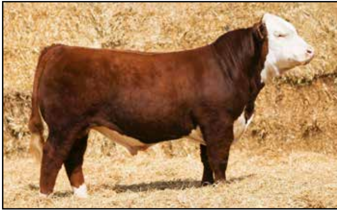
2TK 7120 REAL DEAL 9066 - SIRE OF LOT 4