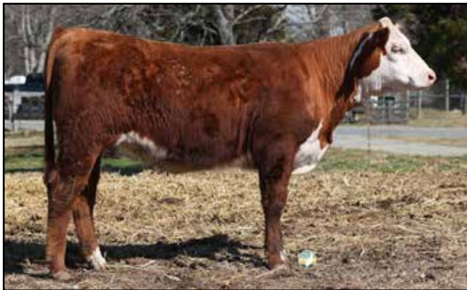
LOT 12 - NP MARY KATE 2401