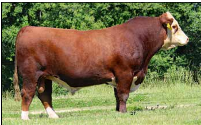
WHITEHAWK CHIEF 3186 ET - SIRE OF LOT 13