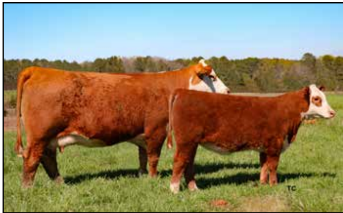
FPH MS U35 2504 G97 ET - GRANDDAM OF LOT 29A

29 FPH MS C70 4013 J109 (DLF,HYF,IEF,MSUDF,MDF,DBP) COW P44250824 BD: 11/29/20 RE: J109 LE: J109 Polled EFBEF TFL U208 TESTED X651 ET (SOD)(CHB) EFBEF FOREMOST U208 (SOD)(CHB) INNISFAIL WHR X651/723 4013 ET (SOD)(CHB) EFBEF P606 MABEL R415 INNISFAIL P230 T723 EF F745 FRANK P230 (CHB) INNISFAIL 235 R501 ET (DOD)