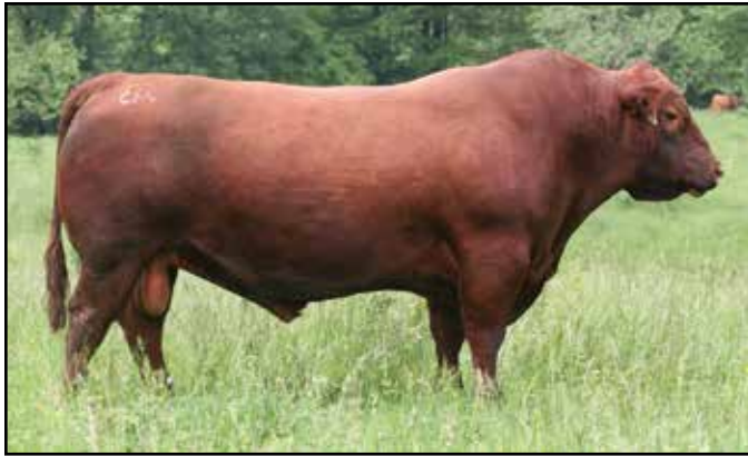
Brown Paramount X7879 - Sire of Lot 43