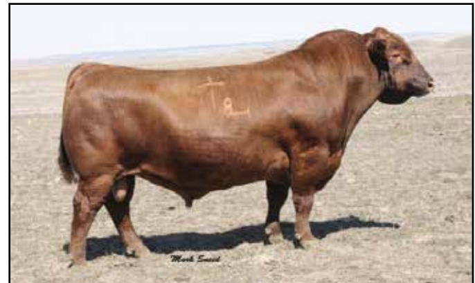
Becton Epic R397K - Sire of Lot 41