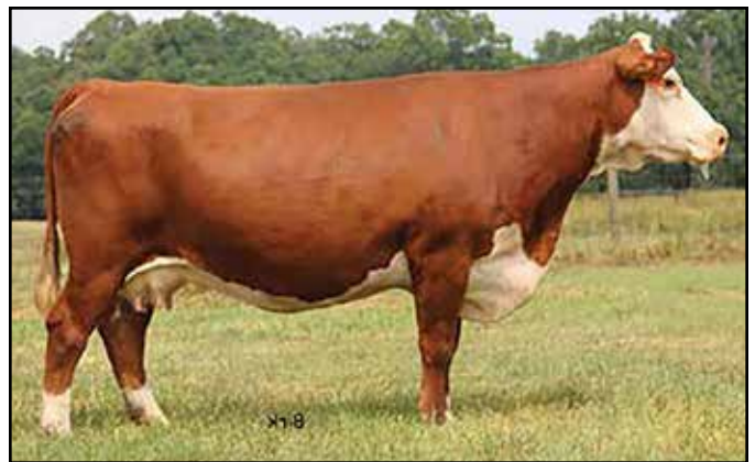
FPH MISS VICKI K58 BOOMER U80 - DAM OF LOT 9