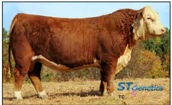
INNISFAIL WHR X651/723 4013 ET - SIRE OF LOT 18