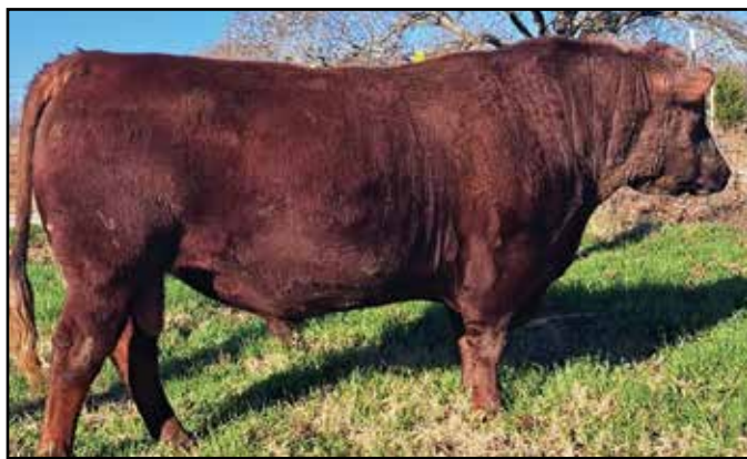
BULL HILL NIGHT CALVER 9298 - Sire of Lot 31

31 BULL HILL NIGHT CALVER 2365 Bull 4745193 BD: 2/4/2023 TPR/2365 100% AR A LSF NIGHT CALVER 9291W LCJ NIGHT CALVER5197 LCJ MISS ADVANCER 0701 BULL HILL NIGHT CALVER 9298 SUNR GRAND CHEROKEE 909N BULL HILL WENDY 3049 MEEK 639