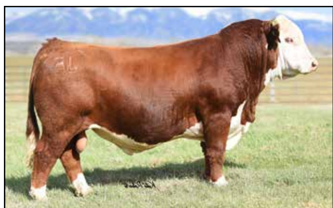
NJW LONG HAUL 36E ET - SIRE OF LOT 27