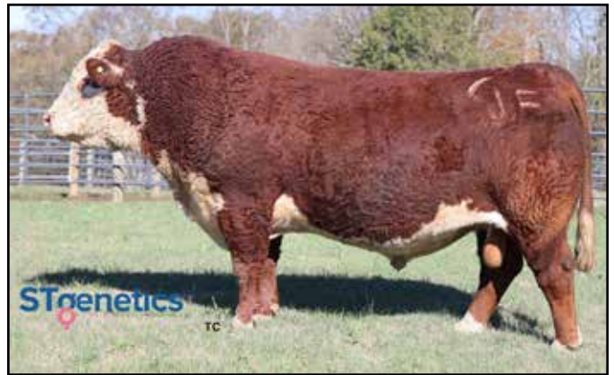
NJW 202C173D STEADFAST 156J ET - SIRE OF LOT 16