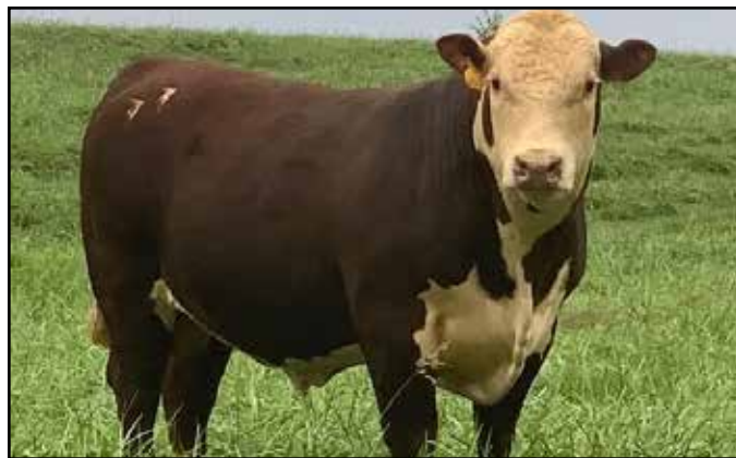
FF PLATO DOMINO A41 E241 - SIRE OF LOT 23

19A MF H086 31H MS LAUREN 149M (DBP) COW P44639873 BD: 10/7/24 RE: MF LE: 149M Polled SHF DAYBREAK Y02 D287 ET (CHB) SHF YORK 19H Y02 (S0D)(CHB) SHF HOUSTON D287 H086 (CHB) SHF MISS M326 T08 ET SHF MISS 14 20Z D223 LOEWEN 44X 6X 20Z SHF RADAR R125 775