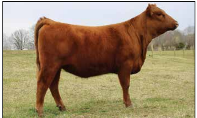
Lot 34 - PR3S Southern Pride M356