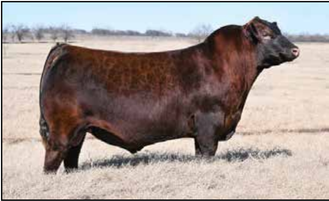
TWG Red Eye Special 301F - Sire of Lot 37