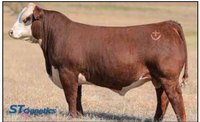
SHF HOUSTON D287 H086 - SIRE OF LOT 9A