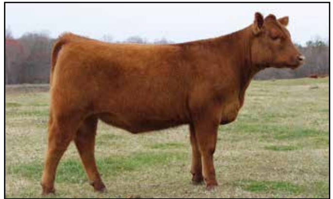
Lot 33 - PR3S Imagette M351