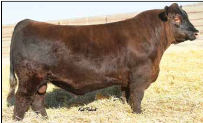
BB Propulsion 9096 - Service Sire of Lot 46