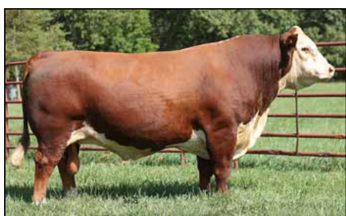
KCF BENNETT PROVIDENT B284 - GRANDSIRE OF LOT 28