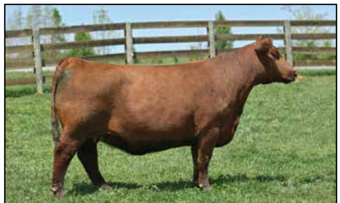
Damar Oh Baby 2R B064 - Granddam of Lot 35