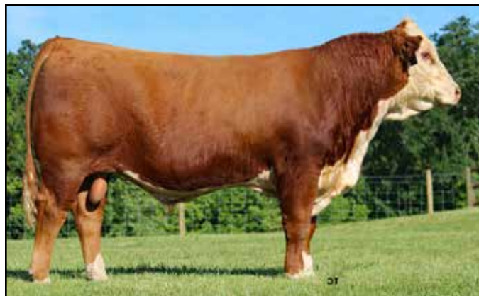
NJW 11B AUTHORIZE 79G ET - SIRE OF LOT 20

21 FF MAID BTL E241 J226 (HYP) COW P44236326 BD: 1/27/21 RE: J226 LE: J226 Polled FF PLATO DOMINO W145 A41 FF PLATO DOMINO P700 W145 FF PLATO DOMINO A41 E241 FF ROSE BTL N457 S451 FF SUE PLATO BTL X279 A205 FF BTL PLATO S423 X279 FF SUE PLATO BTL N457 X460