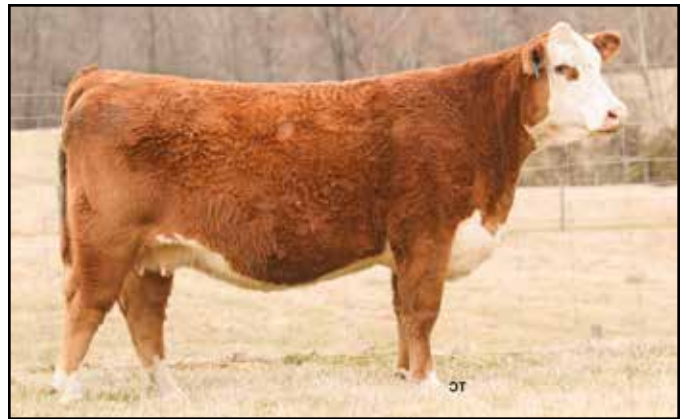
LOT 1 - GTW 318G MS MARCE 2206