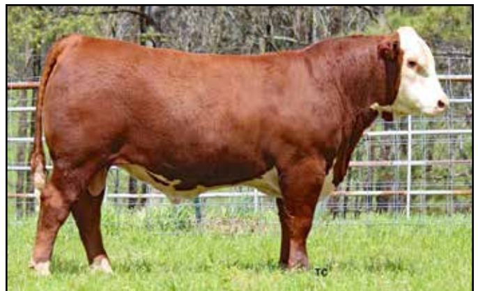
WHITEHAWK 590F JUDD 644JET - SIRE OF LOT 2A