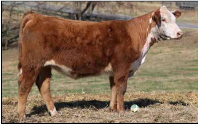
LOT 11 - NP ASHLEY 2402