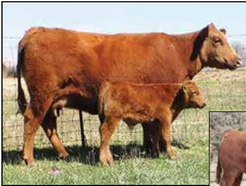
Lot 38 - Bull Hill Zara 0242