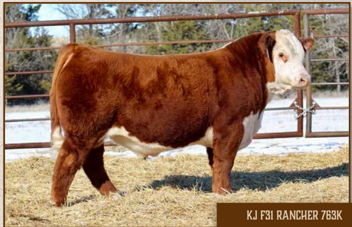
KJ F31 RANCHER 763K