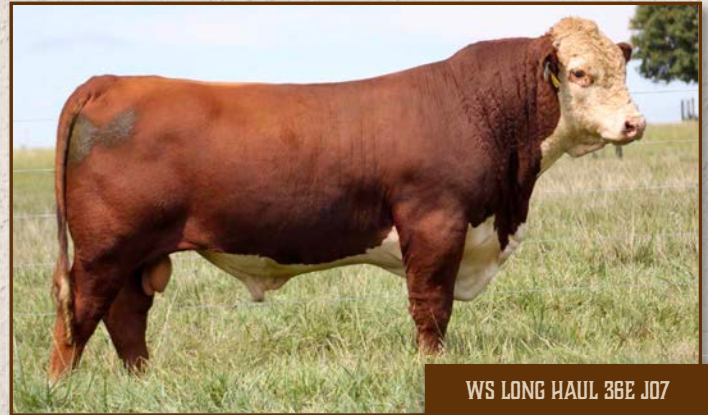
WS LONG HAUL 36E J07