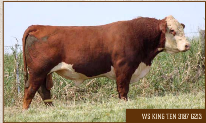
WS KING TEN 3187 G213