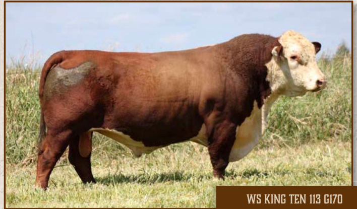
WS KING TEN 113 G170