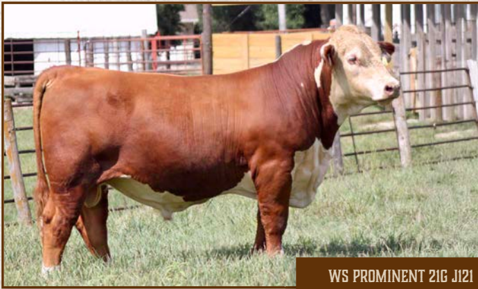
WS PROMINENT 21G J121