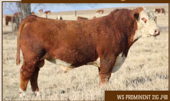
WS PROMINENT 21G J48