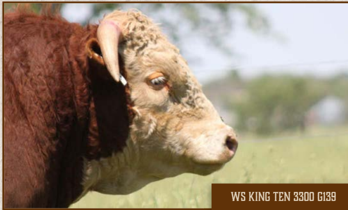
WS KING TEN 3300 G139