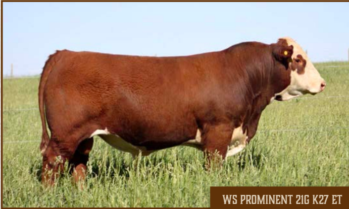
WS PROMINENT 21G K27 ET