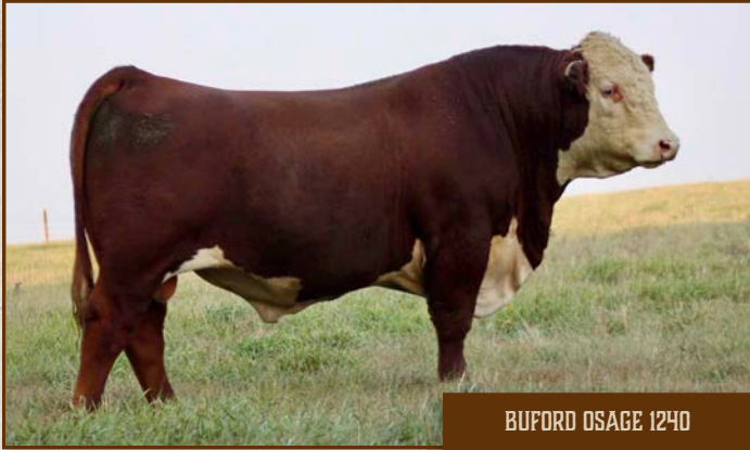
BUFORD OSAGE 1240