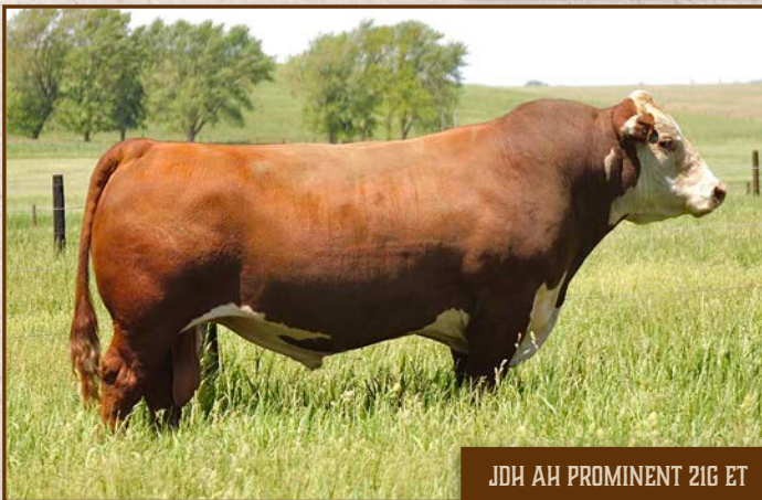
JDH AH PROMINENT 21G ET