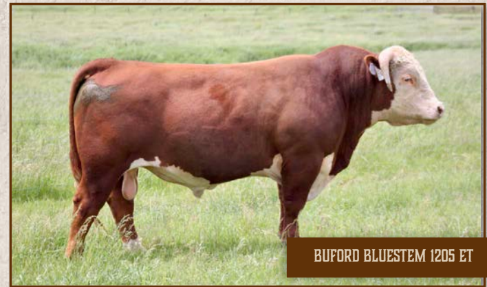
BUFORD BLUESTEM 1205 ET