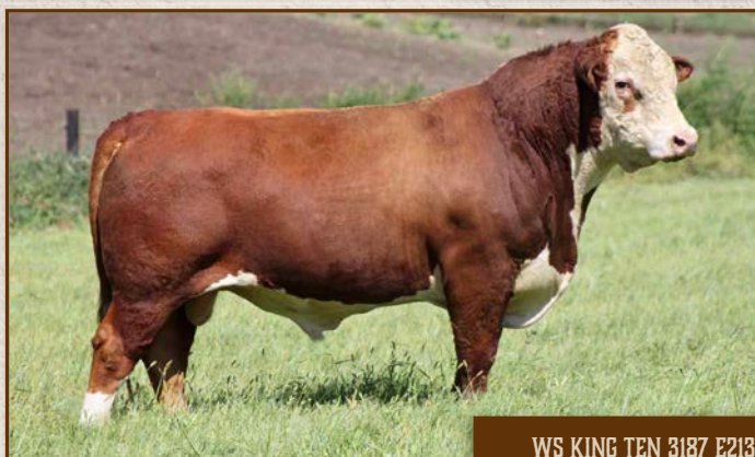
WS KING TEN 3187 E213