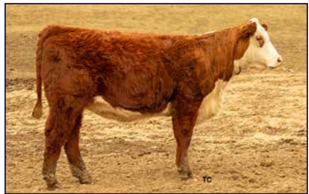
Lot 28 – Andersons Ms Lucky