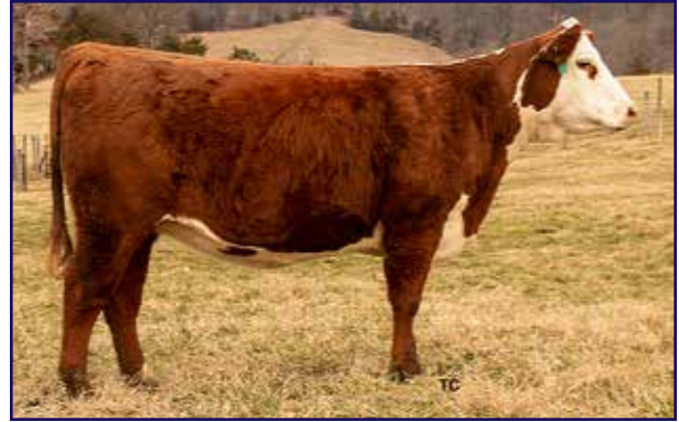
Lot 9 — DR Amanda 183F K03