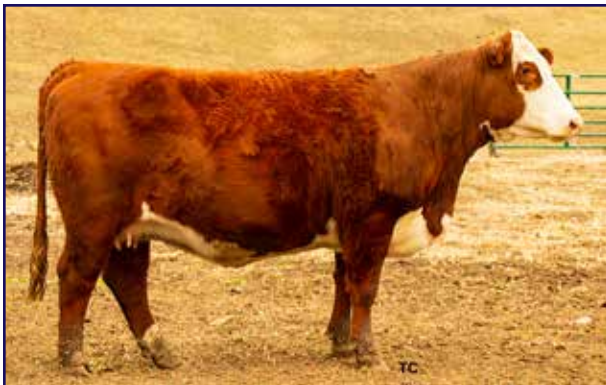
Lot 25 — FSL MISS HOMELAND C34 7F 4H