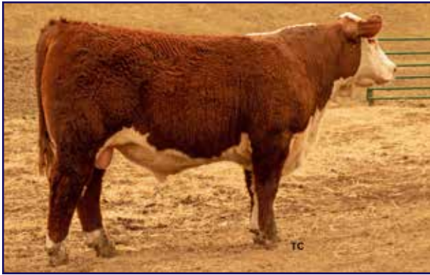
Lot 22 — HHF Sentinel 1015 120F 12L ET