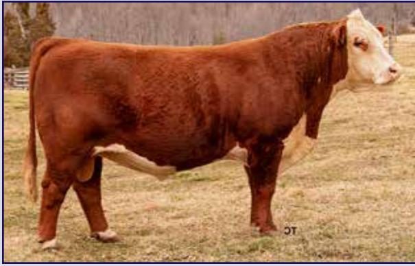
KCF BENNETT REWARD H85, Reg# 44155269