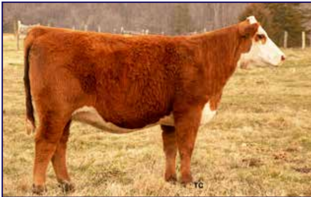
Lot 12 — DR First Frost H18 K16