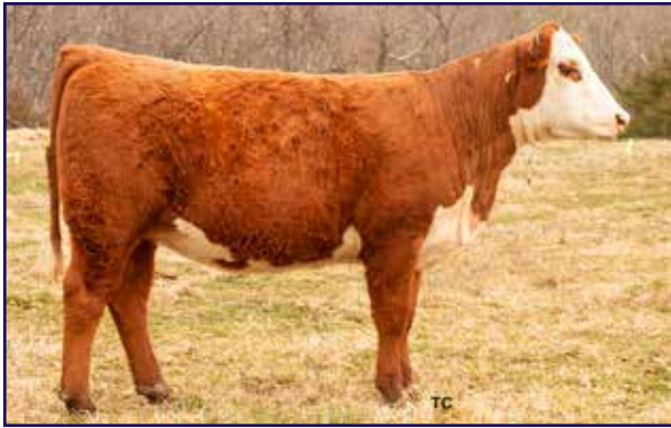
Lot 11 — DR Jewel H85 K07