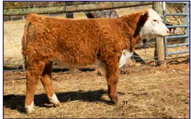
Lot 32A — MANTEWS 973E HENRY 94L