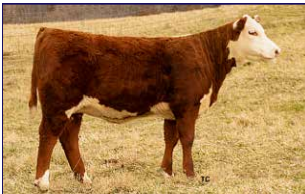
Lot 13 — DR Valley Girl B413 L12 ET