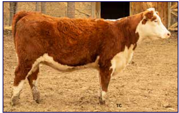
Lot 26 – HFF Shelly 569G 41K