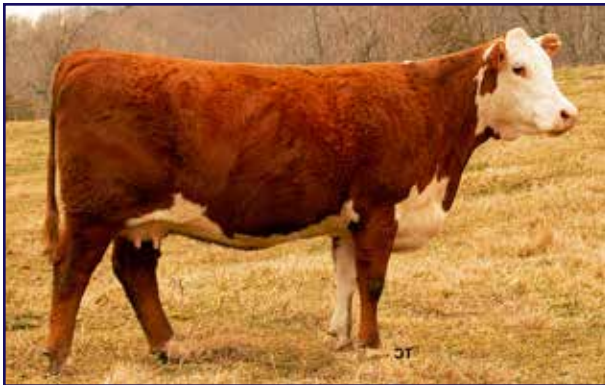
Lot 6 — DR ICICLE 4013 H13 ET