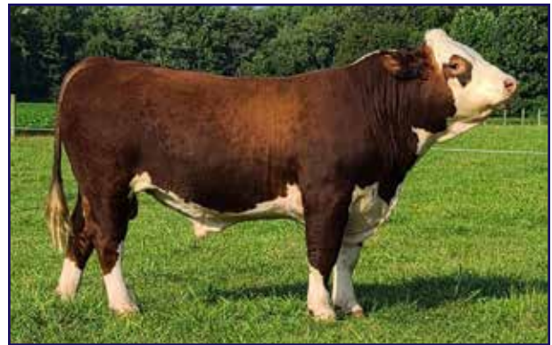
Lot 29 – WCC Fraser