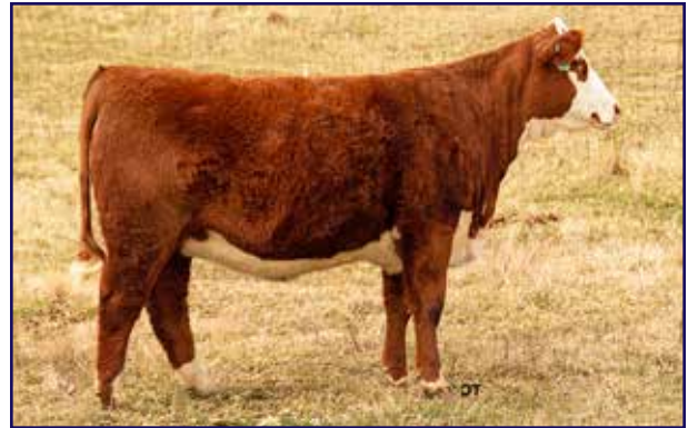
Lot 10 — DR Design 183F K09