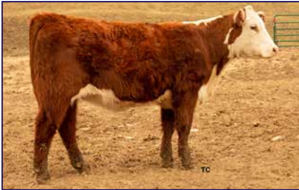
Lot 23 — PJF Miss 226Z 921