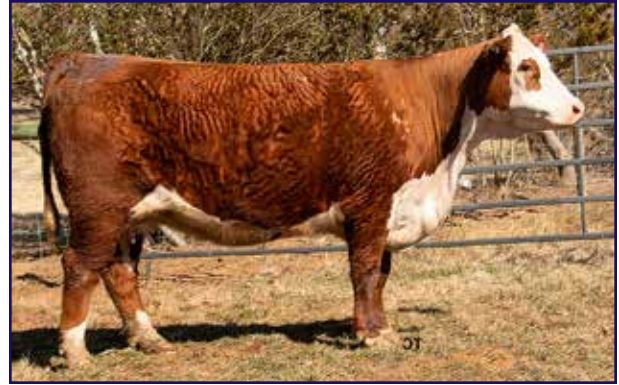
Lot 33 — HHF Scarlet 173D 22H