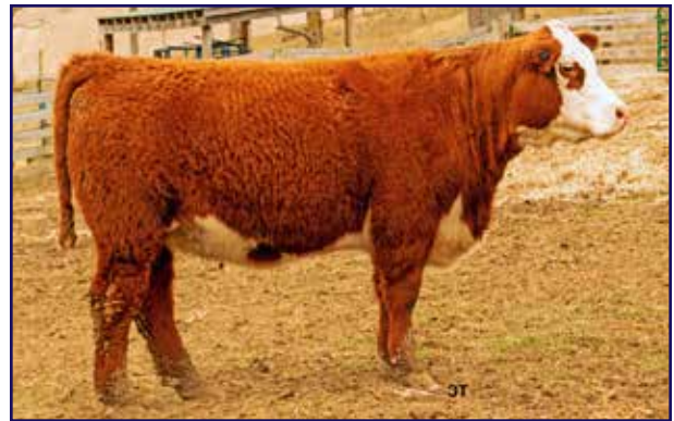
Lot 27 – HFF Morgan G473 42K