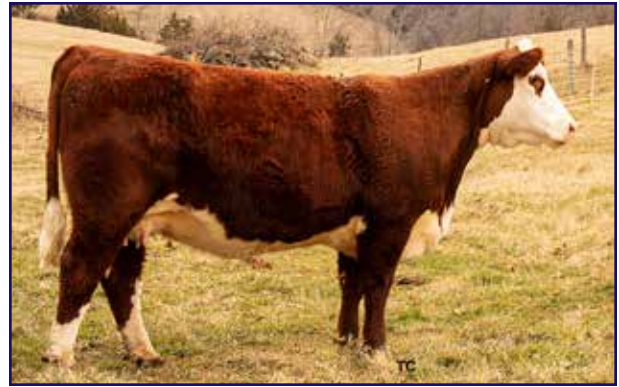
Lot 8 — DR Duchess 8300 J14