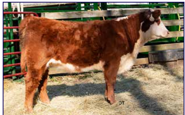
Lot 5 — WRF Laura L7