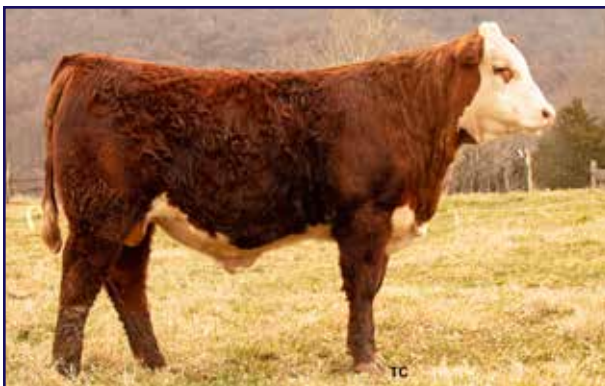
Lot 7 — DR Validated Big Red L06 ET