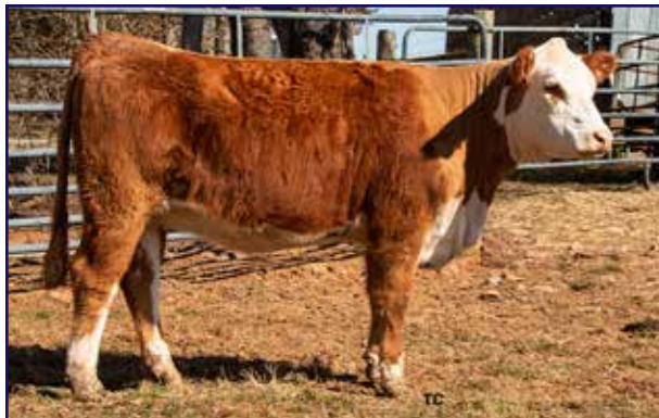
Lot 30 — Mantews 87G Suzette 81K