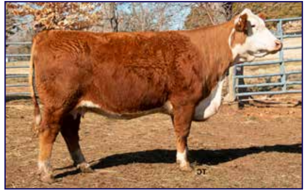
Lot 32 — HHF Susan E159 8H