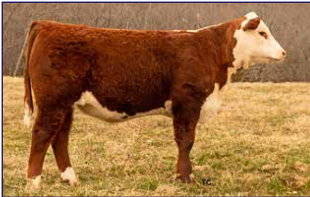
Lot 6A — DR Solid Ground H642 L10