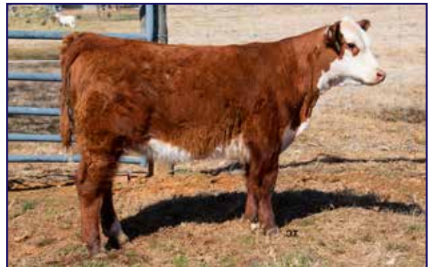
Lot 33A — MANTEWS 284H CRIMSON 93L