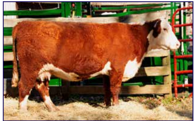
Lot 3 — BBF Miss Bernie Z367 G23