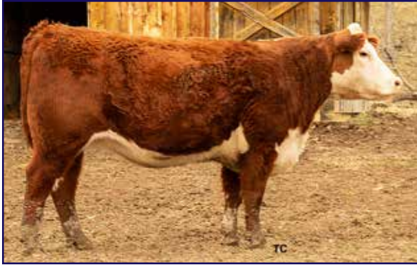
Lot 24 — SMH GDH BREEZEWOOD ROSIE