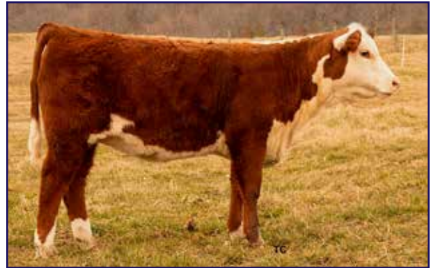
Lot 8A — DR Miss Resolve G595 J14