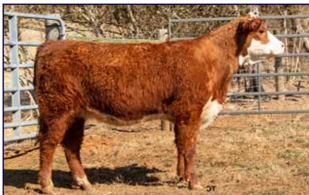
Lot 31 — Mantews G473 Libby 106K